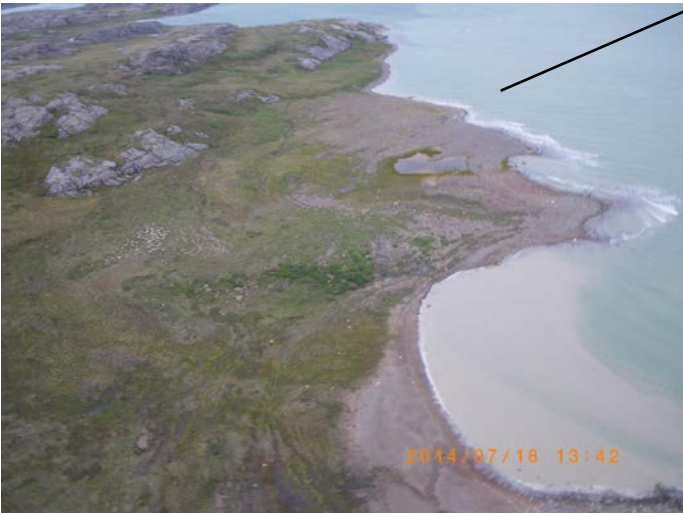
View of the Old Beach Laydown Area – looking north