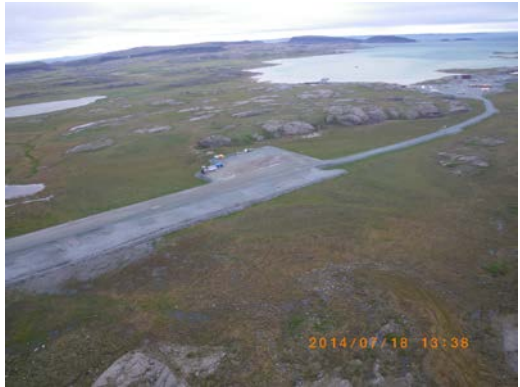
Airstrip – looking northwest towards North Apron