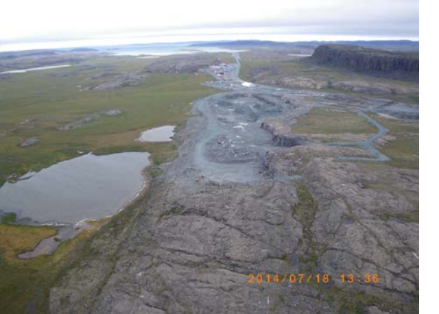
Aerial view Quarry 2 – looking north