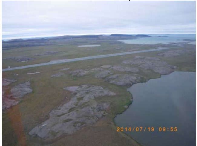
Airstrip -- looking northwest