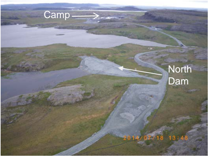
Aerial view of the North Dam - looking west