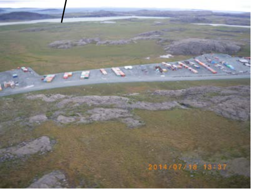
Upper and Lower Reagent Pads – looking west