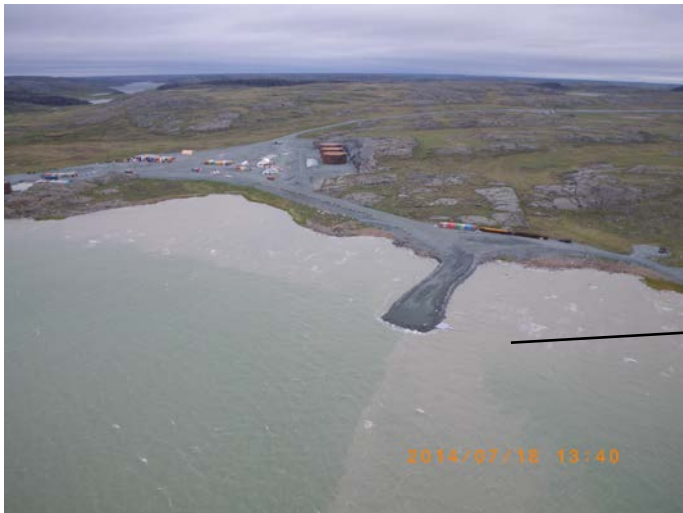
View of Roberts Bay Fuel Tank Farm, Jetty and Laydown area – looking southeast