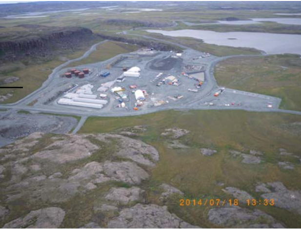
Aerial view of Camp – looking east