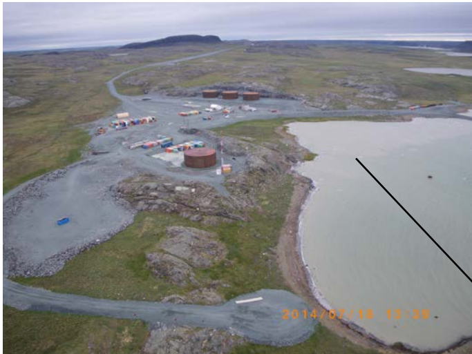
View of Roberts Bay Fuel Tank Farm and Laydown area – looking southwest