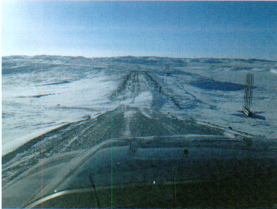
Figure 1 North Dam looking South, March 7, 2015