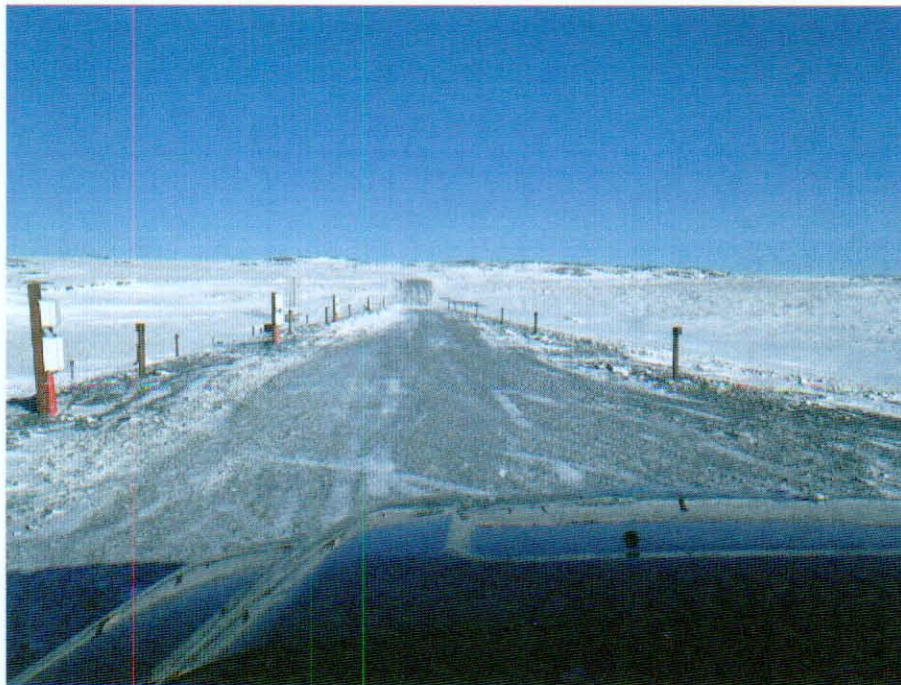
Figure 2 North Dam Looking South, March 7, 2015