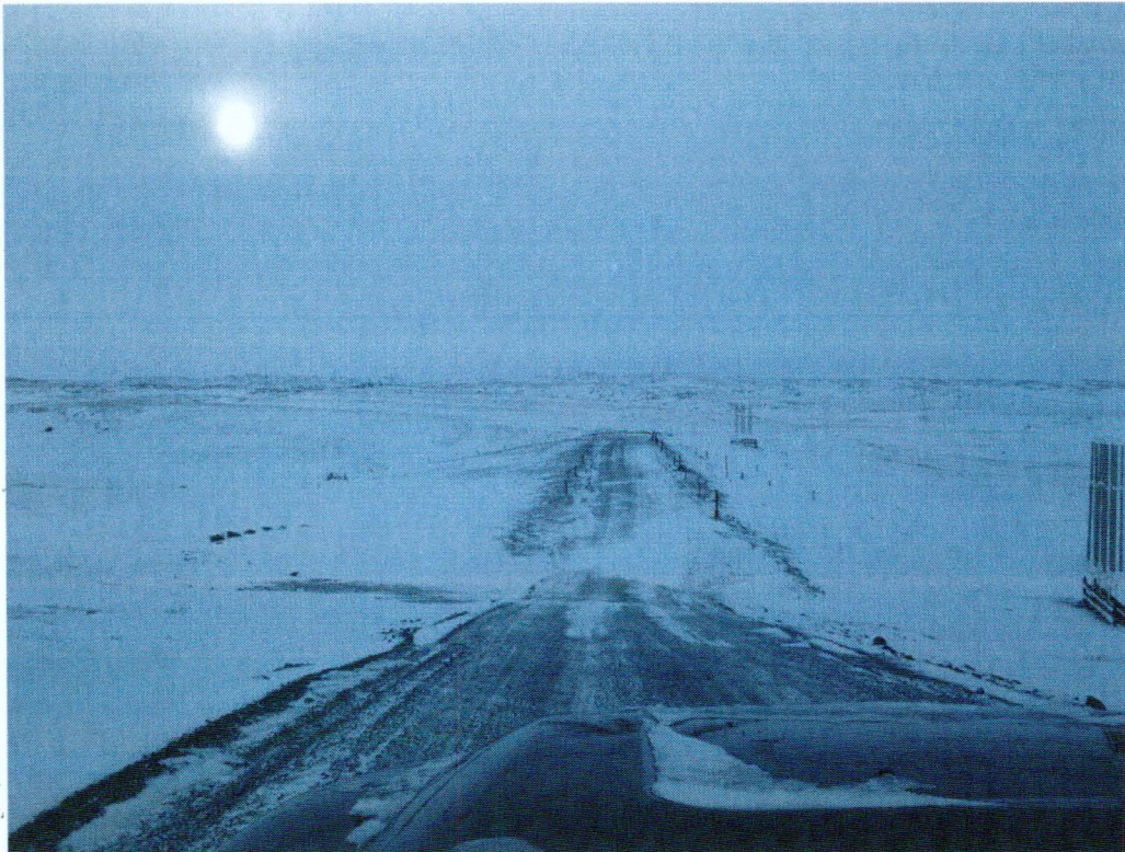
Figure 1 North dam looking south, March 1, 2015