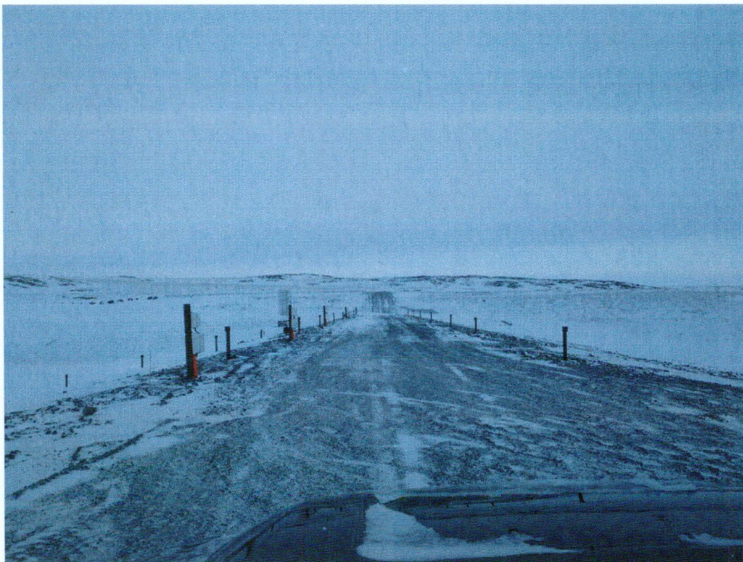
Figure 2 North Dam looking north, March 1, 2015