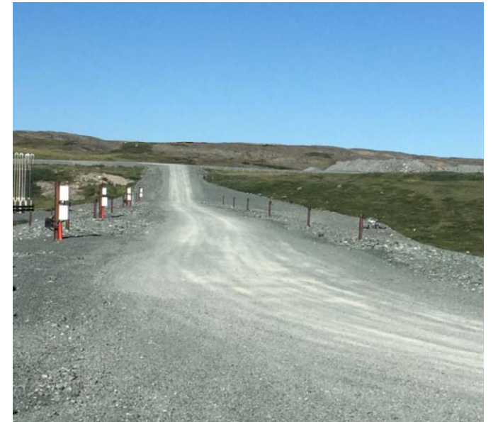
Centerline of the North Dam, looking northeast from Station 0+010.