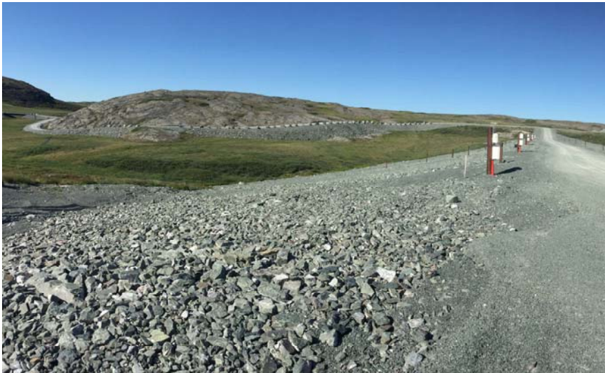
Downstream face of the North Dam looking northeast from Station 0+010.