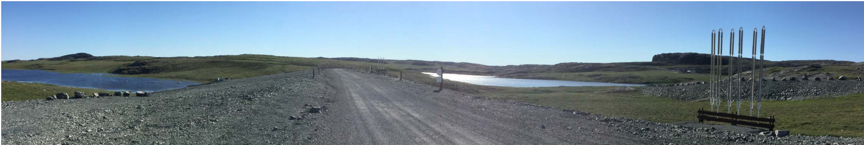
Crest of the North Dam looking southwest from Station 0+140.