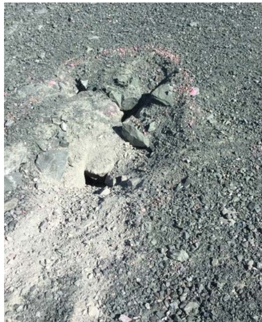
Depression on downstream face of the North Dam, paint markings show limited expansion from previous inspections.