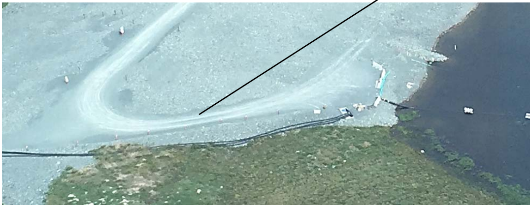
Pump and access road along south side of the upstream face of the North Dam.