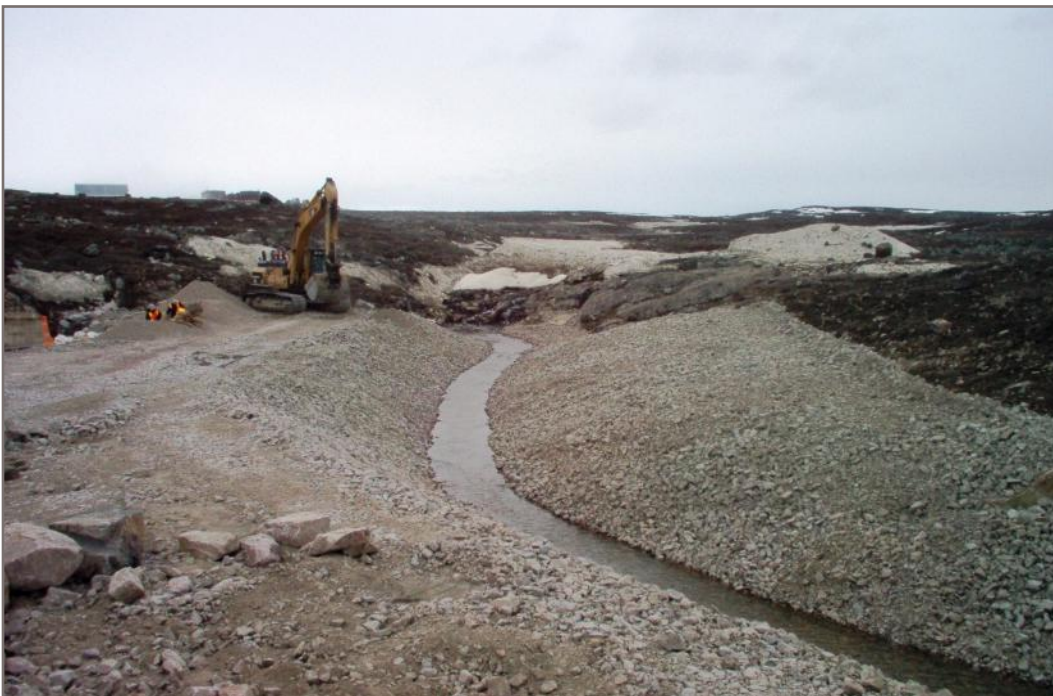
Photo 8: Reach A inlet structure complete, facing southwest. Photo taken May 22, 2006.