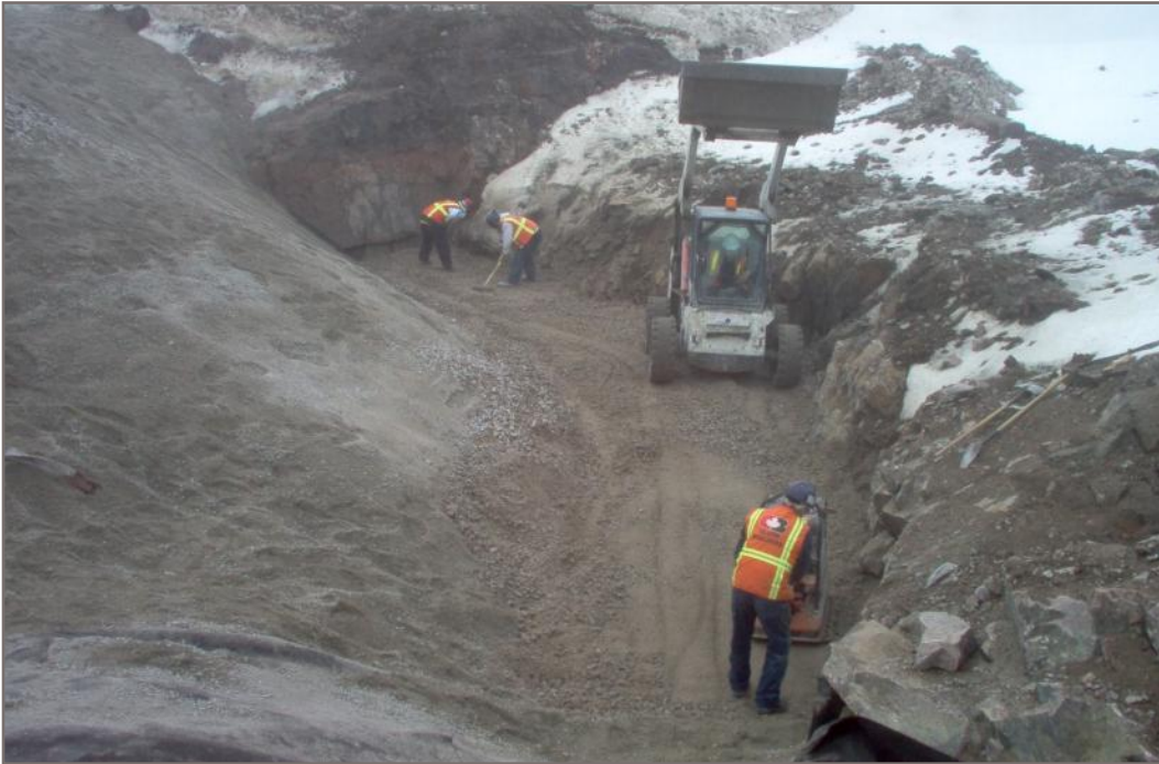
Photo 7: Backfilling Reach A key trench, facing southeast. Material spread with bobcat and compacted with tamper. Photo taken May 7, 2006.