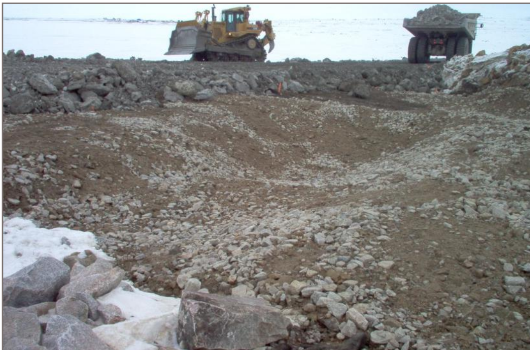
Photo 14: Upper pool in Reach C completed. Photo taken May 4, 2006.