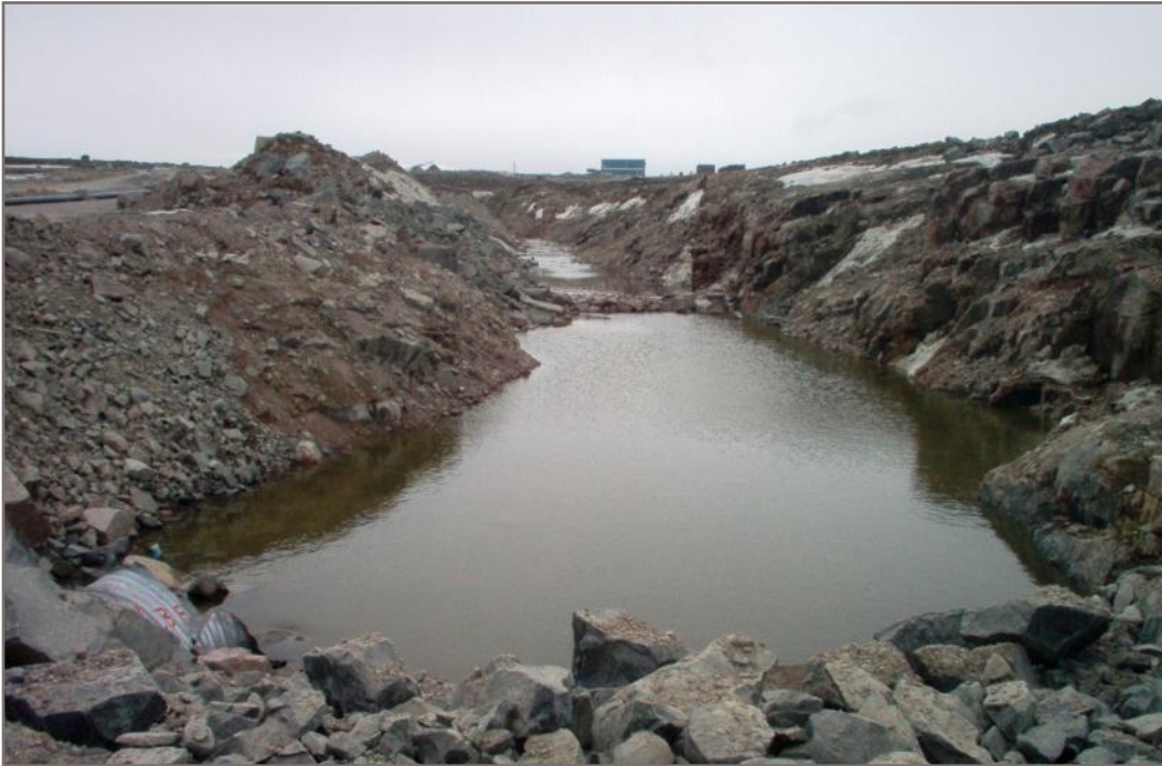
Photo 9: Reach A channel excavation facing south from Carat Lake Road culvert. Photo taken May 22, 2006.