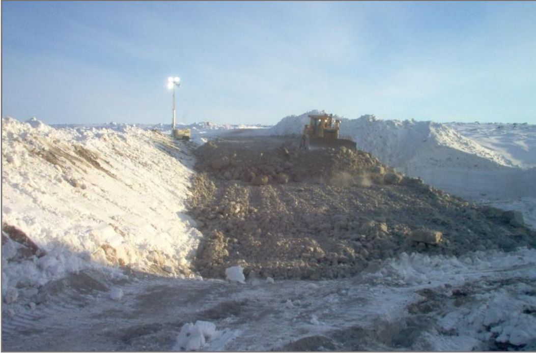
Photo 1: Till fill pad construction at Reach A inlet, facing south. Spreading till with D9 dozer. Photo taken March 17, 2006.