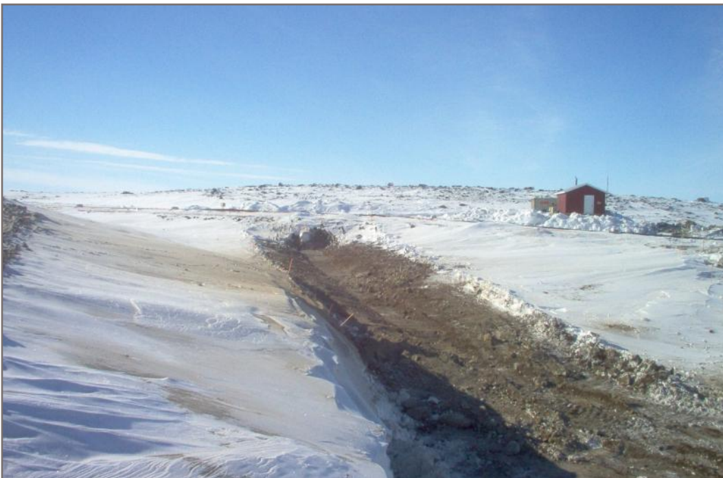
Photo 10: Reach B excavated and shaped, facing west. Photo taken May 26, 2006.