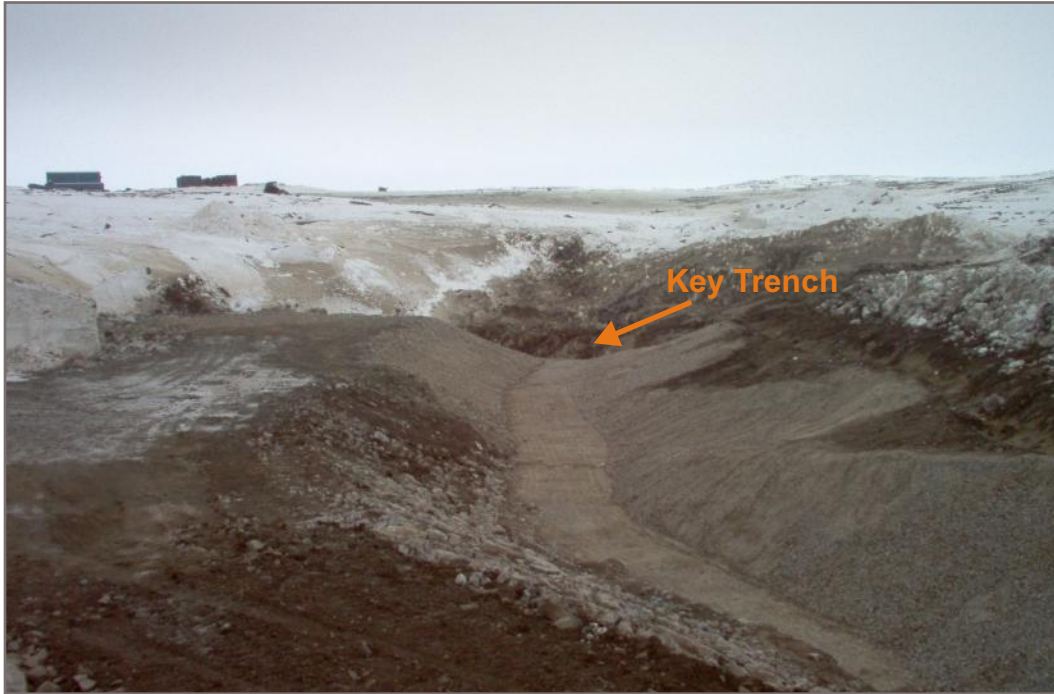
Photo 5: Reach A inlet alignment, facing southwest. Till pad and west slope have been shaped. Some additional liner bedding to be placed on till slope in foreground of photo. Photo taken April 26, 2006.