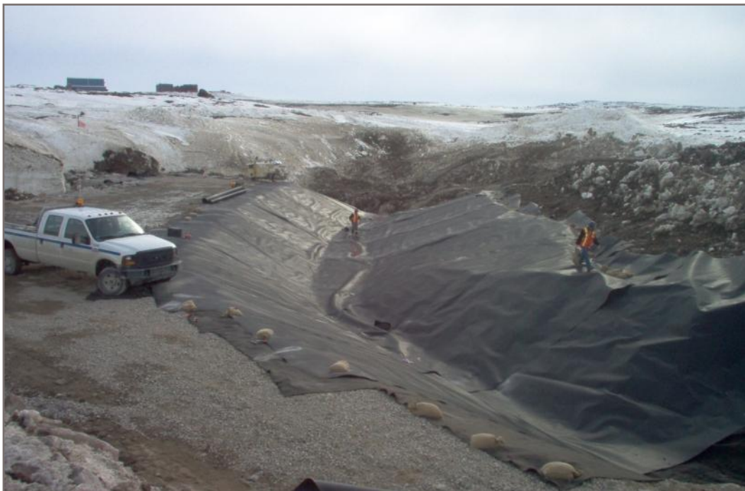
Photo 6: Reach A inlet, facing southwest. HDPE liner installation in progress.