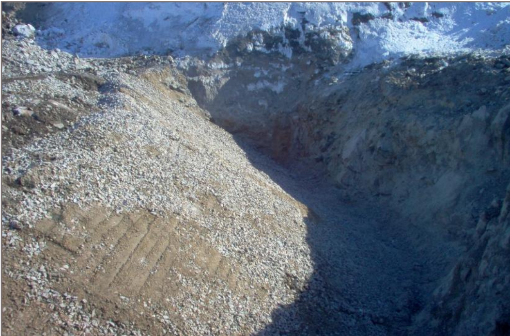
Photo 2: Reach A inlet key trench, looking southeast. Note vertical rock face at end of key trench. Photo taken April 24, 2006.