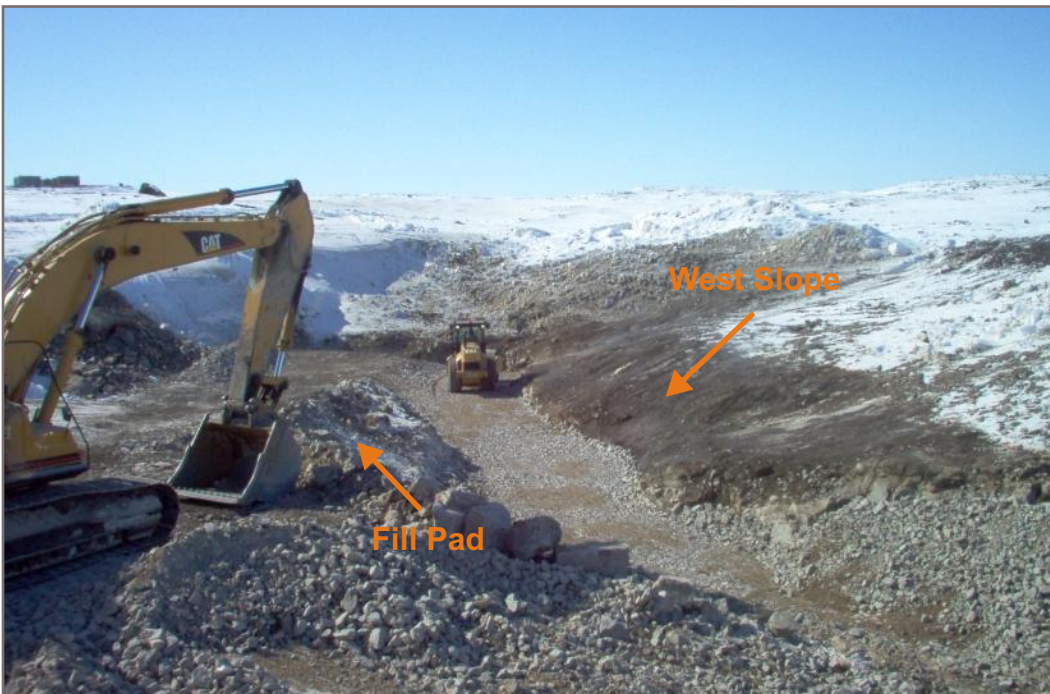
Photo 4: Bringing Reach A inlet alignment to grade, facing southwest. Packing 150 mm material prior to placing liner bedding. West slope has been grubbed. Some fill still required to smooth sharp contours. Photo taken April 24, 2006.