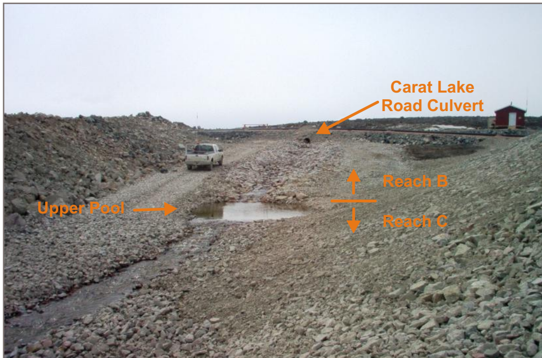
Photo 11: Reach B complete, facing southwest. Photo taken May 22, 2006.