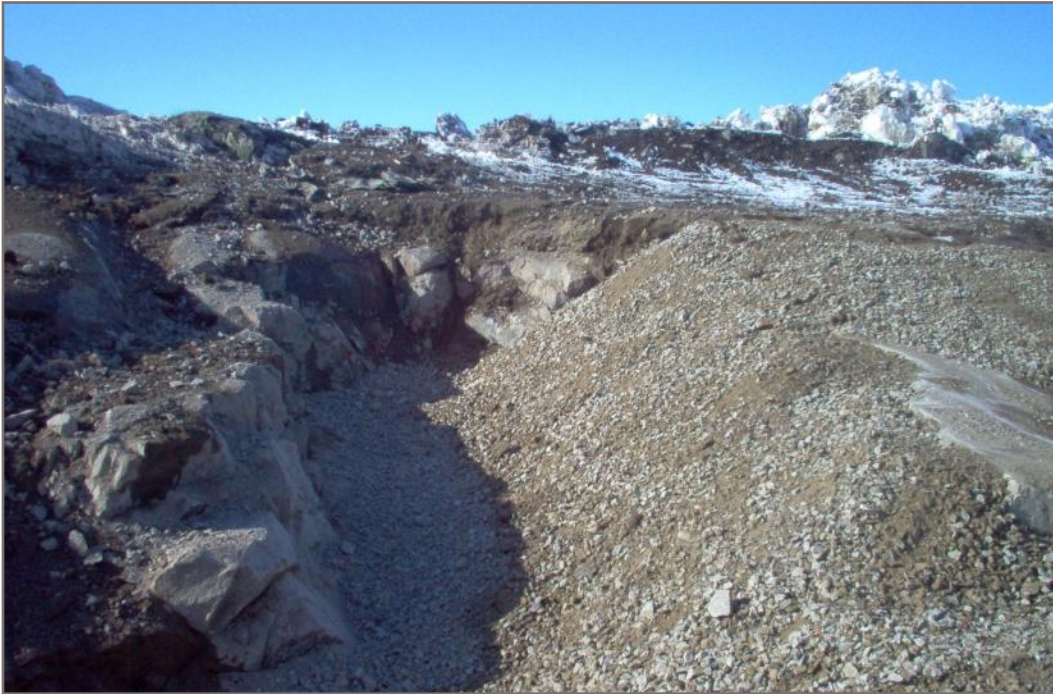
Photo 3: Reach A inlet key trench, looking northwest. Photo taken April 24, 2006.