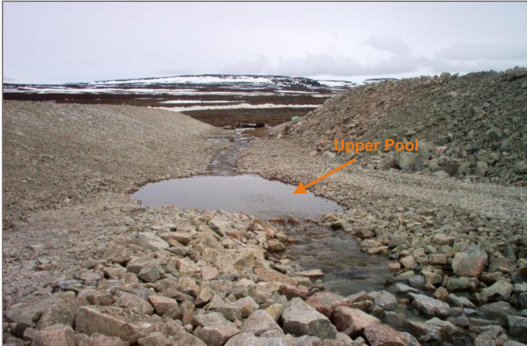
Photo 13: Reach C north berm complete, facing northeast. Upper pool in foreground. Photo taken May 22, 2006.