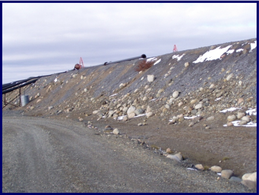
Photo 23 shows the alternating colour pattern of the dark grey angular rock over top of the light brown esker sand and gravel on the downstream slope.