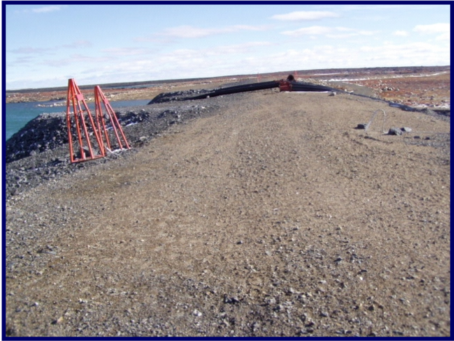
Photo 17 shows a view of the crest looking towards the south abutment.