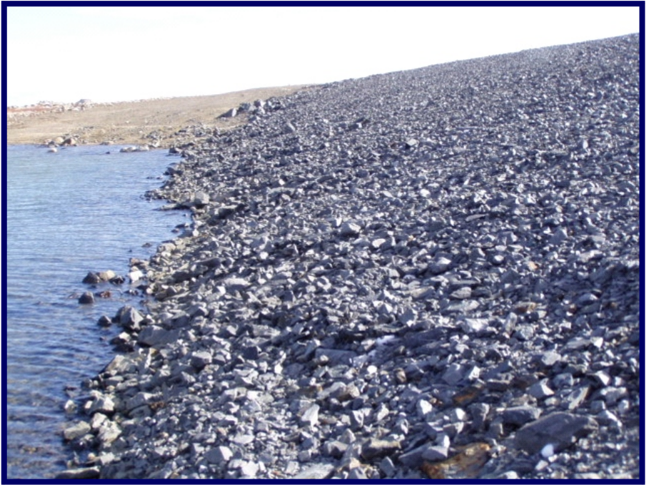
Photo 19 shows a view of the riprap on the upstream side. The distance from the water level to the crest of this dam is approximately 3.5 metres.