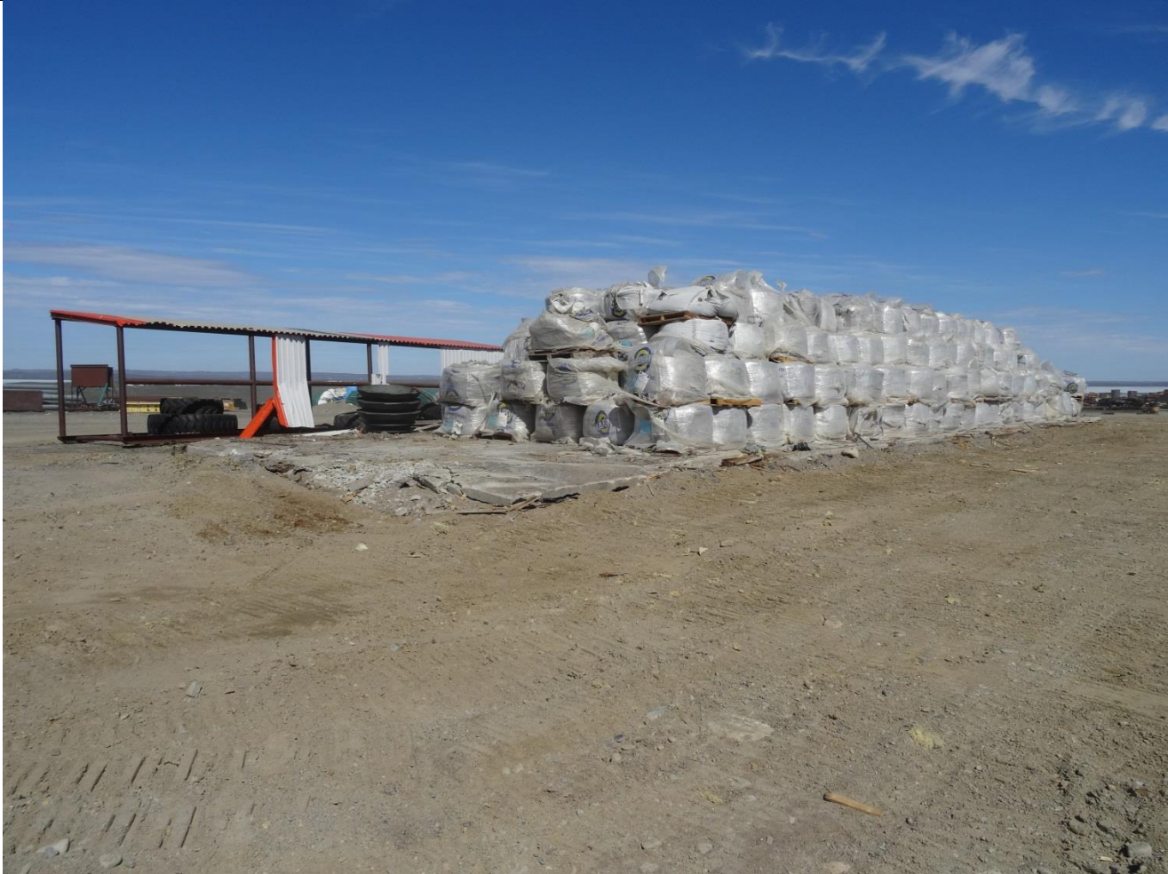
Description: Surface Storage Building #2