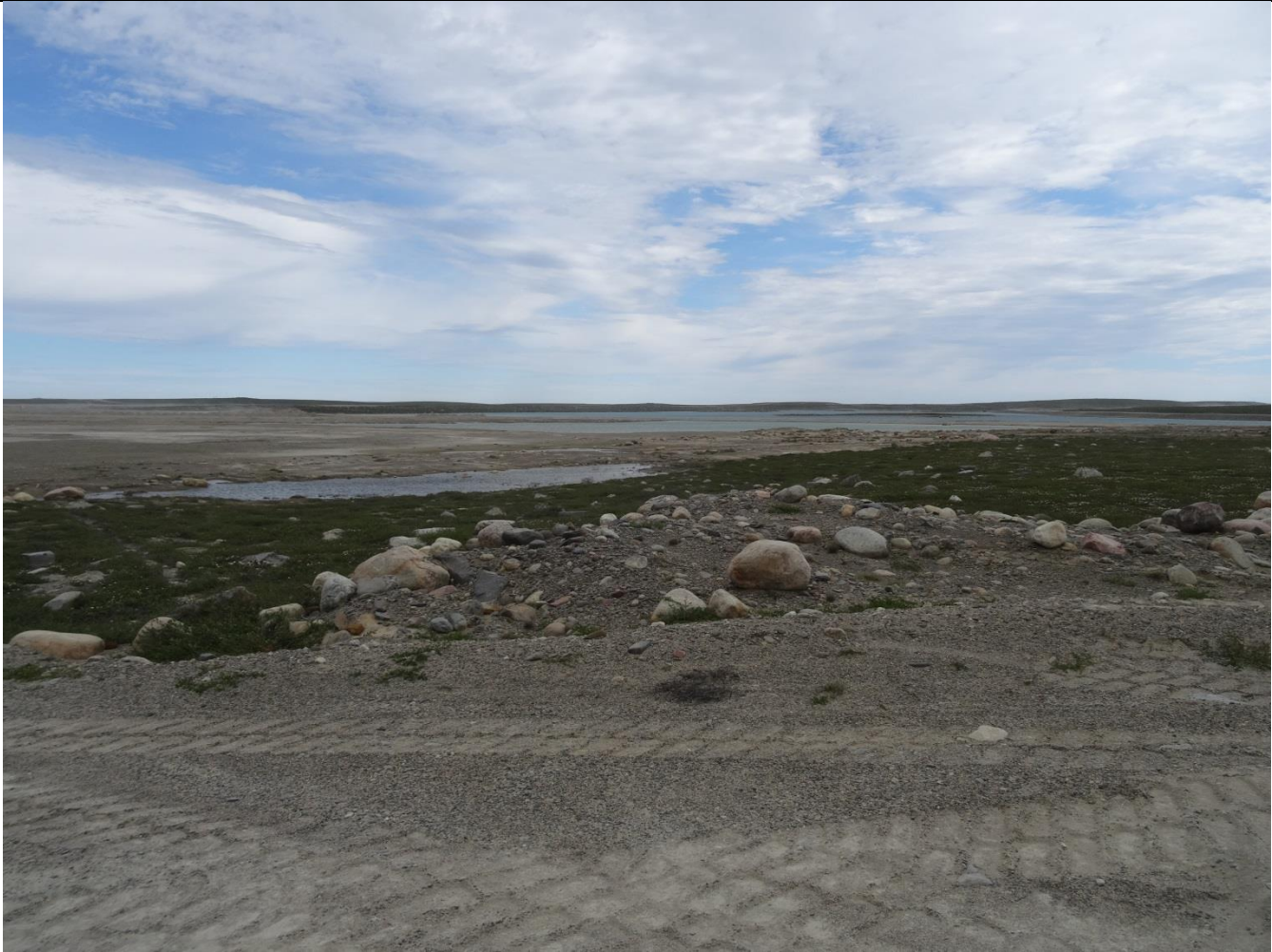
Description: Cell 3 – View 2