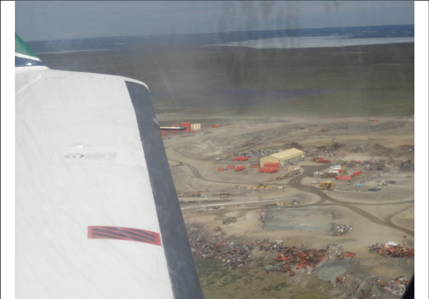
Description: Lupin Mine Site as at 2020 July 2 – View 1 as an “AFTER” Photo for comparison