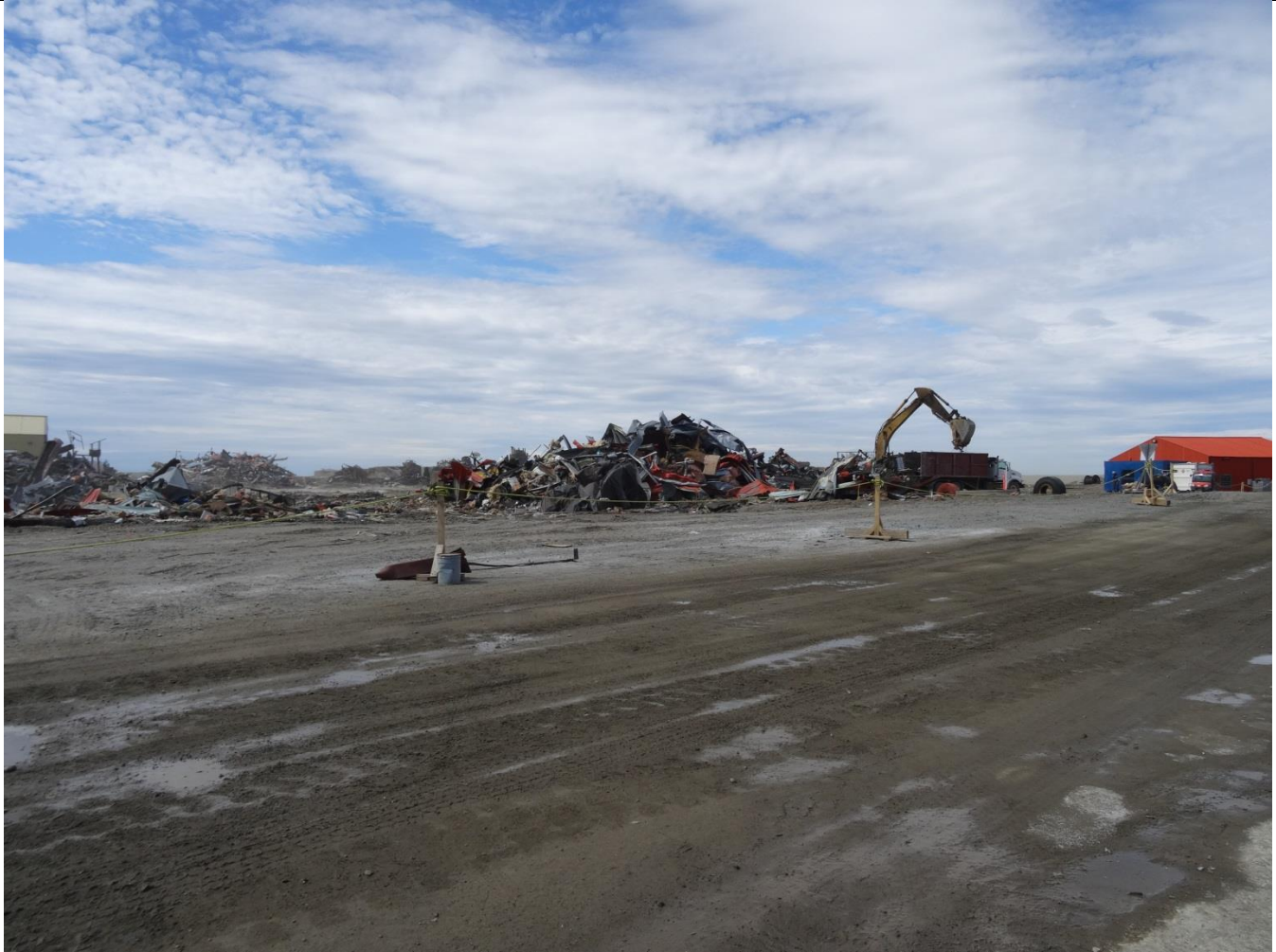
Description: Electrical Shop