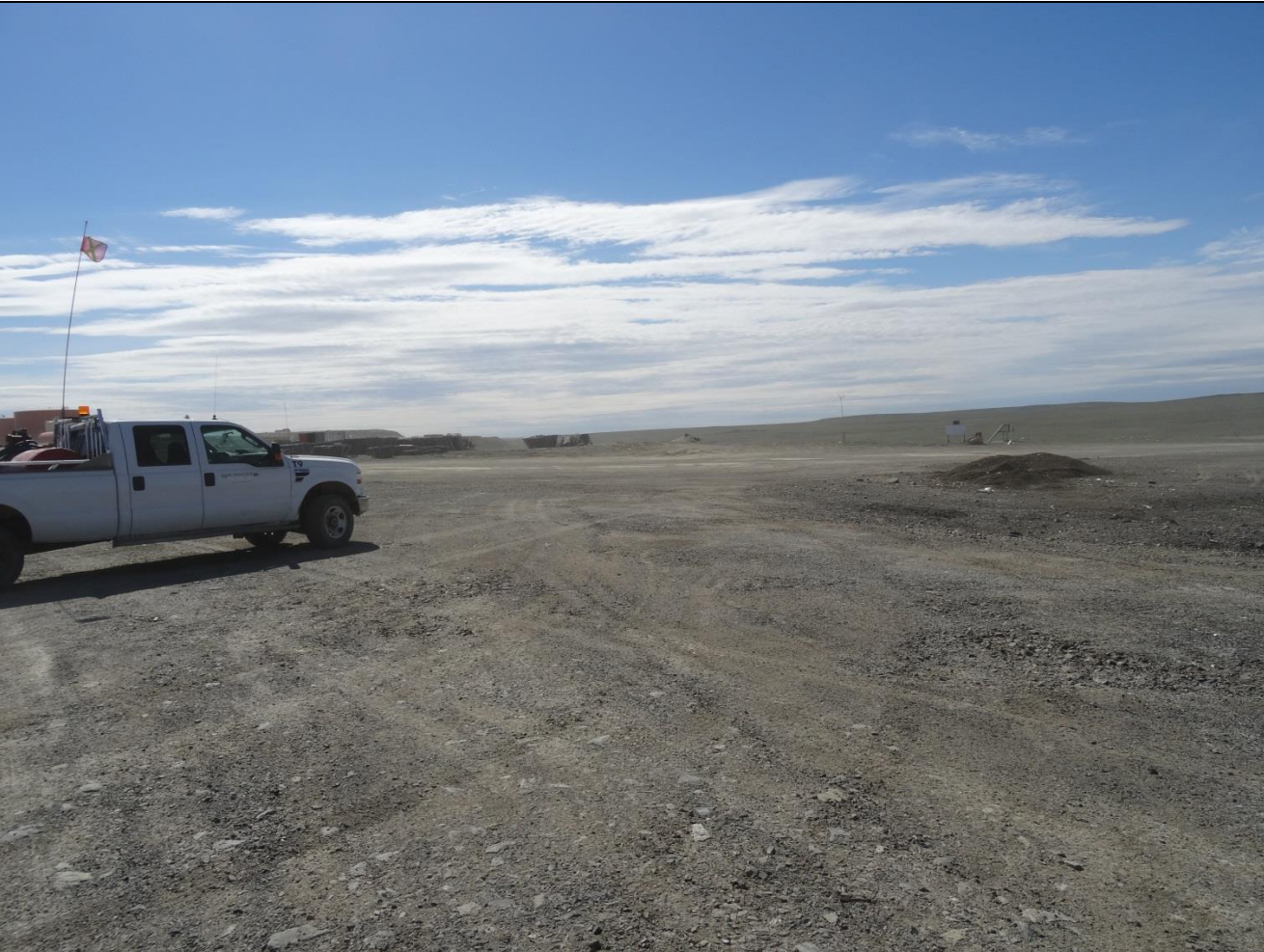
Description: Old Airport Weather Station Building