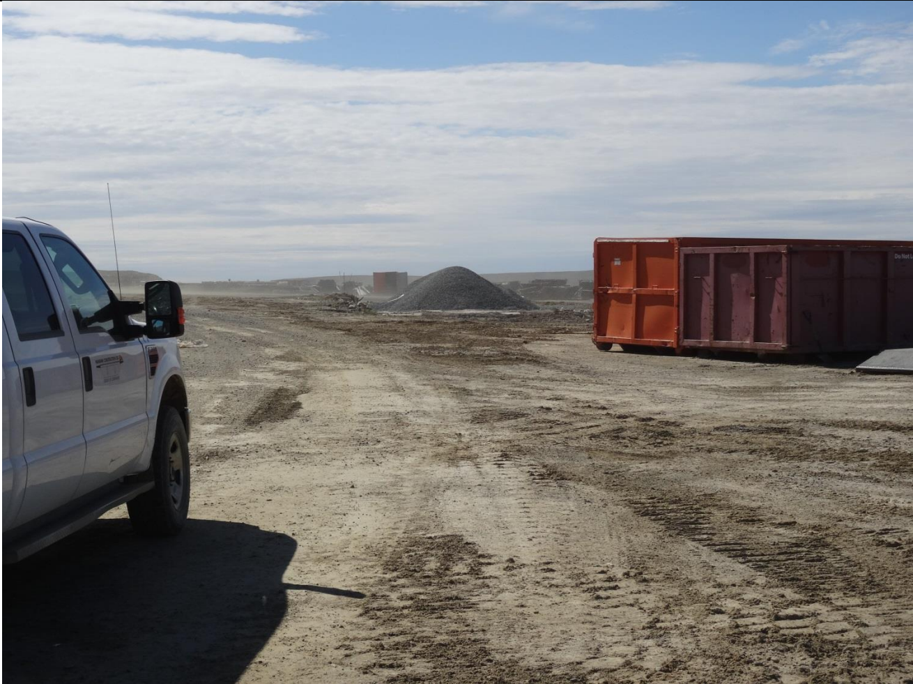
Description: Surface Storage Building #1