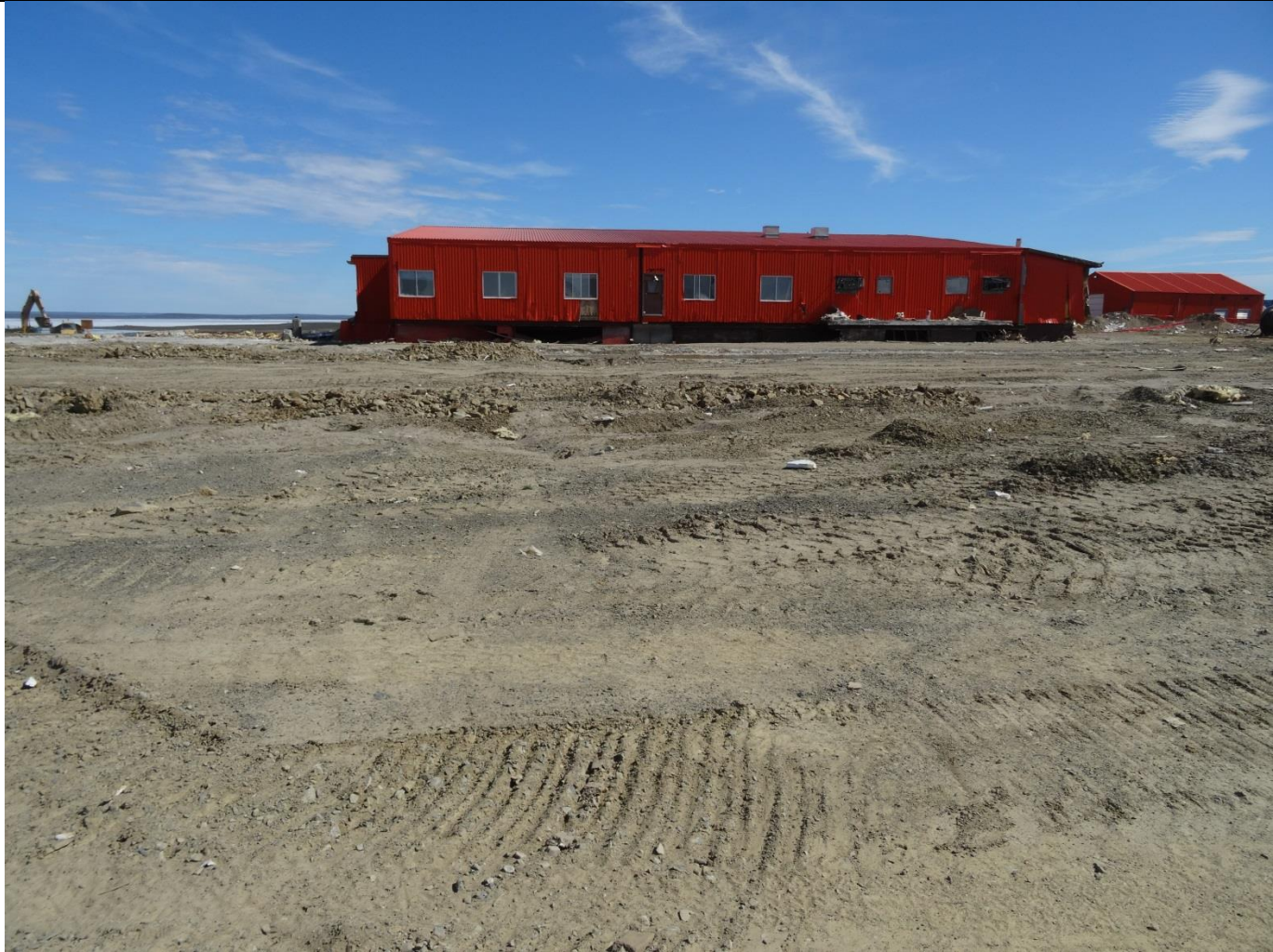
Description: Kitchen/Gymnasium/100-400 Block – View 1