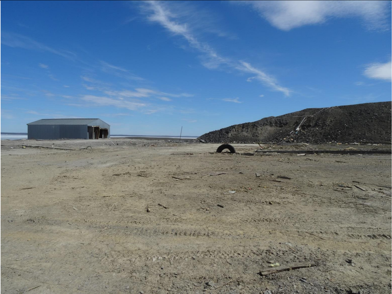
Description: RTL Shop