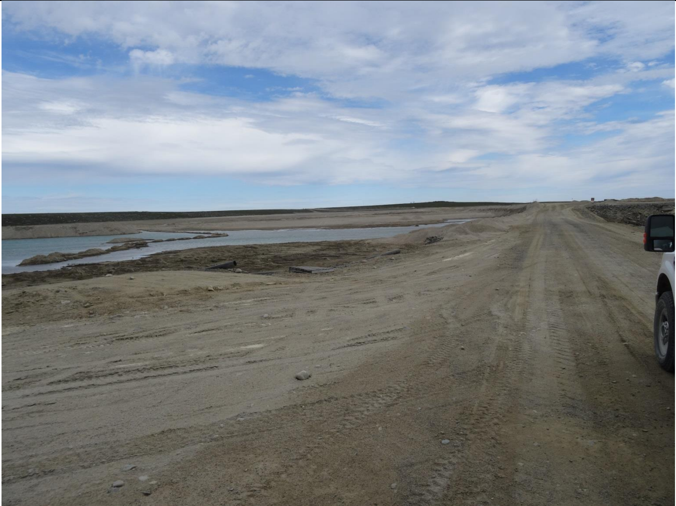
Description: Cell 5 – View 2