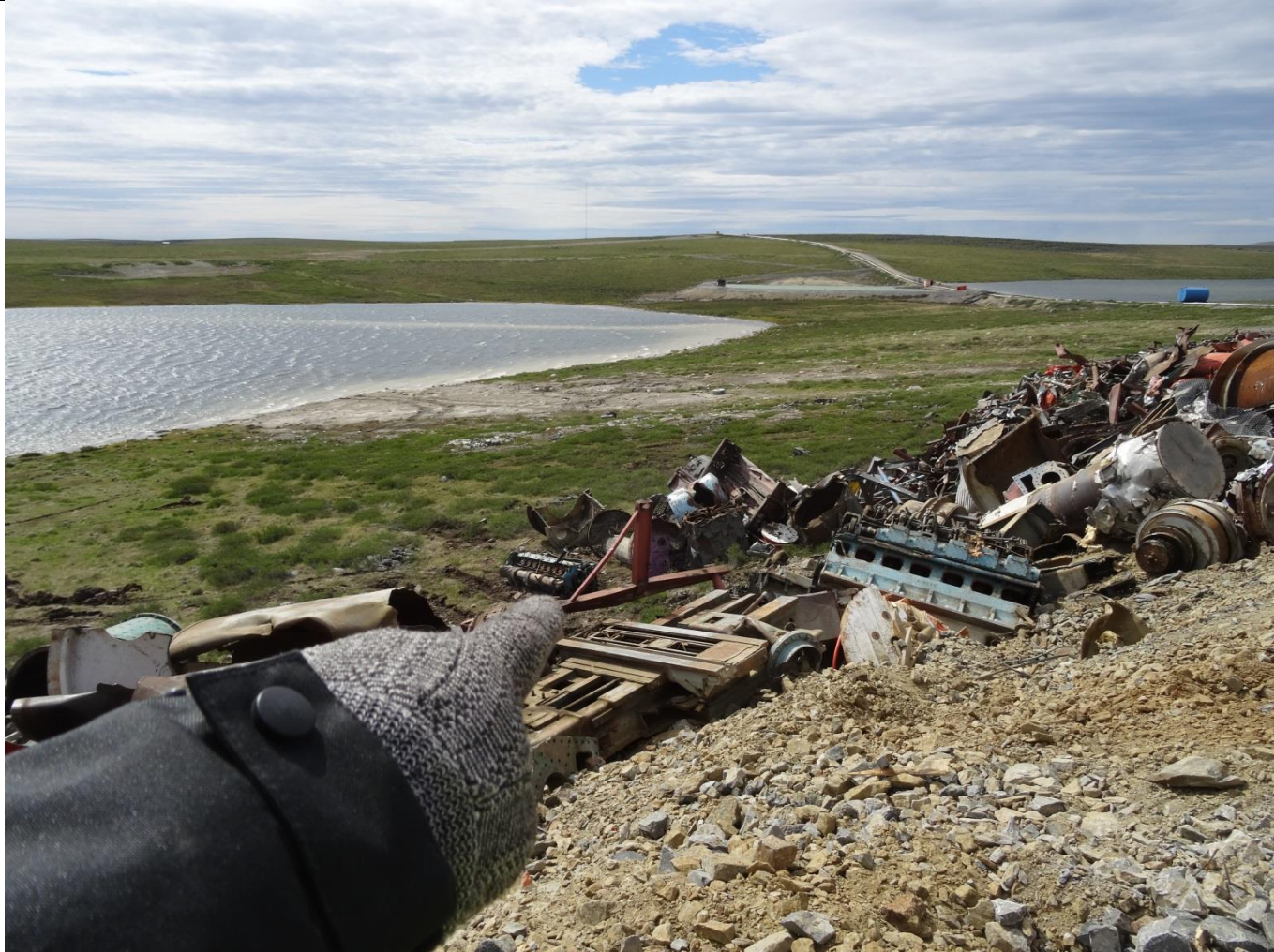
Description: Land Fill Area under Construction – View 3