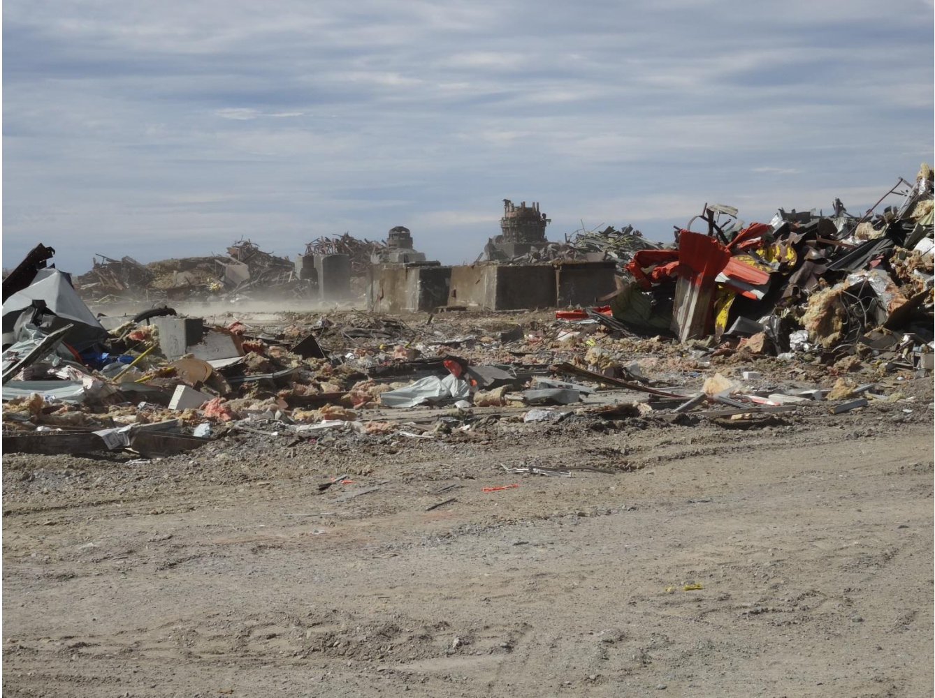
Description: Mill Building