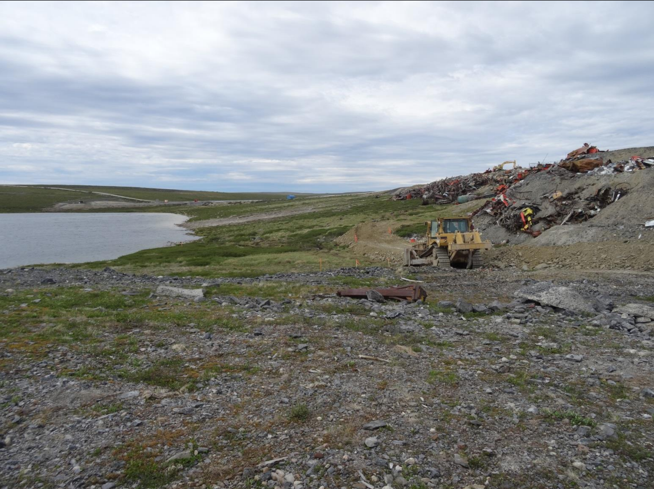
Description: Land Fill Area under Construction – View 1