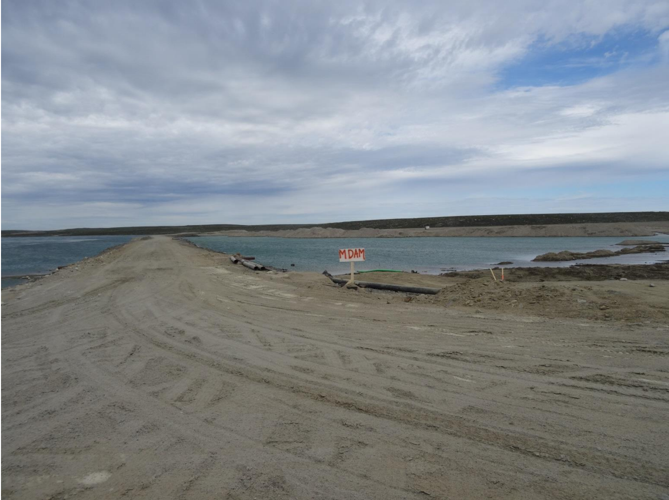
Description: Cell 5 – View 1