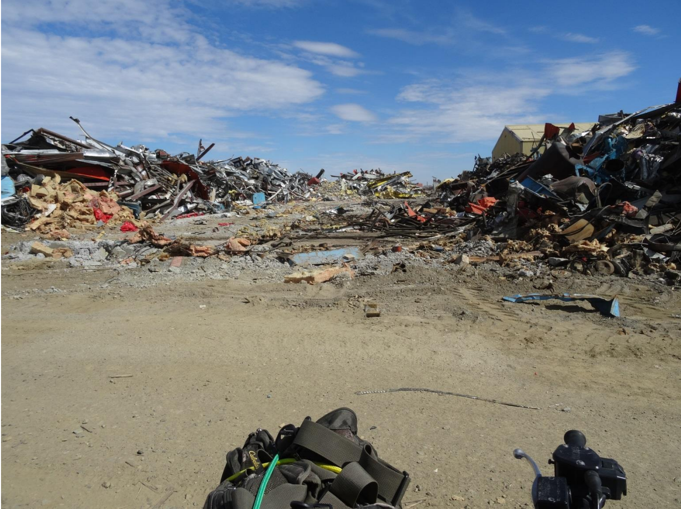
Description: Power House