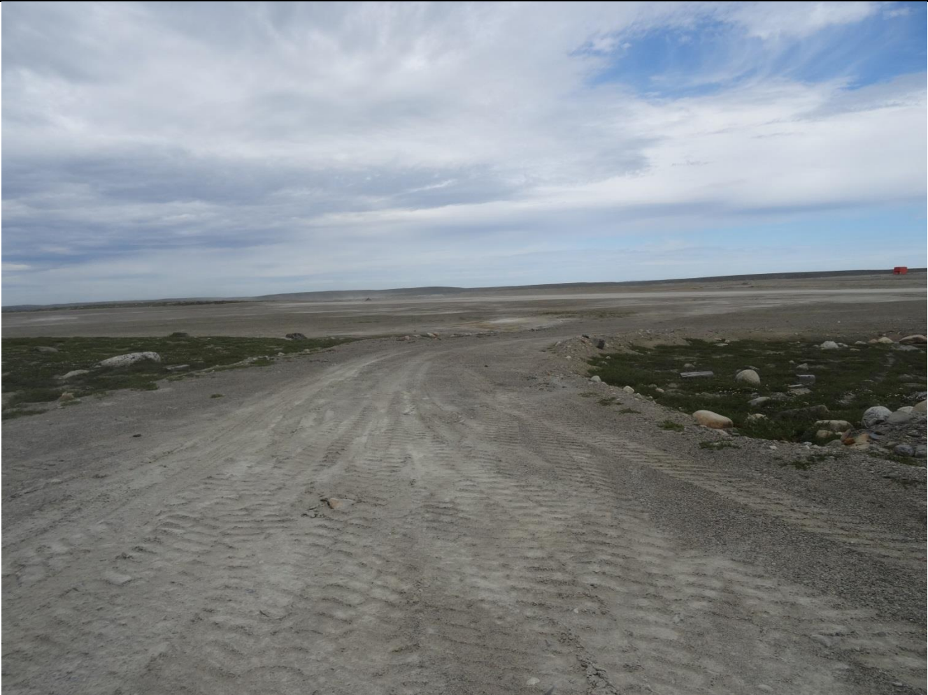
Description: Cell 3 – View 1