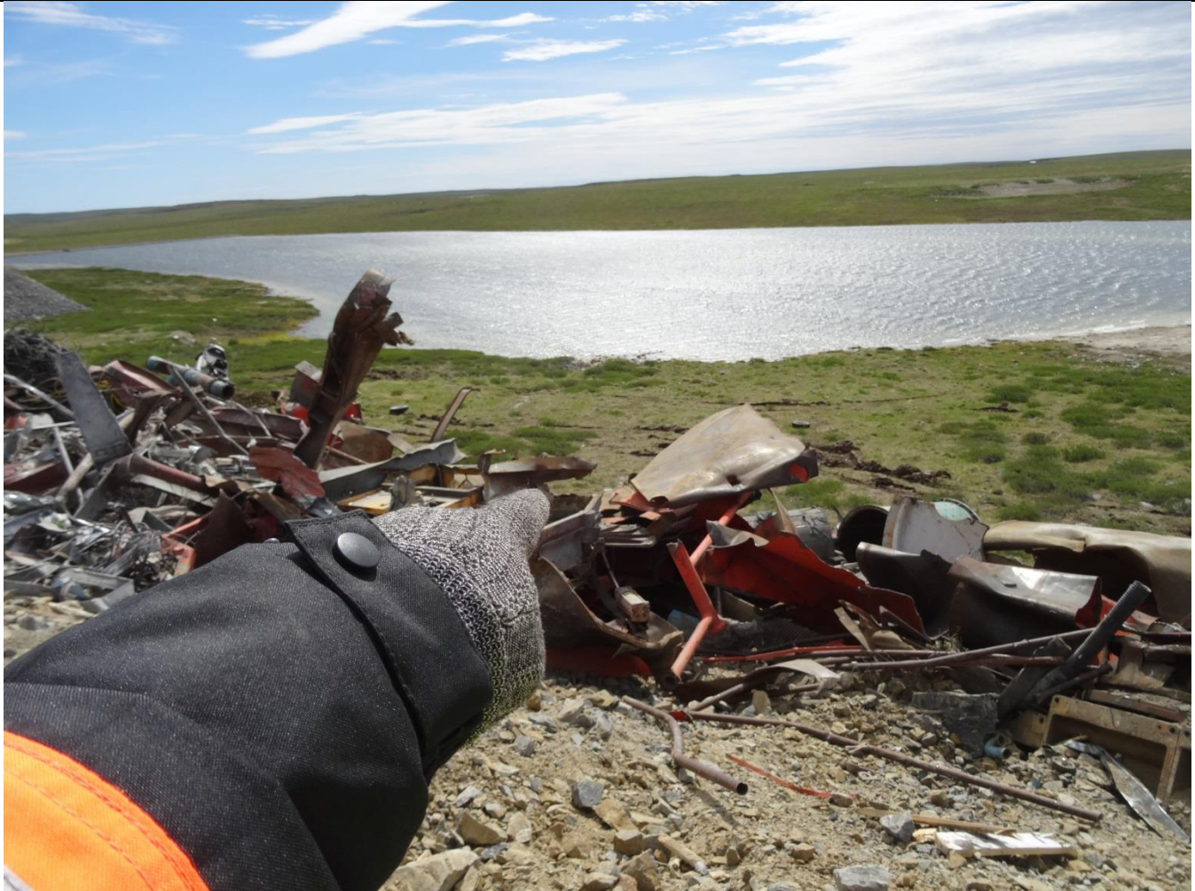
Description: Land Fill Area under Construction – View 2