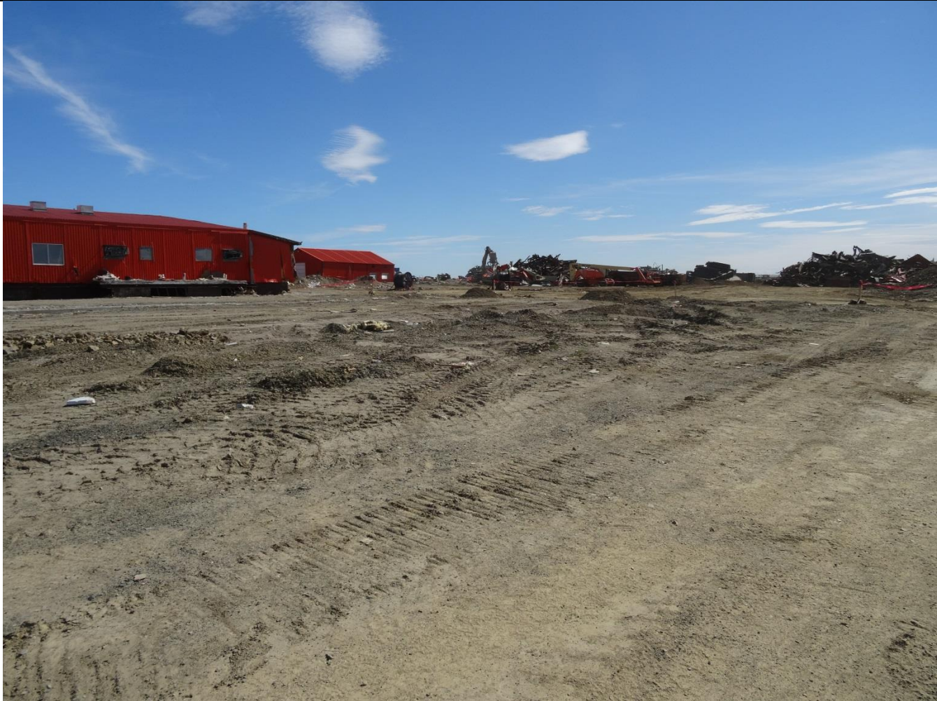
Description: Kitchen/Gymnasium/100-400 Block – View 2