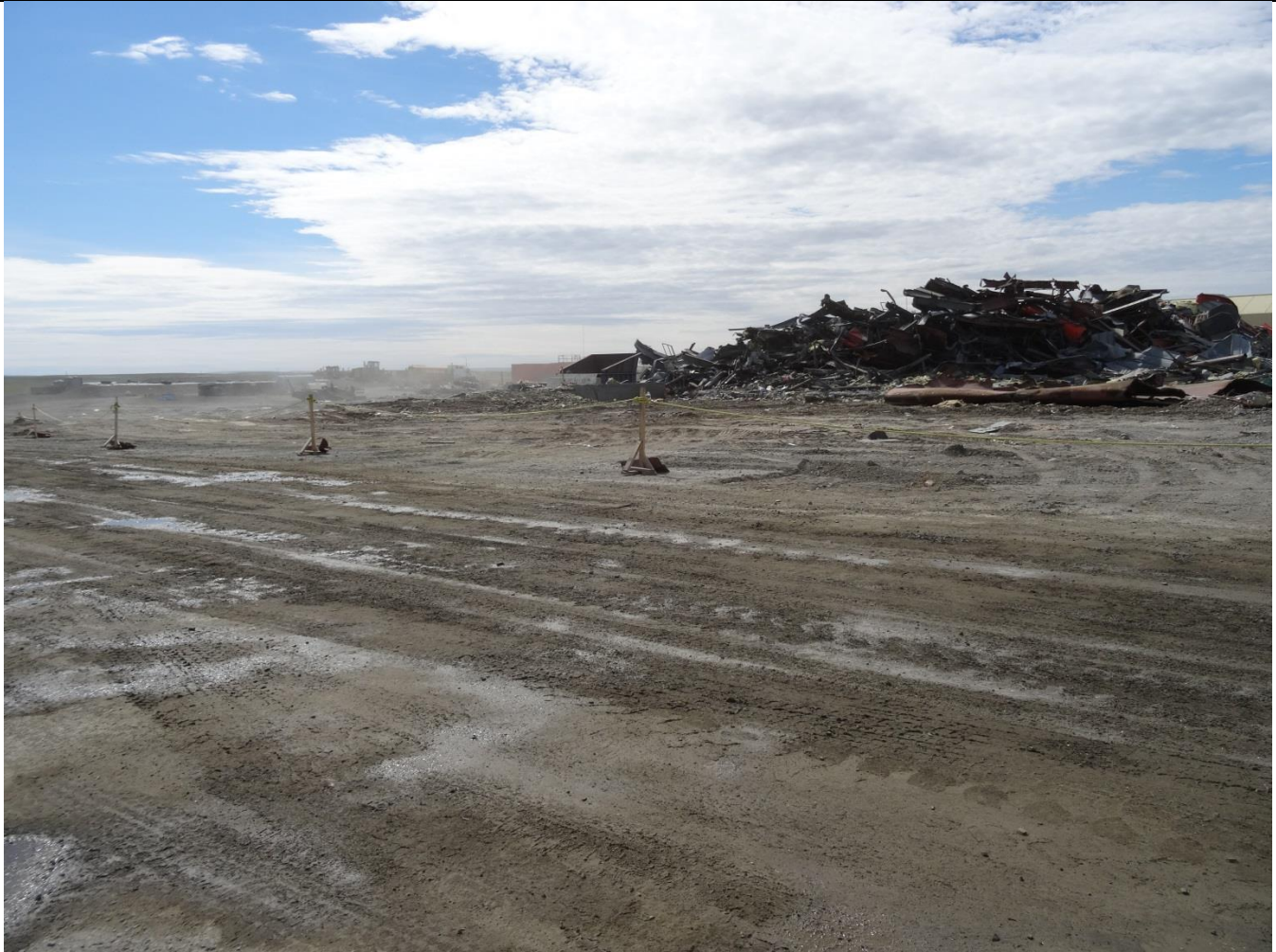
Description: Paste Plant