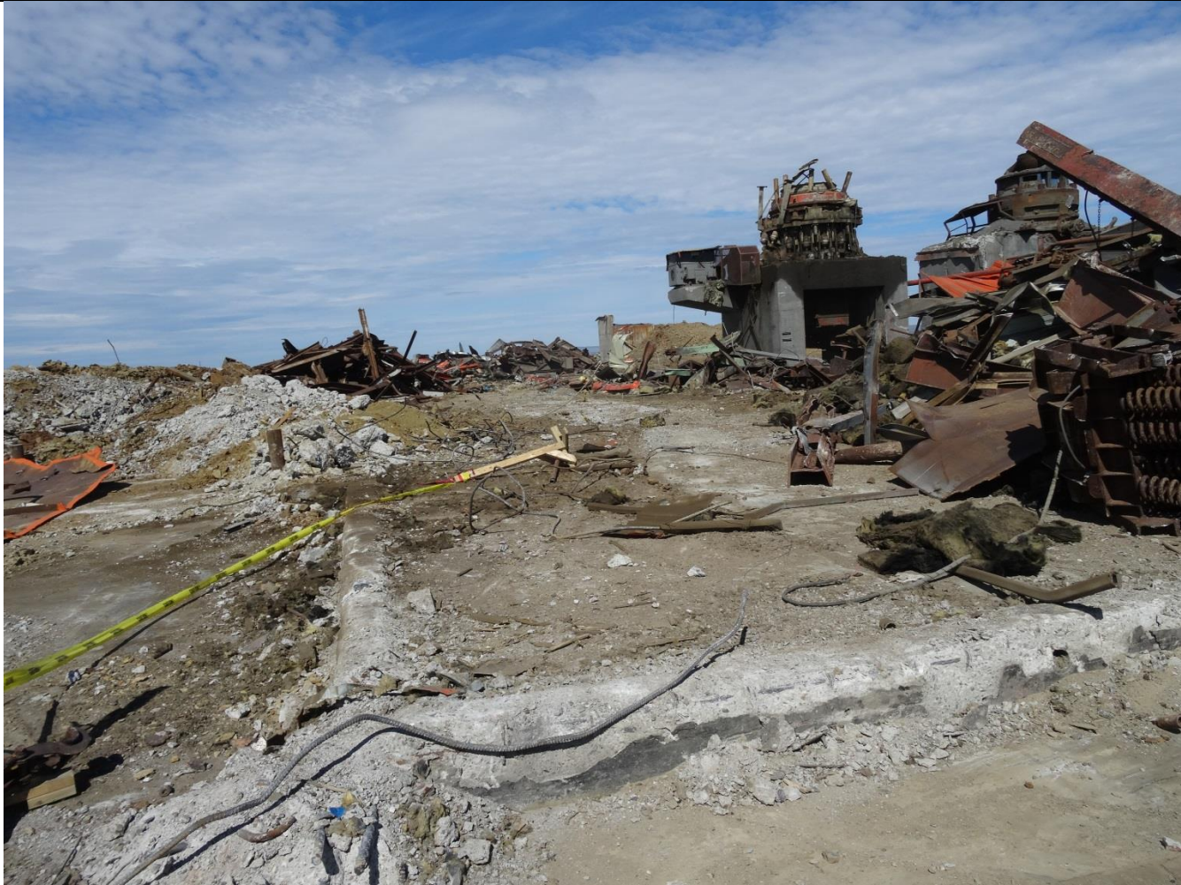
Description: Hoist House in Background