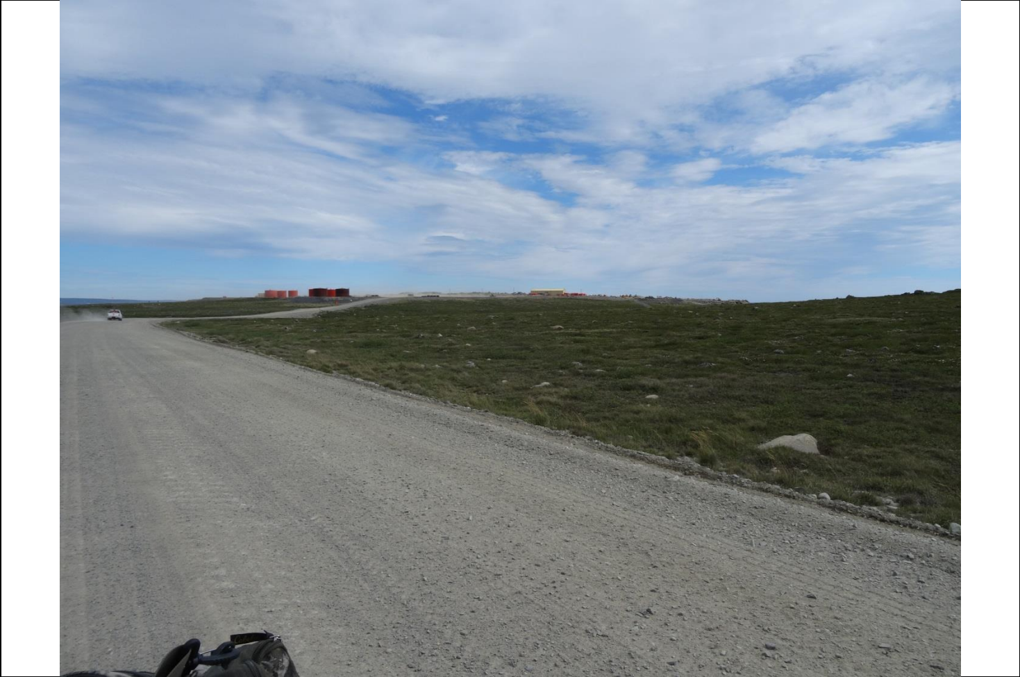
Description: Lupin Mine Site as at 2020 July 2 – View 2 as an “AFTER” Photo for comparison