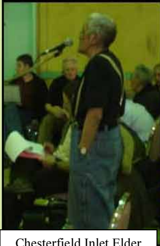
Chesterfield Inlet Elder