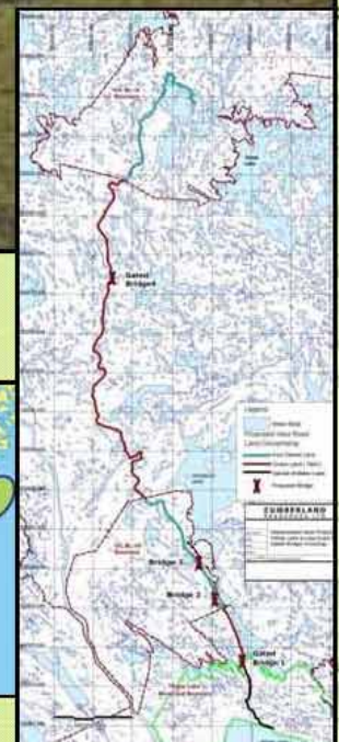
All Weather Private Access Road