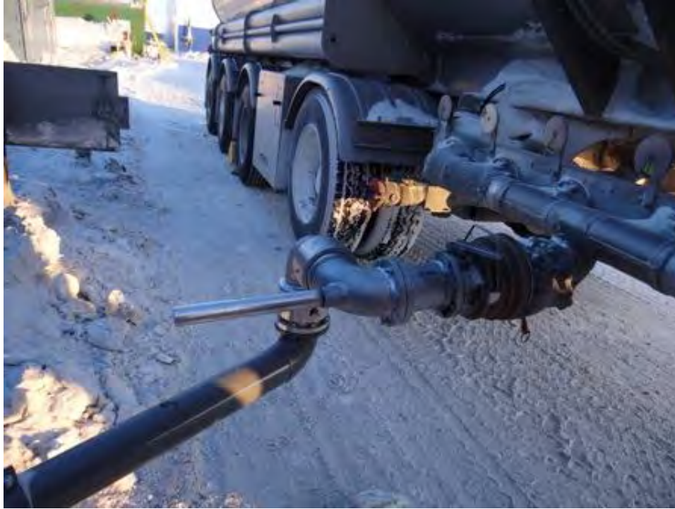
Truck Off-Loading fuel – Meadowbank Mine site – March 24 th , 2012