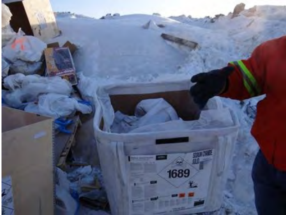
Washed Cyanide bags – Found in Waste Management Area – March 24 th , 2012