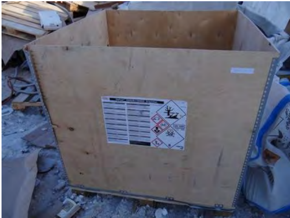
Cyanide Creates – Found in Waste Management Area – March 24, 2012