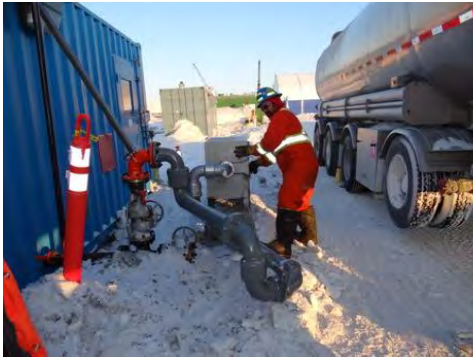
Fuel Transfer – Meadowbank Mine site – March 24, 2012