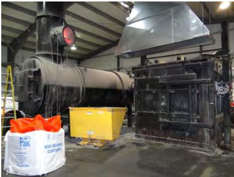
Incinerator – Meadowbank Mine Site - March 24 th 2012