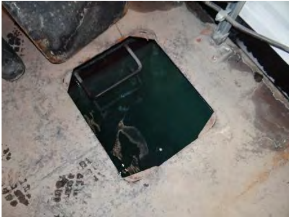
Tailing water intake – Recycle – Open hatch – March 24, 2012