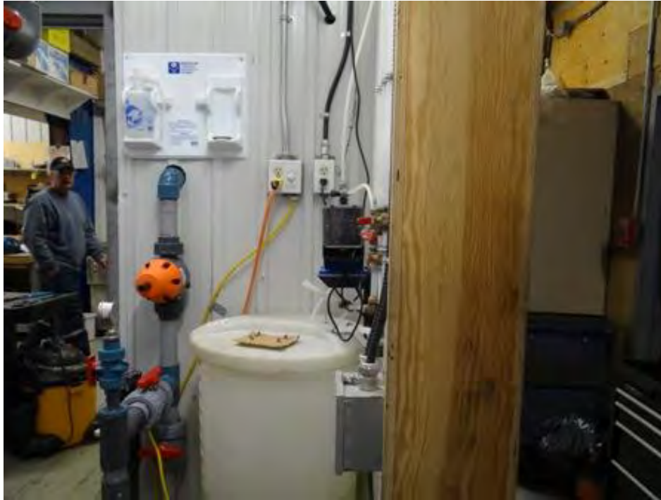
Water Treatment – Potable water – Meadowbank Mine site