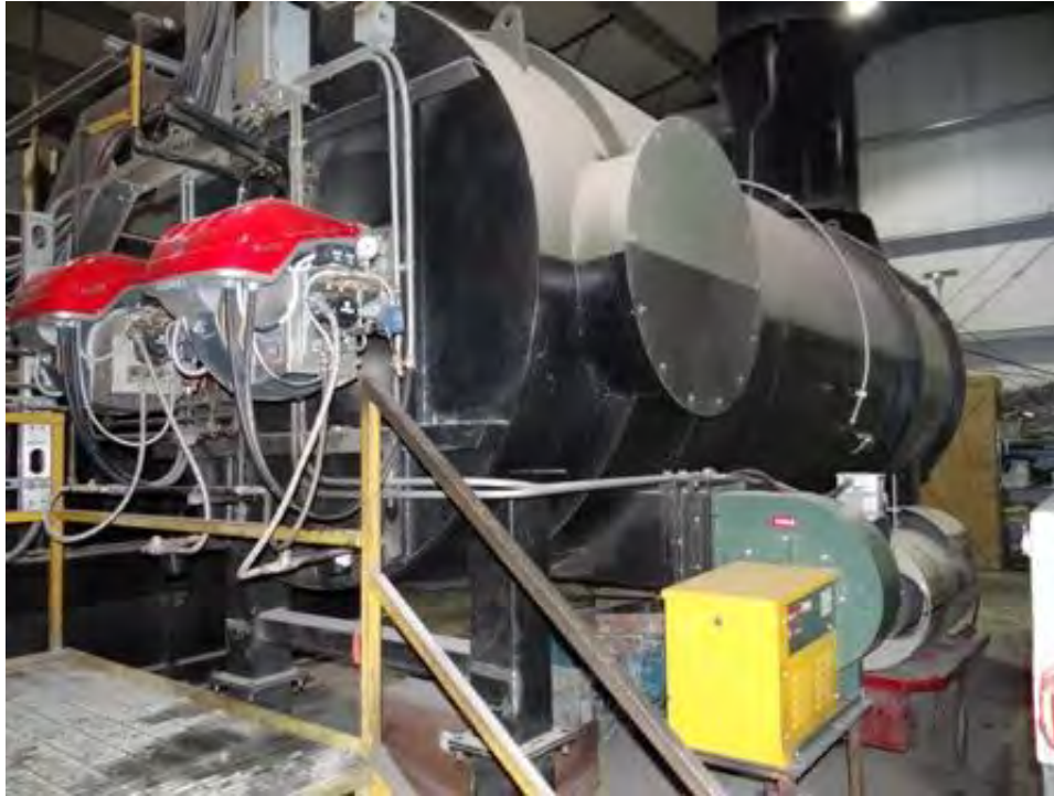
Incinerator – Meadowbank Mine Site- March 24 th 2012