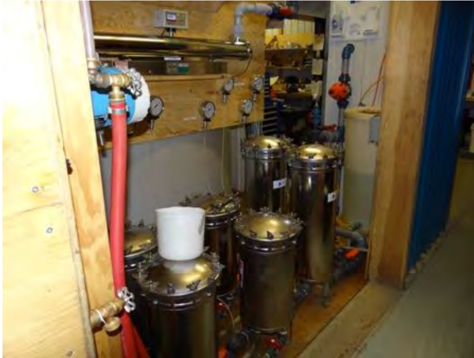
Water Filter system – Meadowbank Mine site - March 24 th , 2012