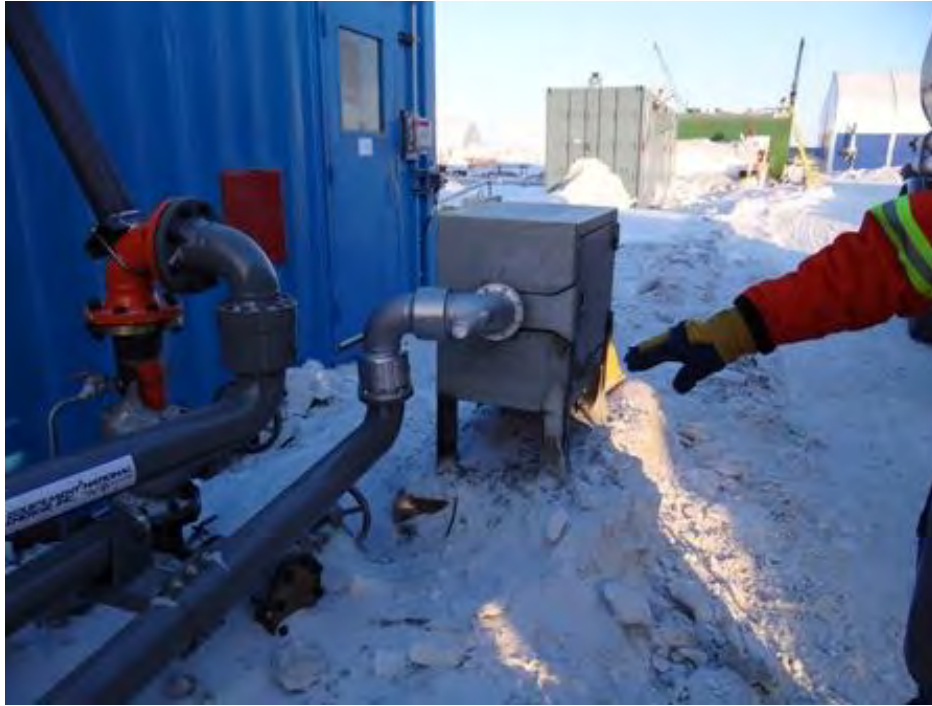
Fuel Transfer – security Box for Truck Connection – Meadowbank Mine site – March 24, 2012