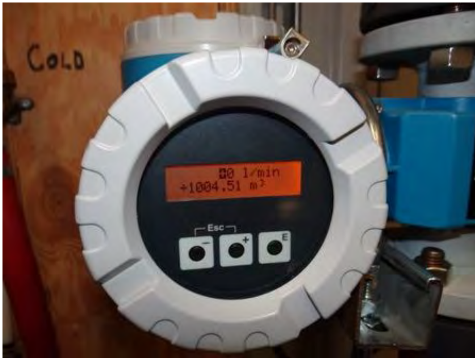
Water meter- recently installed – March 24 th , 2012 – Meadowbank Mine site