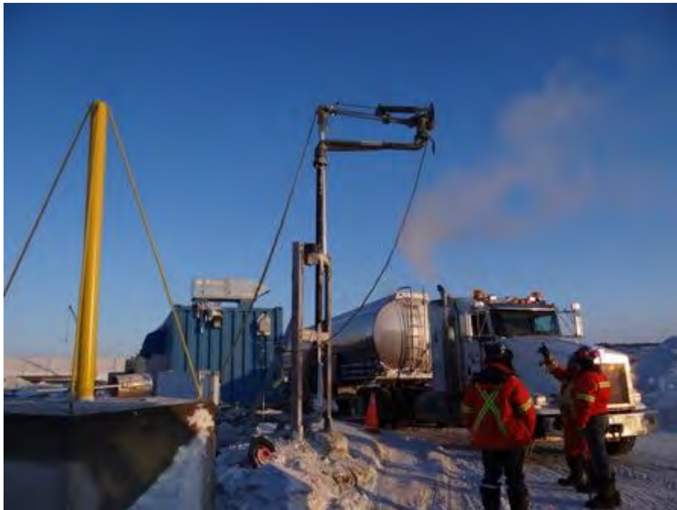
Fuel Transfer Station Meadowbank Mine site – March 24 2012