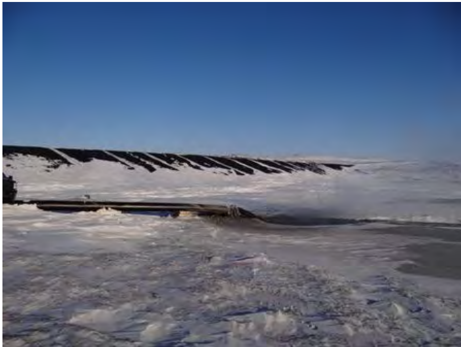
Tailings outfall in North Pit – Meadowbank Mine site - March 24, 2012