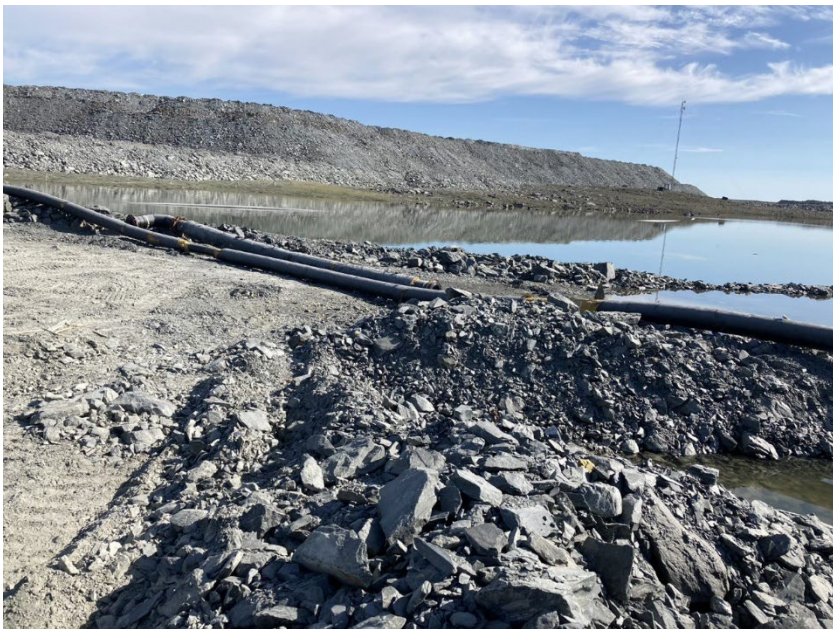
Photograph H8-2 IVR Attenuation Pond Ramp

Description: From the pump pad, looking southwest at the Attenuation Pond.