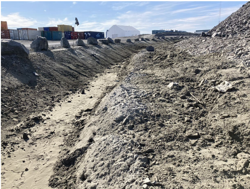
Photograph H11-4 Saline Ditch

Description: From approx. Sta. 0+530, looking east.