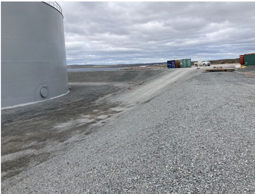
Photograph G1-20 Baker Lake Tank Farm

Description: Looking southwest between Tank 8 and Tank 7.