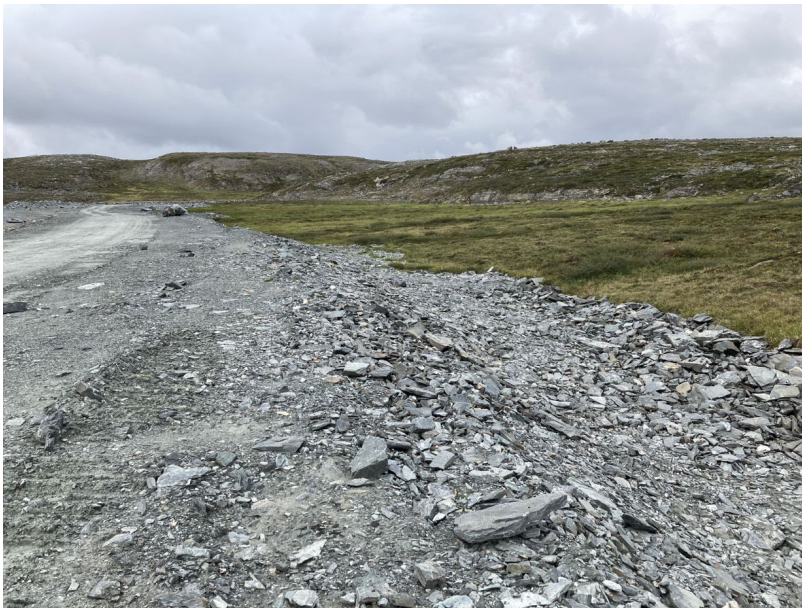
Photograph H2-12 Diversion Ditch and its Sediment and Erosion Protection Structure

Description: From the northern diversion ditch looking east.