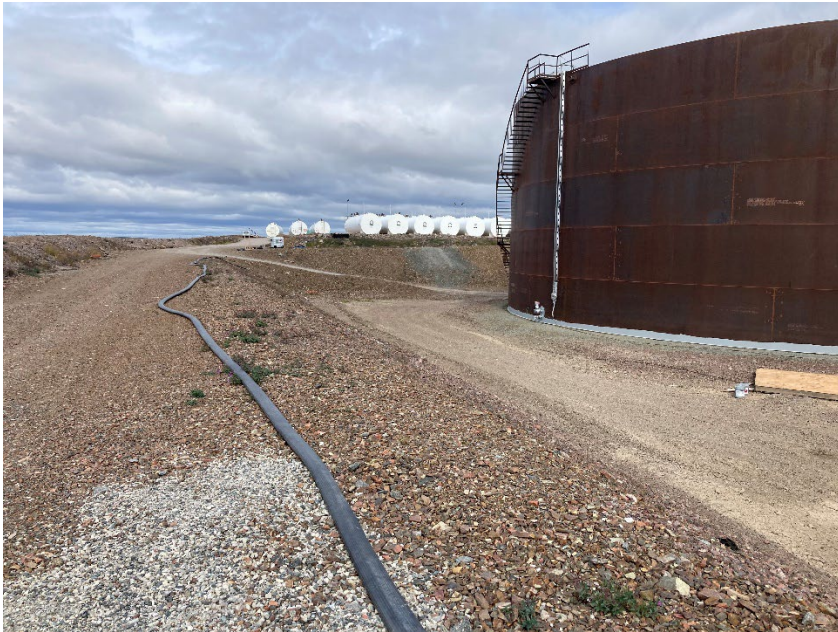
Photograph G1-13 Baker Lake Tank Farm