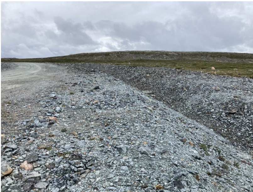
Photograph H2-8 Diversion Ditch and its Sediment and Erosion Protection Structure

Description: From the northern diversion ditch looking southeast.