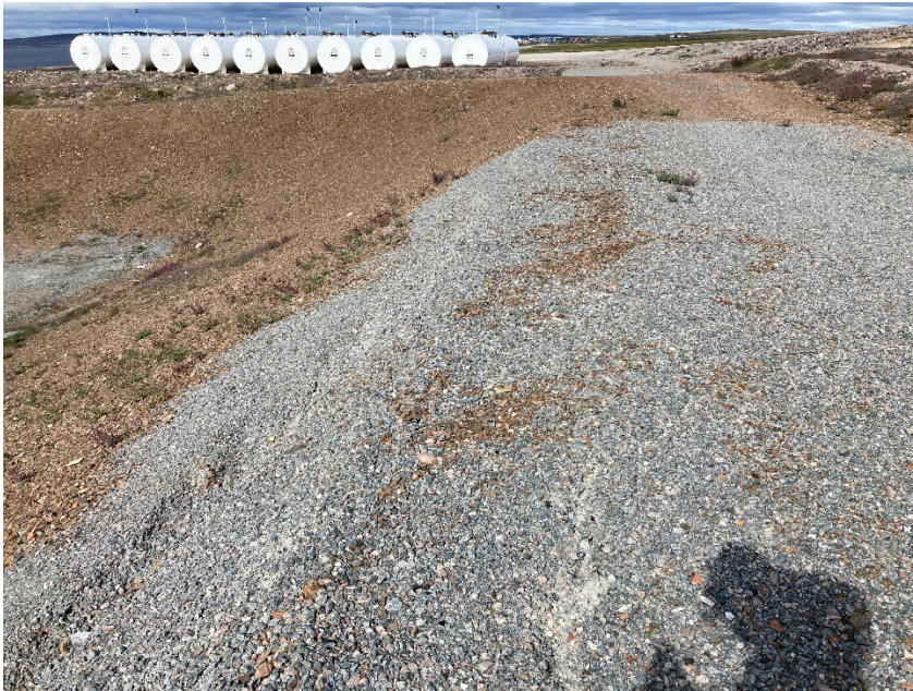
Photograph G1-17 Baker Lake Tank Farm