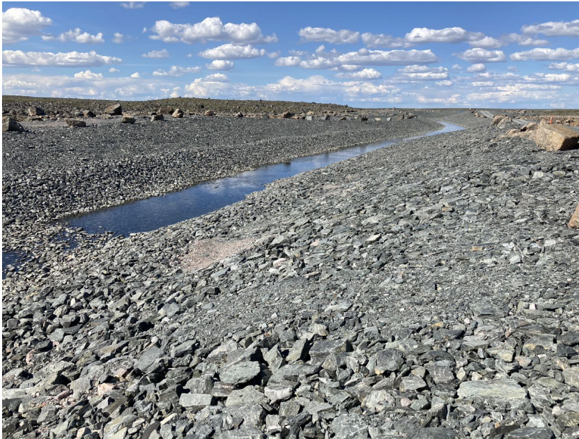
Photograph H10-7 South Whale Tail Channel