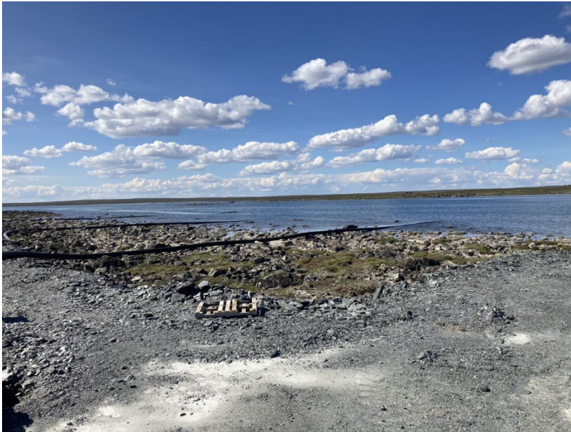
Photograph H9-1 Mammoth Lake Diffuser