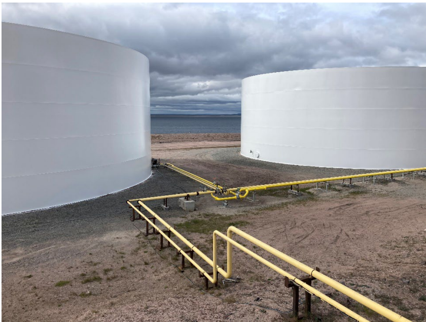
Photograph G1-12 Baker Lake Tank Farm

Description: From the northern side of Tank 4, looking northwest toward Tanks 4, 3, 2, and 1. Presence of exposed liner due to erosion of the granular cover.