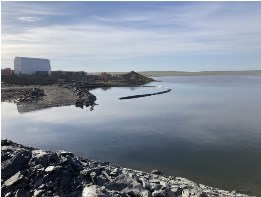
Photograph H9-2 Whale Tail South Diffuser

Description: From the access road, looking west. Three diffusers are present and working normally.