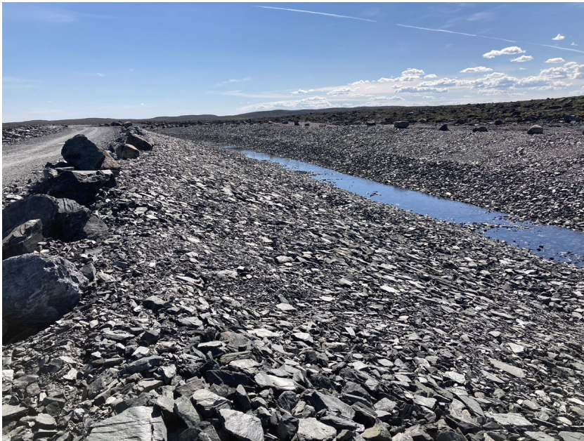
Photograph H10-4 South Whale Tail Channel

Description: From approx. Sta. 0+800, looking northwest.