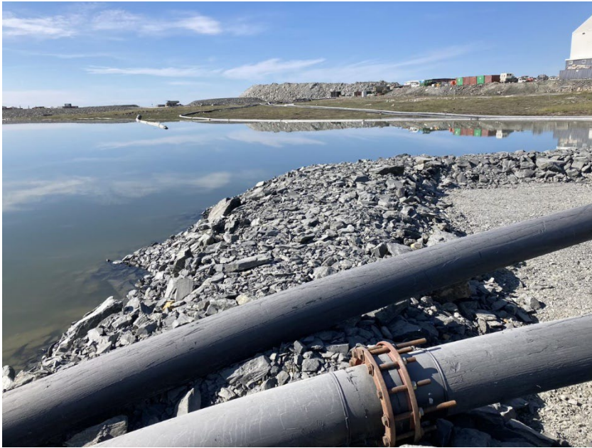
Photograph H8-1 Attenuation Pond Ramp