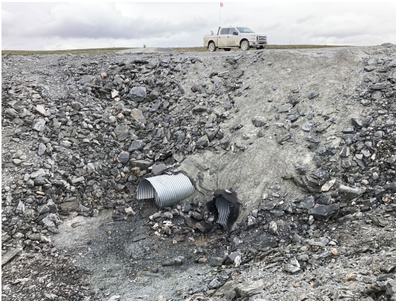
Photograph H2-1 Diversion Ditch and its Sediment and Erosion Protection Structure