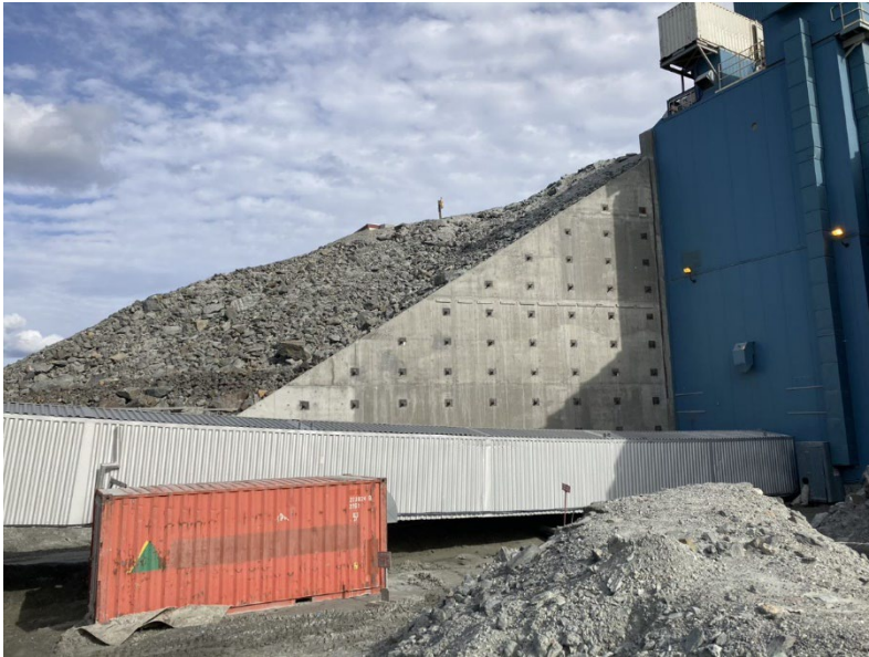
Photograph H6-1 Meadowbank Crusher Retaining Wall