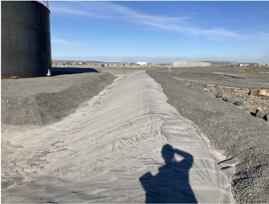
Photograph G3-5 Whale Tail Project Site Tank Farm