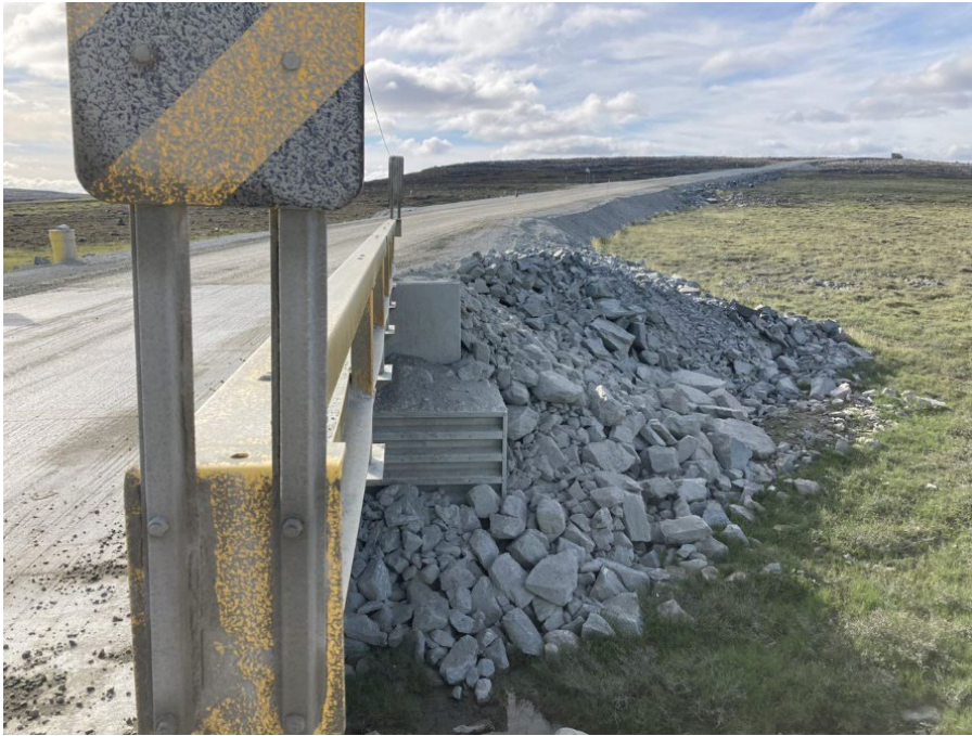
Photograph E2-17 Bridges 8 – km 159+500