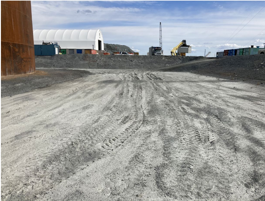
Photograph G2-1 Meadowbank Tank Farm