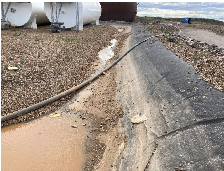
Photograph G1-22 Baker Lake Tank Farm

Description: From the southwestern corner of the Jet A fuel tanks looking northeast. Presence of exposed geomembrane with holes and water ponding.