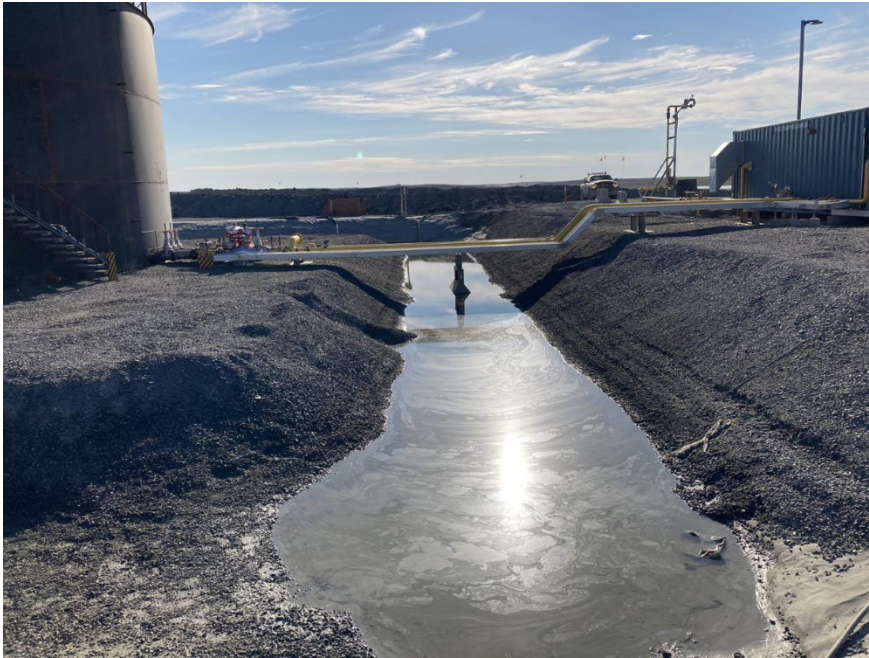
Photograph G3-7 Whale Tail Project Site Tank Farm