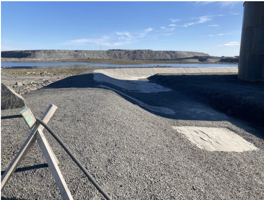
Photograph G3-6 Whale Tail Project Site Tank Farm

Description: From the northeast corner of the tank, looking west.