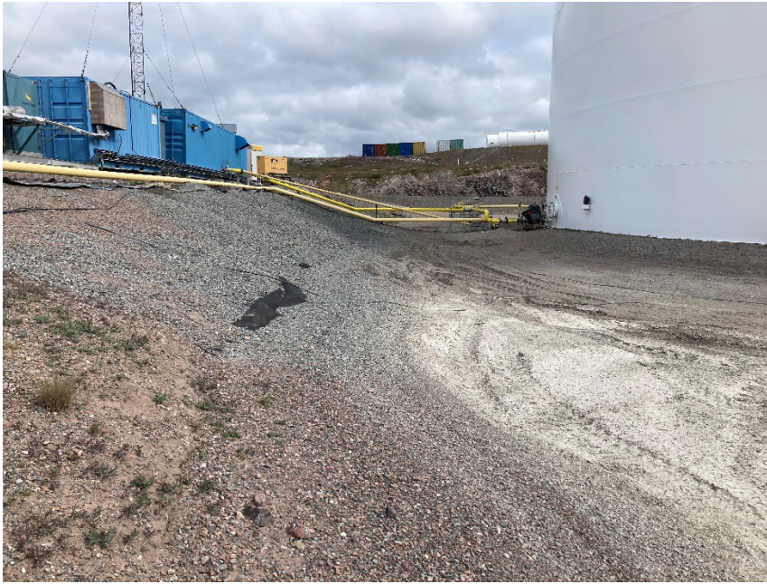
Photograph G1-1 Baker Lake Tank Farm