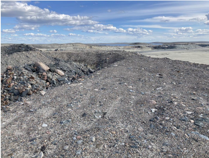
Photograph H5-1 Meadowbank Contaminated Soil Storage and Bioremedial Landfarm Facility