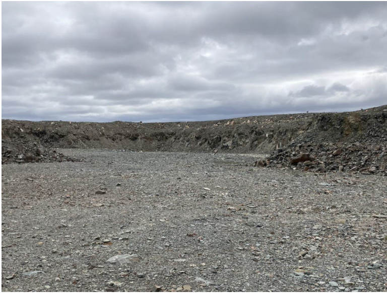
Photograph F-1: Quarry 12 – km 58+300