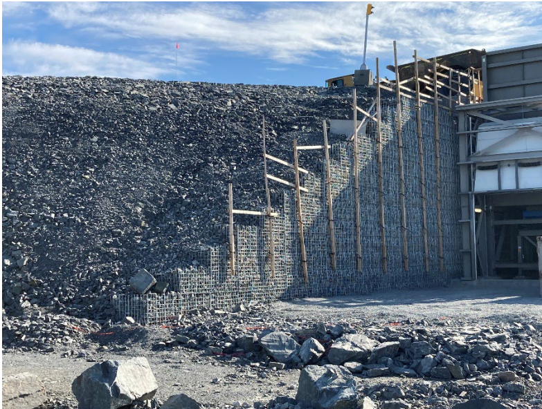
Photograph H6-3 Whale Tail Project Tramp Metal Removal Facility Retaining Wall