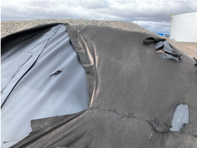
Photograph G1-5 Baker Lake Tank Farm