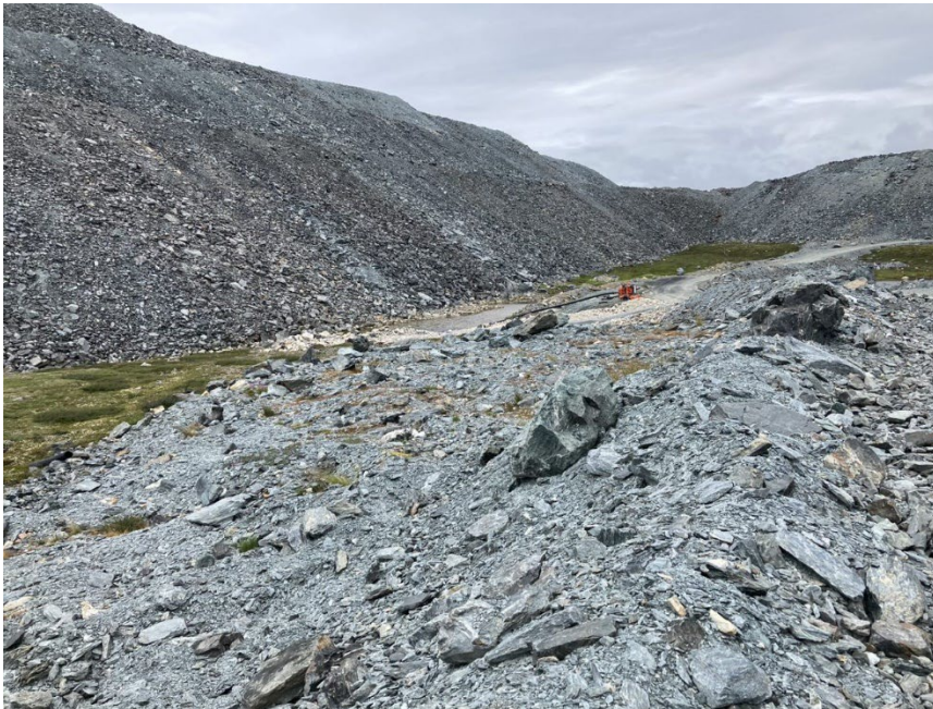
Photograph H3-2 RSF Till Plug

Description: From the south side of NP2 Lake (north of the diversion ditch) looking west at the RSF till plug.