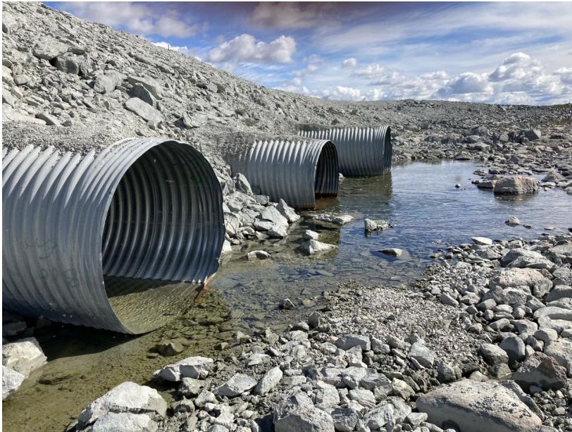
Photograph H1-1 Vault Road Culverts