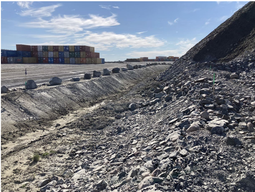
Photograph H11-2 Saline Ditch

Description: From the northern extremity of the Saline Ditch, looking west. The culvert is in good condition. Mud is accumulating in front of the inlet.