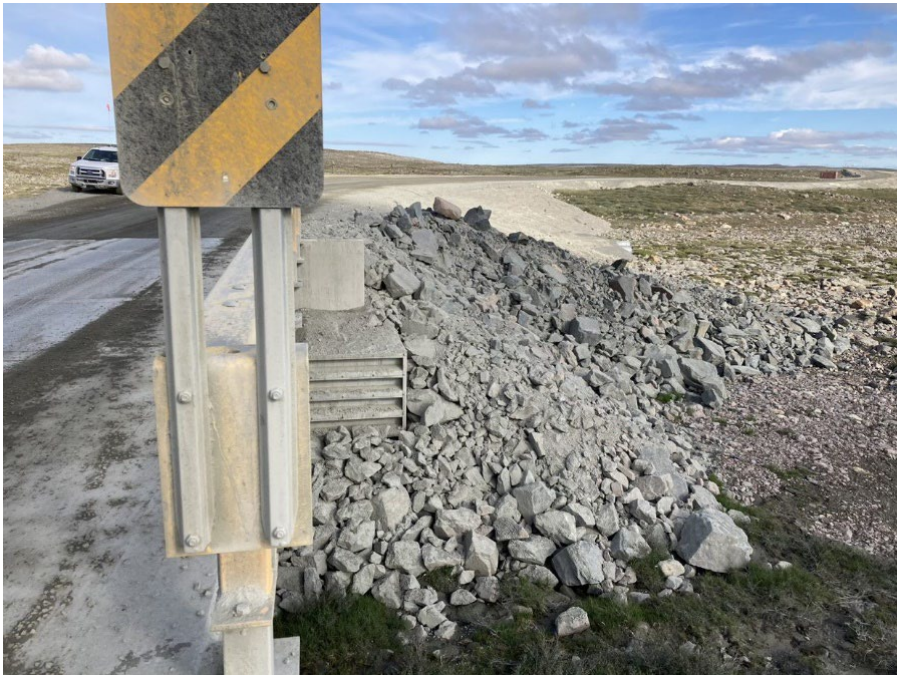
Photograph E2-16 Bridges 8 – km 159+500

Description: Looking at the south abutment.