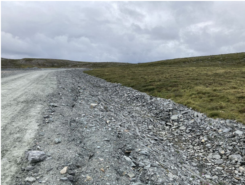
Photograph H2-10 Diversion Ditch and its Sediment and Erosion Protection Structure

Description: From the northern diversion ditch looking east.