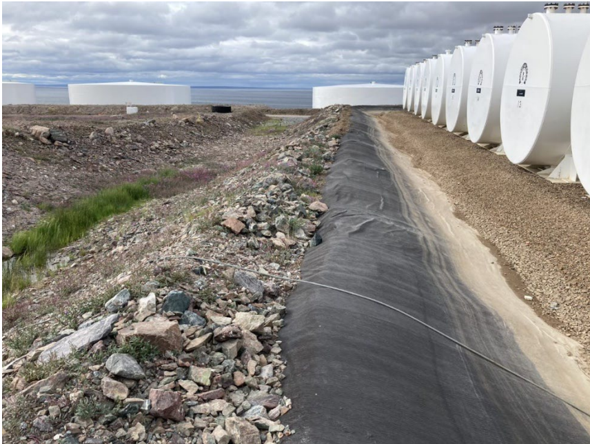
Photograph G1-24 Baker Lake Tank Farm

Description: From the northeastern corner of the Jet A fuel tanks looking west.