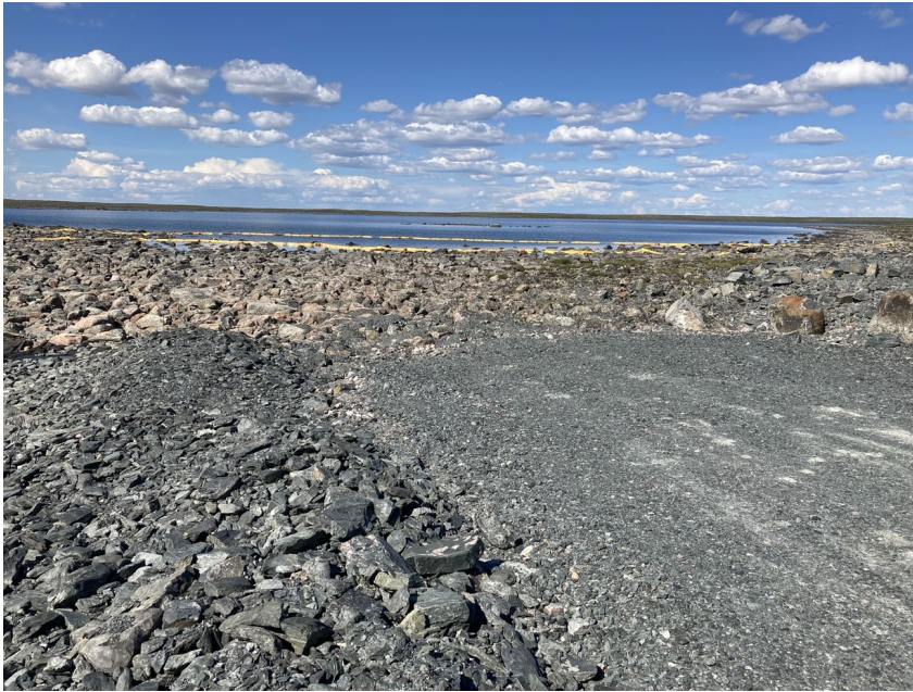
Photograph H10-1 South Whale Tail Channel