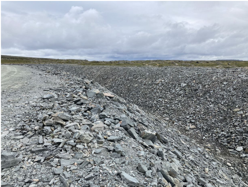
Photograph H2-4 Diversion Ditch and its Sediment and Erosion Protection Structure

Description: From the eastern diversion ditch looking south toward Lake NP2.