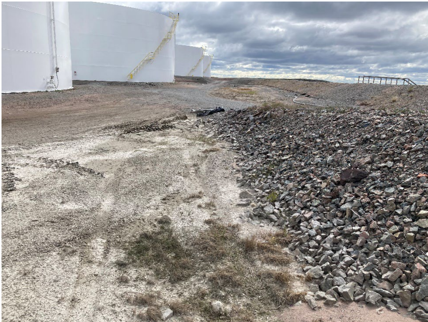
Photograph G1-2 Baker Lake Tank Farm

Description: From the south side of Tank 1, looking southeast at Tanks 1, 2, 3, and 4.