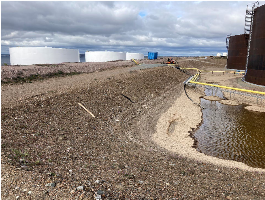
Photograph G1-15 Baker Lake Tank Farm