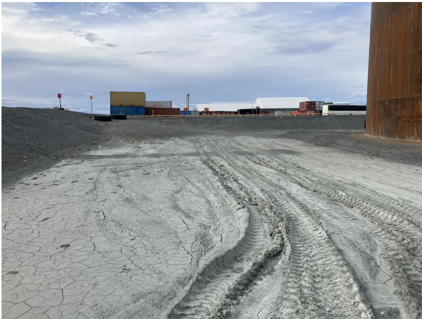
Photograph G2-4 Meadowbank Tank Farm

Description: Looking northeast from the southern corner.