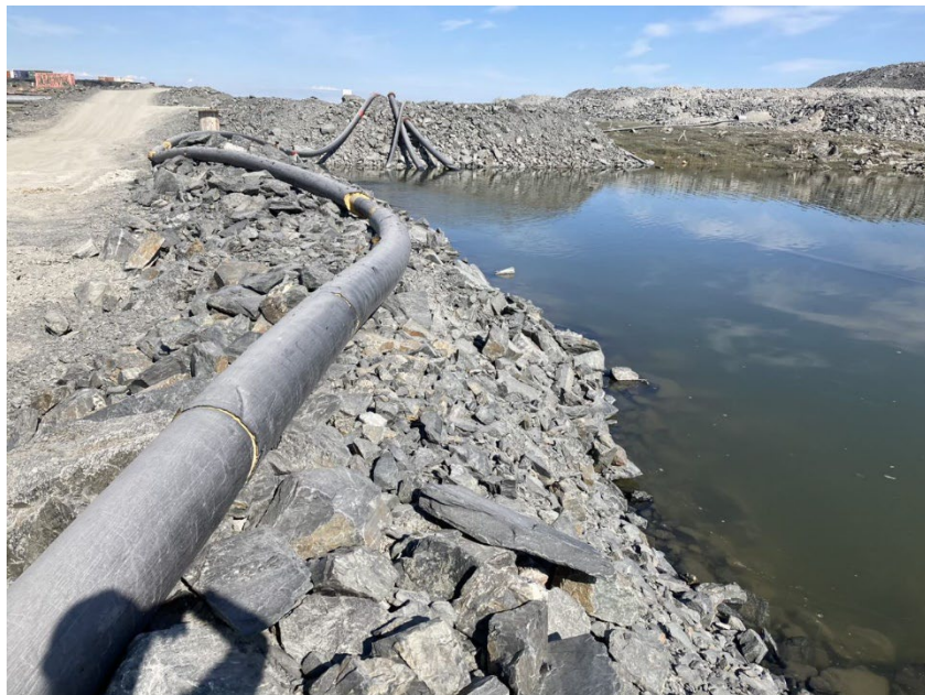
Photograph H8-3 IVR Attenuation Pond Ramp