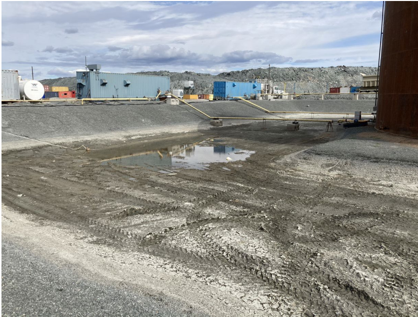
Photograph G2-5 Meadowbank Tank Farm