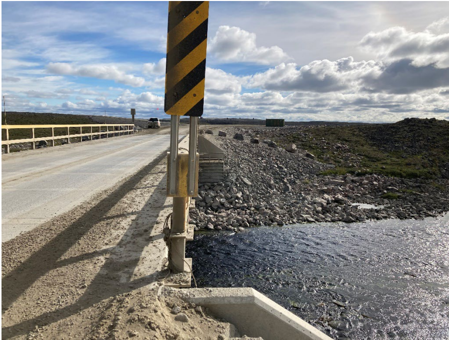
Photograph E2-15 Bridges 7 – km 148+300