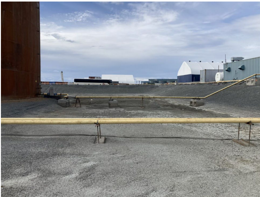
Photograph G2-6 Meadowbank Tank Farm

Description: Looking southeast from the northeastern side of the tank. Presence of water ponding.