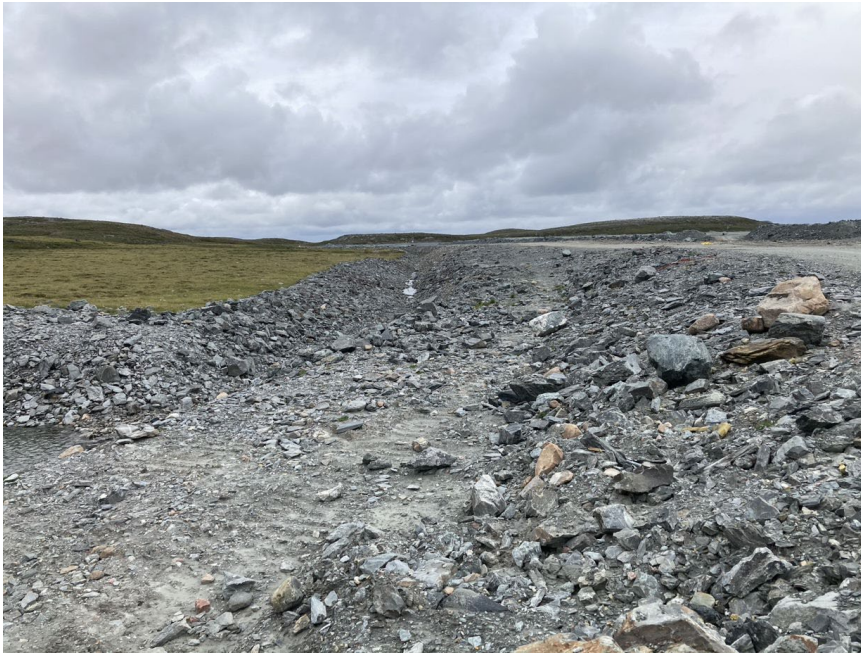
Photograph H2-15 Diversion Ditch and its Sediment and Erosion Protection Structure