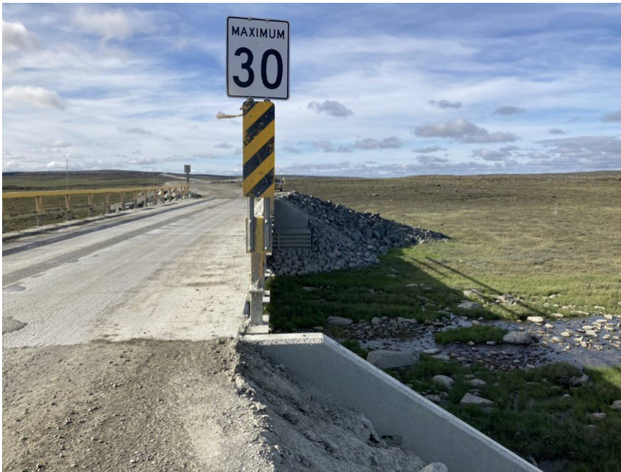
Photograph E2-19 Bridges 9 – km 160+800