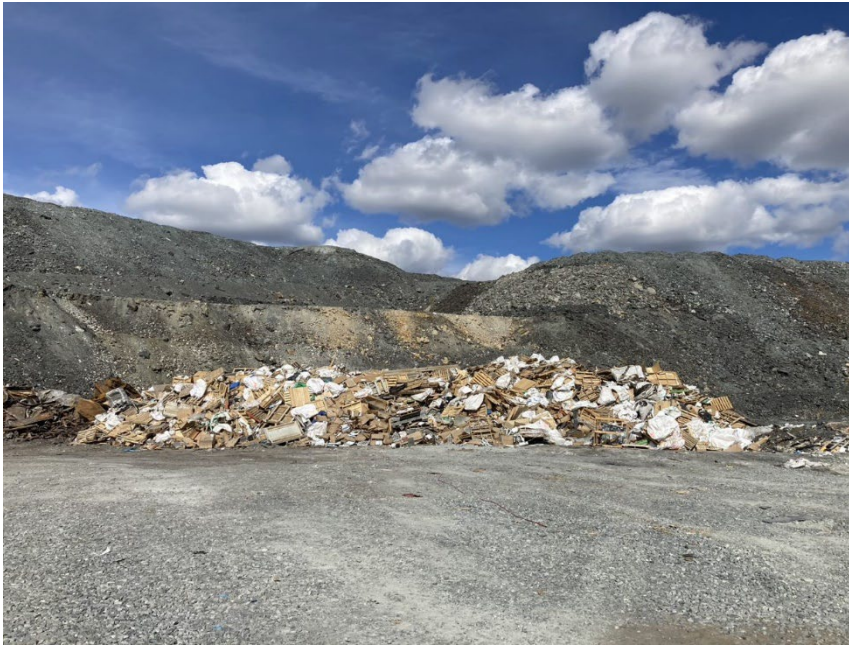
Photograph H4-1 Meadowbank Landfill