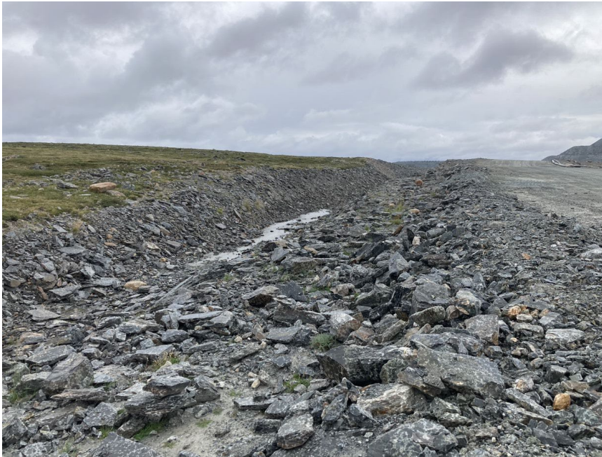
Photograph H2-17 Diversion Ditch and its Sediment and Erosion Protection Structure