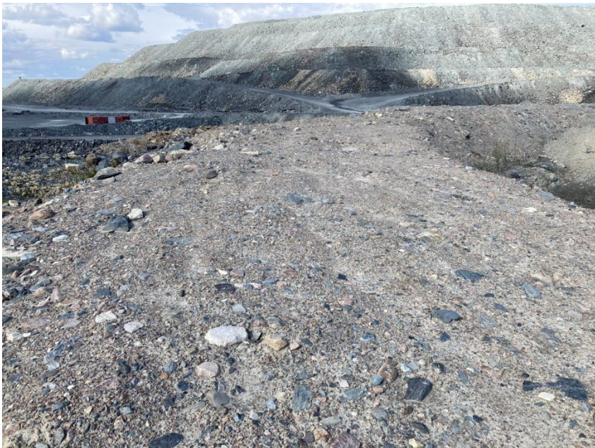
Photograph H5-2 Meadowbank Contaminated Soil Storage and Bioremedial Landfarm Facility

Description: From the eastern side of the Contaminated Soil Storage and Bioremedial Landfarm Facility, looking east at the containment berm. In good condition.