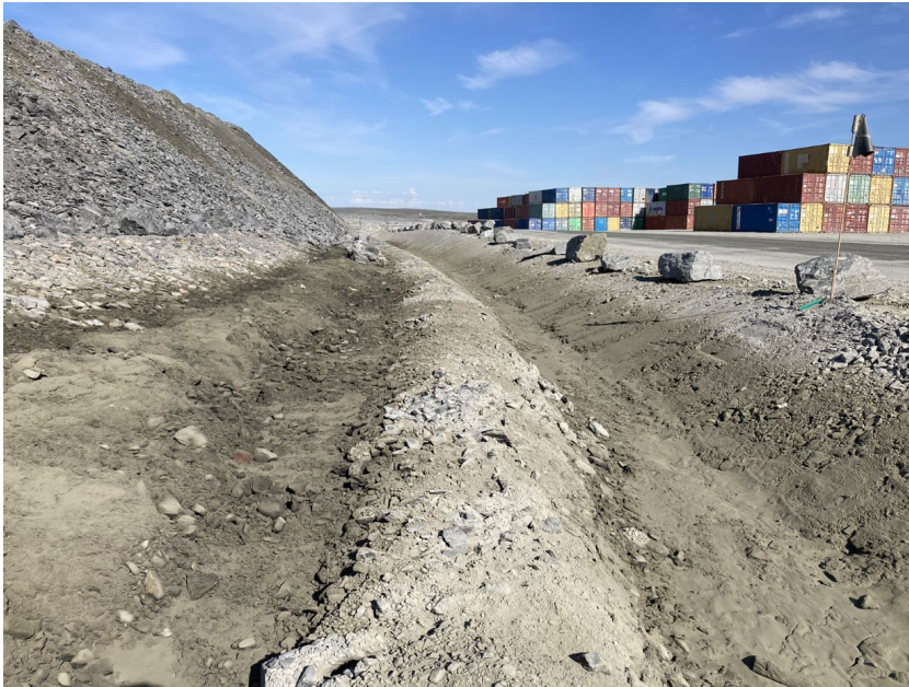
Photograph H11-3 Saline Ditch