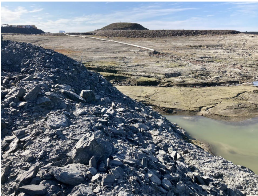
Photograph H7-4 Whale Tail Project Site Attenuation Pond Ramp

Description: From the pump pad, looking west at the Attenuation Pond.