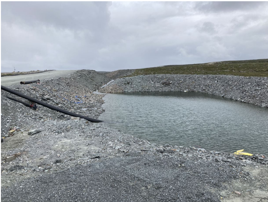
Photograph H2-16 Diversion Ditch and its Sediment and Erosion Protection Structure

Description: From 637251E/7216171N, looking north at the western diversion ditch.