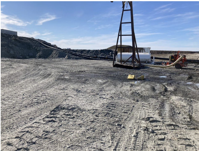
Photograph H7-2 Whale Tail Project Site Attenuation Pond Ramp

Description: From the pump pad, looking east at the ramp.