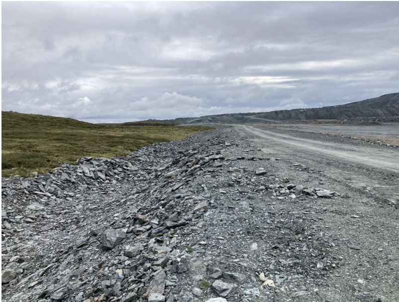
Photograph H2-11 Diversion Ditch and its Sediment and Erosion Protection Structure