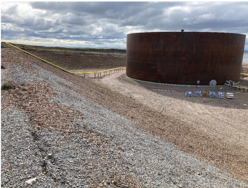
Photograph G1-16 Baker Lake Tank Farm

Description: From the southern corner of Tank 6, looking northeast at the southern side of Tanks 5 and 6. Presence of water ponding.