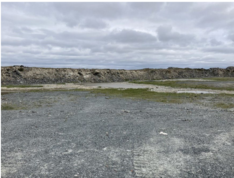
Photograph F-2: Quarry 13 – km 62+350

Description: View of north wall. Presence of loose blocks at the base of the wall.