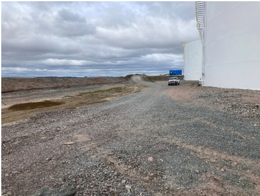
Photograph G1-4 Baker Lake Tank Farm

Description: Looking northwest toward the south wall of the tank farm.