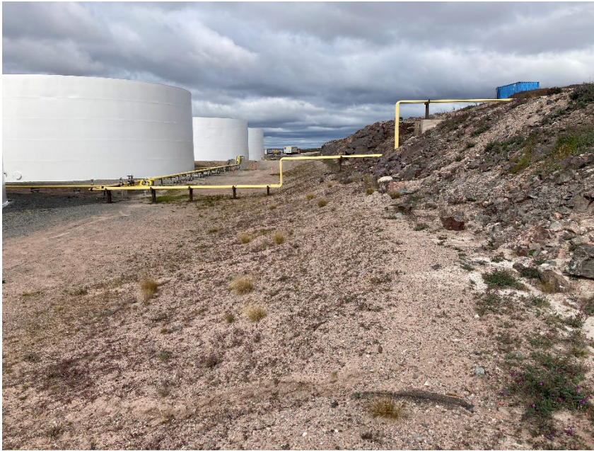
Photograph G1-11 Baker Lake Tank Farm