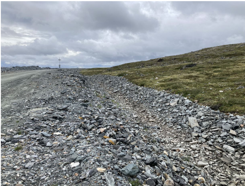
Photograph H2-14 Diversion Ditch and its Sediment and Erosion Protection Structure

Description: From 637281E/7216790N, looking north. View of the western diversion ditch.