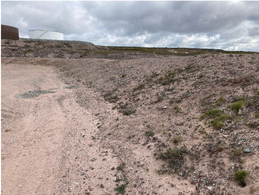
Photograph G1-9 Baker Lake Tank Farm