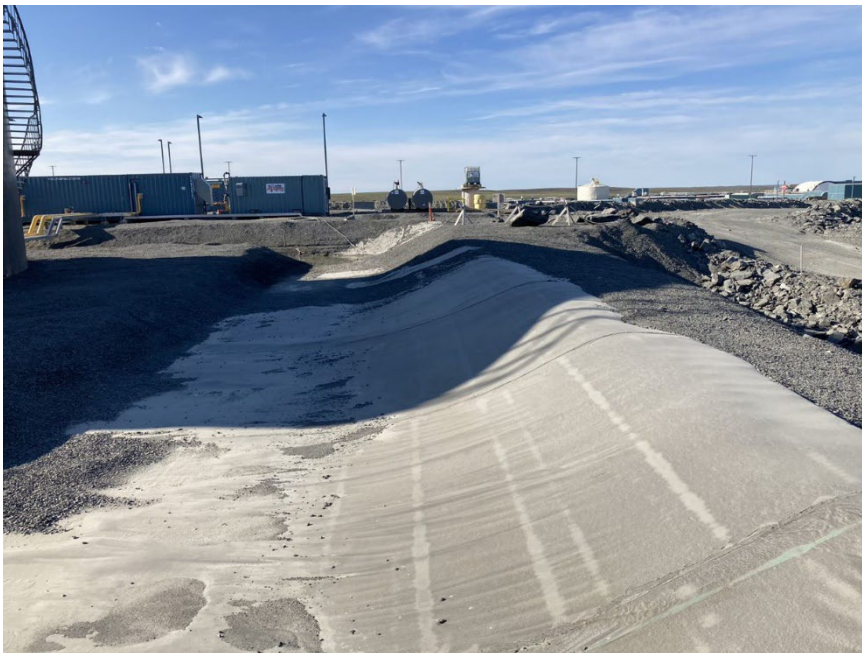
Photograph G3-4 Whale Tail Project Site Tank Farm

Description: From the northwest corner of the tank, looking east.