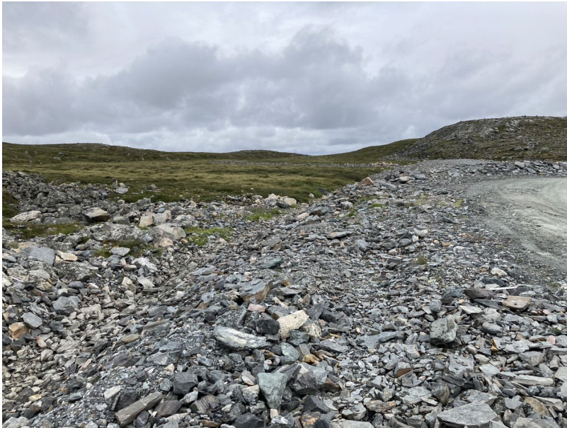
Photograph H2-13 Diversion Ditch and its Sediment and Erosion Protection Structure