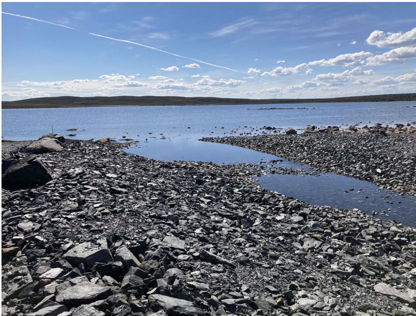
Photograph H10-8 South Whale Tail Channel

Description: From approx. Sta. 0+200, looking northwest.