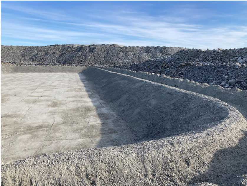
Photograph H5-3 Whale tail Project Contaminated Soil Storage and Bioremedial Landfarm Facility