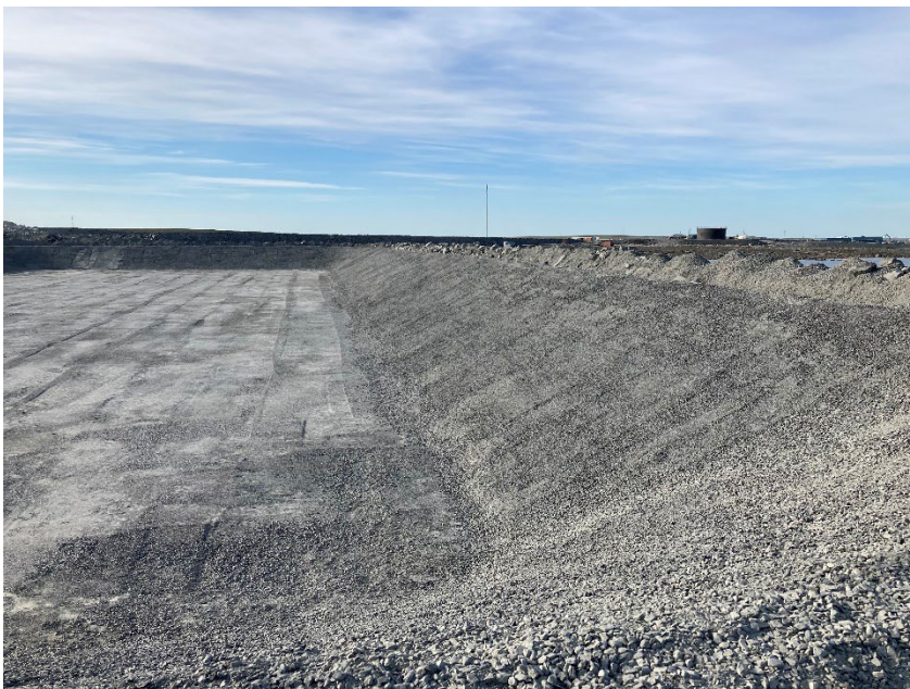
Photograph H5-4 Whale tail Project Contaminated Soil Storage and Bioremedial Landfarm Facility

Description: From the south extremity of the new Whale Tail Project facility, looking north. In good condition, not yet lined.