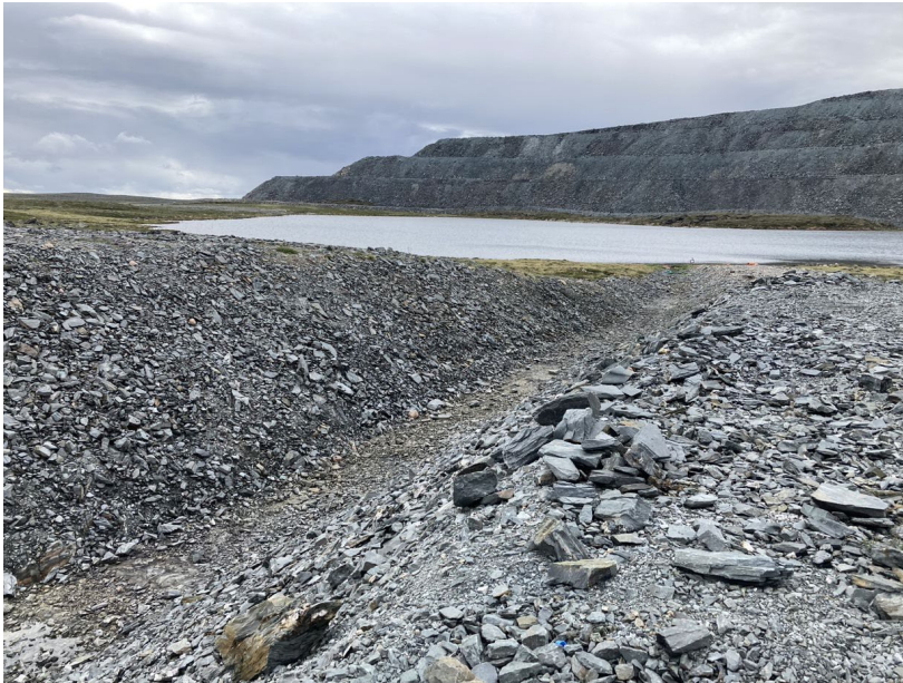
Photograph H2-3 Diversion Ditch and its Sediment and Erosion Protection Structure