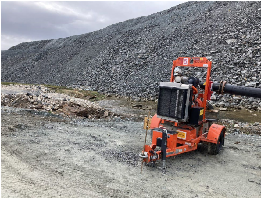
Photograph H3-3 RSF Till Plug