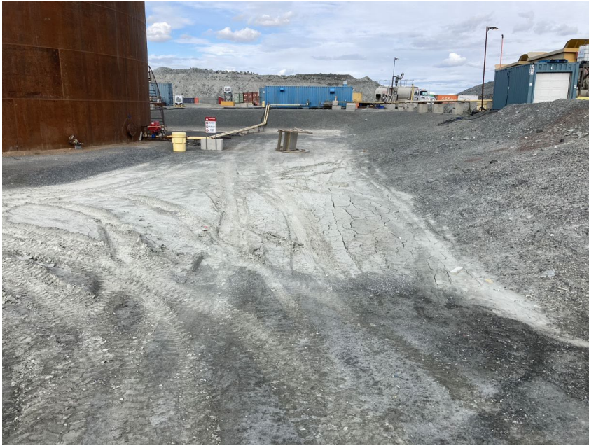
Photograph G2-3 Meadowbank Tank Farm