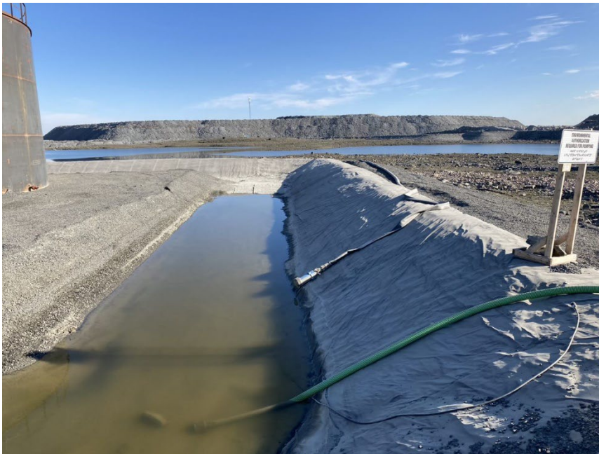
Photograph G3-2 Whale Tail Project Site Tank Farm

Description: From the fuelling pad, looking west at the Tank Farm. Presence of water ponding.