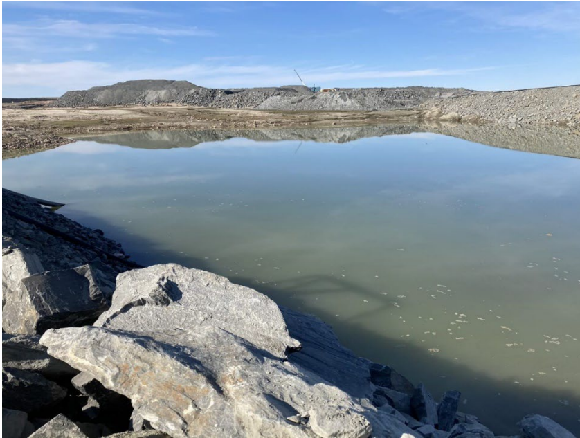
Photograph H7-3 Whale Tail Project Site Attenuation Pond Ramp