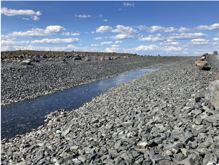
Photograph H10-5 South Whale Tail Channel