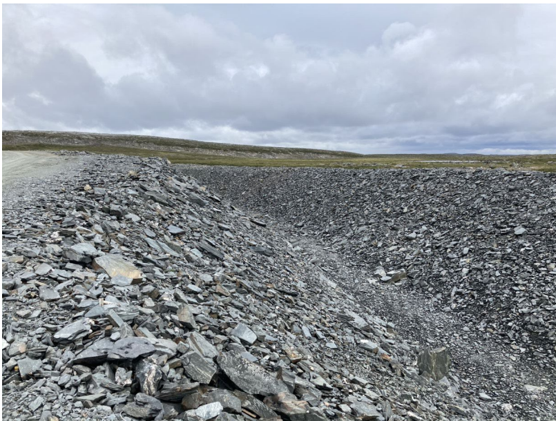
Photograph H2-6 Diversion Ditch and its Sediment and Erosion Protection Structure

Description: From the eastern diversion ditch, looking east.