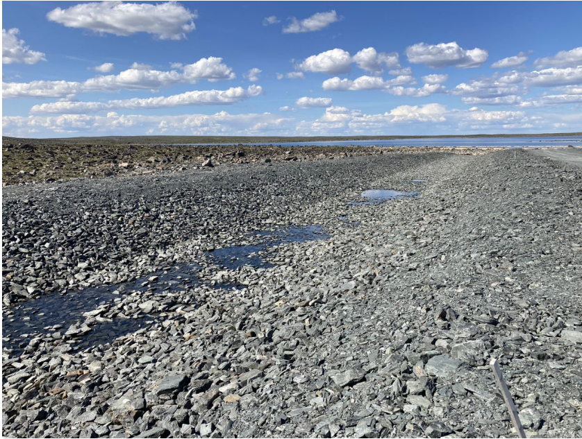
Photograph H10-3 South Whale Tail Channel