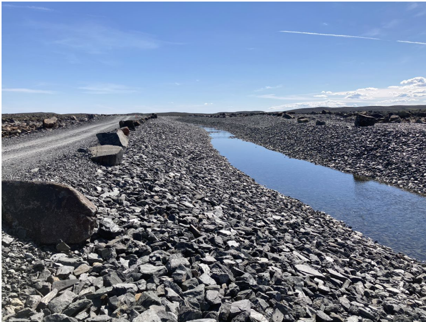
Photograph H10-6 South Whale Tail Channel

Description: From approx. Sta. 0+450 (Lake A45 area), looking northwest.