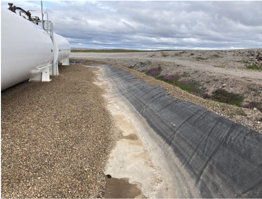
Photograph G1-23 Baker Lake Tank Farm