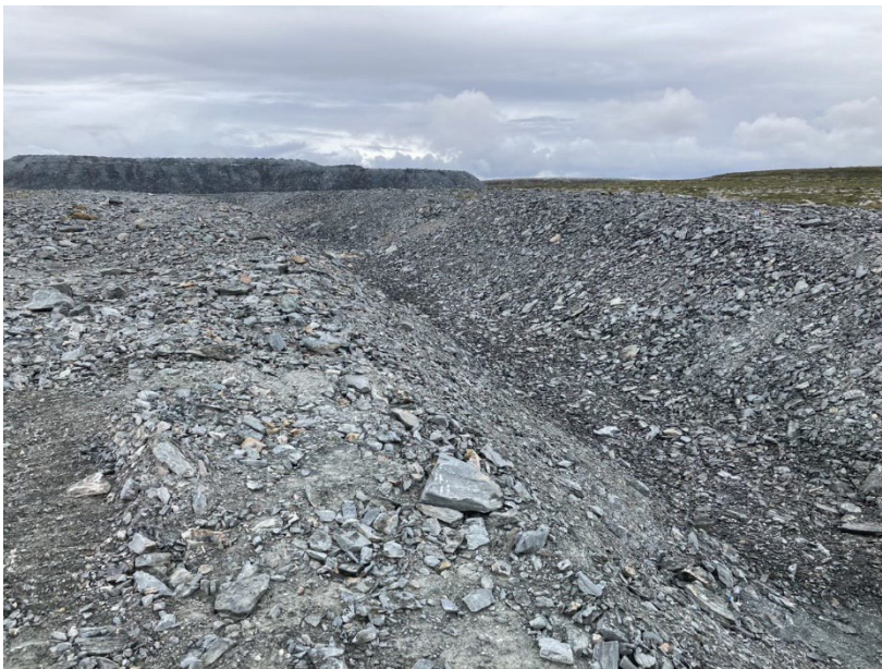
Photograph H2-2 Diversion Ditch and its Sediment and Erosion Protection Structure

Description: Looking east toward the inlet of the culverts beneath the road.