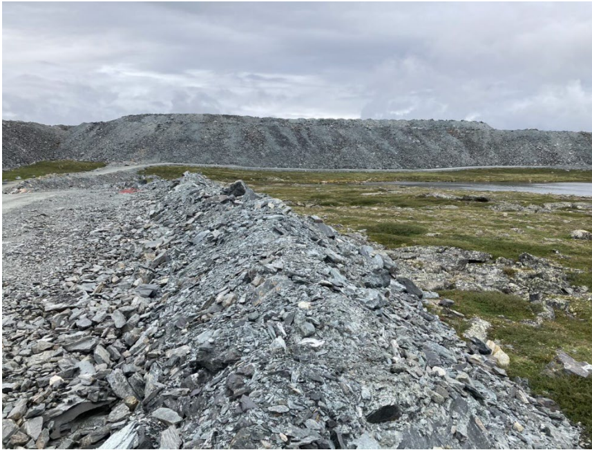
Photograph H3-1 RSF Till Plug