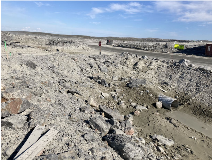
Photograph H11-1 Saline Ditch