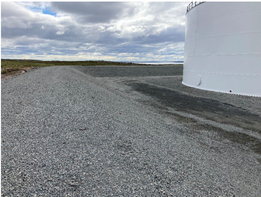
Photograph G1-18 Baker Lake Tank Farm

Description: Looking west at the crest on the northeastern side of Tank 5. Presence of old tension cracks.