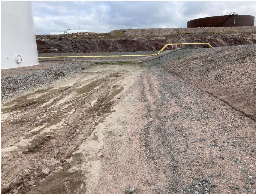
Photograph G1-3 Baker Lake Tank Farm