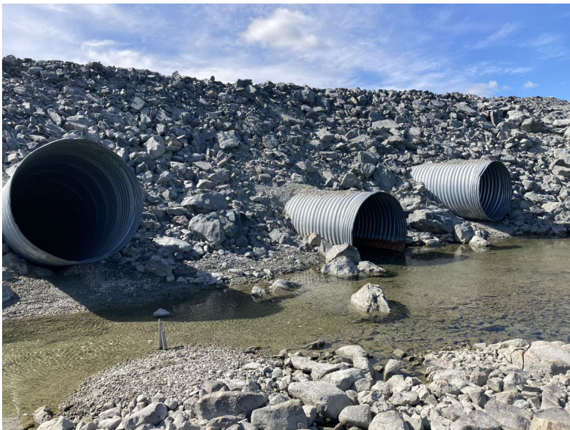
Photograph H1-2 Vault Road Culverts

Description: Looking at the outlet of the three culverts located on Vault Road at 640964E/7217466N. All of them are deformed in the middle.