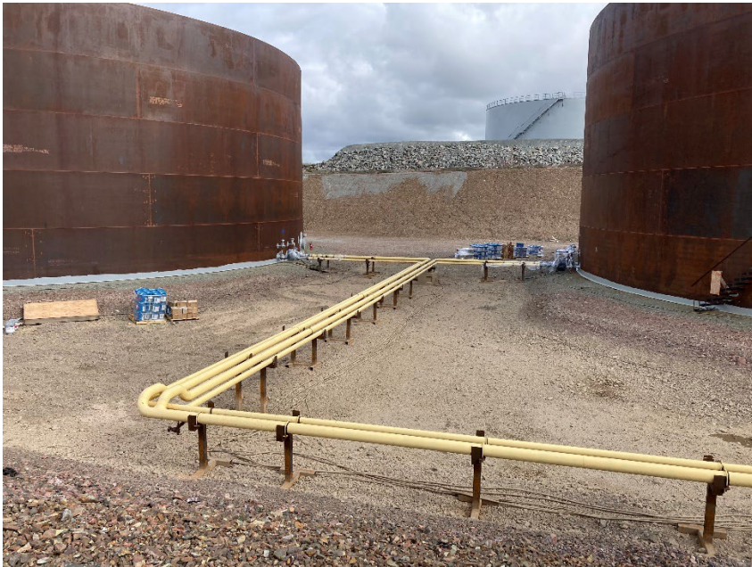
Photograph G1-14 Baker Lake Tank Farm

Description: Looking northwest at the southern and western sides of Tank 5.