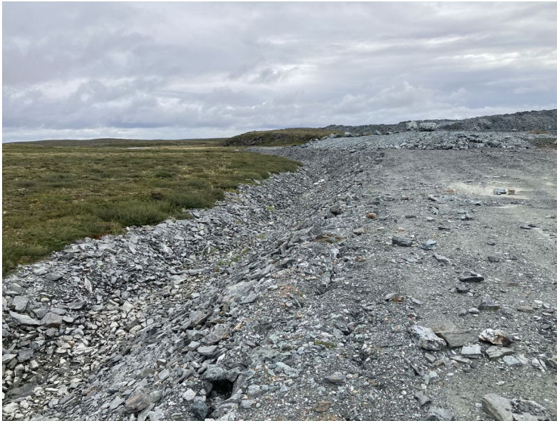
Photograph H2-9 Diversion Ditch and its Sediment and Erosion Protection Structure