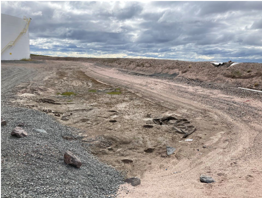
Photograph G1-6 Baker Lake Tank Farm

Description: Looking west. Presence of exposed and damaged geosynthetics in the slope.