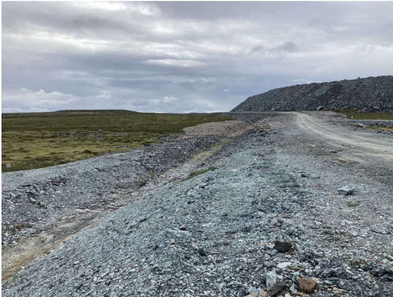
Photograph H2-5 Diversion Ditch and its Sediment and Erosion Protection Structure