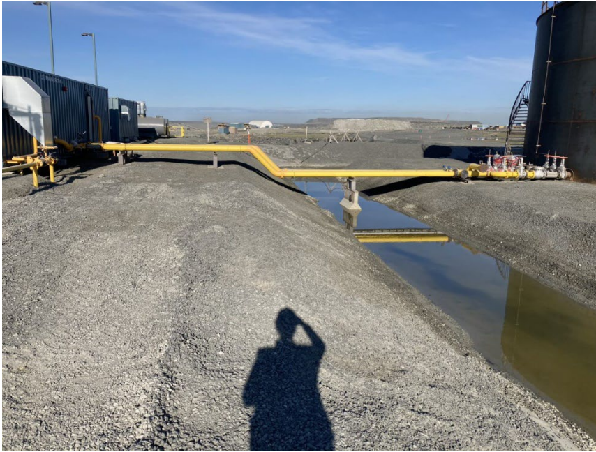
Photograph G3-1 Whale Tail Project Site Tank Farm