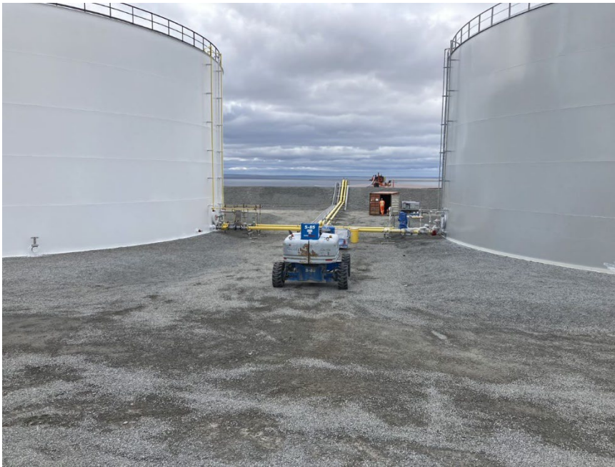
Photograph G1-19 Baker Lake Tank Farm