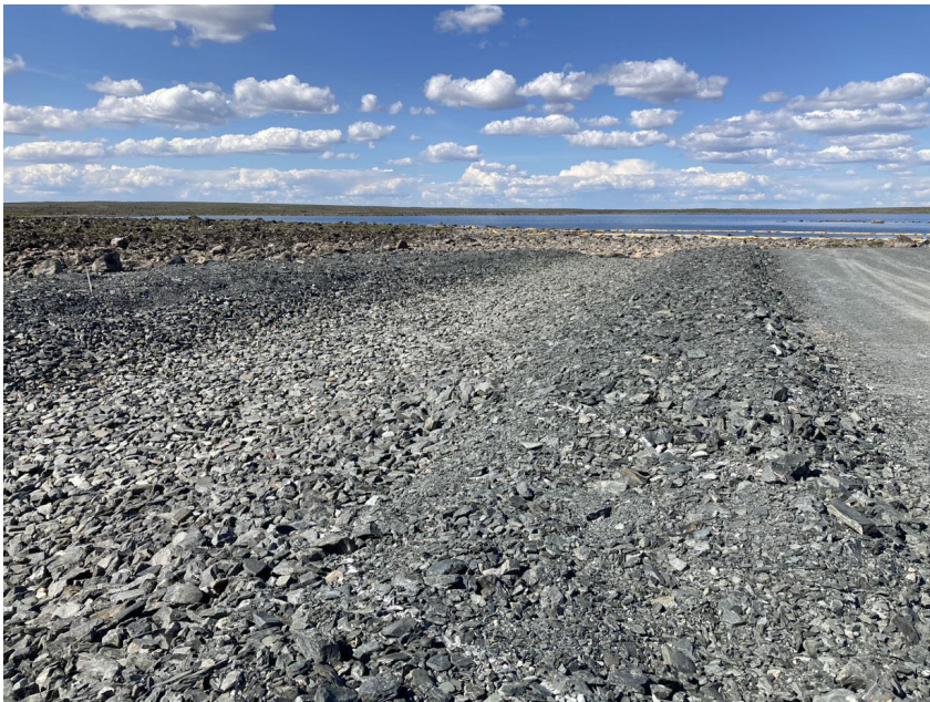
Photograph H10-2 South Whale Tail Channel

Description: From the outlet into Mammoth Lake, looking northwest. Two turbidity barriers are deployed in the lake.