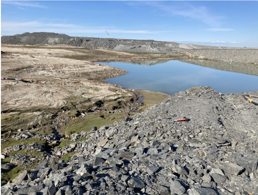
Photograph H7-5 Whale Tail Project Site Attenuation Pond Ramp