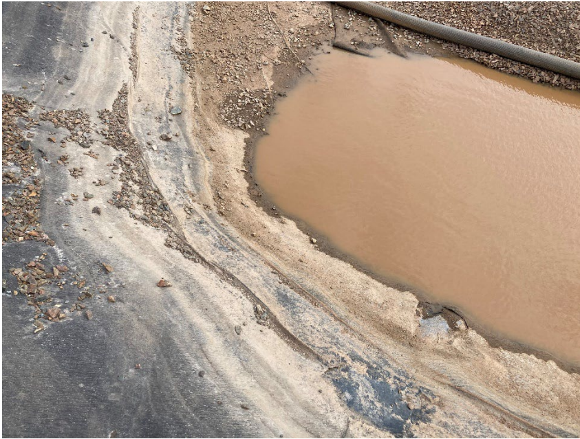
Photograph G1-21 Baker Lake Tank Farm