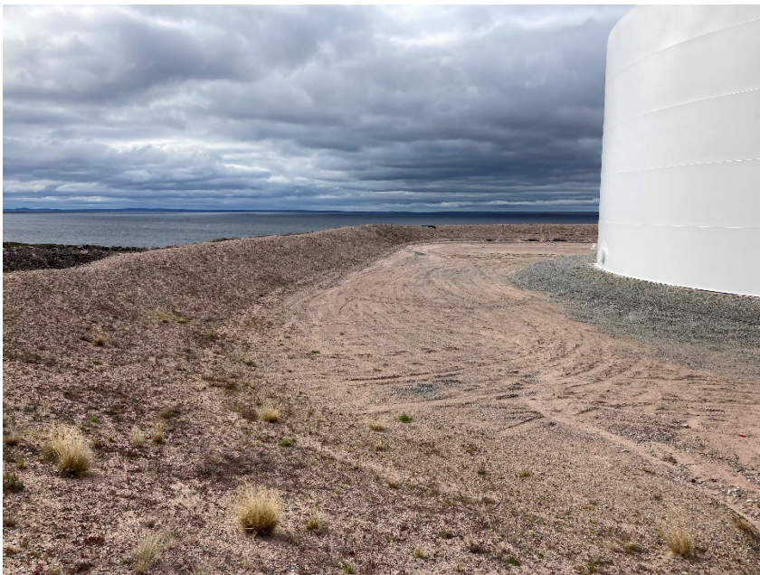
Photograph G1-10 Baker Lake Tank Farm

Description: From the south portion of the site looking northeast.