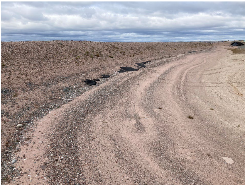
Photograph G1-8 Baker Lake Tank Farm

Description: From the southwestern corner of Tank 3 looking southeast. View of exposed geosynthetics.