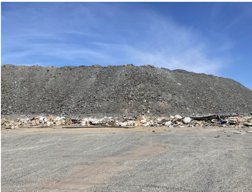
Photograph H4-2 Whale Tail Project Landfill

Description: From the 2020 landfill location within the Rock Storage Facility, looking southeast.