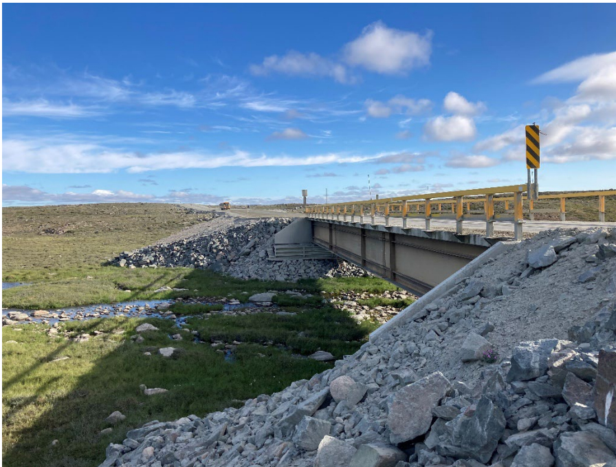
Photograph E2-18 Bridges 9 – km 160+800

Description: Looking at the south abutment.