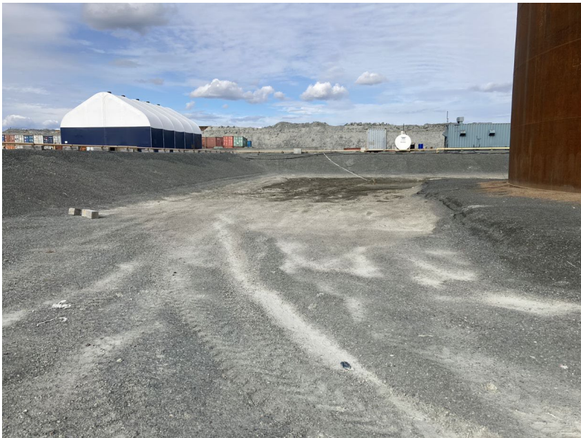
Photograph G2-2 Meadowbank Tank Farm

Description: From the western corner, looking southeast.