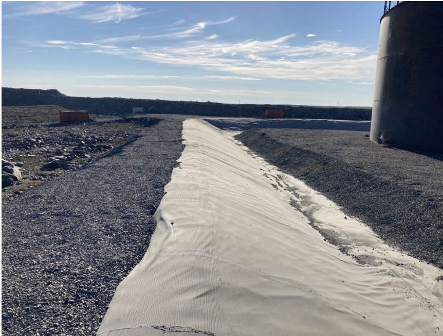
Photograph G3-3 Whale Tail Project Site Tank Farm