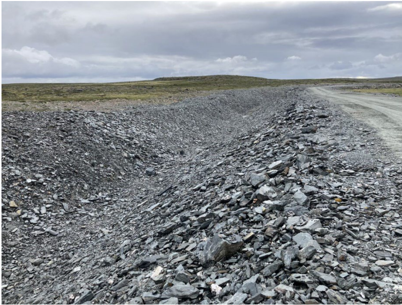
Photograph H2-7 Diversion Ditch and its Sediment and Erosion Protection Structure