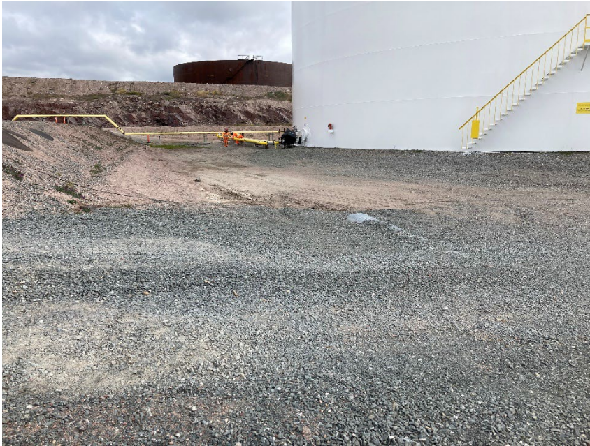
Photograph G1-7 Baker Lake Tank Farm