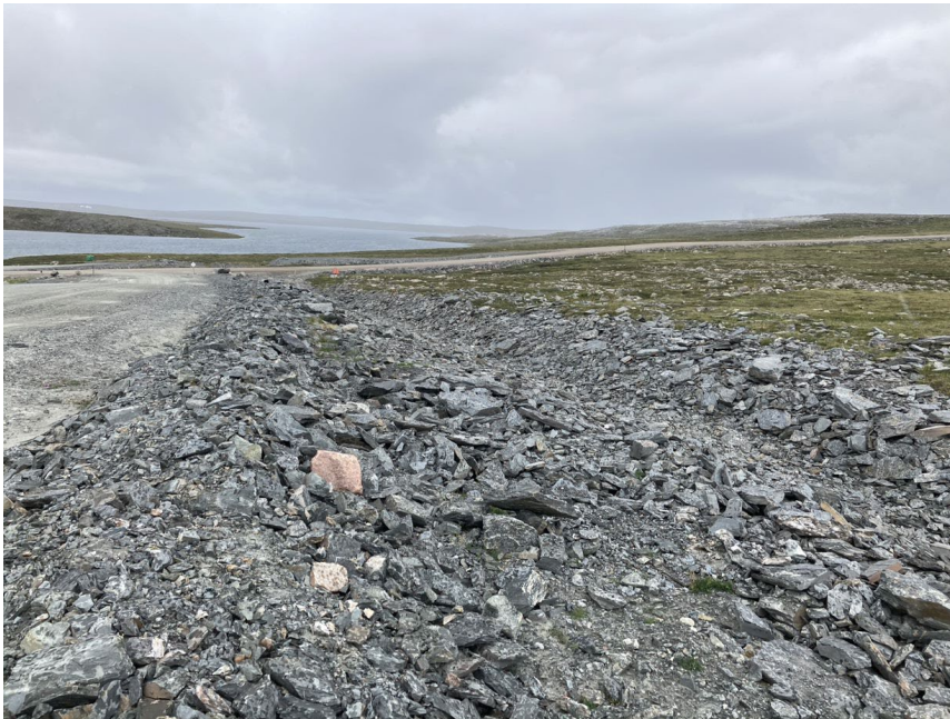
Photograph H2-18 Diversion Ditch and its Sediment and Erosion Protection Structure

Description: From 637074E/7216157N, looking east at the western diversion ditch.