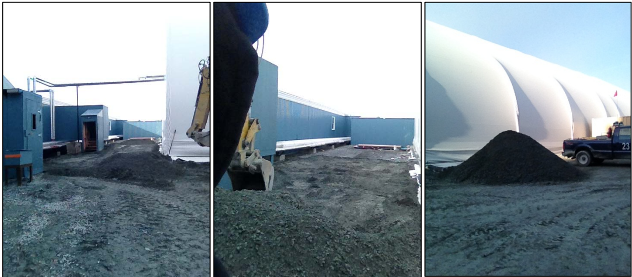
Photos 2, 3, 4 – Clean-up and contaminated soil excavation, September 19 th 2015

There were no off site impact or discharge to any receiving watercourses.