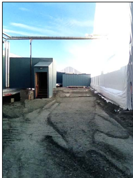
Photo 5 - Area after clean-up action, September 19 th 2015