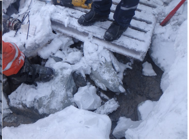
Area of broken line