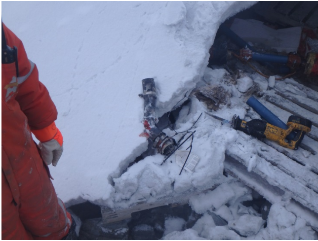
Broken fitting and pipe

The fitting on the line broke because external pressure was being added to the pipe by snow being pushed over from the iron pad towards the discharge line. The sewage was thus discharge closer to the road. This created a change in the path of the flow, resulting in water being observed on the north side.