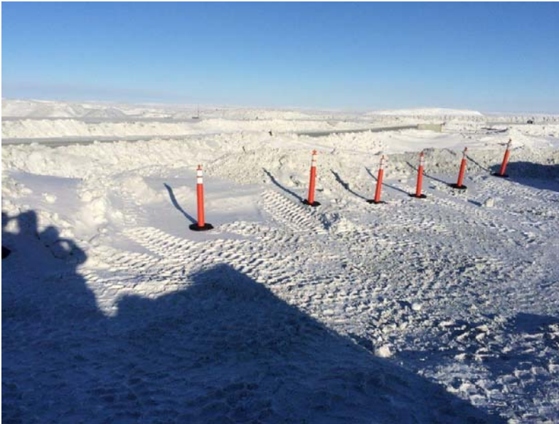
Side blocked for snow

The area was inspected after the repair and no evidence of seeping was found on the north side.