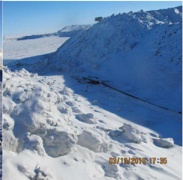
Repaired and extended discharge pipe