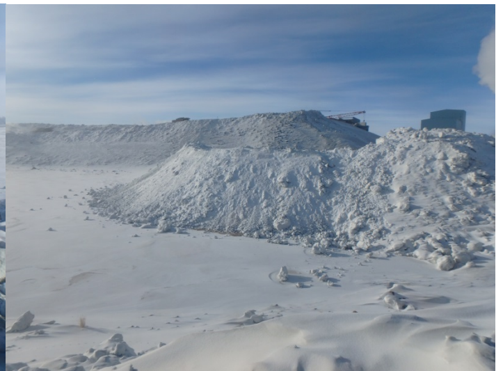
Snow bank on Stormwater pond