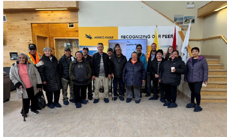
Image C.9: Group photo with the HTO and Baker Lake KEAC Elders at Meadowbank site visit (September 2024)