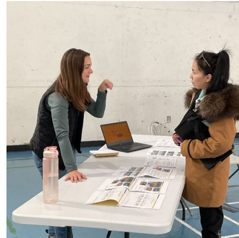
Image C.13: A community member discussing with Agnico Eagle staff about Meadowbank closure during an October 2024 Open House in Chesterfield Inlet