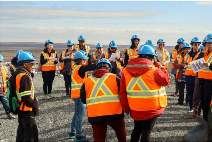
Image C.3: Site Visit Closure Engagement with Baker Lake General Public at Meadowbank (September 2024)