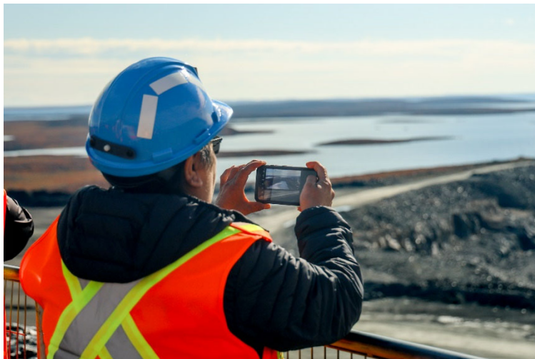
Image C.10: Community member taking a photo of Portage Pit A during the environmental closure consultation at the Meadowbank Public site visit (September 2024)