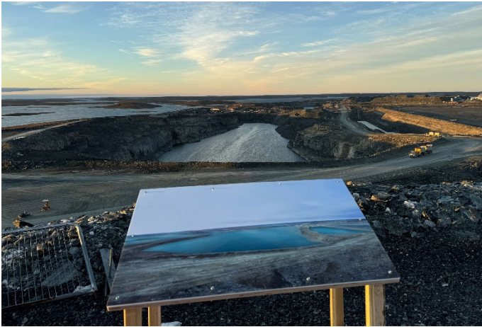
Image C.1: Displayed Conceptual Closure Design of Open Pit at WRSF Viewpoint (September 2024)