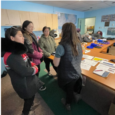
Image C.12: Three Naujaat high school students discussing with Agnico Eagle staff about Meadowbank closure during an October 2024 Open House in Naujaat