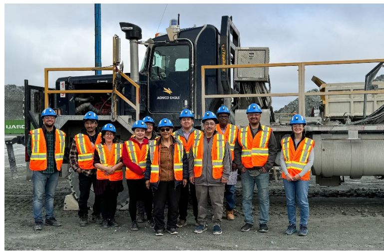
Image C.11: Group photo with the Baker Lake Hamlet Council, Staff, Mayor and MLA at the Meadowbank site visit (September 2024)