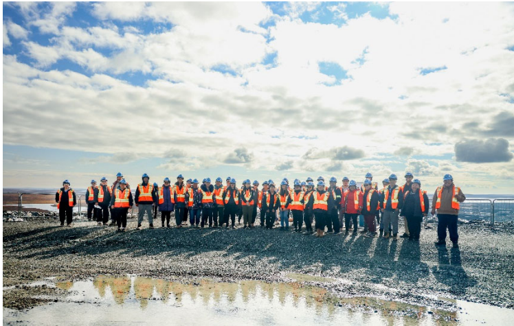
Image C.8: Group photo from the Public Site Visit at Meadowbank (September 2024)