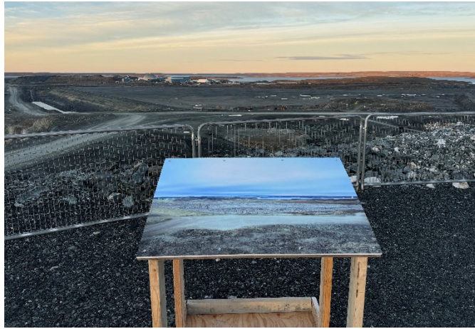
Image C.2: Displayed Conceptual Closure Design of Tailings Storage Facility at WRSF Viewpoint (September 2024)