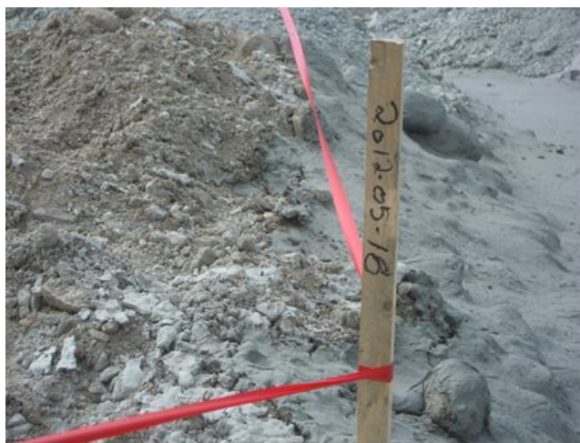
Figure 2- Identification from a reported spill

Once marked off with flagging tape, the contaminated soil needs to be identified. The easiest way to do so is to use the date of the reported spill as the name for the location and also for the samples. If the material comes from an unknown place or from an unreported spill, an appropriate identification must be given (i.e.: Maintenance green tank) (See pictures #2 and 3)