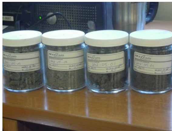
Figure 4- identification of the samples

Once stored and identified, the soil now needs to be sampled for analyses. To do so, we need to send four 250 ml glass bottles with aluminum paper in the cover and ask the lab to do a composite. Each bottle will also be a composite sample (Take soil from different spots, put it in a plastic bag, mix it and then put it in the bottle). All four samples will be identified with the same name as the soil location, the date of the spill for reported spill and an appropriate identification for unreported spill (See picture #4 and 5).