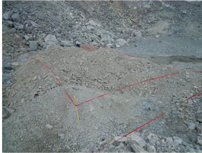
Figure 5- Sampling