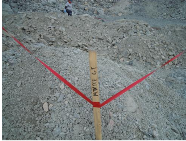
Figure 3- Identification from an unreported spill (MNTCE G T for maintenance green tank)