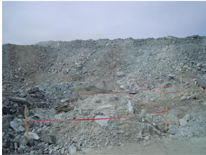
Figure 1 – soil marked separately for each spill

with different contaminant or concentration mix. (See picture #1)