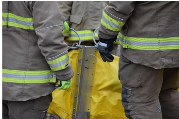
Photo 2&3: Teaching Intertek how to properly connect marine booms together and best route for deployment