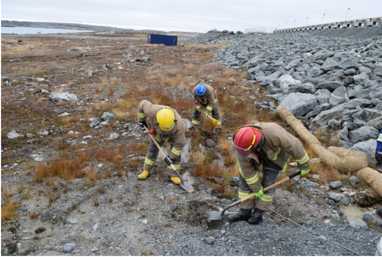
Photo 5: ERT attempting to build trench (surrounding terrain is bedrock)