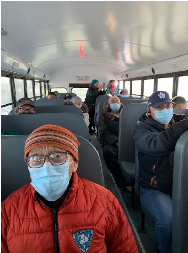
Figure 1 Trip to Meliadine Mine

The follow up second in-person meeting was November November 1-5, 2021. The agenda topics were to review the draft Terms of Reference, honorarium payments, election of committee of Chair and Vice Chair. We also organized a Meliadine site visit with the permission of the Chief Public Health Officer of Nunavut. Finally, our Agnico Eagle adult educator gave an excellent presentation to the Elders on the training opportunities. This presentation was the highlight of the meeting, according to the committee members. As such, the Elders requested that a standard agenda topic at every meeting must include training updates for Inuit.