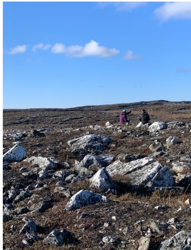
Figure 2 Trip to Upper Amer Lake with Elder Philippa