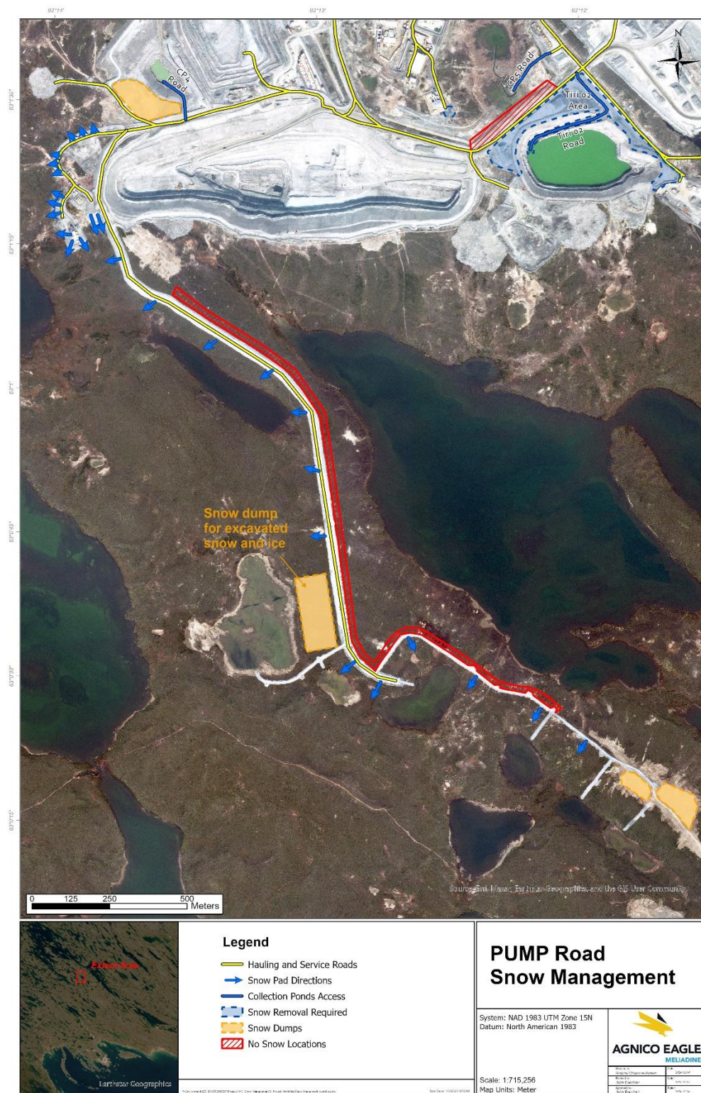
Figure 5: Pump Area Snow Management for Existing Conditions