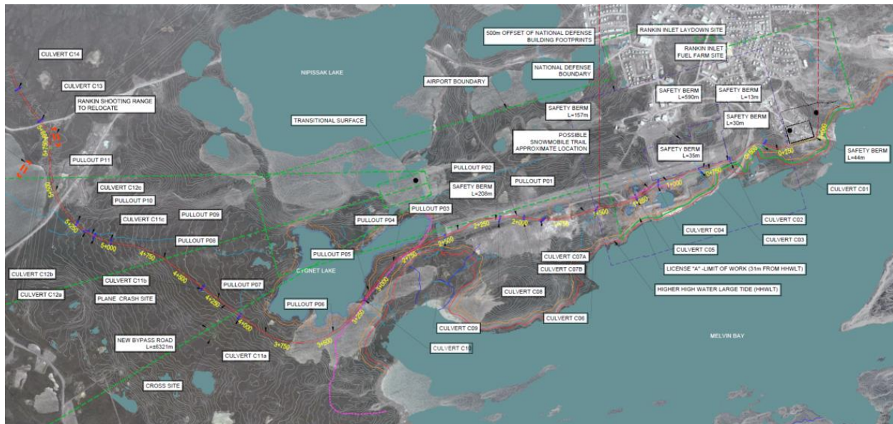
Figure 3: Bypass Road and Culvert Location