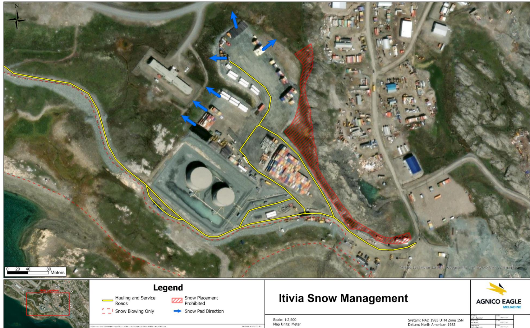
Figure 6: Itivia Snow Management Areas