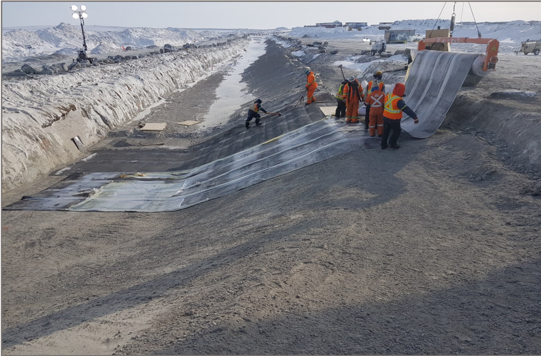
Photo 19: Deploying Phase 1 liner (within the key trench) from Station 0+522 to 0+532 View from Station 0+545 facing down chainage