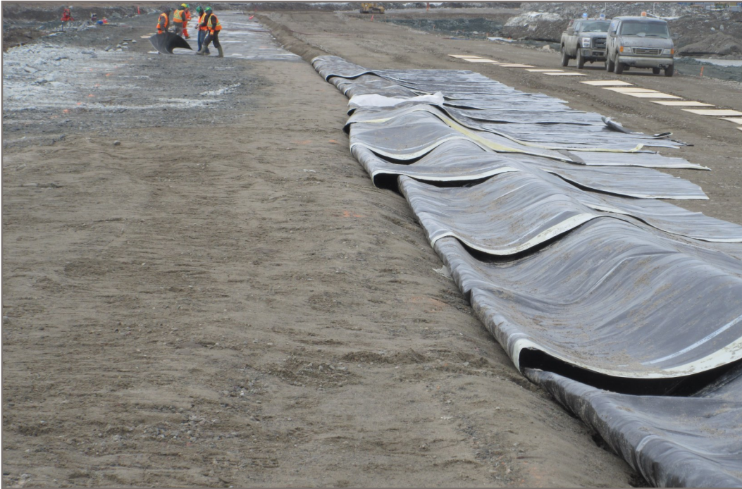
Photo 21: Previously placed Phase 2 liner that was welded to Elev. 66 m being flipped to finalise the construction of downstream material to final elevation View from Station 1+490 facing down chainage