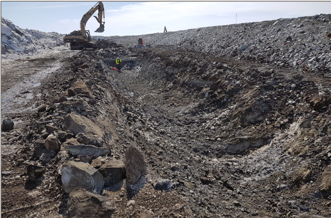
Photo 24: Mucked out north water collection channel View from Station 4+050 facing up chainage