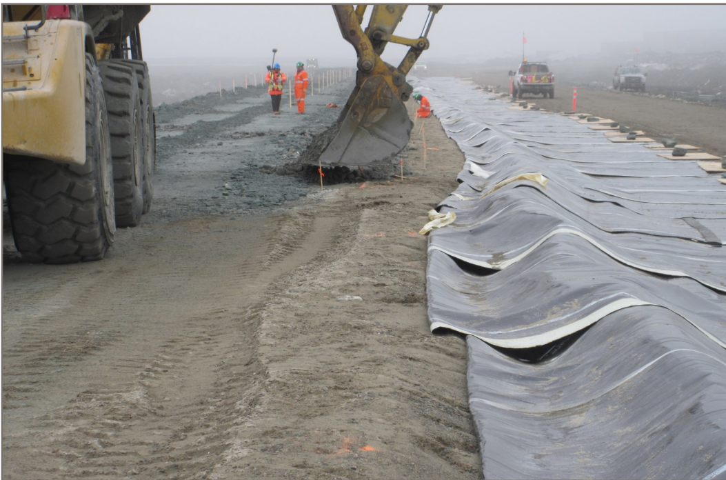
Photo 22: Placing downstream materials (Types A1, B and C) to final elevation for liner panels to be flipped back and placed on it and welded to top. View from Station 1+500 facing down chainage