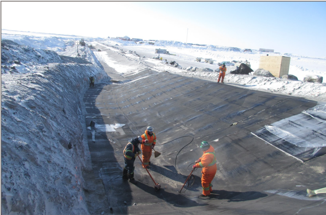
Photo 20: Looking at Phase 1 liner placed between Station 0+545 and 0+585 View from Station 0+585 facing down chainage