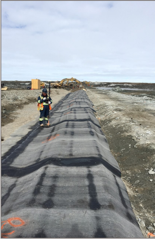
Photo 21: Completed Phase 2 liner View from 1+050 facing up chainage