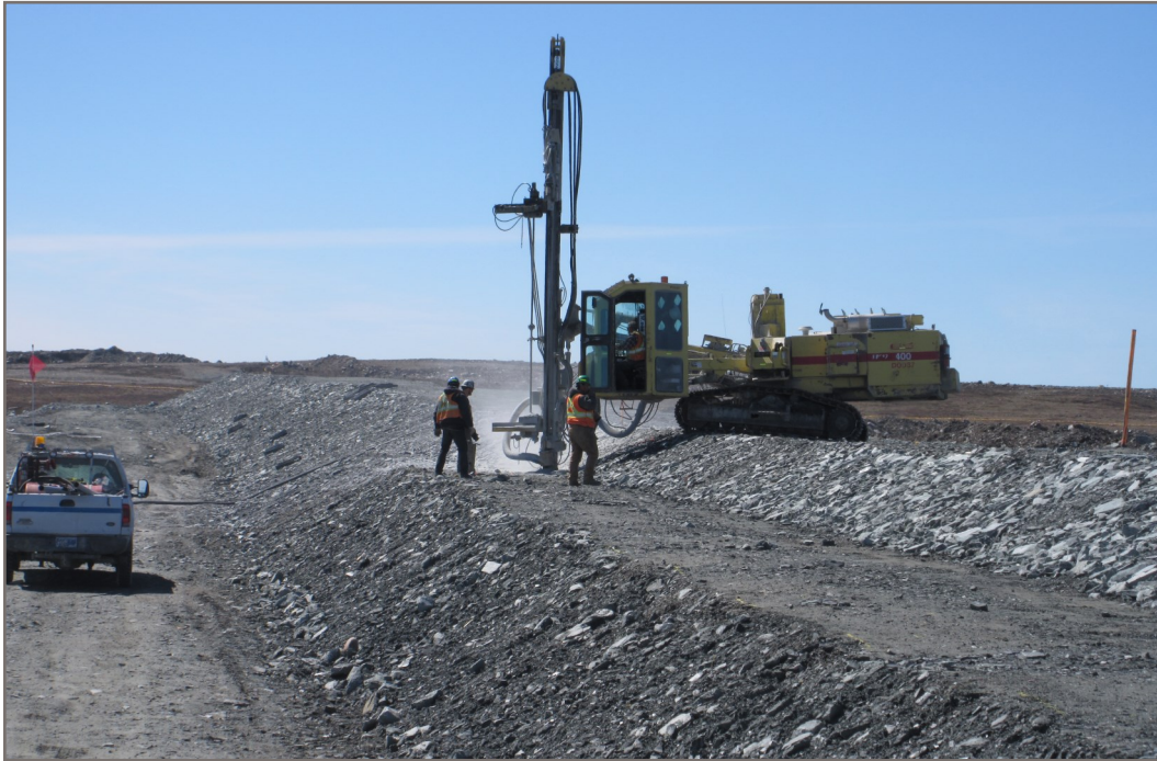
Photo 25: Drilling hole to install VGTC-3 View from Station 1+195 facing down chainage