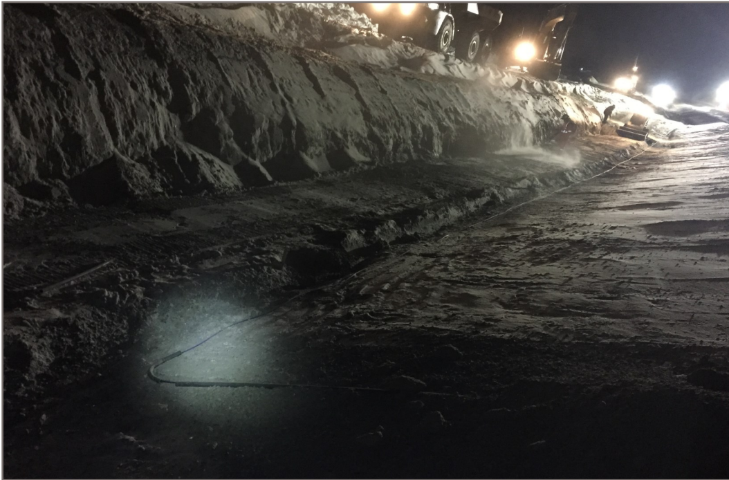
Photo 24: PVC pipe housing HGTC-2 lying on first lift of Type C material over bottom liner View from Station 0+298 facing down chainage