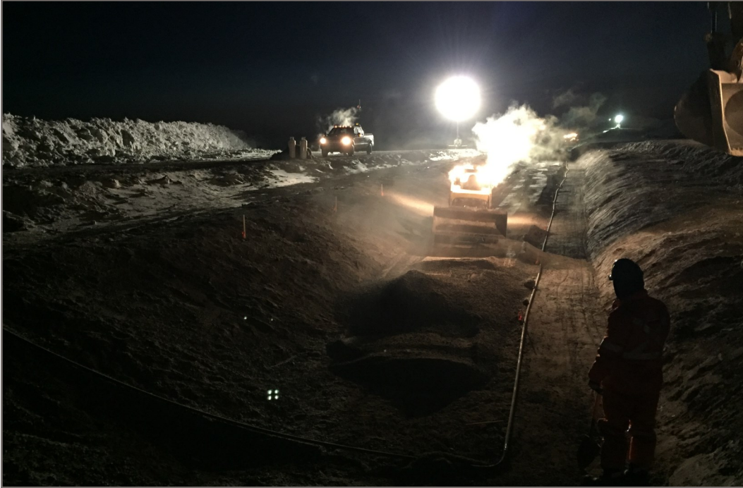
Photo 23: PVC Pipe housing HGTC-1 lying on first lift of Type C material over bottom liner View from Station 0+004 facing up chainage)