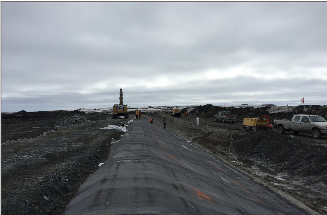
Photo 22: Phase 2 liner placement View from Station 1+100 facing down chainage