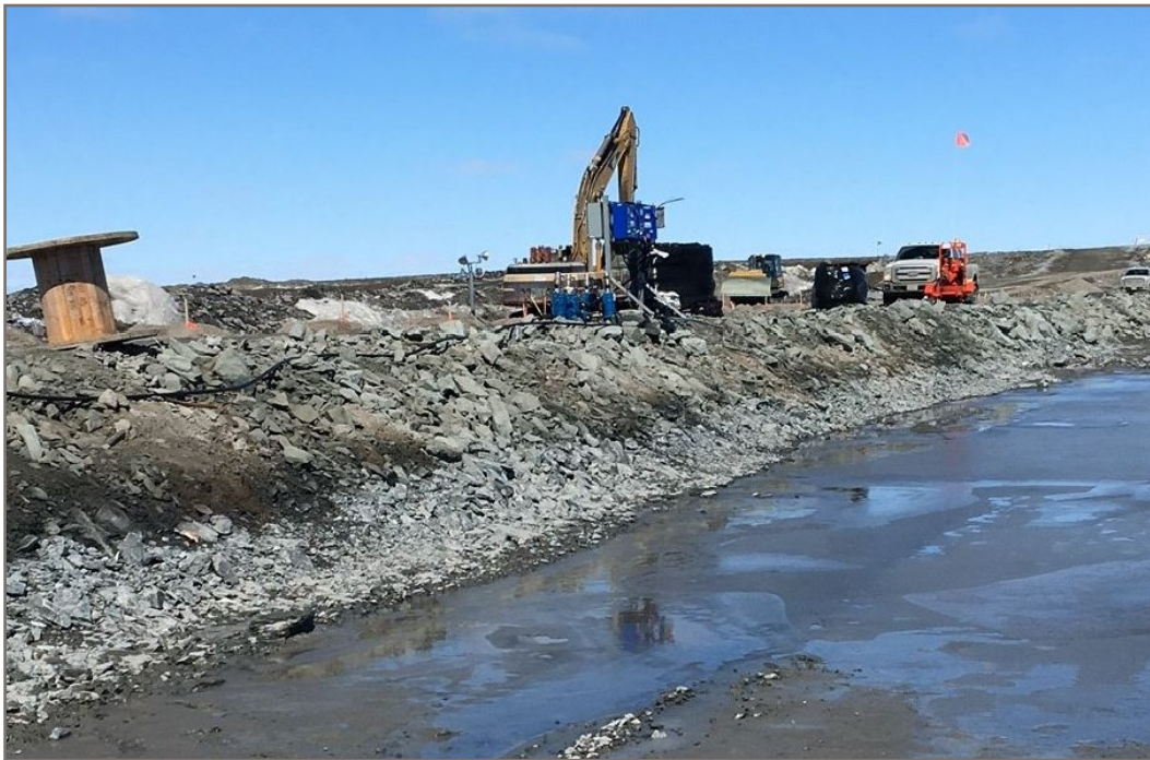
Photo 44: Downstream toe on May 16, 2017 with high water line down following pumping View from Station 1+100 facing up chainage