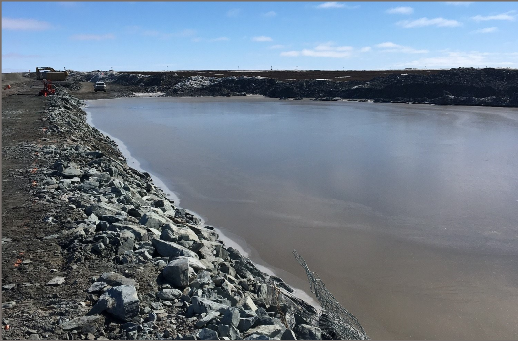
Photo 43: Ponding water downstream, morning of May 15, 2017 View from Station 1+090 facing up chainage