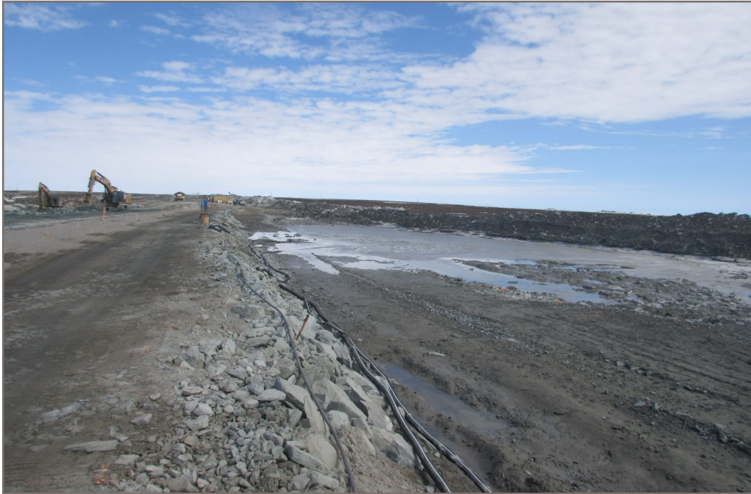
Photo 45: Downstream side of dike on May 18, 2018 showing low water level