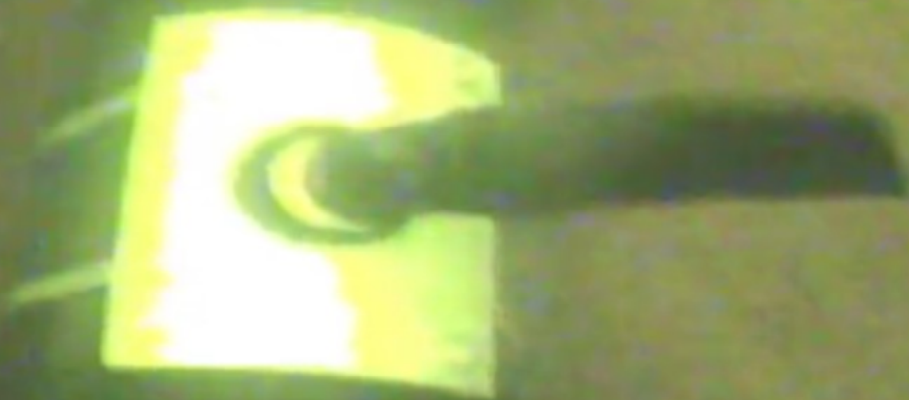
View of a Tideflex Valve following Underwater Installation