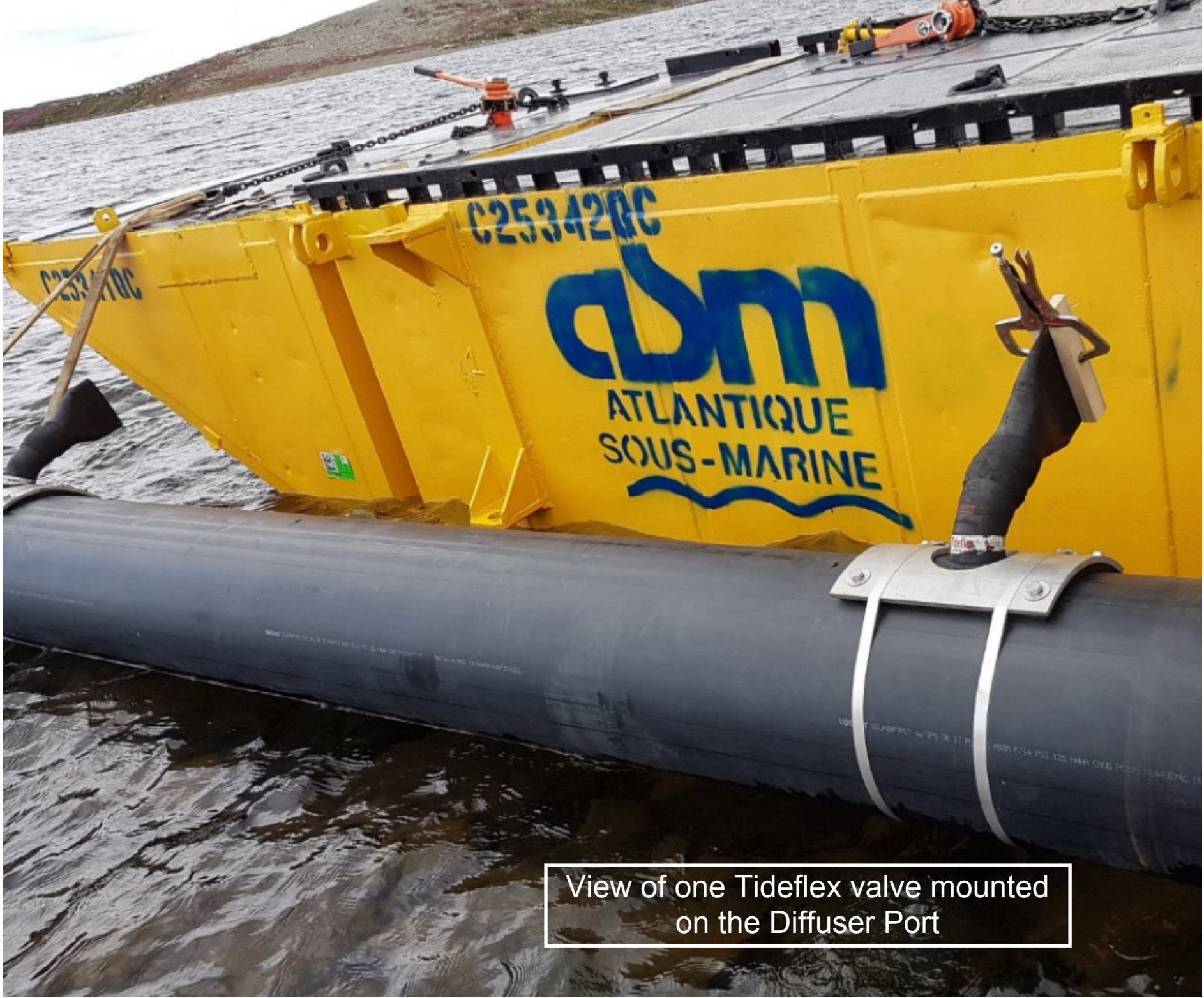
View of one Tideflex valve mounted on the Diffuser Port