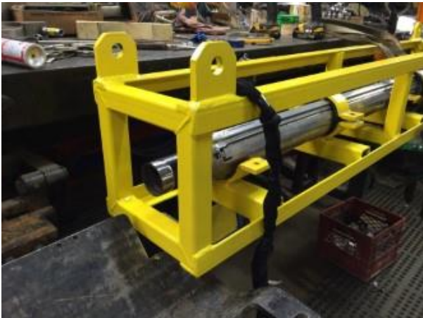
Figure 1. Water intake pipe

On November 15, 2016, a temporary freshwater intake was installed in Meliadine Lake (Figure 1) at GPS Coordinates 15V 6990697N 539457E. The intake pump is located 57.59 m away from shore and in 7.5 m of water at the location where the permanent water intake will be located. Water will be used for domestic camp use and construction prior to construction of the permanent water intake in 2018. Commissioning of the temporary water intake will be done in February 2017.