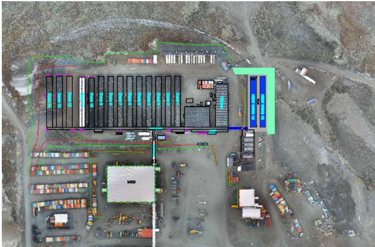
Figure 2. Tentative Location of the Temporary Wings – Zoomed Out View with Camp Site