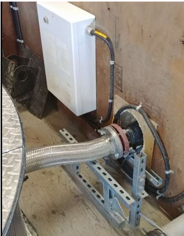
Figure 1: Newly installed flexible hose.

Daily inspections were conducted at the lift station prior to receiving new parts to be installed. New flexible piping has been installed to prevent re-occurrence. Figures 1 and 2 show the flexible pipe installed and insulation of the piping that continues outside, respectively.