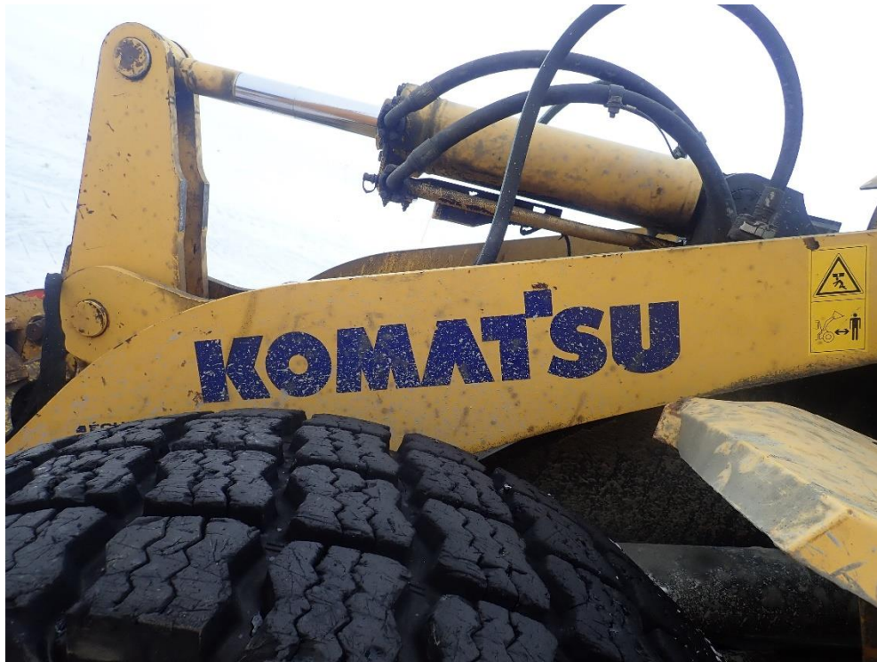
Figure 2: Failed hydraulic seal on Orbit Loader