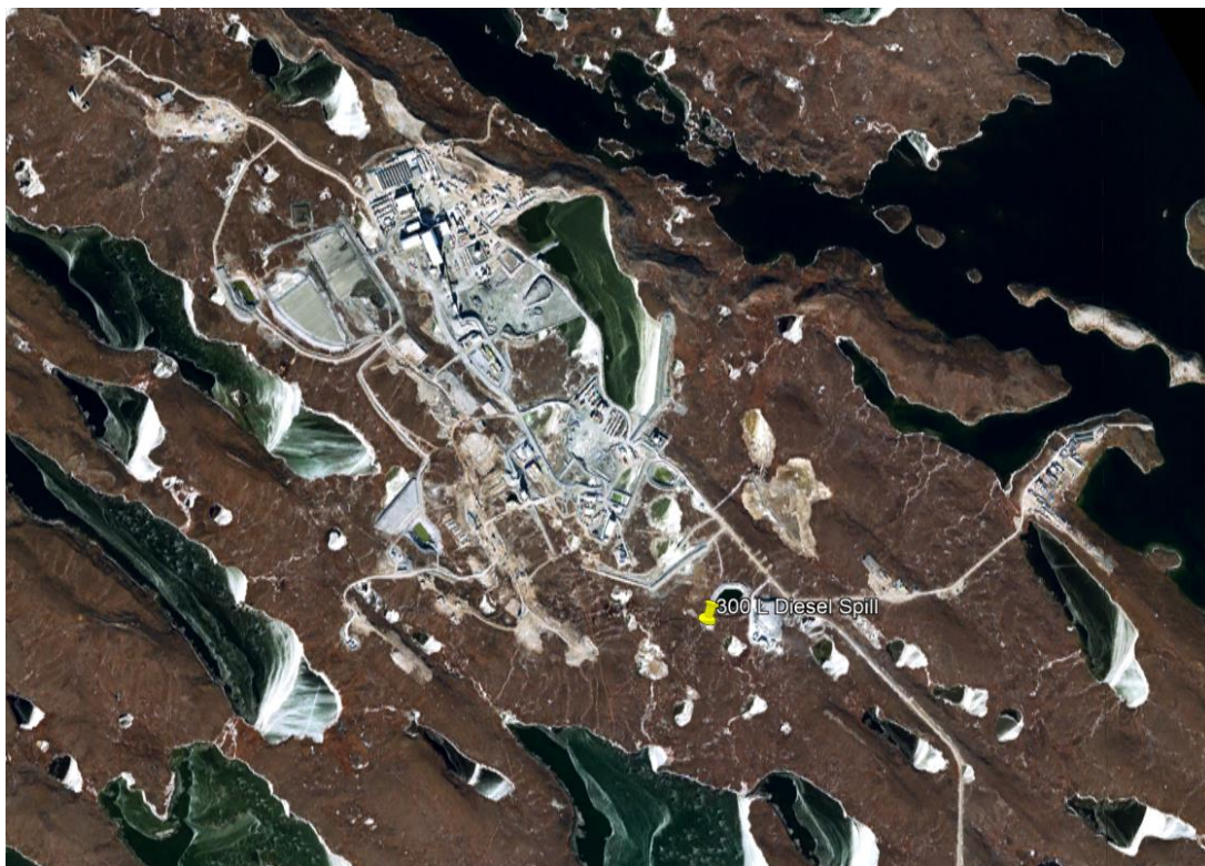
Figure 1: Location of 300 L diesel spill in Tiriganiaq II open pit.

No water body was impacted by this spill. The closest water body is approximately 550 m away. The coordinates of the spill are 63° 1'18.00"N, 92°12'7.00"W (Figure 1).