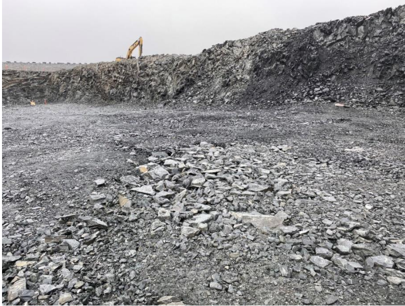
Figure 2: Spill location following removal of hydrocarbon contaminated material.