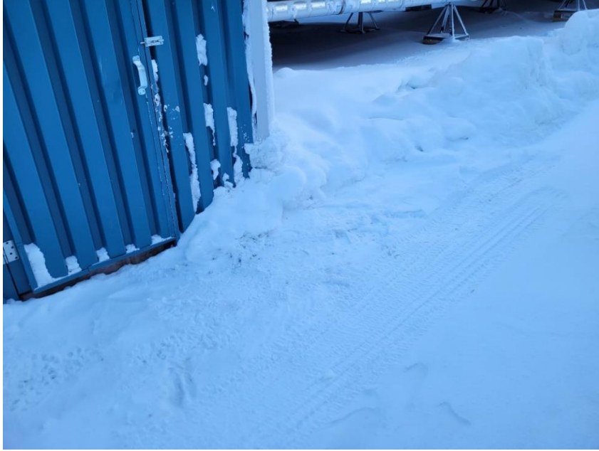
Photo 2: Ground area outside the wing three lift station, post cleanup.