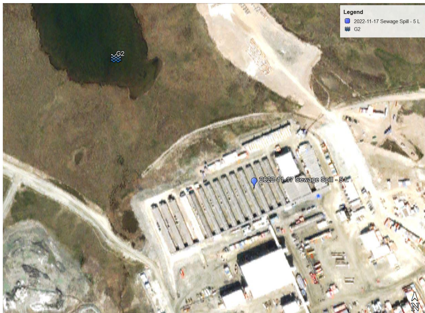
Figure 1: Location of sewage spill and proximity to water bodies.