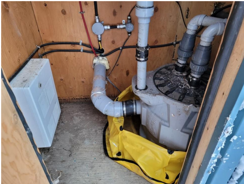
Photo 3: Wing three lift station with secondary containment installed post cleanup