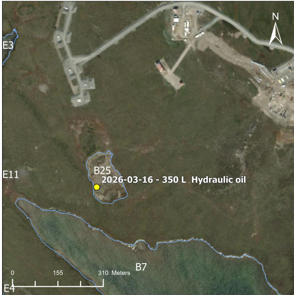
Figure 1: Location of the spill and proximity to waterbodies.