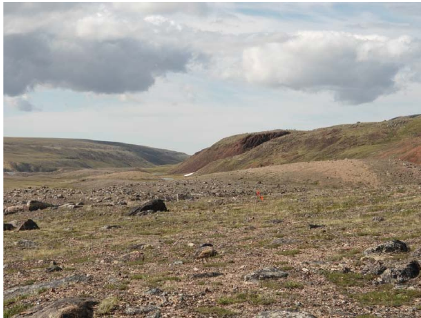
Figure 1- 2: Quarry Q7 + 500 Showing Boulders and Overburden

At least 4 different surface water bodies exist within 200 m of the quarry boundary. In addition, localized intermittent creeks are located to the west/southwest of the quarry and drains the area from north of the Q7 + 500 extents. An additional creek is located 150 m from the eastern extent of the quarry, and flows south to a small lake. For this reason, the quarry extents were located to avoid any interaction with run-off channels or streams that access these water bodies. A temporary stream crossing will need to be constructed for the access road at each of these creeks.