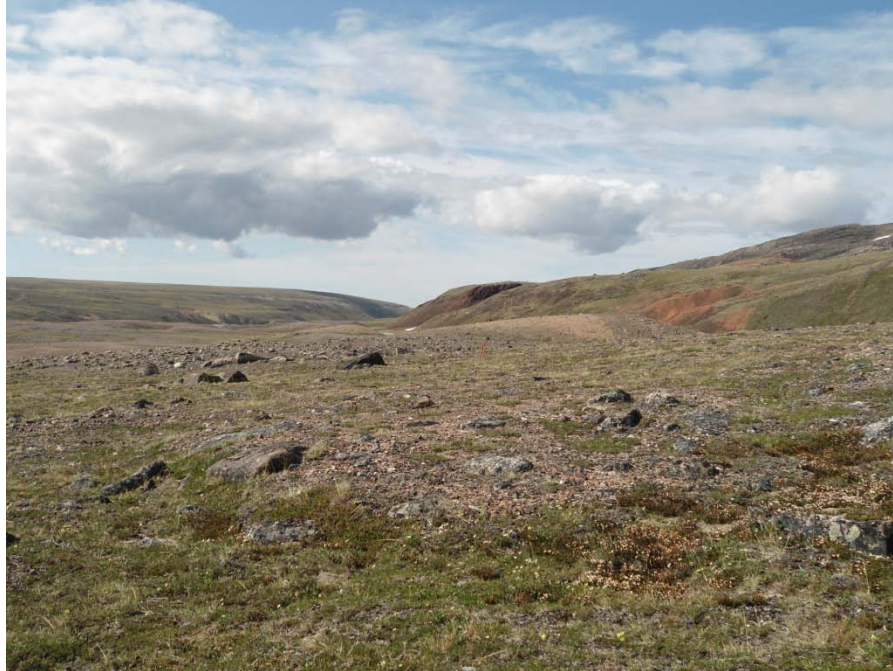
Figure 1- 3: Proposed Quarry Q7 + 500 Looking West

Vegetation within the Mary River Project area is described in the Vegetation Baseline Study Report in Volume 6 of the FEIS (Appendix 6C). A total of 155 vascular plant species were recorded through the total Project area, a vegetation classification system was developed and a species list was compiled. No plant species considered to be “rare” in Canada were found to occur in the survey locations. Vegetation is extremely limited in the area of the proposed quarry, and exists in small patches where organic deposits occur around the base of the rock outcroppings, and in the valleys in between large boulders. Several species of songbirds and shorebirds migrate to this area annually to breed, and were predominately found in the various types of lowland habitats (river deltas, coastal plains, tundra, and near wetlands) that offer an abundant source of insects and vegetation for foraging and nesting habitat. This type of habitat is present within and near the proposed quarry site. Bird densities though, are considered to be relatively low.