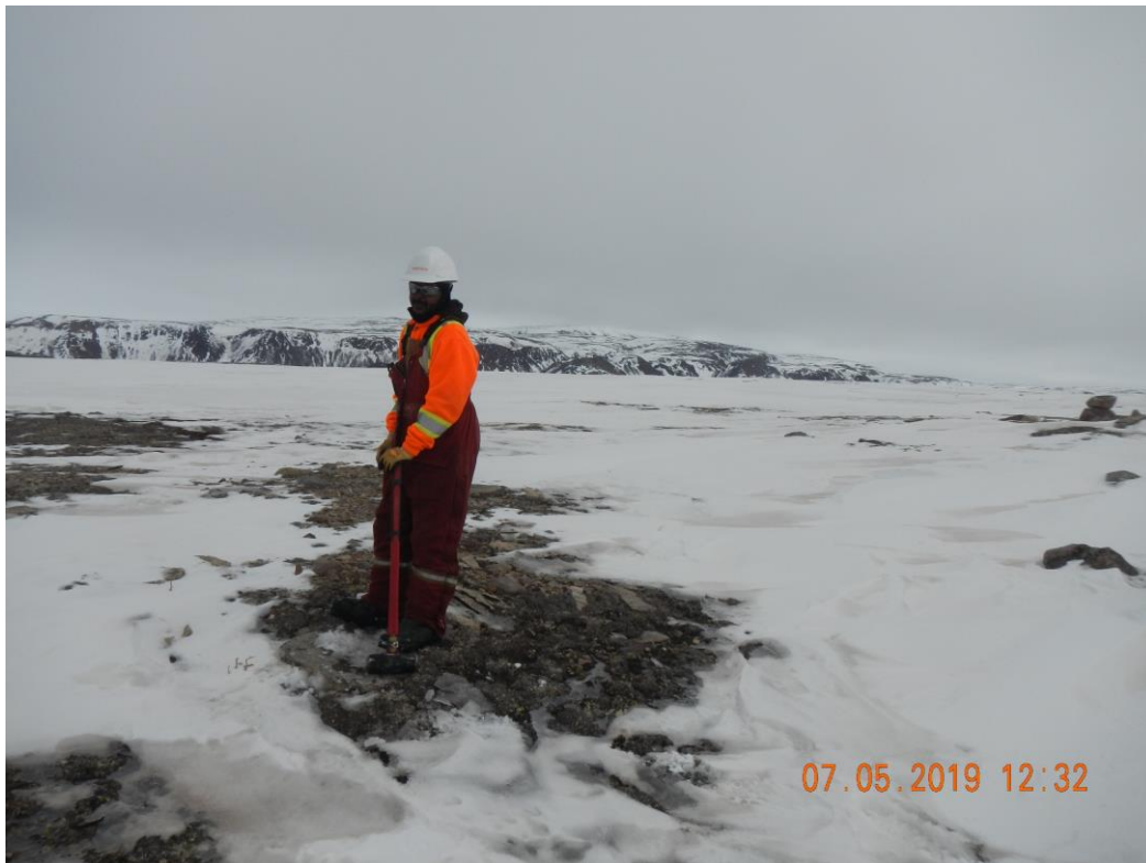
Figure I31– PQ2B sampling location (detailed view) with scale