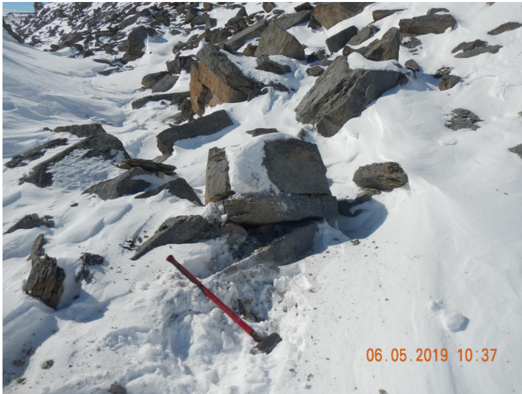
Figure I39– PQ9B sampling location (detailed view) with scale