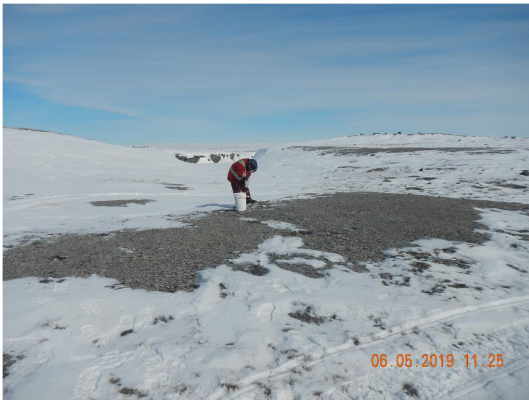
Figure I38– PQ9A sampling location (general view)