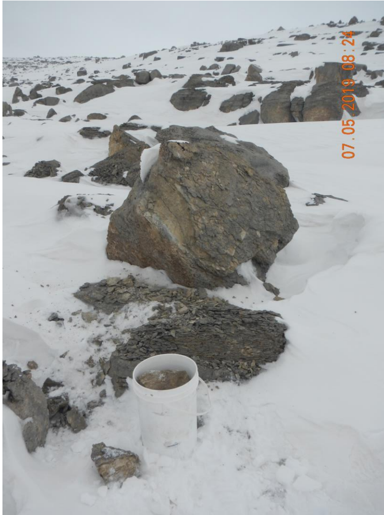
Figure I35– PQ5A sampling location (detailed view) with scale