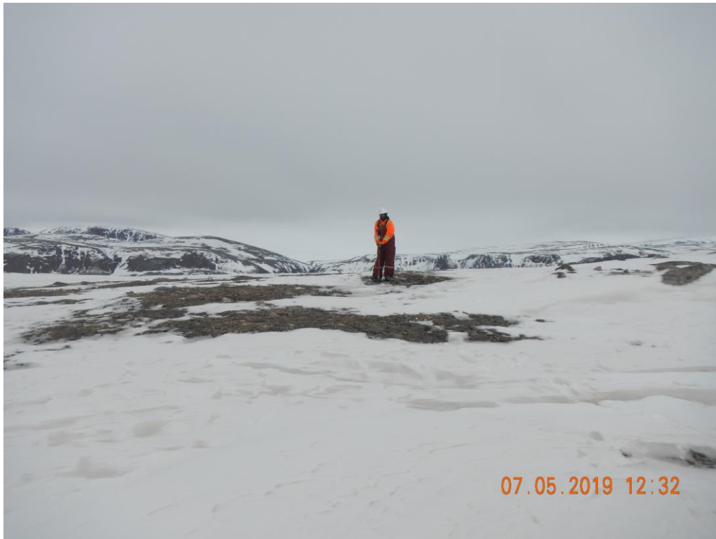
Figure I32– PQ2B sampling location (general view)