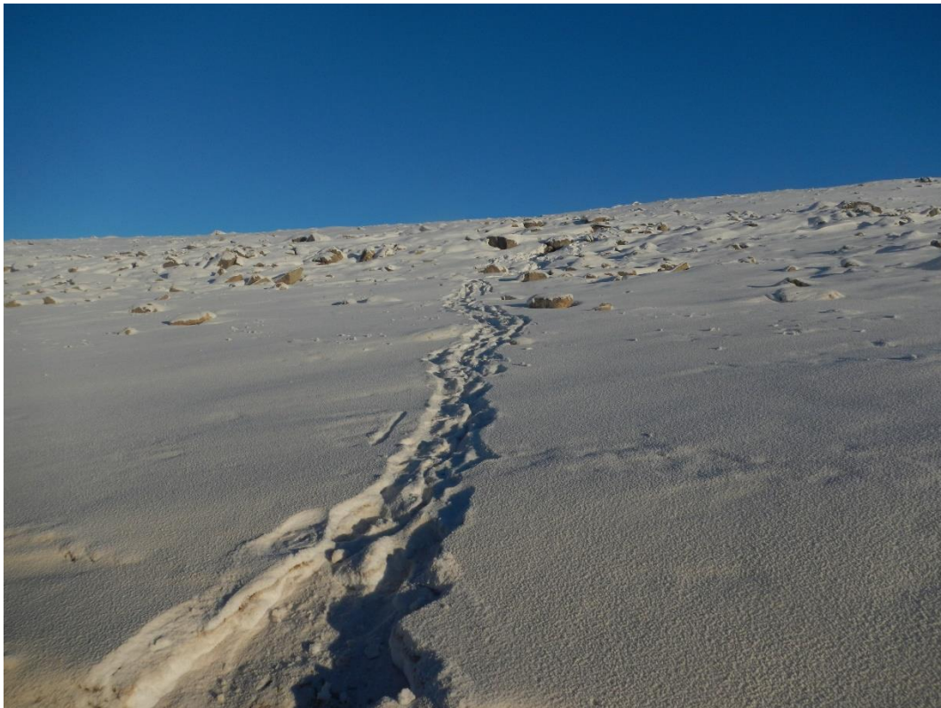
Figure I30 – Q24 sampling location (general view)