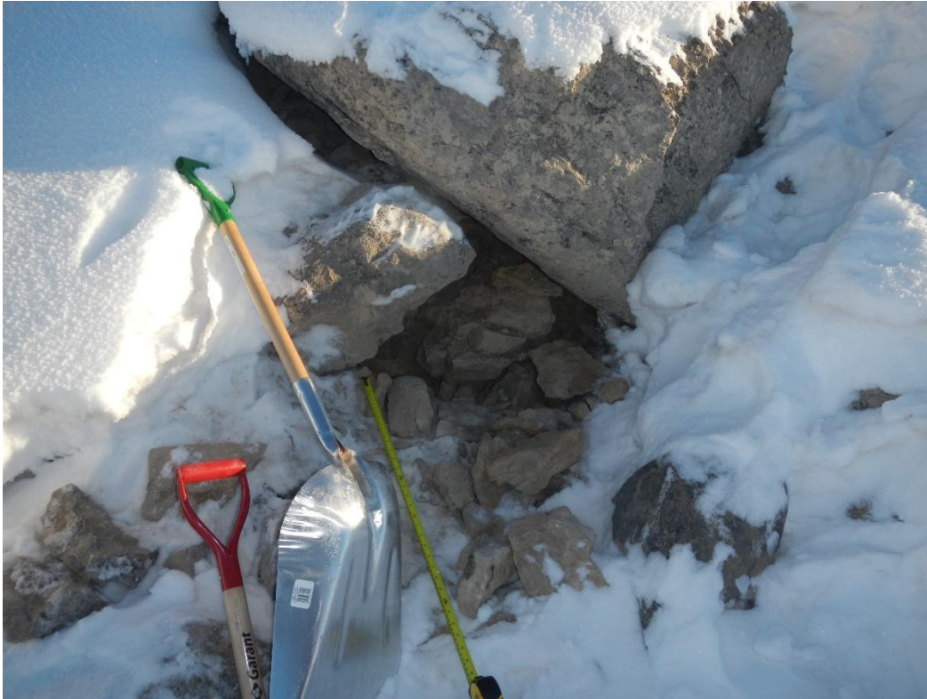
Figure I29 – Q24 sampling location (detailed view) with scale