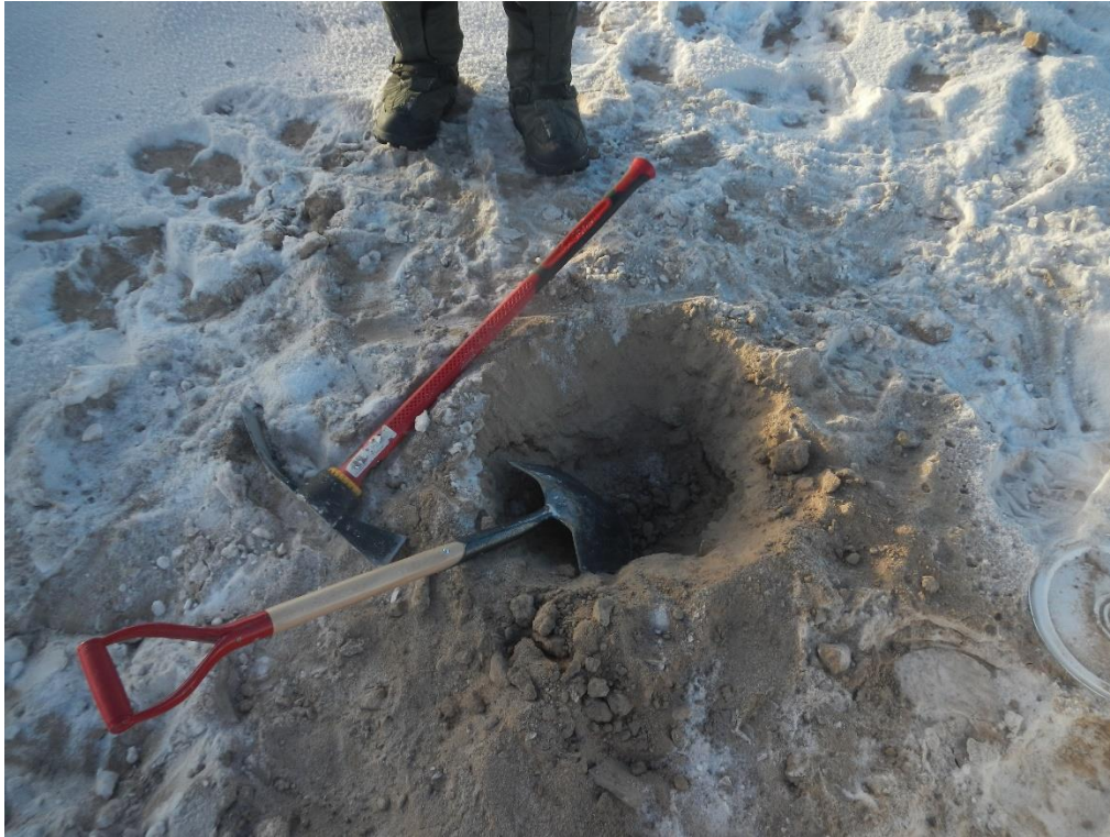
Figure I27 – Q10 sampling location (detailed view) with scale