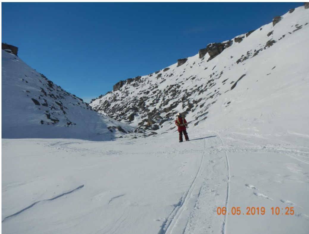
Figure I40 – PQ9B sampling location (general view)