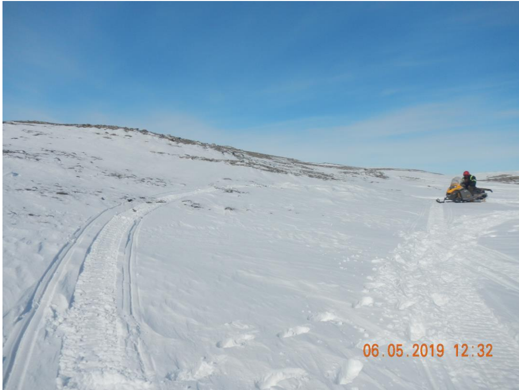
Figure I42 – Q27 sampling location (general view)