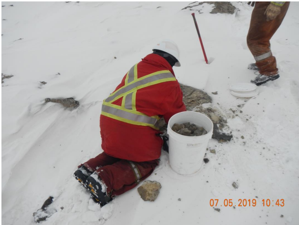
Figure I33– PQ4A sampling location (detailed view) with scale