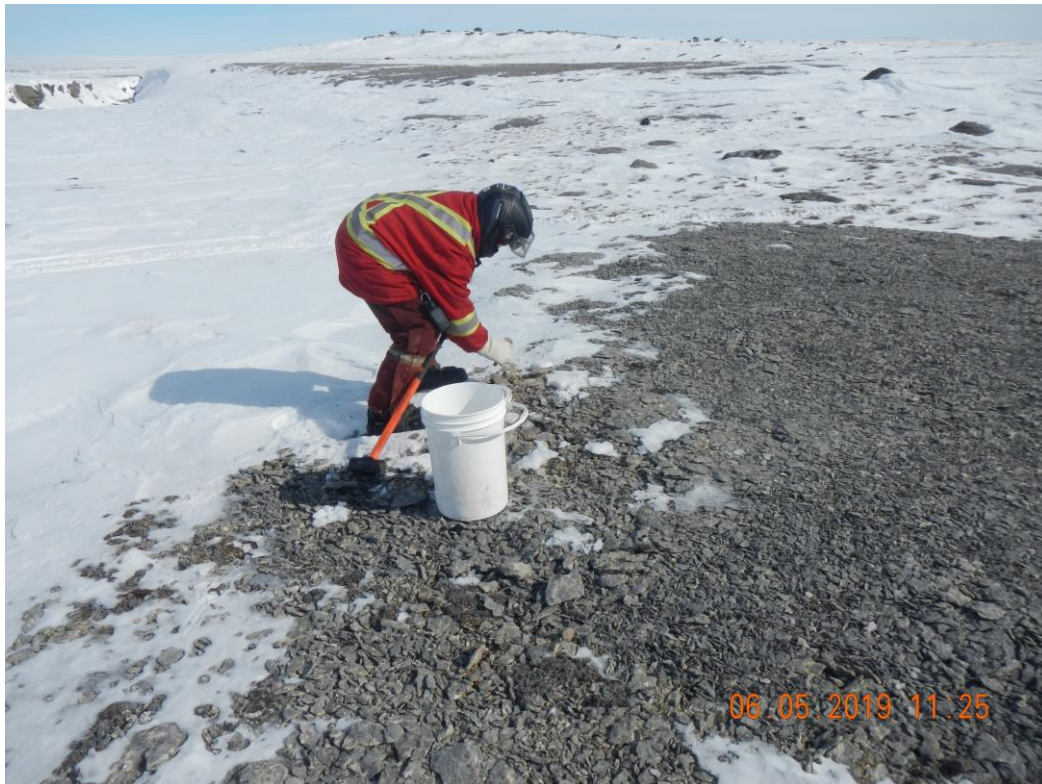
Figure I37– PQ9A sampling location (detailed view) with scale