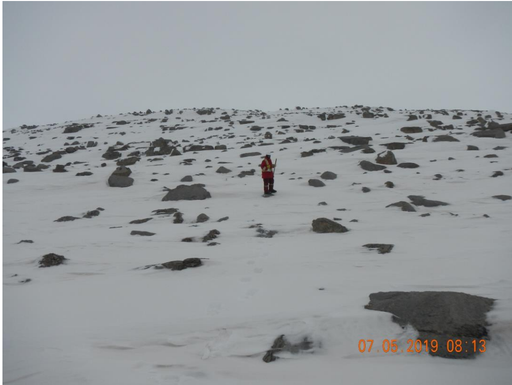
Figure I36– PQ5A sampling location (general view)