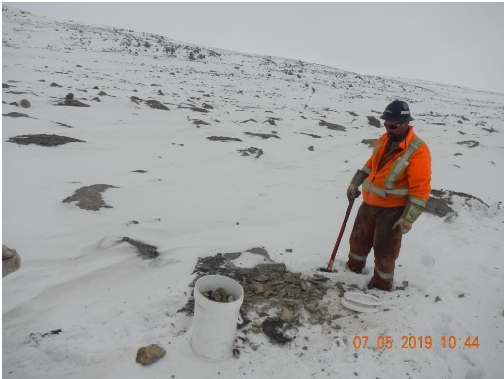
Figure I34– PQ4A sampling location (general view)