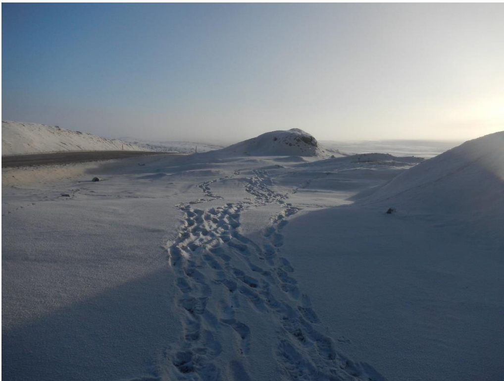
Figure I28 – Q10 sampling location (general view)