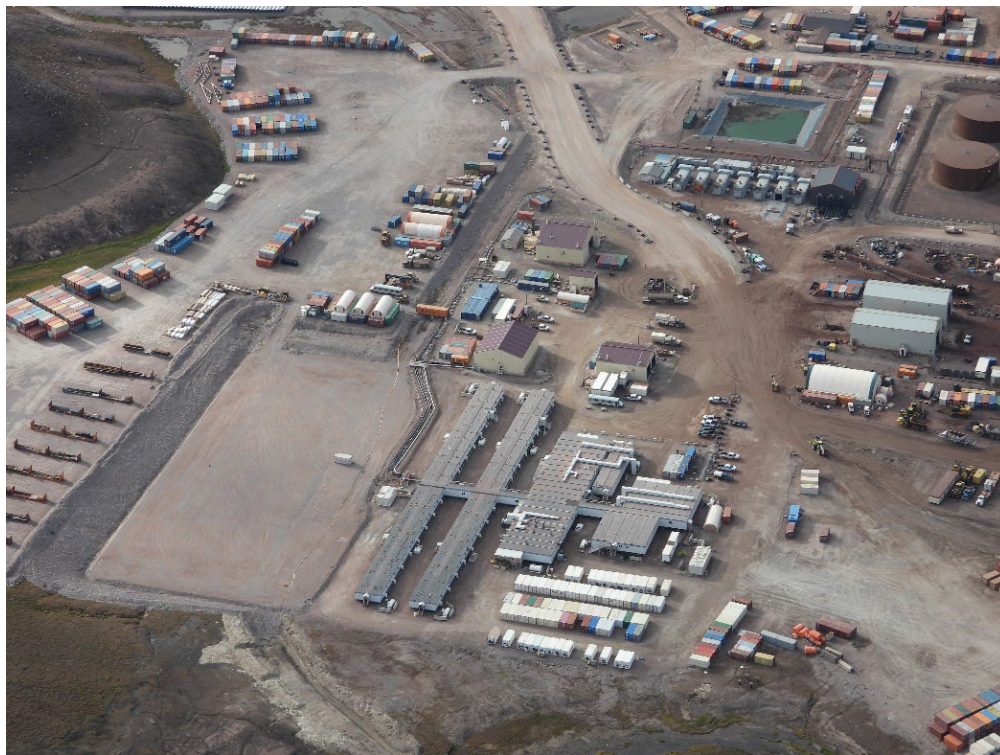
Photo 14 – Aerial View of Generators, Maintenance Shops, Incinerator Building and PSC – August 2023