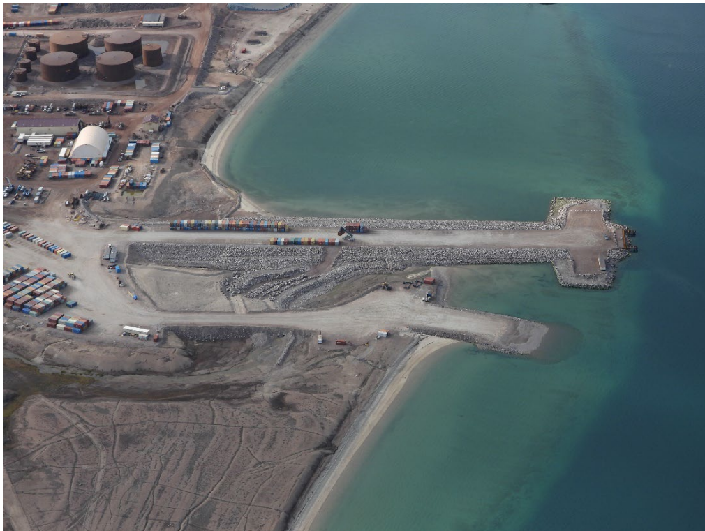
Photo 12 – Aerial View of Freight Dock and B1 Pad — September 2023