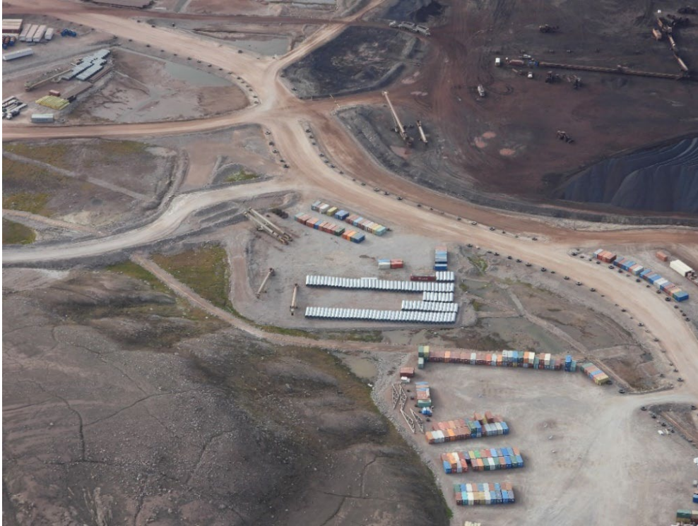
Photo 33 – Aerial view of decommissioned Matrix Camp Laydown - September 2023