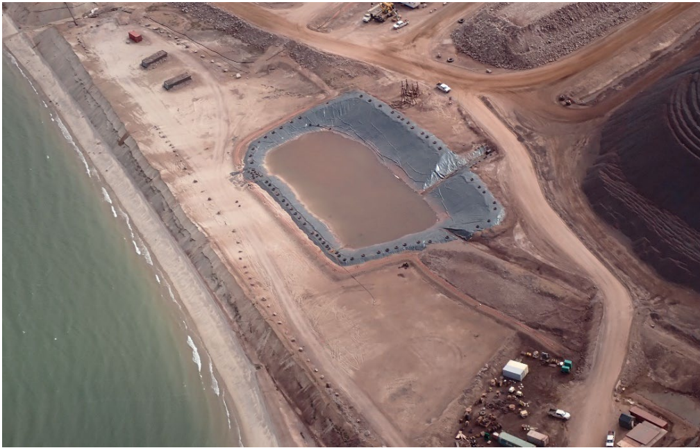
Photo 9 – Aerial View of East Ore Pad Surface Water Management Pond (MP-05) – July 2023