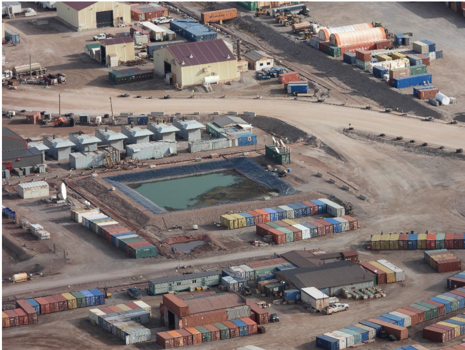
Photo 15 – Aerial View of Polishing Waste Stabilization Pond (MP-01A) and Generators – August 2023