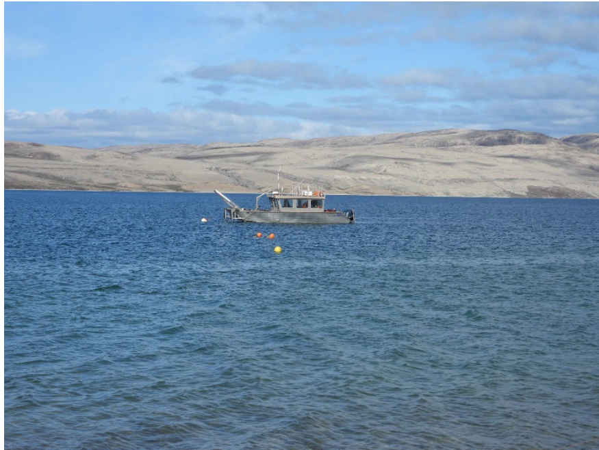
Photo 27 –Research Vessel conducting Marine Environmental Effects Monitoring Plan (MEEMP) – July 2023