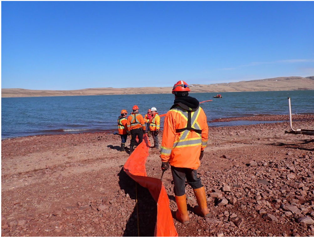
Photo 25– Oil Pollution Emergency Plan (OPEP) Spill Response Training Exercise – July 2023