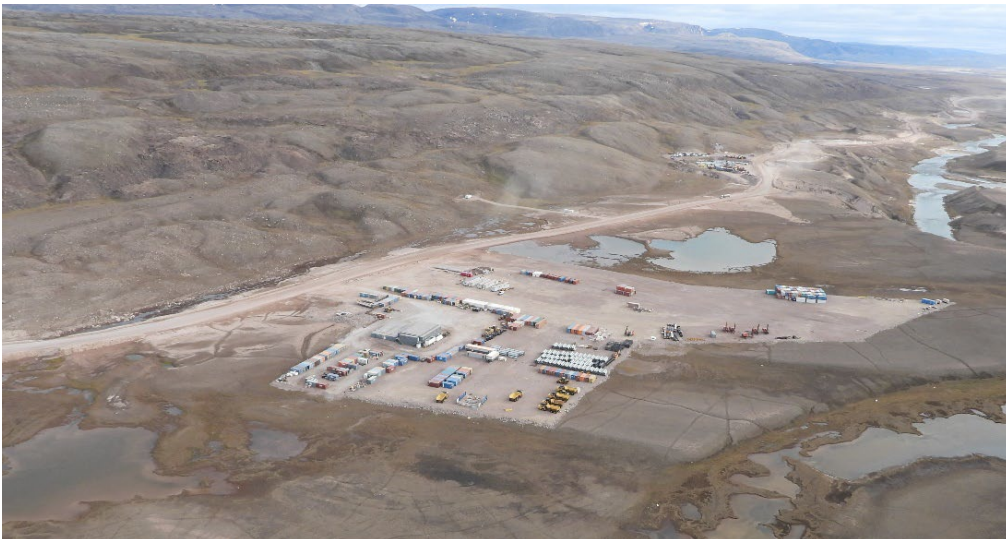
Photo 20 – Aerial View of L2 and R3 Laydowns along Tote Road – August 2023