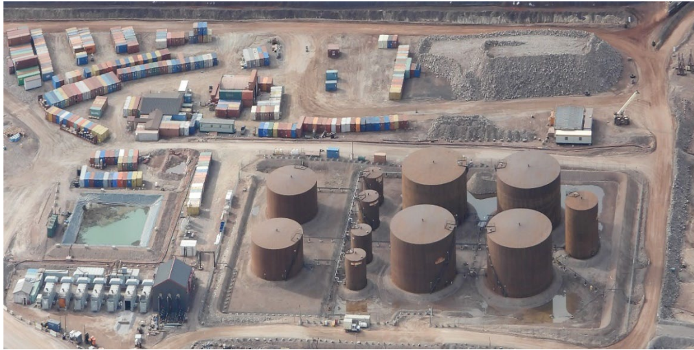
Photo 13 – Aerial View of Steel Tank Bulk Fuel Storage Facility (MP-03) – August 2023