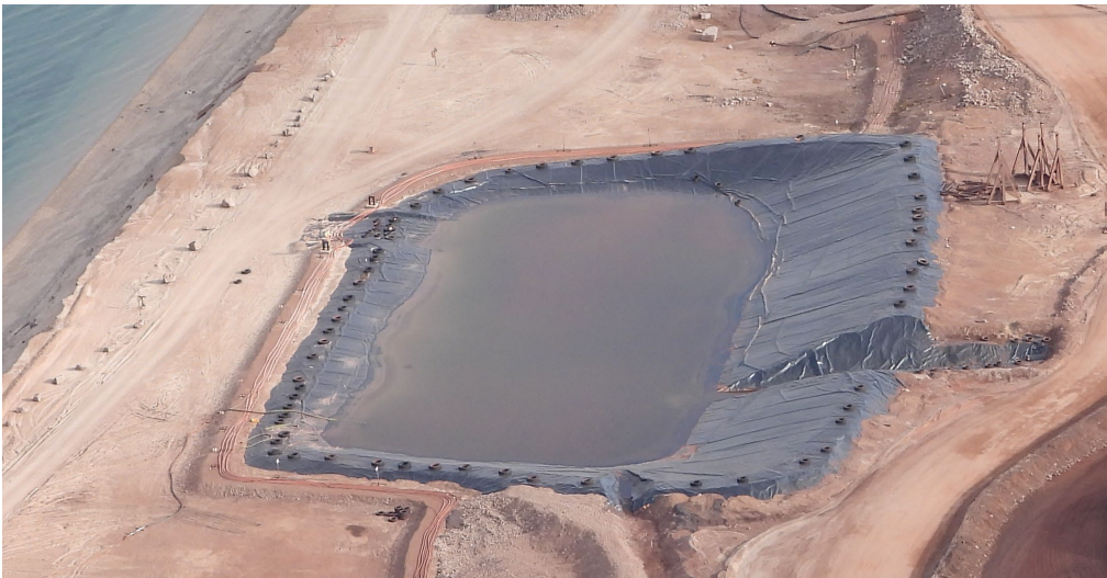
Photo 10 – Aerial View of East Ore Pad Surface Water Management Pond (MP-05) – July 2023