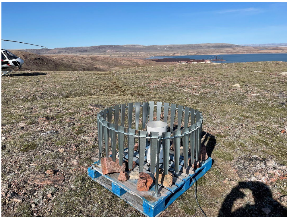
Photo 30 – Meteorological Tower Station East of Milne Port – July 2023