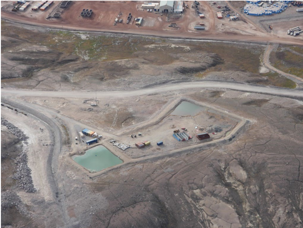
Photo 19 – Aerial view of Landfarm (MP-04) and Contaminated Snow Berm (MP-04A) – August 2023