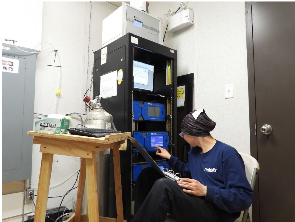
Photo 32 – Beta Attenuation Monitor (BAM 1020) Unit Inside Port Site Complex (PSC) – June 2023