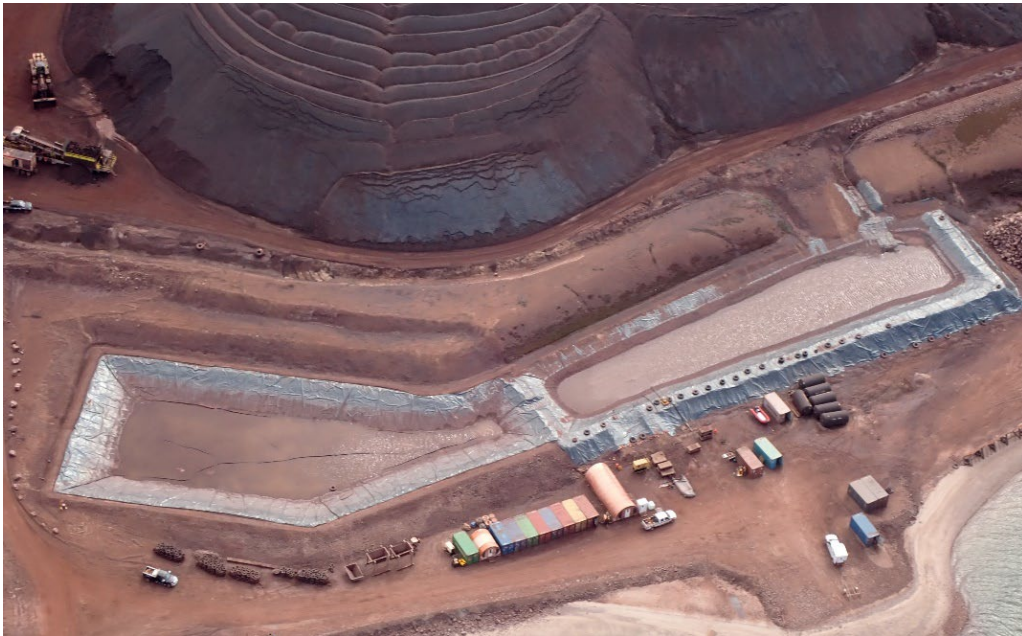
Photo 7 – Aerial View of West Ore Pad Surface Water Management Pond (MP-06) – July 2023