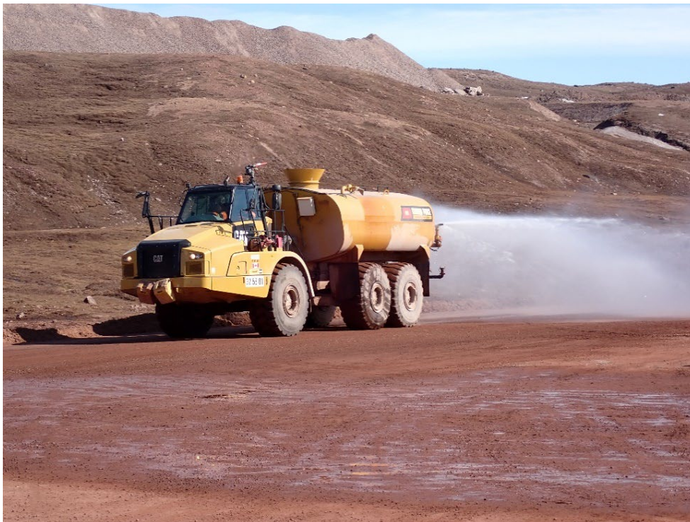
Photo 35 – 740 Water Truck Suppressing Dust OHT Laydown – June 2023