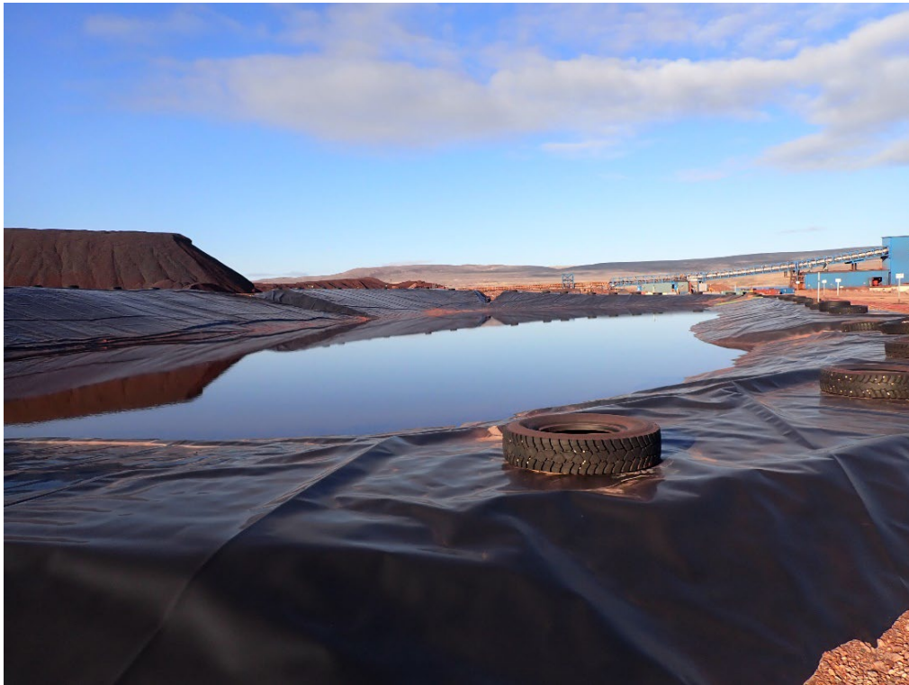
Photo 11 – East Ore Pad Surface Water Management Pond (MP-05) – September 2023