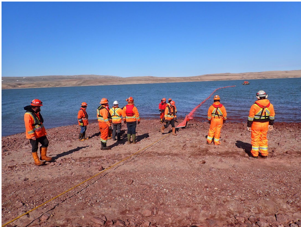
Photo 24 – Oil Pollution Emergency Plan (OPEP) Spill Response Training Exercise – July 2023