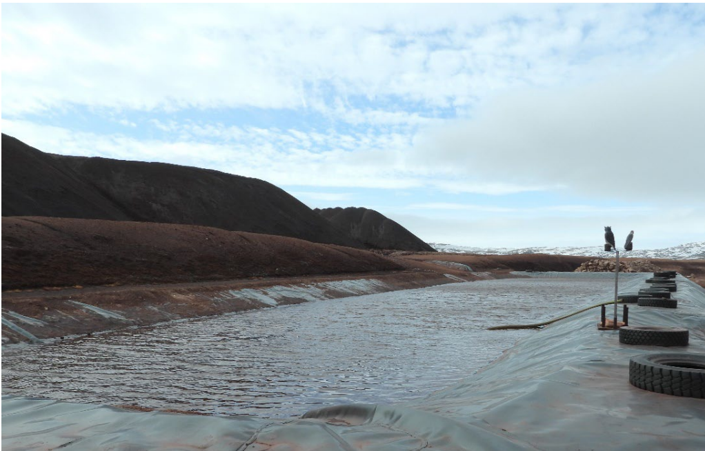
Photo 8 – Northwest Ore Pad Surface Water Management Pond (MP-06) – July 2023