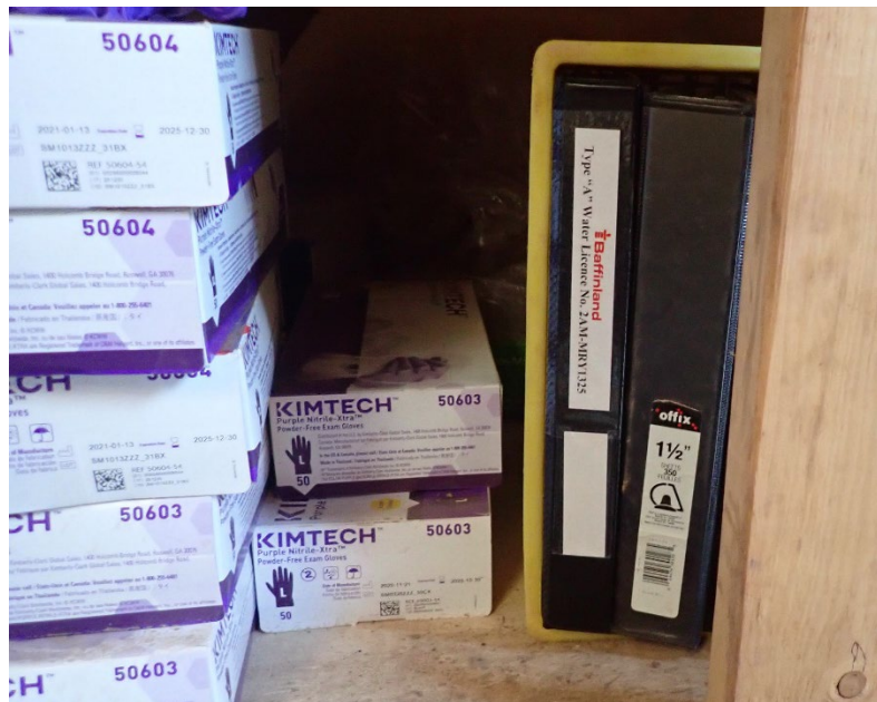
Figure 2. Photo of Water Licence Posted in WRF WTP