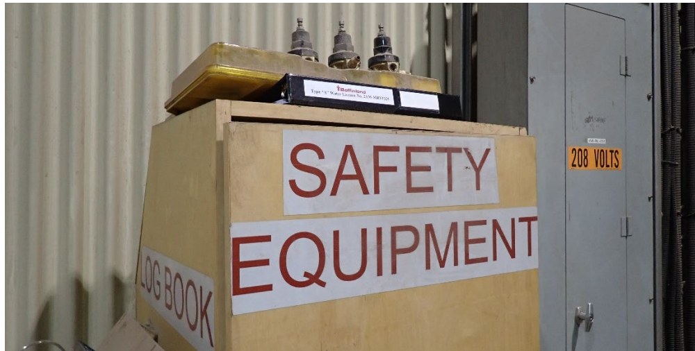
Figure 8. Photo of Water Licence Posted in Mine Site Incinerator Building