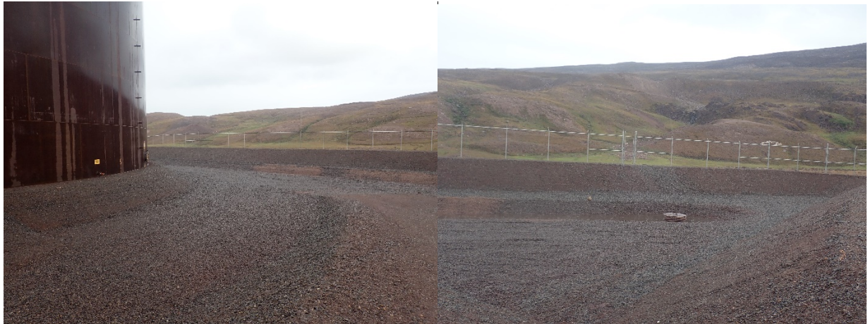
Figure 9. Photos of MS-03B Tank Farm in August After Discharge