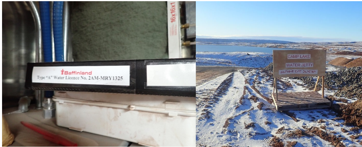
Figure 5. Photos of Signage in English and Inuktitut & Copy of Water Licence at Camp Lake Water Jetty