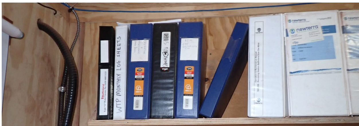
Figure 7. Photo of Water Licence Posted in Sailiivik WTP and WWTP