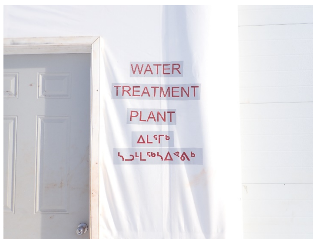
Figure 3. Photos of Signage in English and Inuktitut at KM110 Laydown and KM110.5 Shop