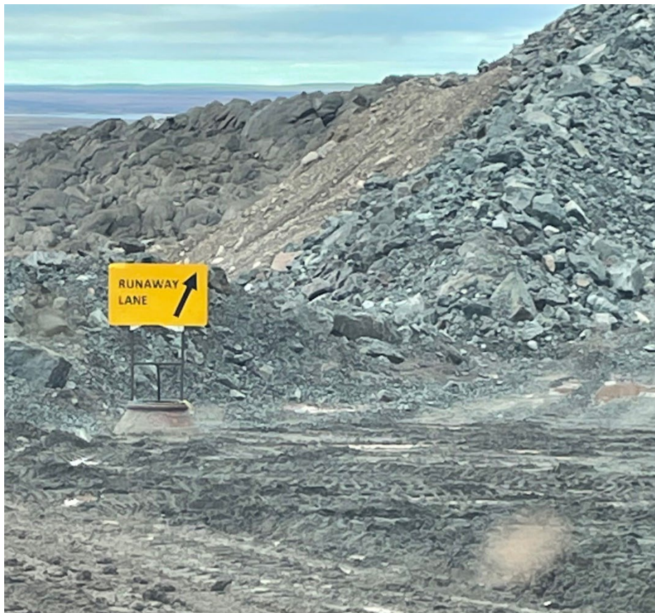
Figure 11. Photo of Signage re-erected along the Mine Haul Road