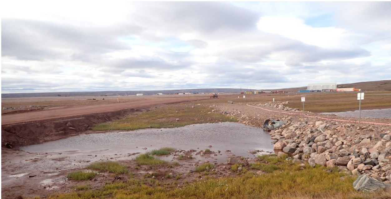
Figure 10. Photo of KM101 Culvert under a Berm, Adjacent to Tote Road – August 25, 2022