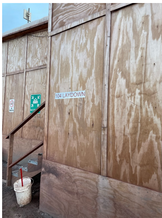
Figure 4. Photo of Signage in English and Inuktitut at KM104 Laydown