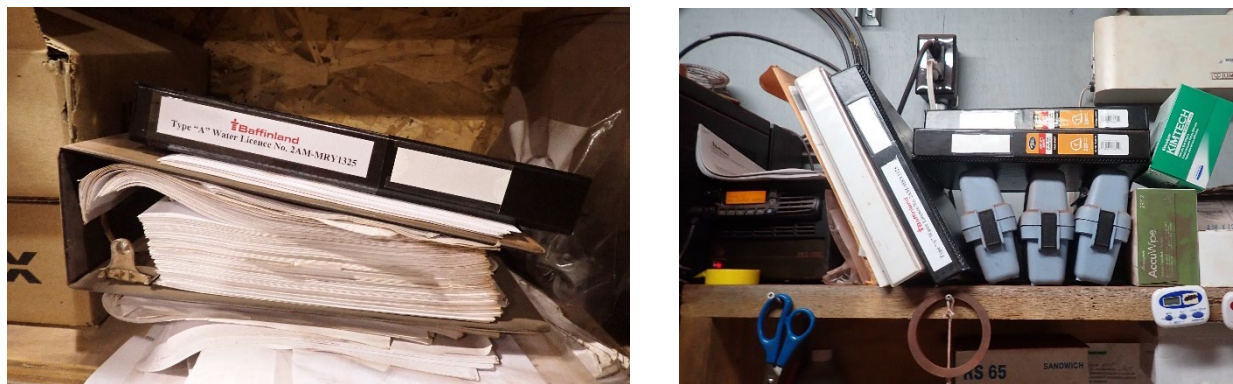
Figure 6. Photos of Water Licence Posted in MSC WTP and WWTP