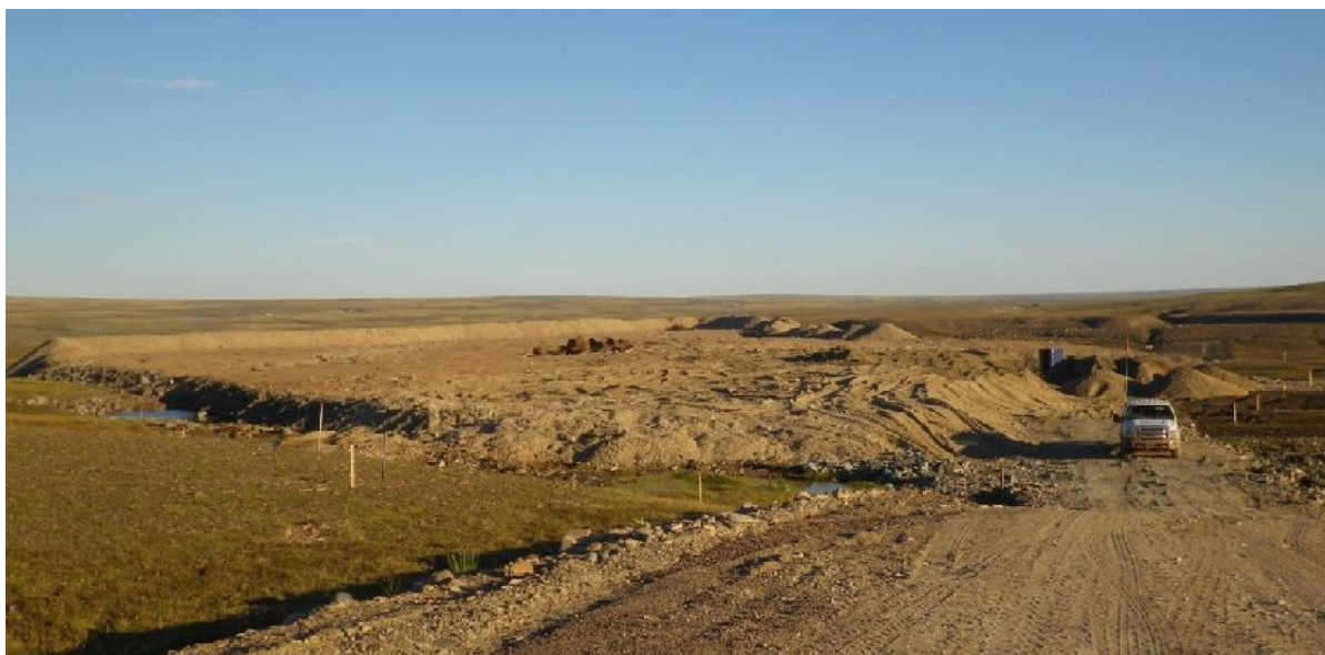
PHOTO 14 - Mary River Mine Site Landfill, July 2016