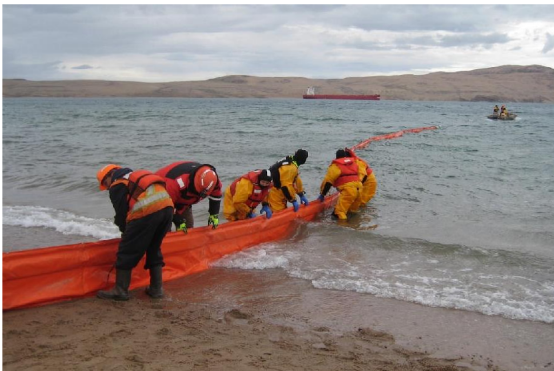
PHOTO 6 - Marine Spill Response Training at Milne Port, July 2016