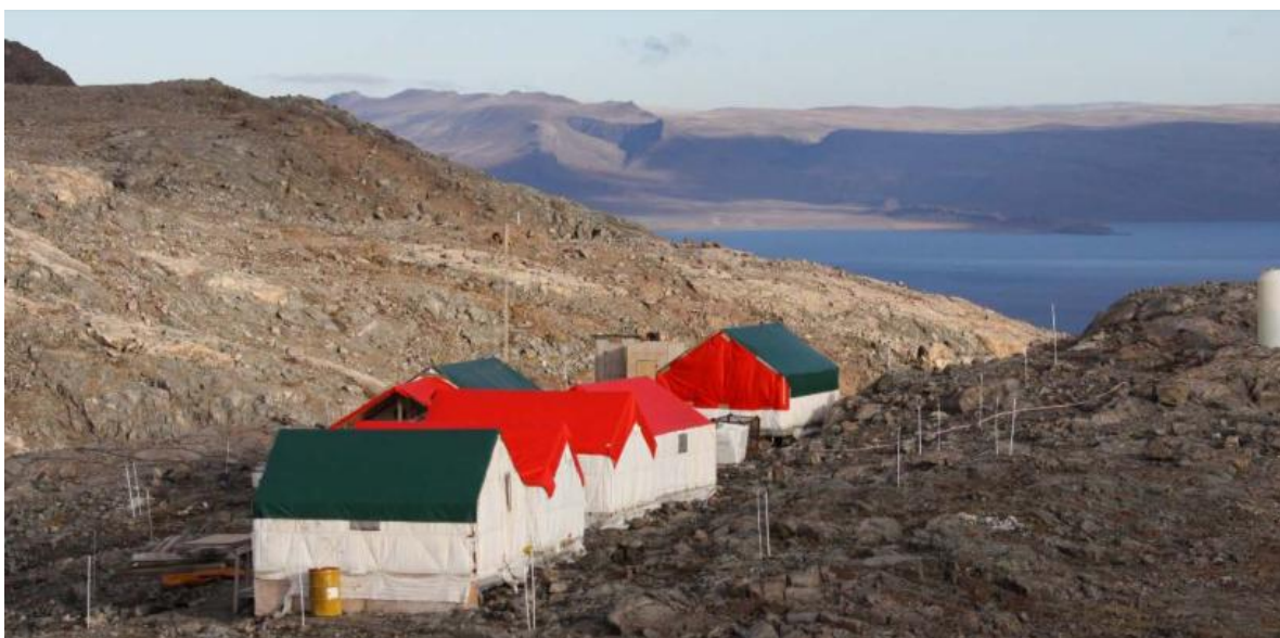
PHOTO 14 – Campsite on Bruce Head, North of Milne Port, August 2016