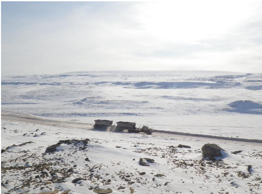
PHOTO 1- Milne Port Tote Road and Ore Haul Truck, April 2016