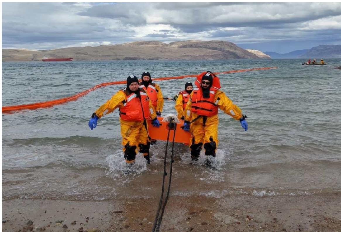
PHOTO 3 - Deploying a hydrocarbon skimming unit during the Marine Spill Response Training July 2016