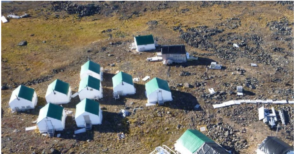
PHOTO 1 - Aerial View Mid-Rail Camp August 2016 - Camp was not occupied in 2016