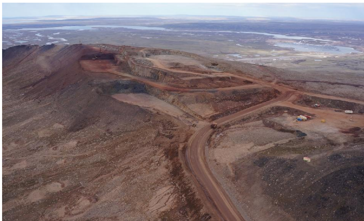
PHOTO 2 - Mary River Mine Site Open Pit Bench, July 2016