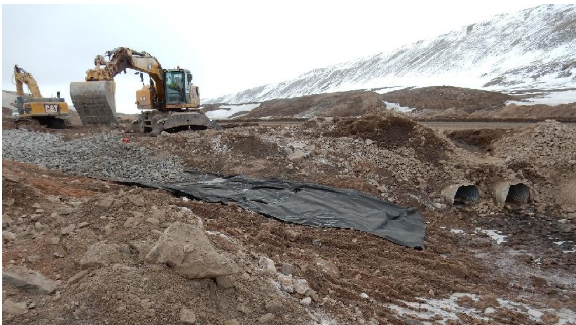
PHOTO 7 – Milne Port Tote Road Km 90 Ditch and Culvert Repair and Armoring, June 2016