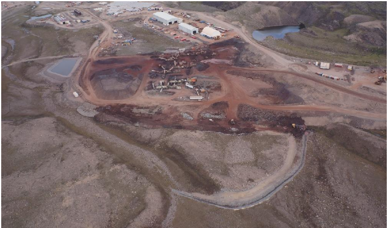
PHOTO 7 - Mary River Mine Site Crusher Pad Ore Stockpile and, Engineered Drainage Ditch and Sedimentation Pond, July 2016