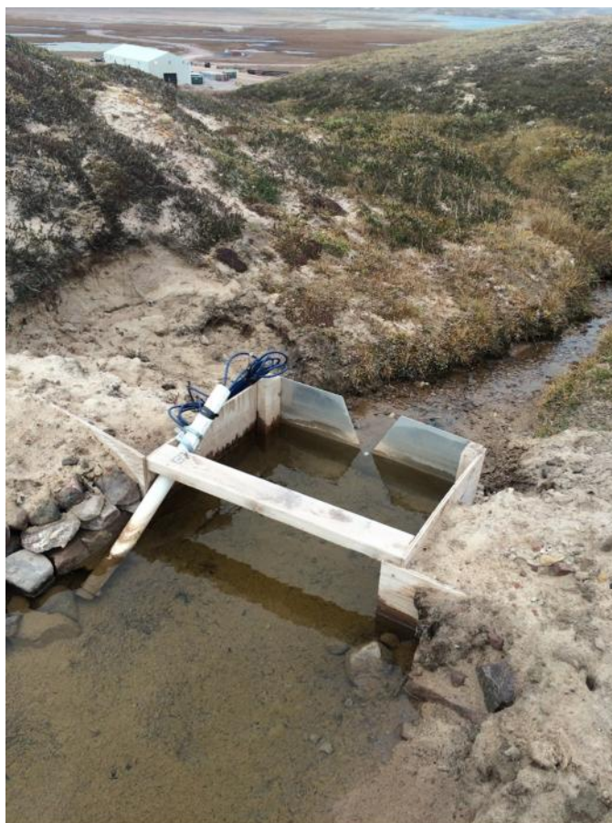
PHOTO 10 - Hydrology Monitoring Station Weir and Sensor, September 2016