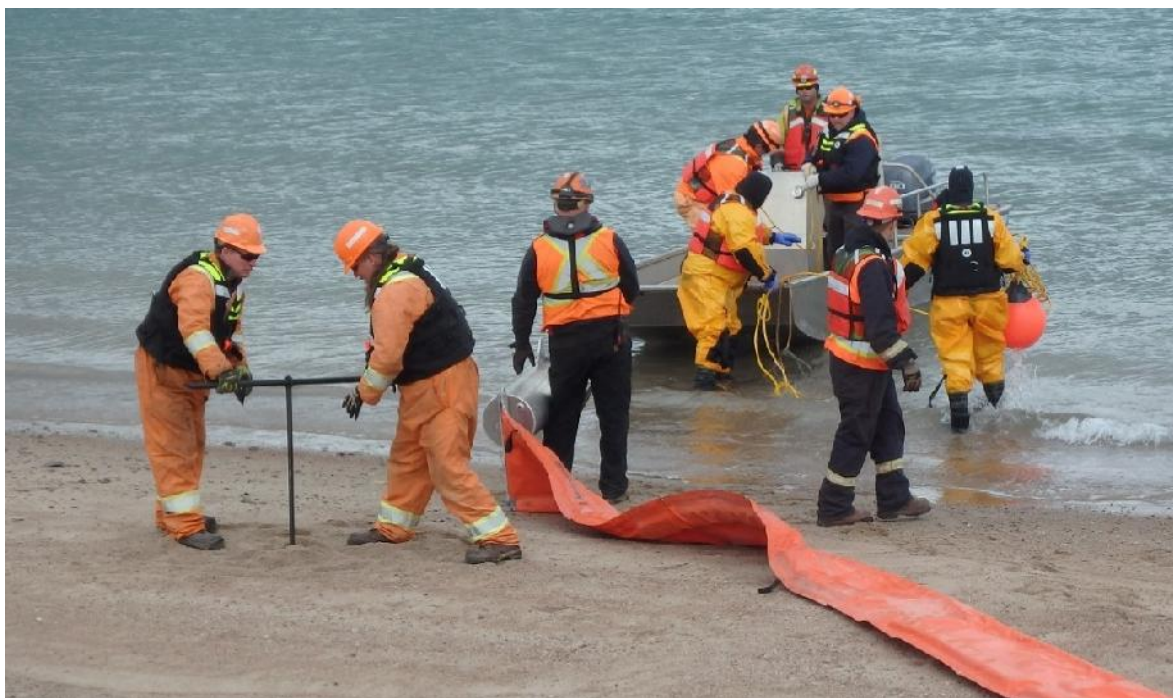
PHOTO 4 - Deploying a containment boom and service boat during the Marine Spill Response Training July 2016