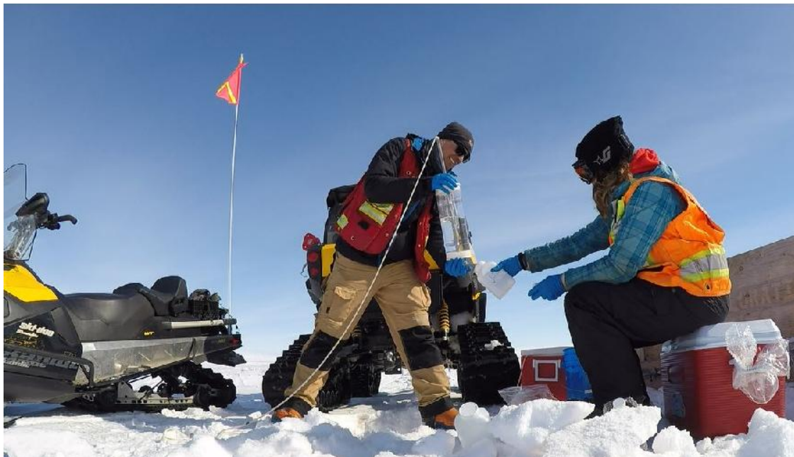
PHOTO 15 – Winter Lake Sampling for the Aquatic Effects Monitoring Program (AEMP), April 2016