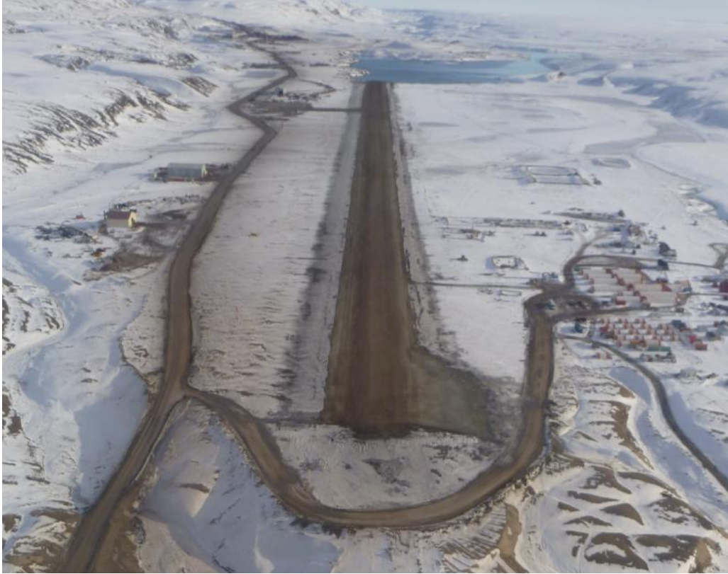
PHOTO 9 - Mary River Mine Site Aircraft Runway and Exploration Camp, Facing South September 2016