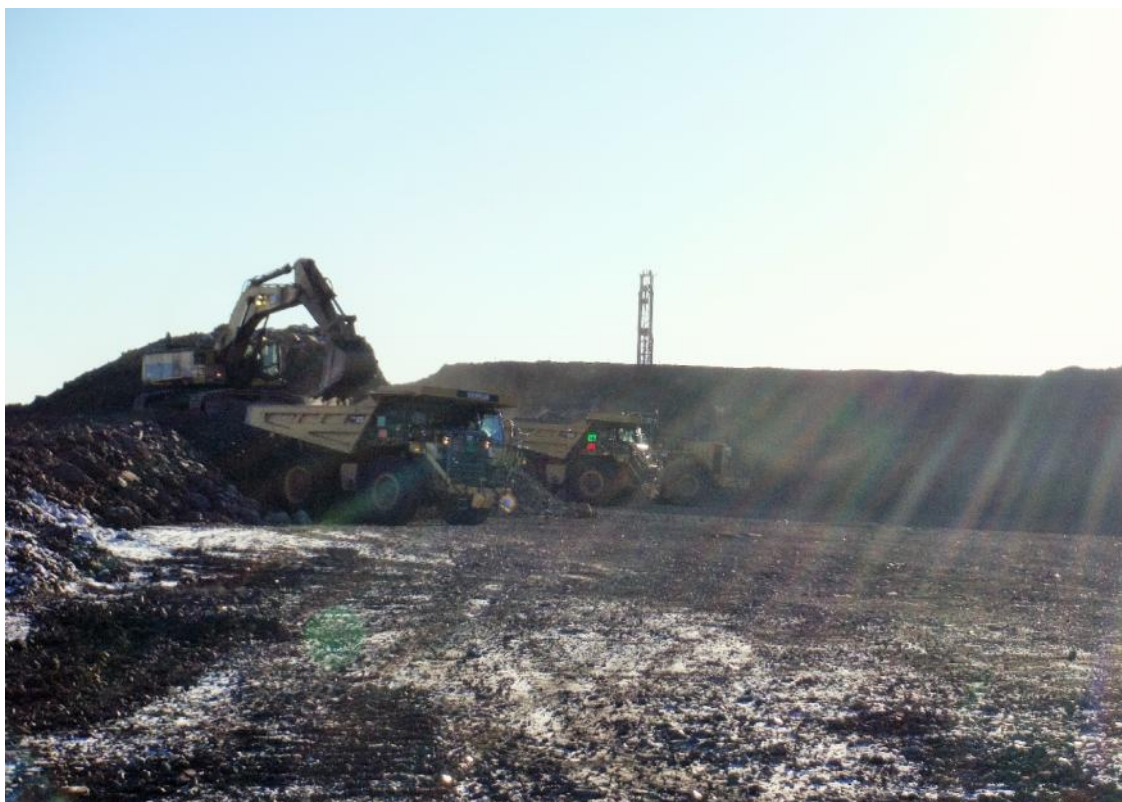
PHOTO 3 - Loading Mary River Ore at Nuluujaak Pit, March 2016