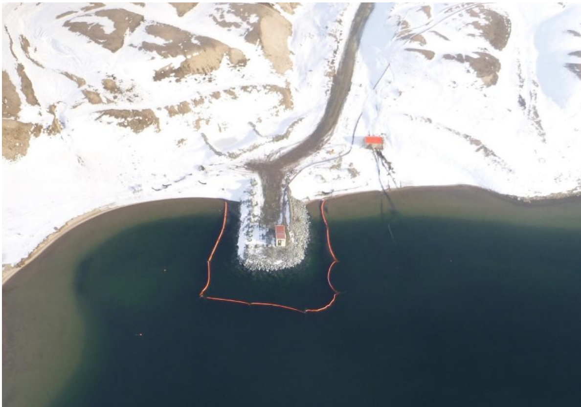
PHOTO 13 - Mary River Mine Site Jetty Repair Completed with Sedimentation Mitigation Measure in Place September 2016