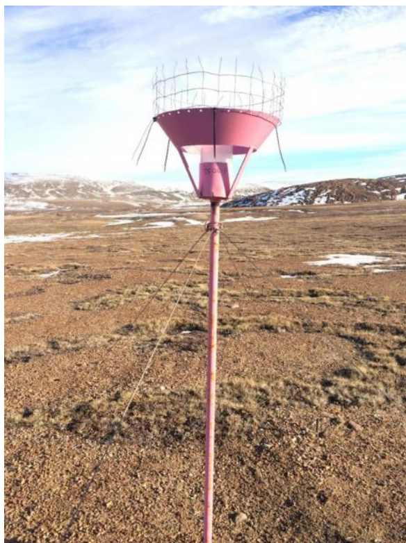
PHOTO 12 - Milne Port Dust Fall Sampling Station, September 2016