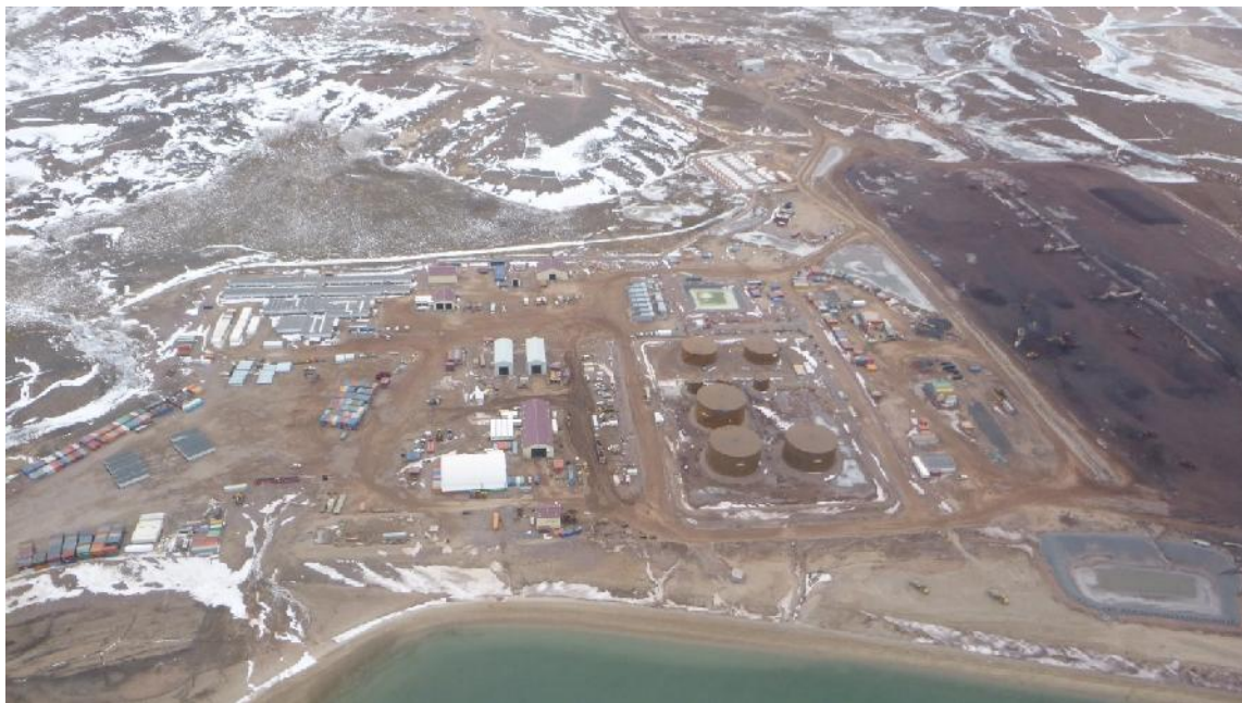
Photo 1 - Milne Port infrastructure, September 2016