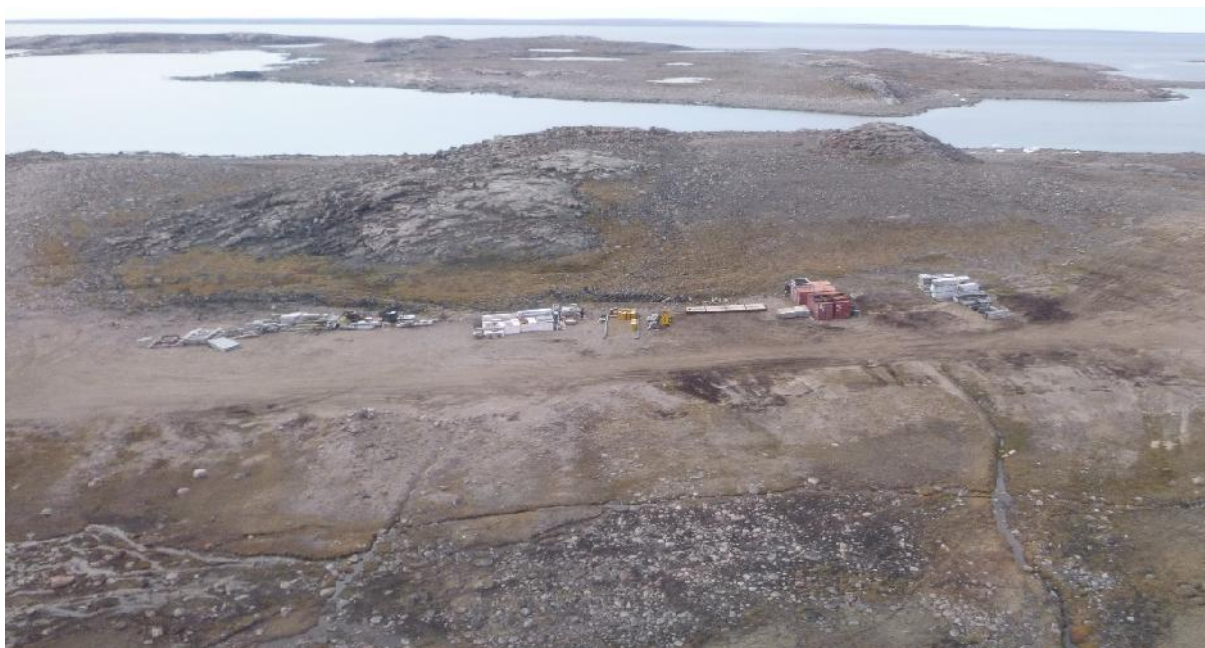
PHOTO 4 - Aerial View of Steensby Port after Backhaul, August 2016