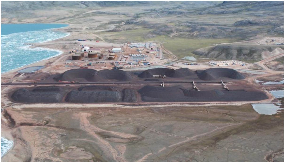
PHOTO 7 - Aerial view of Milne Port Site and Ore Stockpile, July 2016