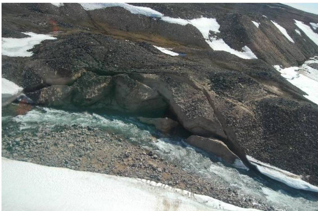
PHOTO 17 – Phillips Creek Natural Sedimentation Event (June, 2016) – Bank Erosion and Sloughing along Phillips Creek Tributary