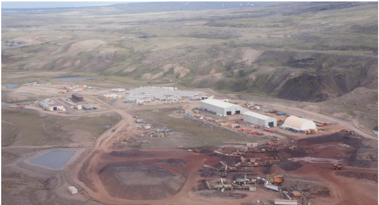
PHOTO 8 - Mary River Mine Site Accommodations Complex, Crusher and Maintenance Yard, July 2016