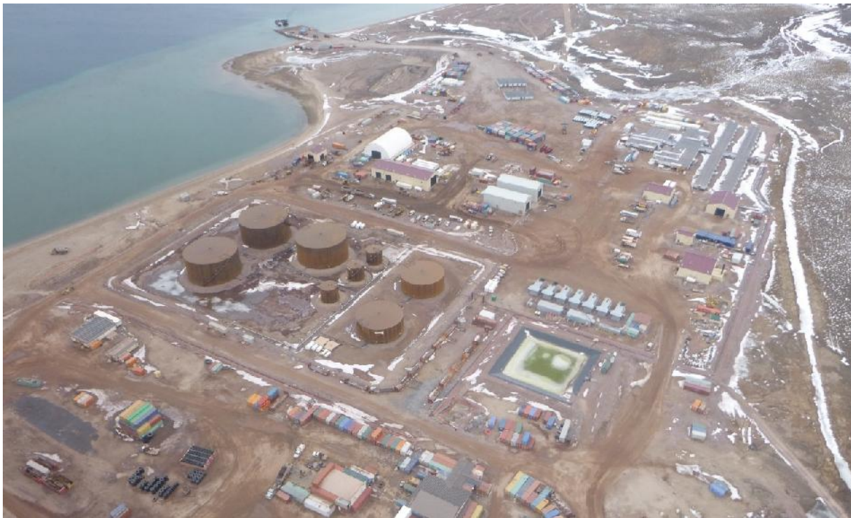
PHOTO 8 - Aerial view of Steel Tank Bulk Fuel Storage Facility, September 2016