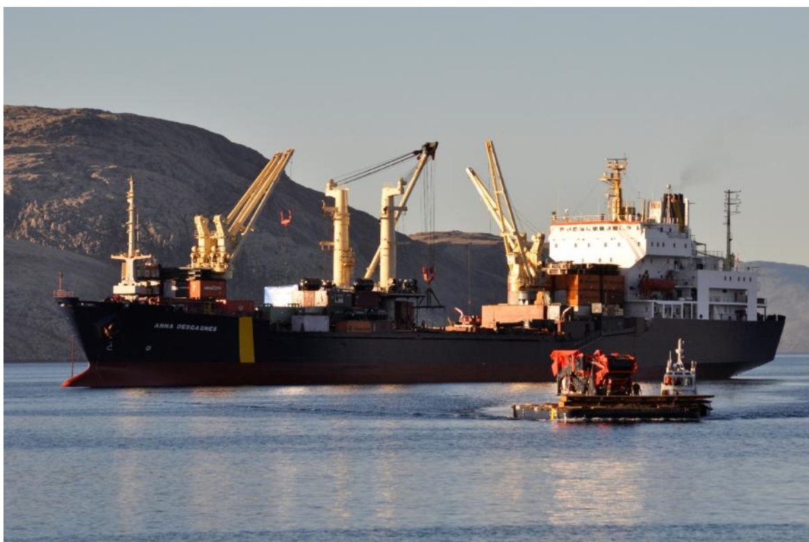
PHOTO 6 - Milne Port Sealift Offloading Cargo, September 2016.