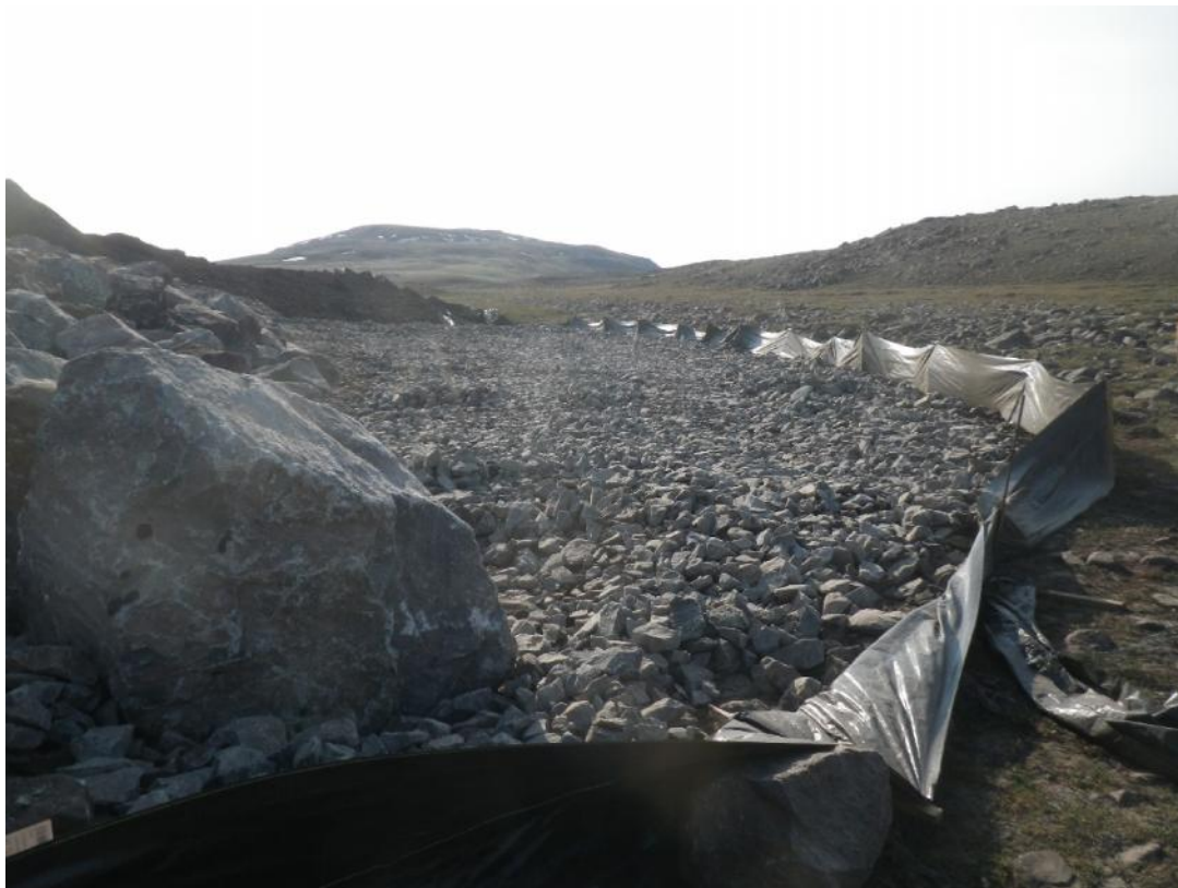
PHOTO 5 – Siltation mitigation measures at the toe of the Crusher Pad, July 2016