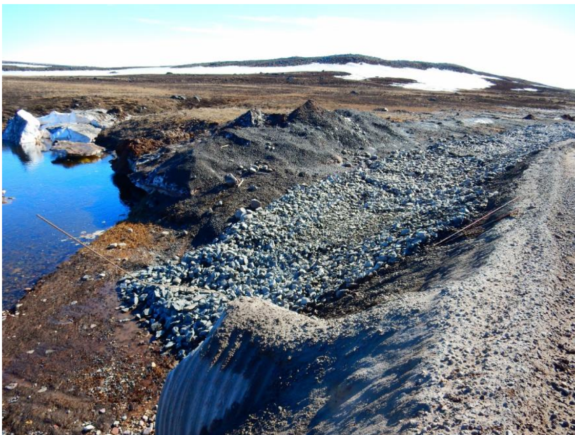
PHOTO 8 – Armoring and Ditch Repair, KM 94 Culvert BG04, June 2016