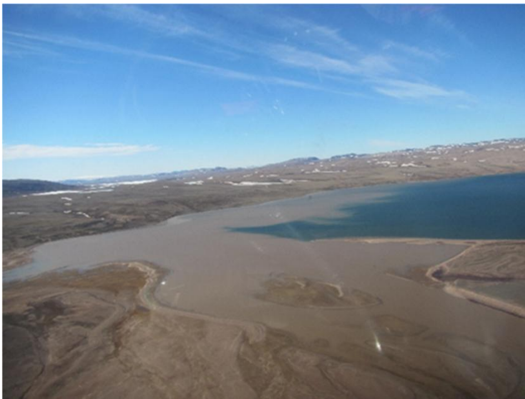
PHOTO 18 – Phillips Creek Natural Sedimentation Event (June, 2016) – Phillips Creek flowing into Milne Inlet