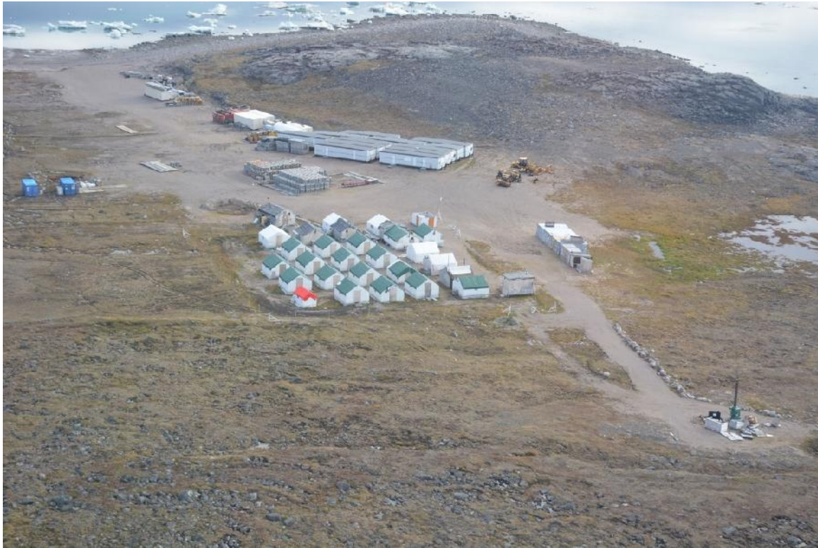
PHOTO 1 - Aerial View of Steensby Port before backhaul August 2016