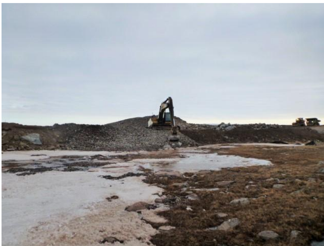
PHOTO 4 – Excavator Armoring the Mine Haul Road Embankment, May 2016