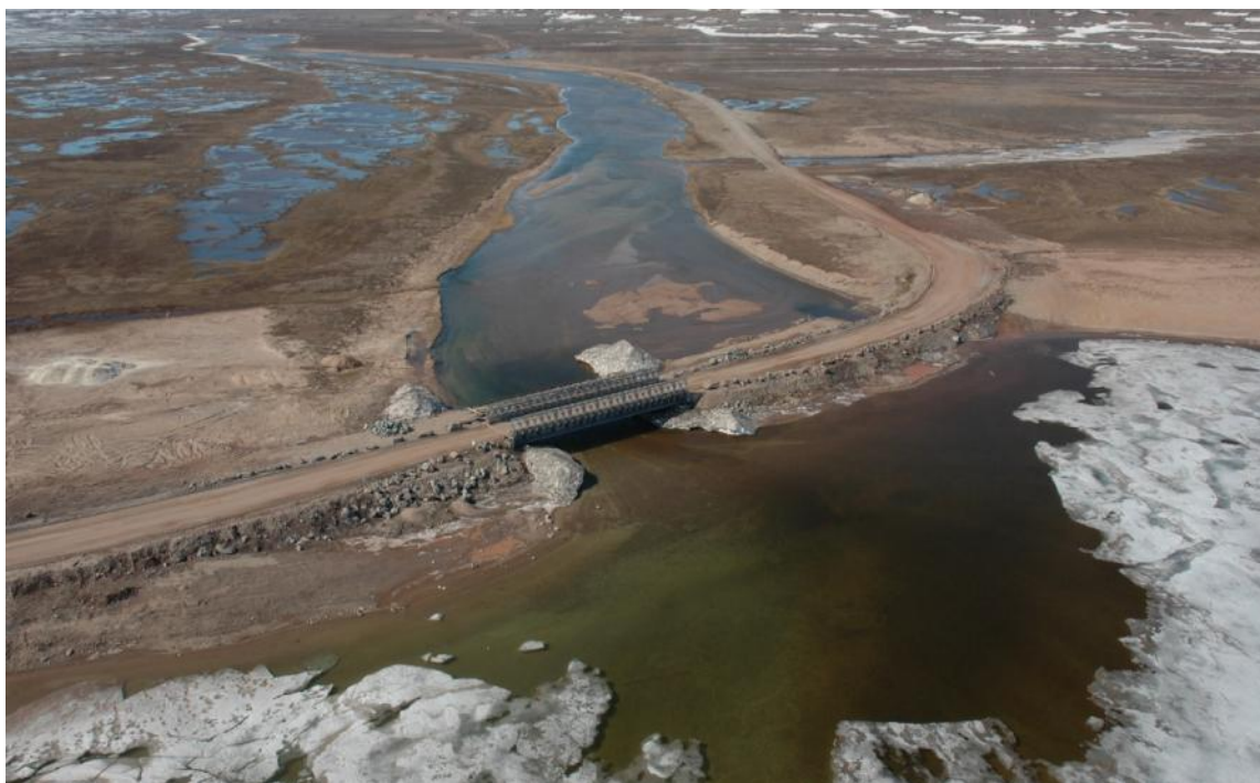
PHOTO 5 – Aerial view of the Milne Port Tote Road Km 17 Bridge, June 2016