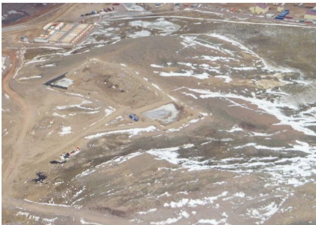
PHOTO 9 - Aerial view of Landfarm and Contaminated Snow Dump, September 2016