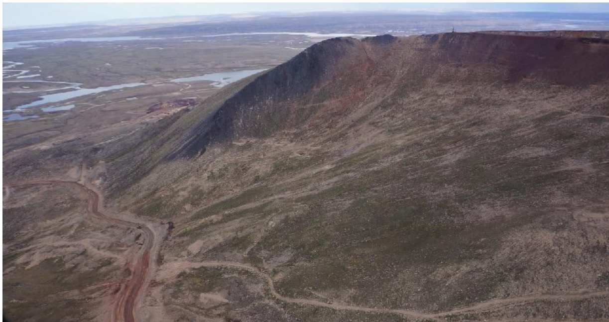
PHOTO 1 - Mary River Mine Site Deposit 1 and Mine Haul Road, July 2016