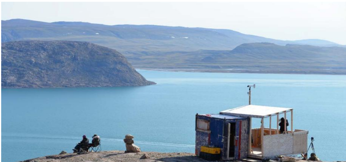
PHOTO 13 – Observation platform on Bruce Head, North of Milne Port, August 2016