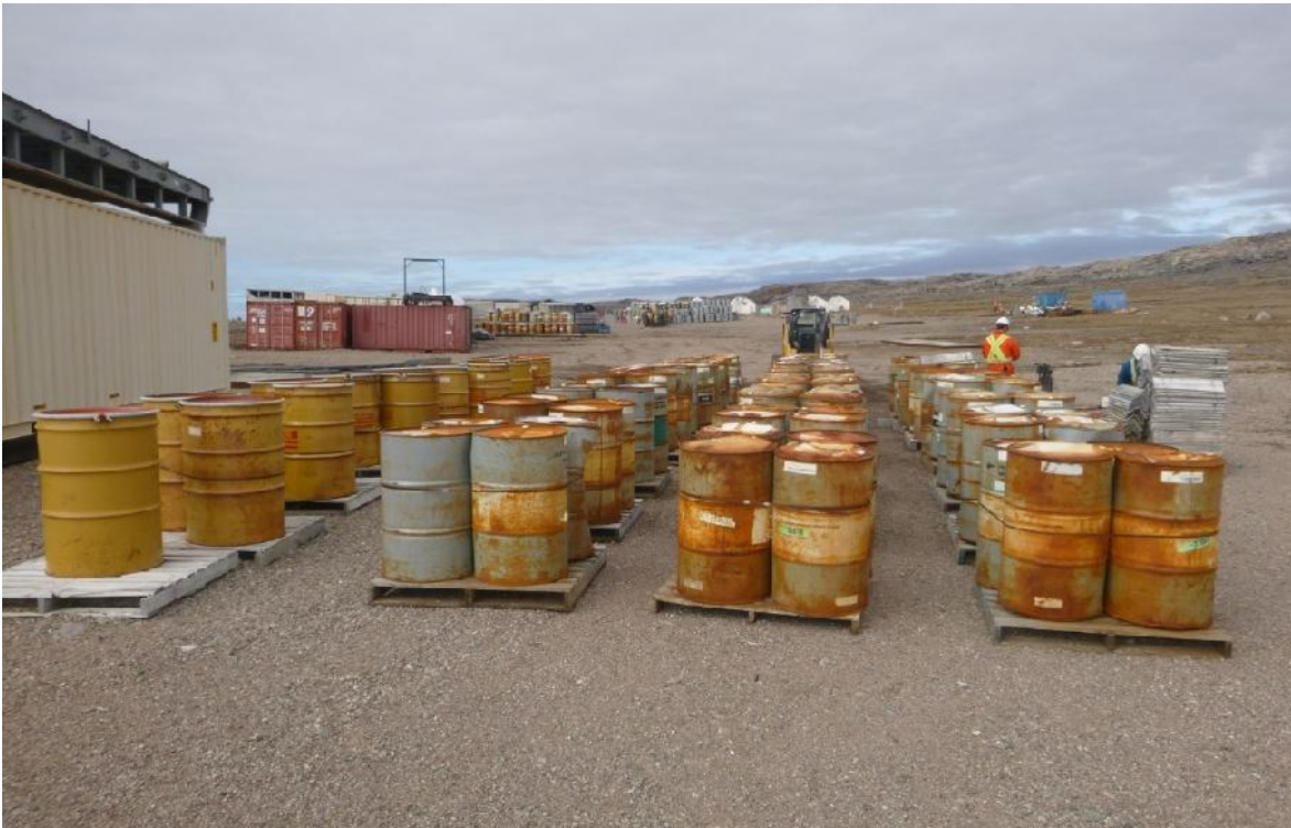
PHOTO 2 – Steensby Port waste barrels being manifested for backhaul, August 2016