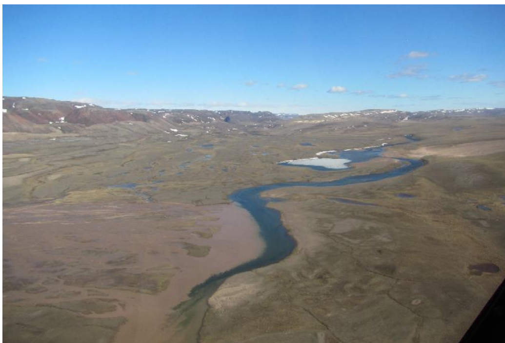
PHOTO 18 – Phillips Creek Natural Sedimentation Event (June, 2016) – Phillips Creek Tributary flowing into Phillips Creek (Upstream of Km 17 Bridge)