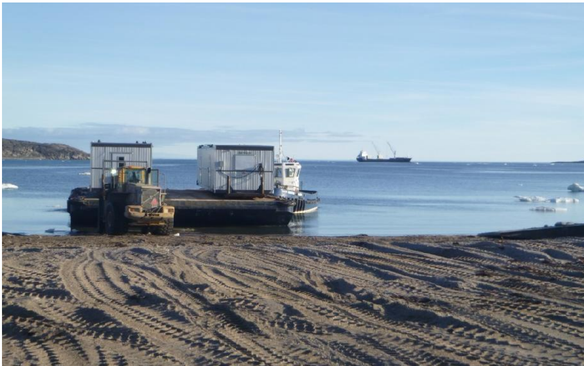
PHOTO 3 – Steensby Camp Structure Being Loaded for Transport to Milne Port, August 2016