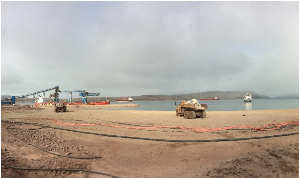
PHOTO 1 - Bulk Fuel Tanker in Milne Inlet, September 2016