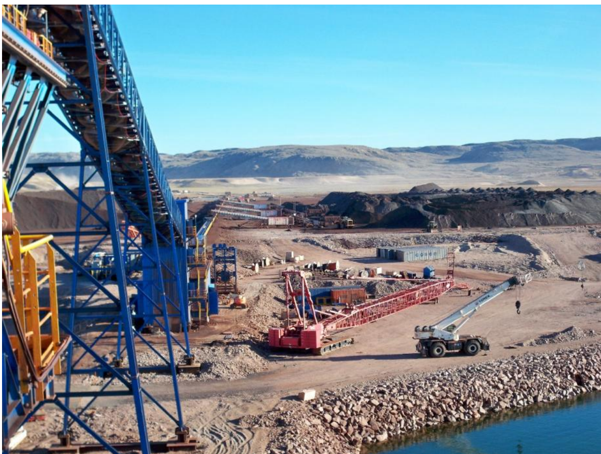
PHOTO 4 - Milne Port Ship loader Conveyor and Stockpile, 2016