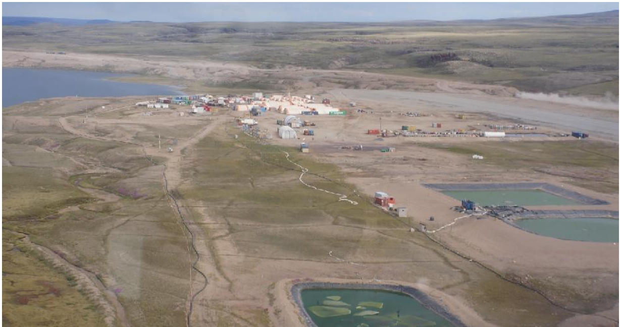
PHOTO 10 - Mary River Exploration Camp and Waste Settling Ponds, July 2016