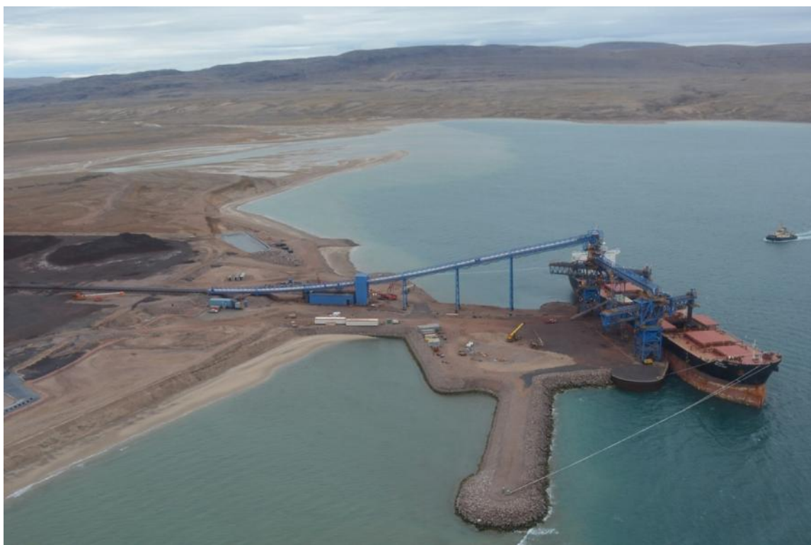
PHOTO 2 - Milne Port Ship loader and Ore Dock, August 2016