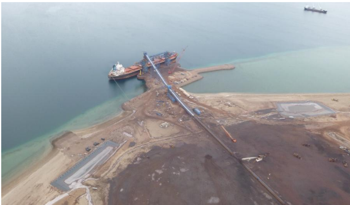
PHOTO 11 - Aerial view of the Milne Port Ship Loader and Sedimentation Ponds, September 2016