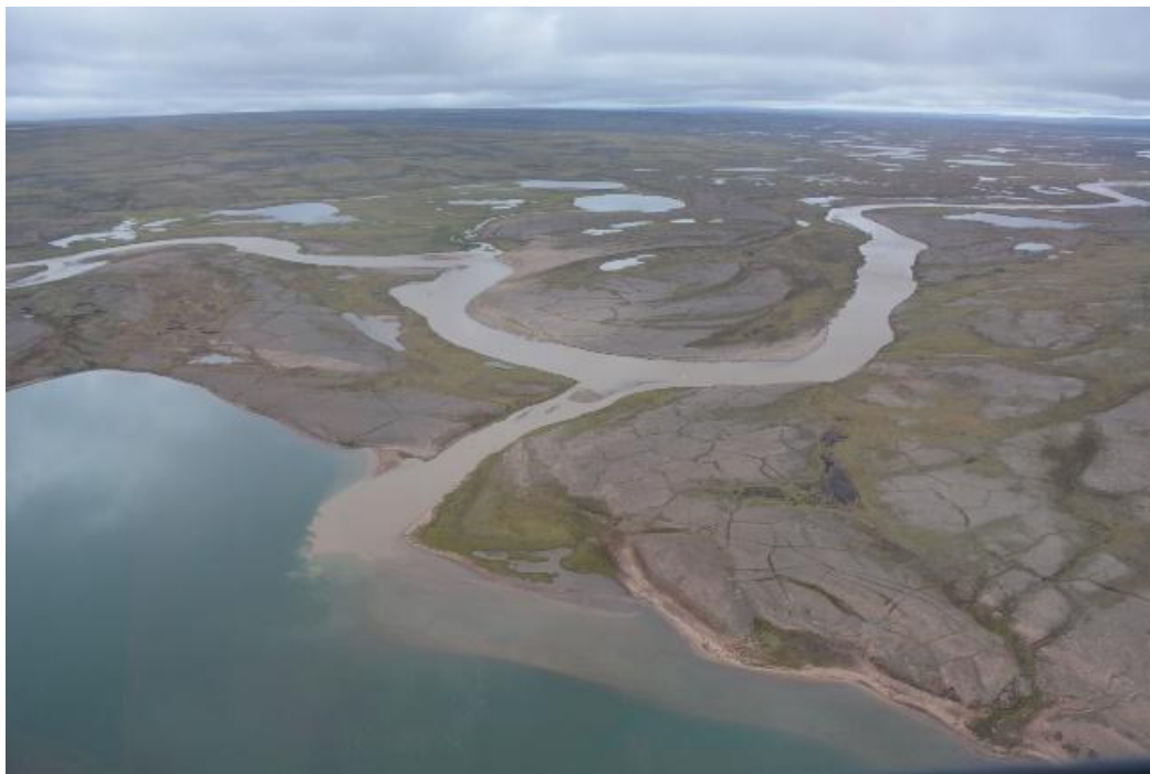
PHOTO 18 – Mary River Natural Sedimentation Event (July, 2016) – Mary River backflow entering Sheardown Lake (SE Basin)