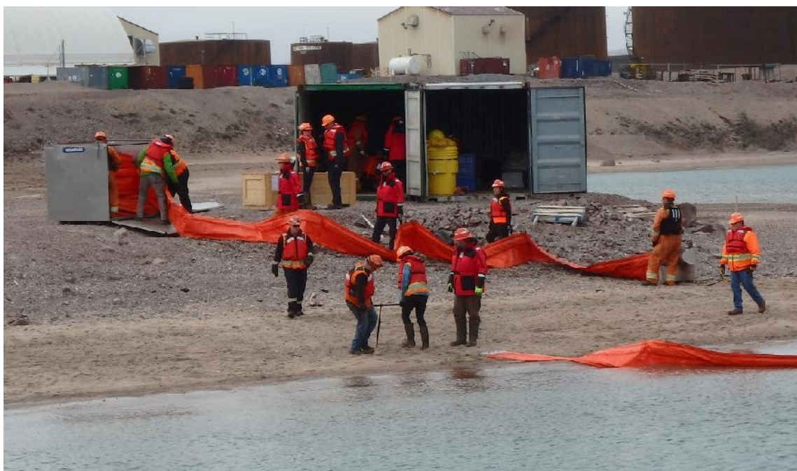
PHOTO 5 - Marine Spill Response Training at Milne Port, July 2016