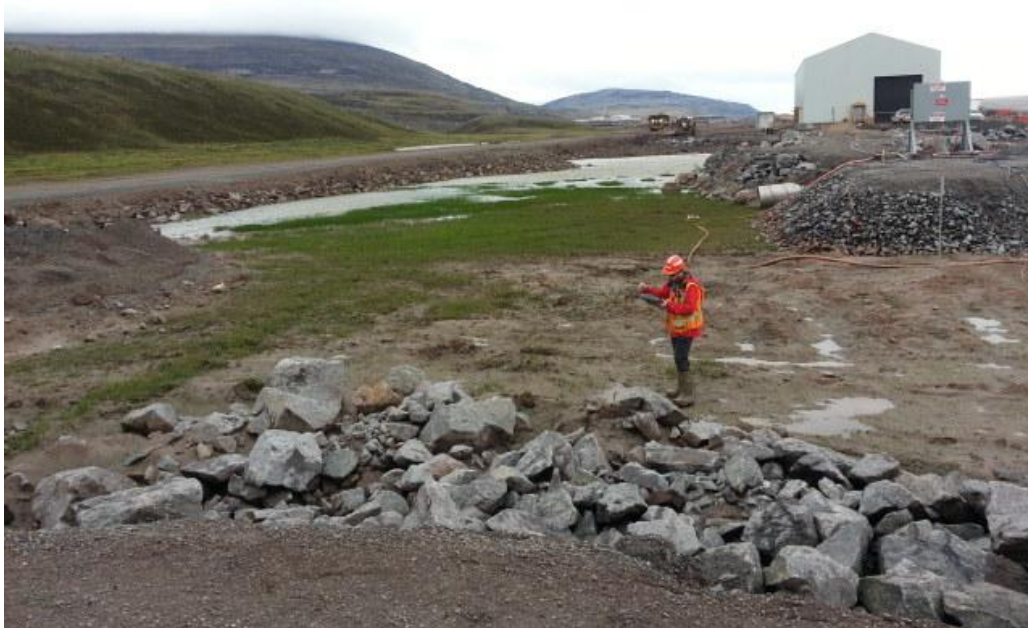
PHOTO 11 – BIM Employee Conducting AMBNS Survey at Airstrip Apron, July 2016