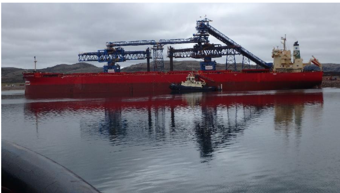
PHOTO 5 - Milne Port Ship loader with Ore freighter berthed at Ore Dock, 2016