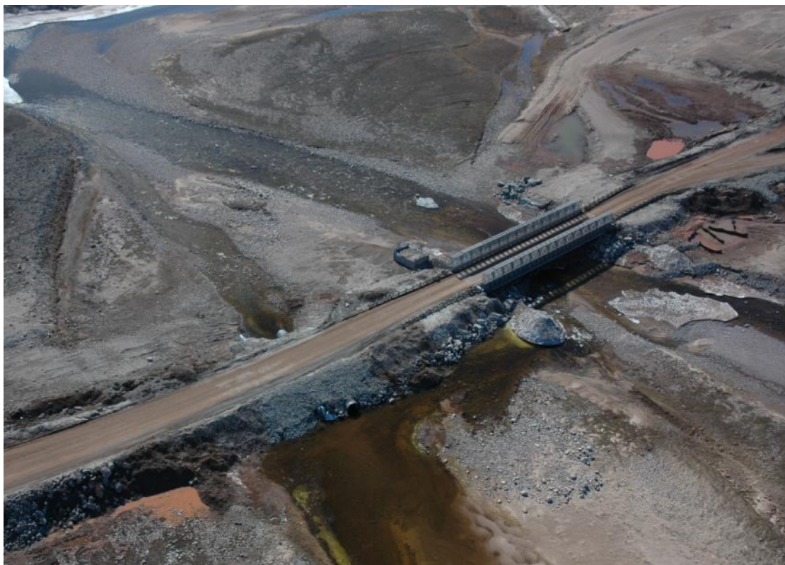
PHOTO 6 – Aerial view of the Milne Port Tote Road Km 97 Bridge, June 2016