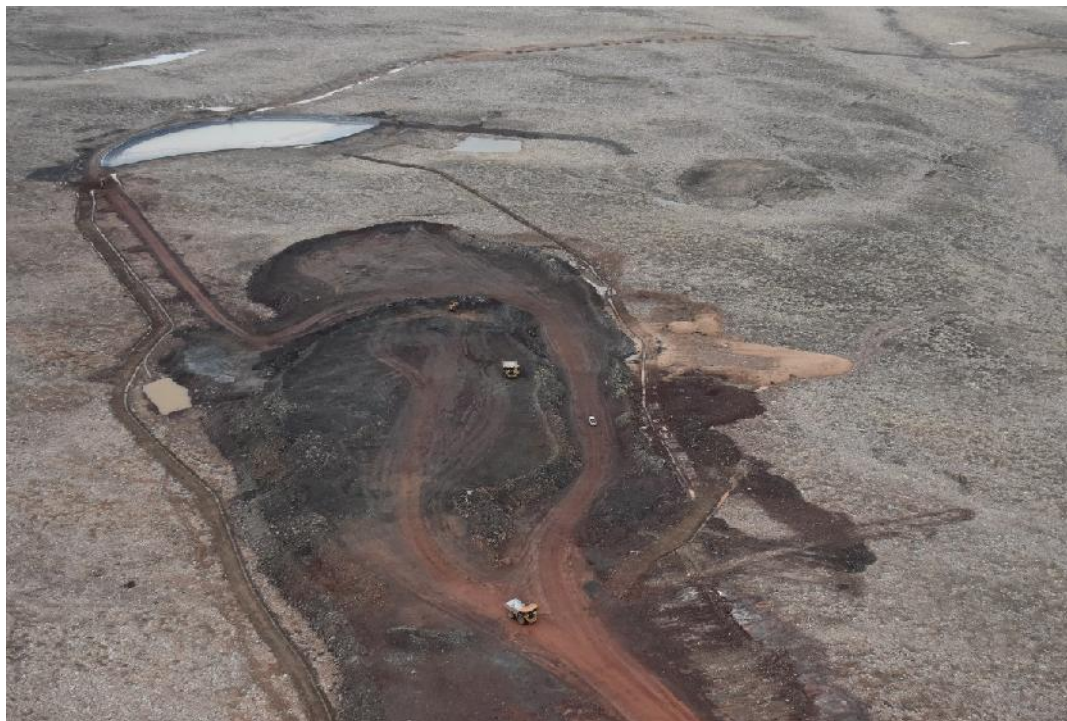
PHOTO 6 - Mary River Mine Site Waste Rock Stockpile and Waste Rock Sedimentation Pond, July 2016