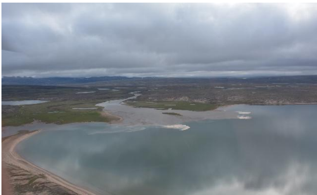
PHOTO 19 – Mary River Natural Sedimentation Event (July, 2016) – Mary River flowing into Mary Lake (South Basin)