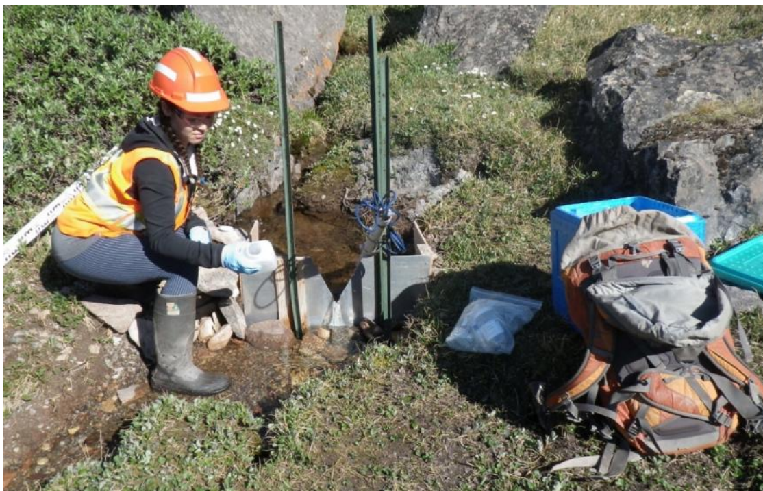
PHOTO 16 – Weekly Water Sampling at MQ-C-A with a Hydrological Monitoring Weir, July 2016