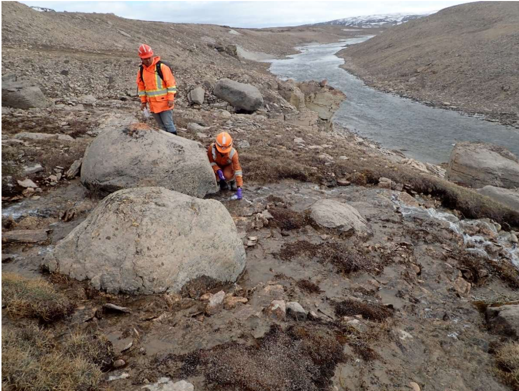
PHOTO 11 – Routine Tote Road Water Quality Monitoring CV-129 – June 2019