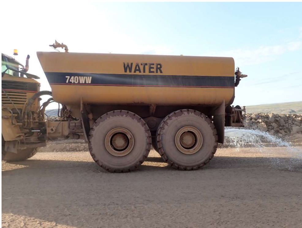
PHOTO 2 – Dust Suppression Calcium Truck on Tote Road – August 2019