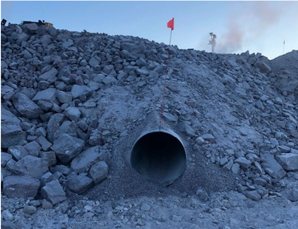
PHOTO 5 – Completed Construction on Culvert CV-111 – February 2019