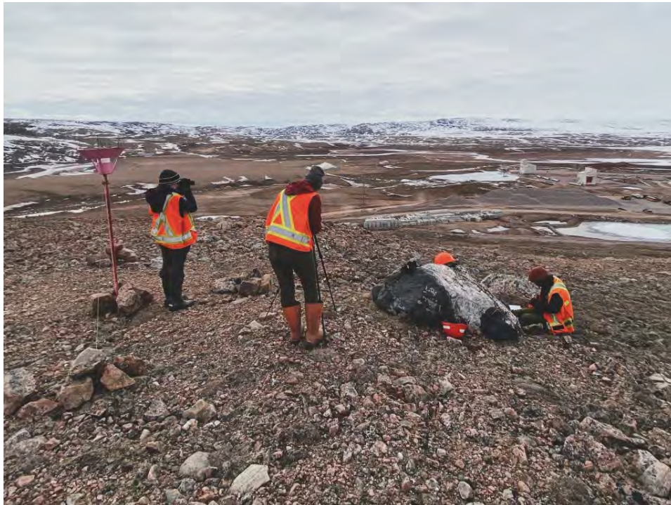
PHOTO 22 –Height of land survey conducted with Environmental Dynamics Inc. – June 2020