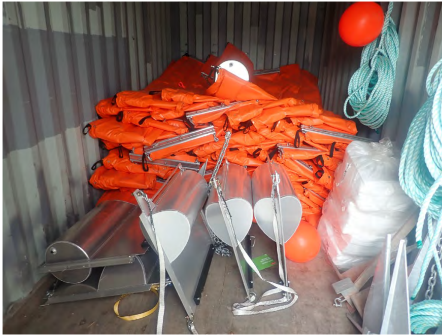
PHOTO 21 –Spill response equipment used during the OPEP marine spill response training– September 2020