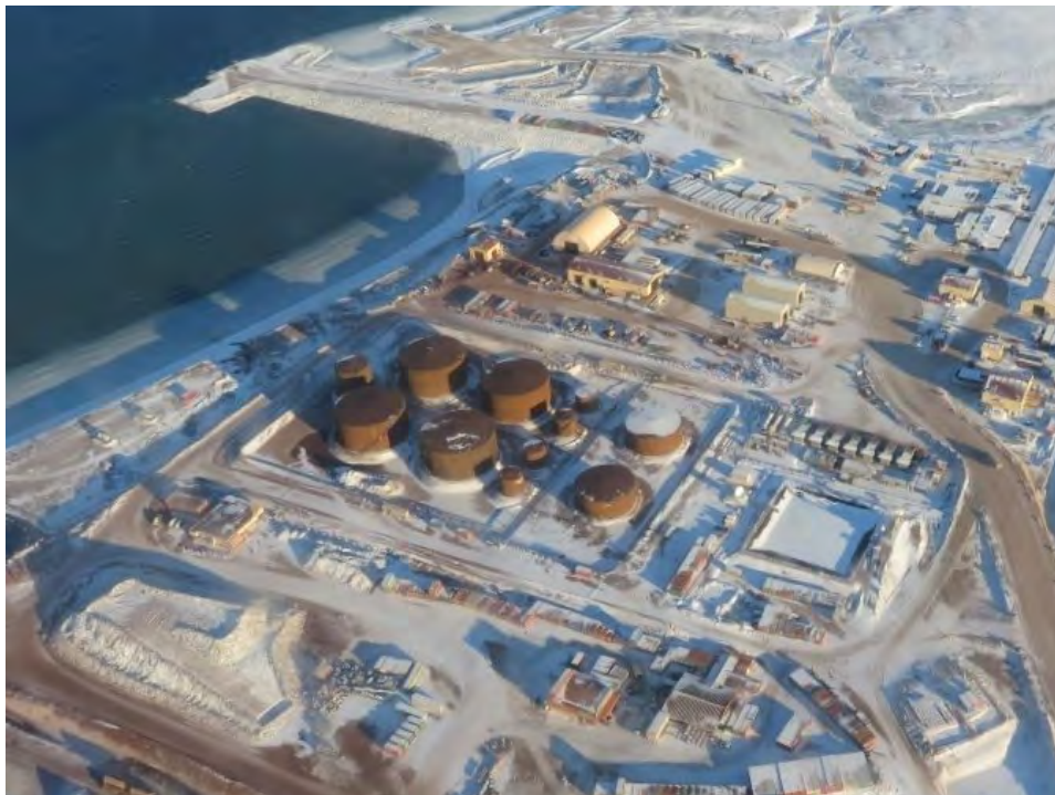
PHOTO 4 – Aerial view of steel tank bulk fuel storage facility– October 2020