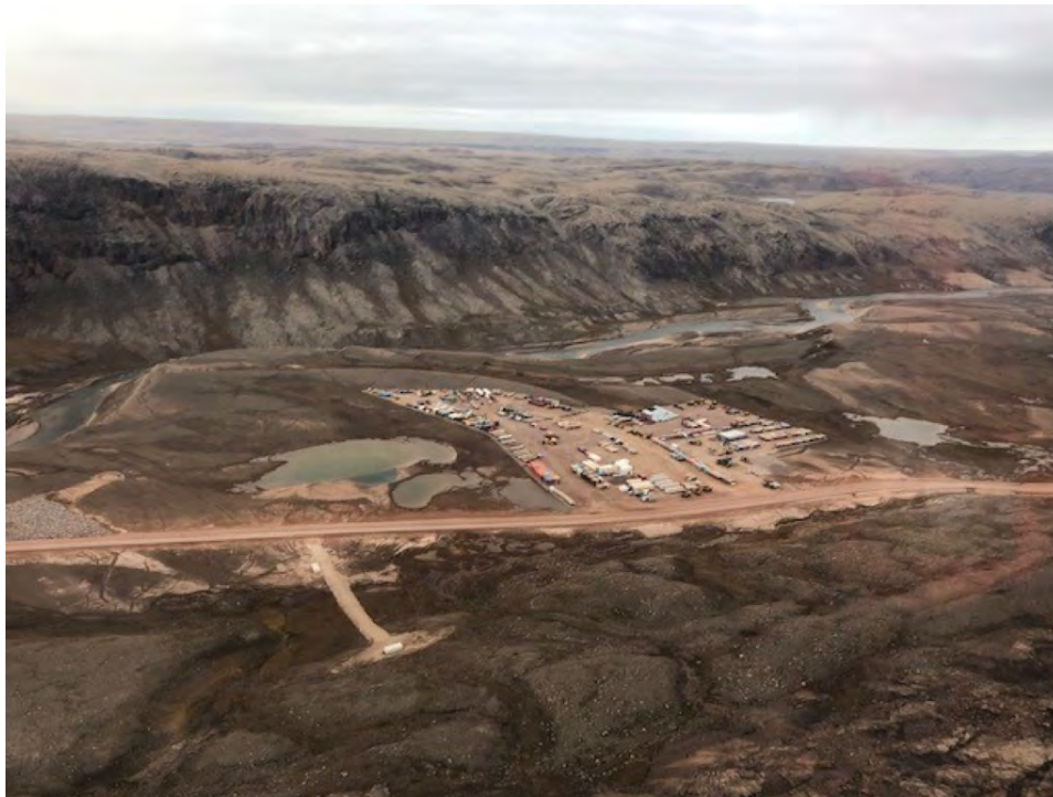
PHOTO 16 – Aerial view of magazine storage area, L2 and R3 Laydowns– September 2020