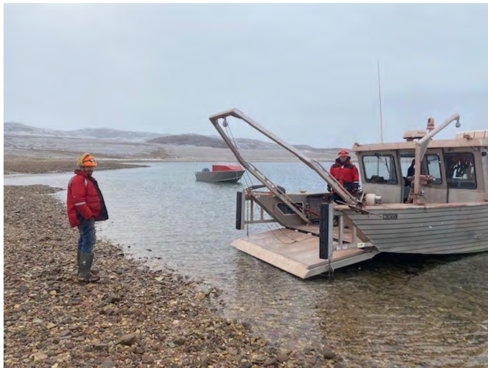
PHOTO 24 –New sustainable development vessel for MEEMP program– September 2020