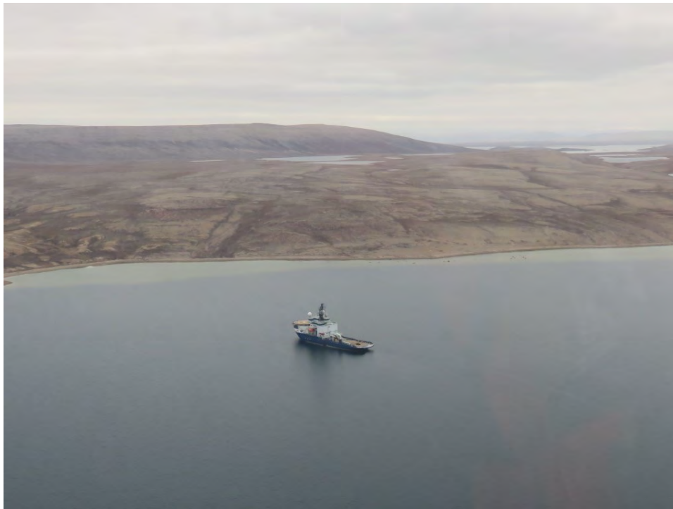
PHOTO 2 – The Botnica anchored in Milne Inlet in preparation for ice management– September 2020