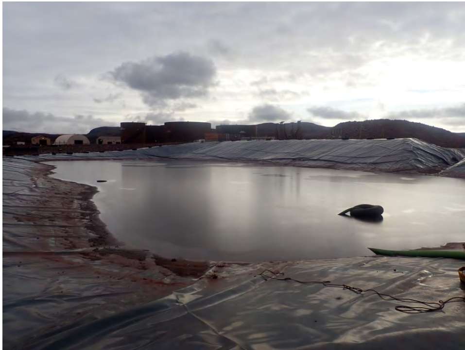
PHOTO 5 – East ore pad surface water management pond– September 2020