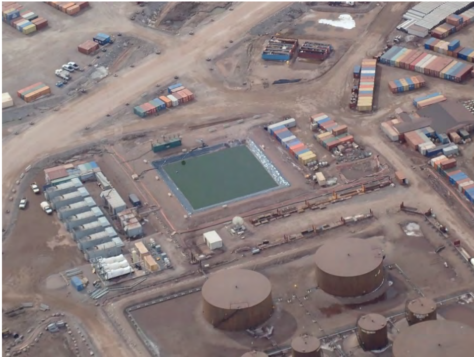
PHOTO 12 – Aerial view of the polishing waste stabilization pond (MP-01A)– June 2020