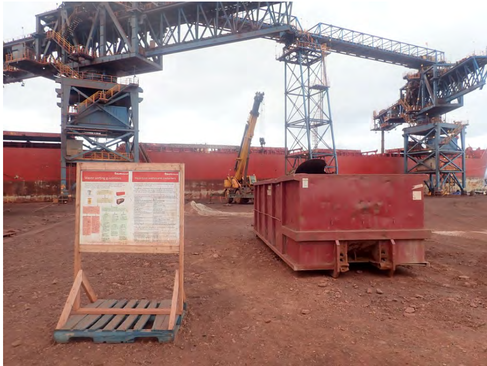
PHOTO 27 –New waste sorting guidelines bulletins posted at each landfill bin – September 2020