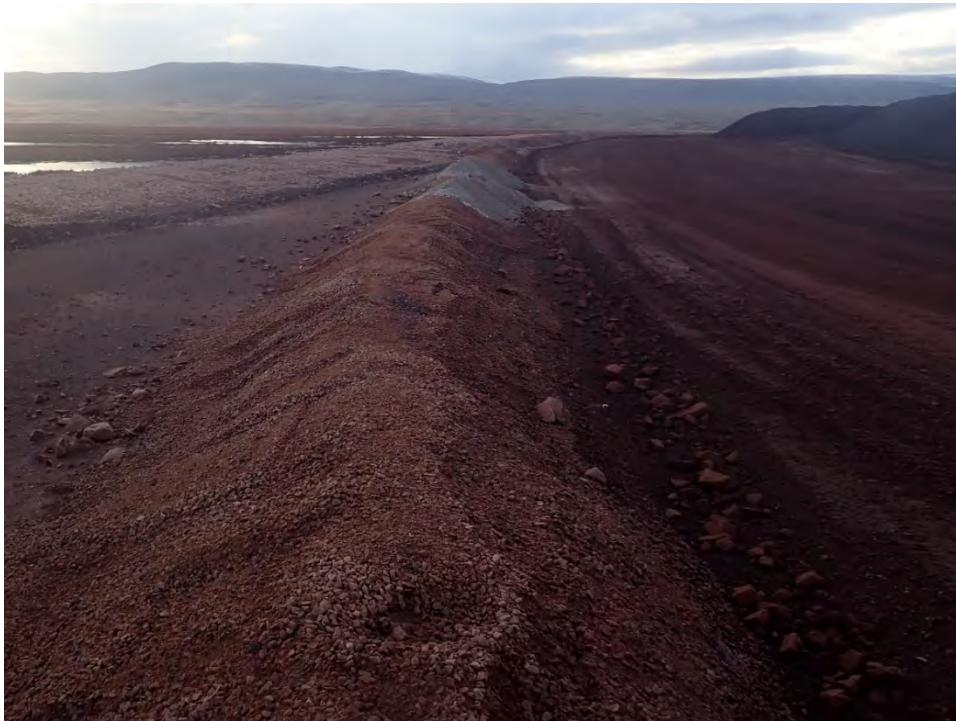
PHOTO 29 –Berm constructed along southern perimeter of the ore pad– September 2020