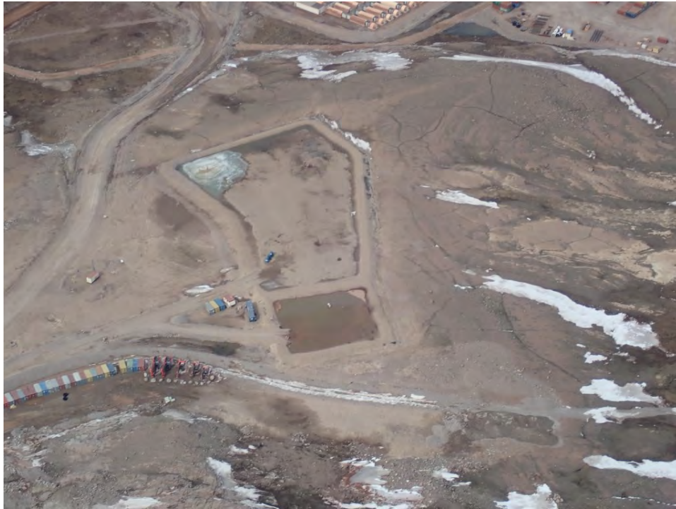
PHOTO 19 – Aerial view of the land farm and contaminated snow berm– June 2020