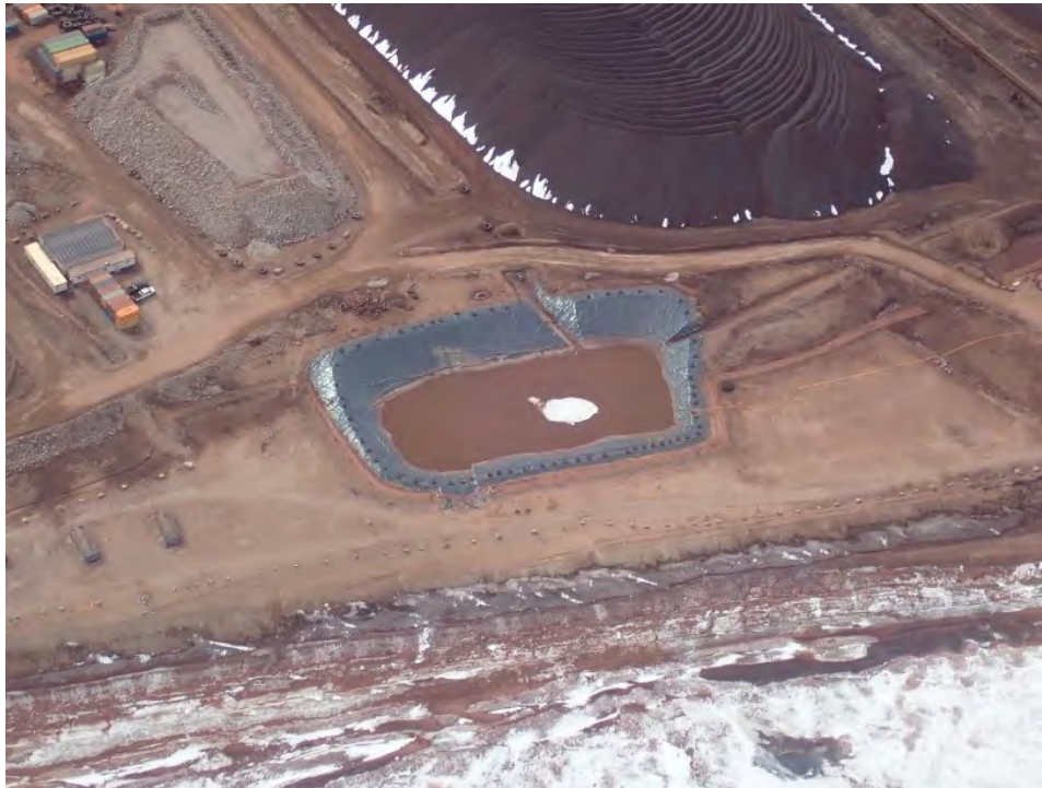
PHOTO 10 – Aerial view of east ore pad surface water management pond– June 2020