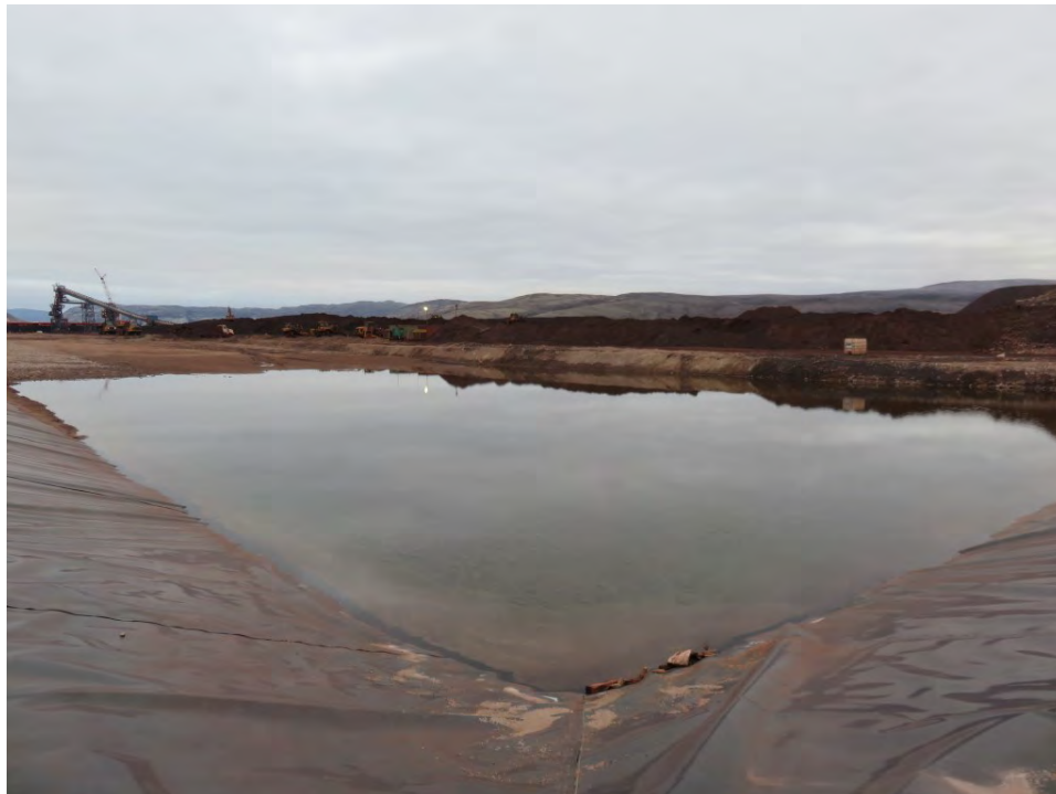
PHOTO 30 – Southwest ore pad surface water management pond–September 202