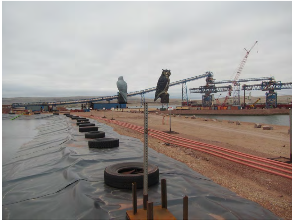
PHOTO 11 – Bird deterrent methods implemented at ore pad surface water management ponds– July 2020