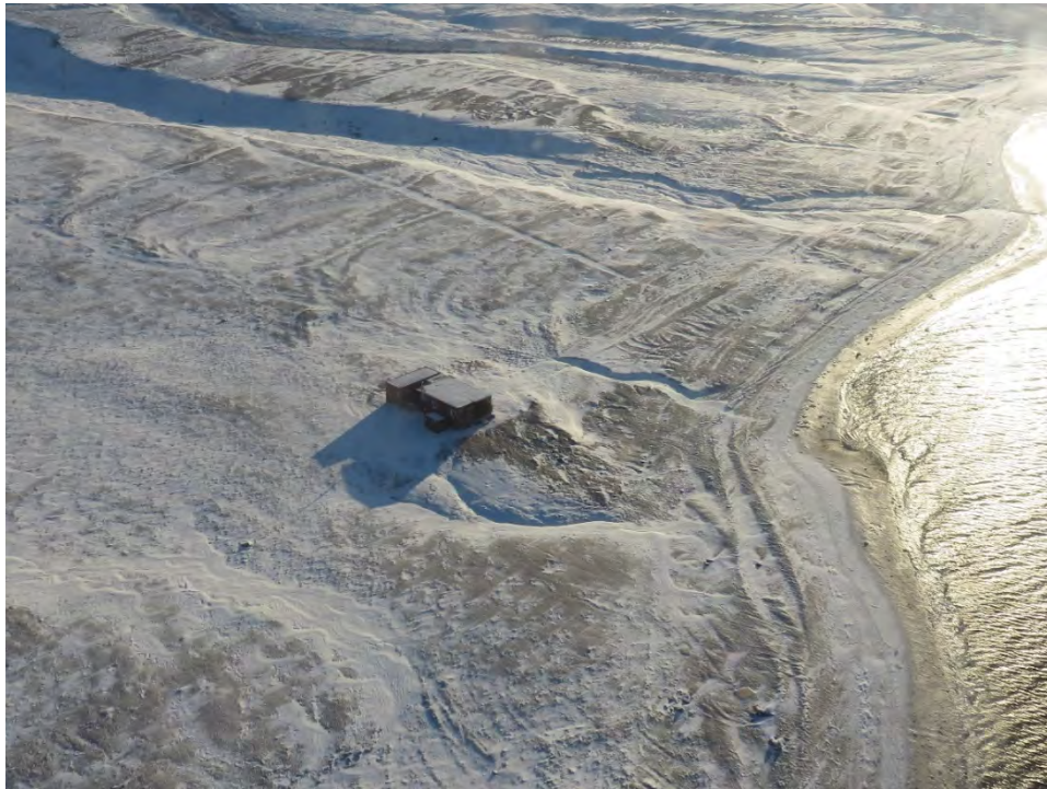
PHOTO 17 – Aerial view of HTO cabin constructed during the 2020 winter season– October 2020