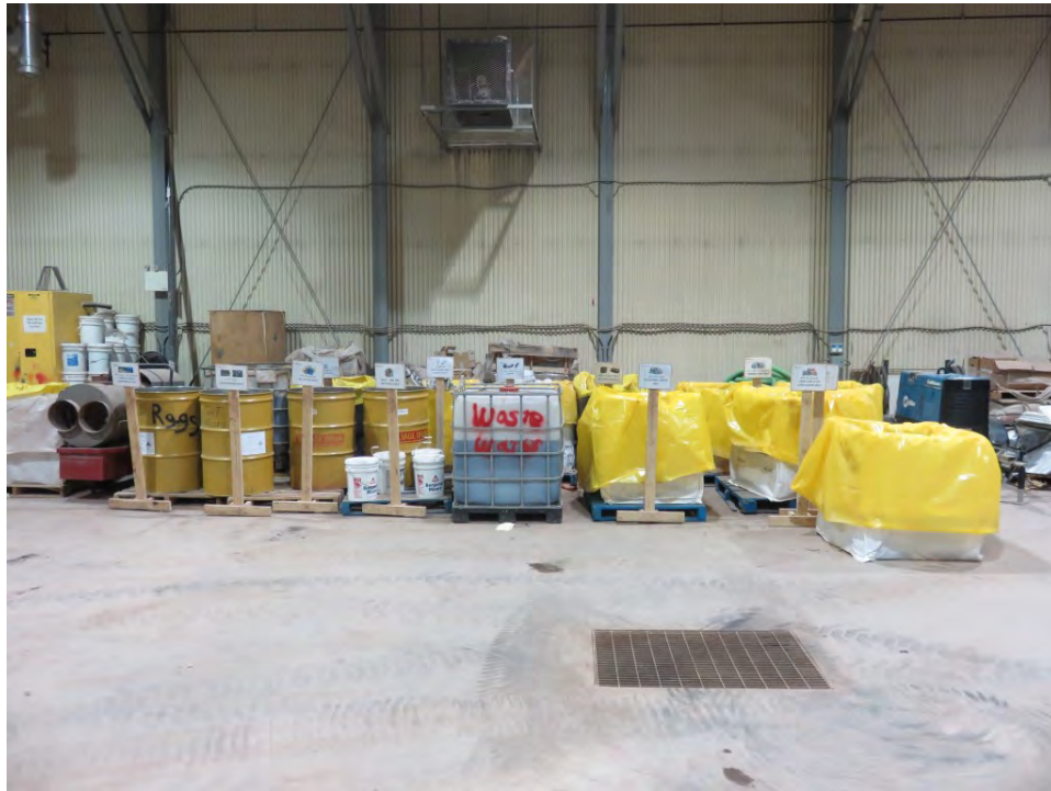
PHOTO 25 –Waste management at the incinerator building– September 2020