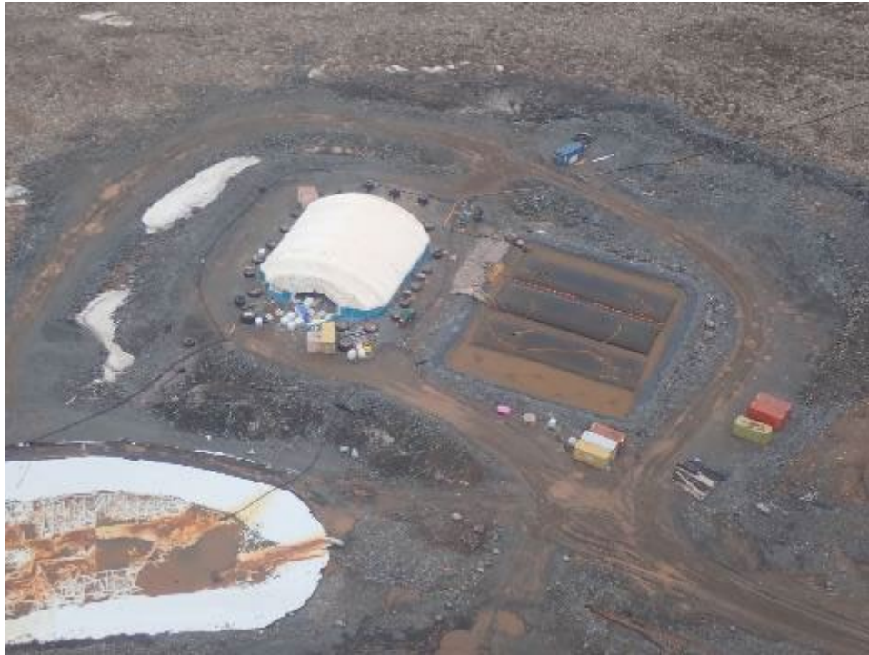
Photo 5 – Aerial View of Waste Rock Facility (WRF) Water Treatment Plant (WTP) – July 2021