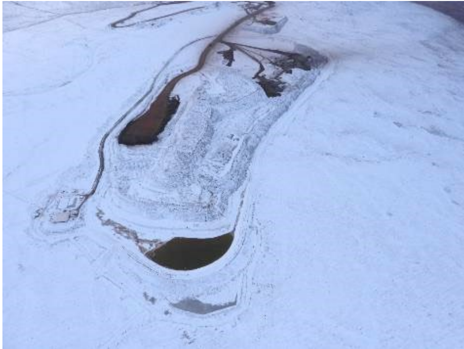
Photo 6 – Aerial View of Waste Rock Facility (WRF) and WRF Pond – September 2021