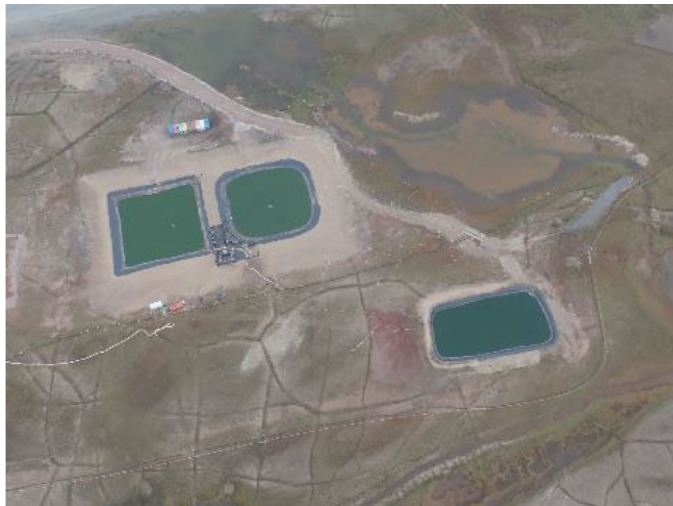
Photo 38 – Aerial View of Mine Site Polishing Waste Stabilization Ponds (PWSPs) – July 2021