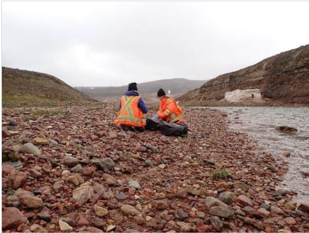
Photo 45 – Mine Site AEMP Summer Streams Sampling at MRY-REF2 – July 2021