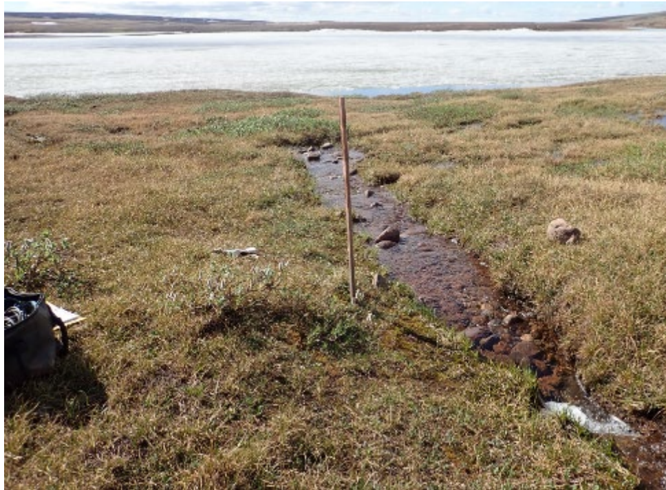
Photo 41 – Mine Site Surveillance Network Program (SNP) Monitoring at MS-C-H – June 2021