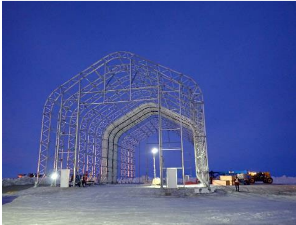
Photo 11 – New Maintenance Shop Construction at KM110.5 Laydown – November 2021