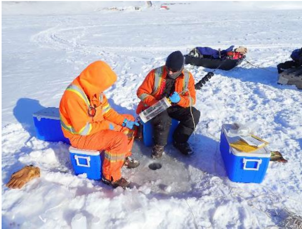
Photo 43 – Mine Site Aquatic Effects Monitoring Program (AEMP) Winter Lake Sampling – April 2021