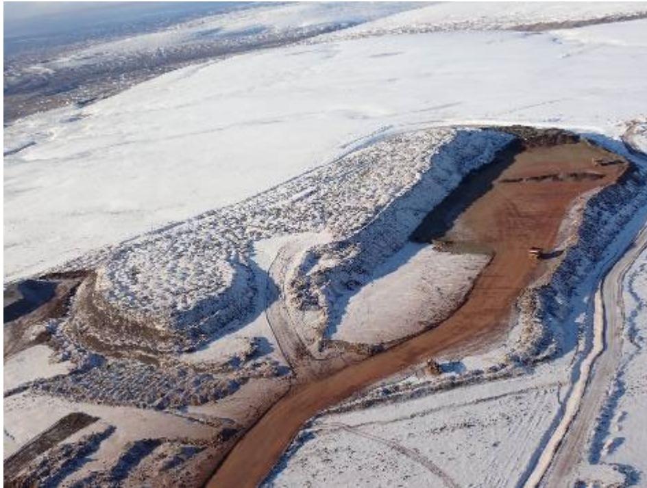
Photo 7 – Aerial View of Waste Rock Facility (WRF) – September 2021