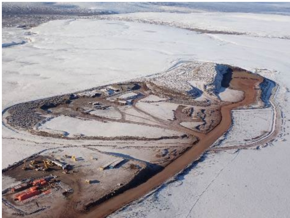
Photo 10 – Aerial View of Waste Rock Facility (WRF) Expansion and KM110.5 Laydown – September 2021