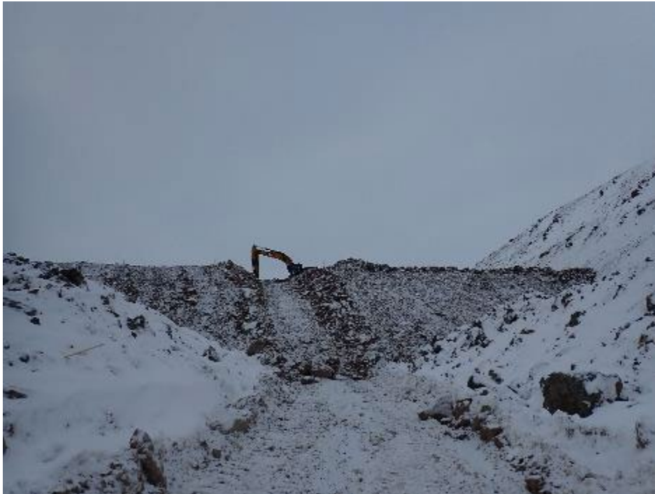
Photo 15 – Construction of New KM105 Surface Water Management Pond – October 2021