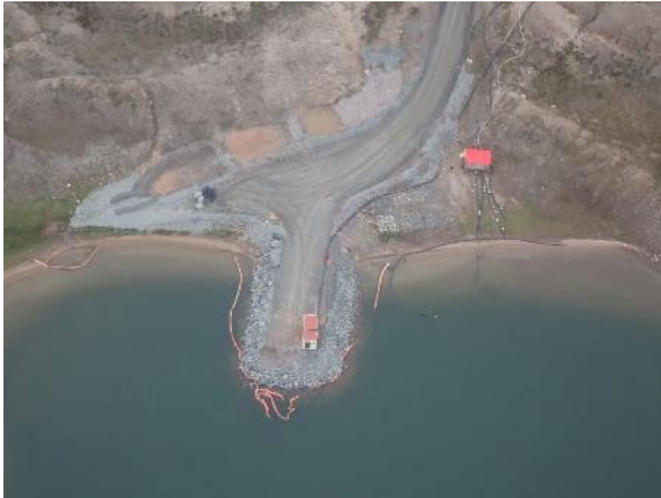
Photo 35 – Aerial View of Mine Site Camp Lake Settling Ponds – July 2021