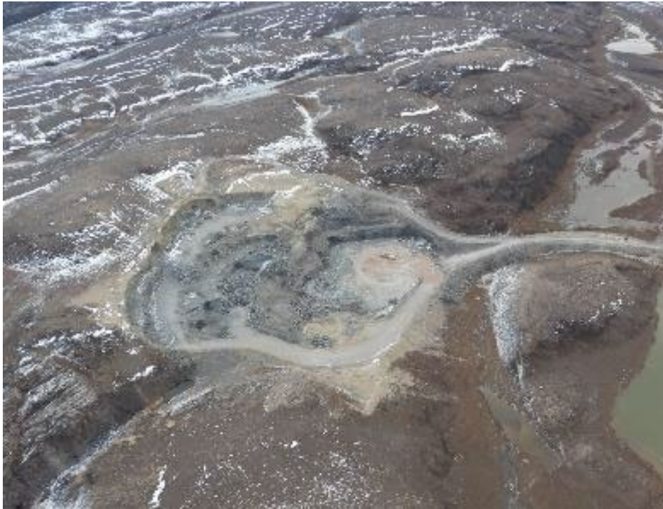
Photo 33 – Aerial View of Mine Site Quarry (QRM2) – September 2021