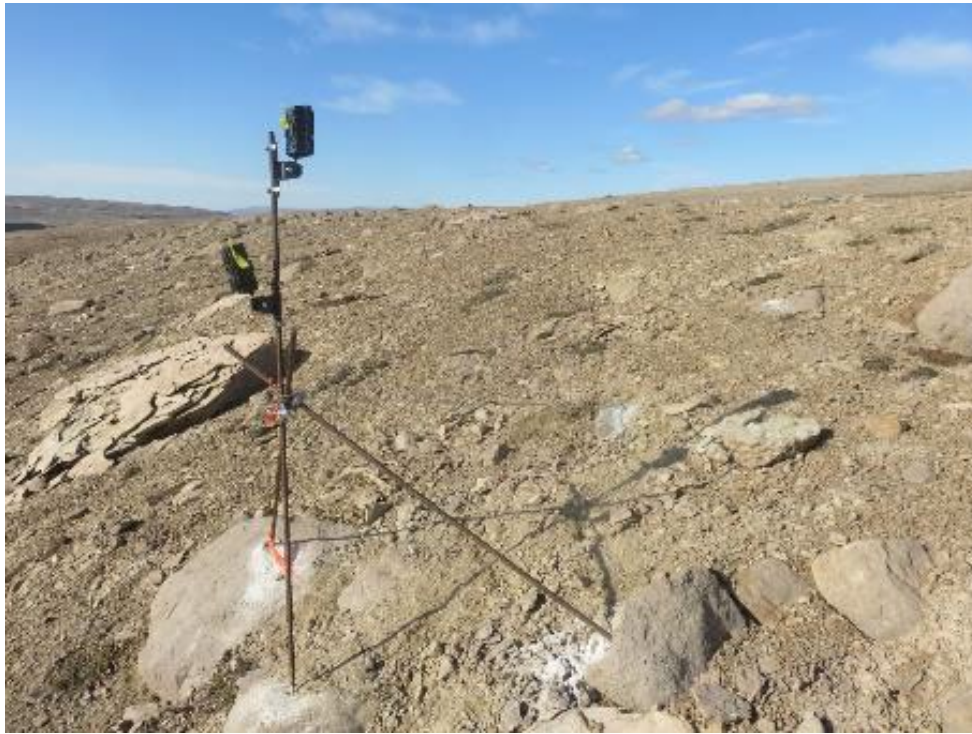
Photo 49 – New wildlife Camera Installed at Mine Site – August 2021