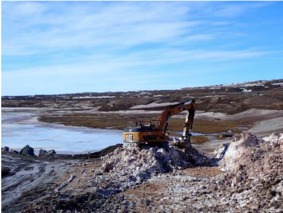
Photo 34 – Freshet Preparations on Camp lake Jetty Road – May 2021