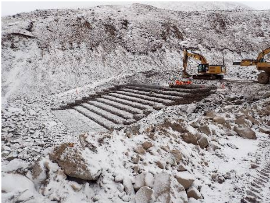
Photo 12 – Construction of New KM105 Surface Water Management Pond – October 2021