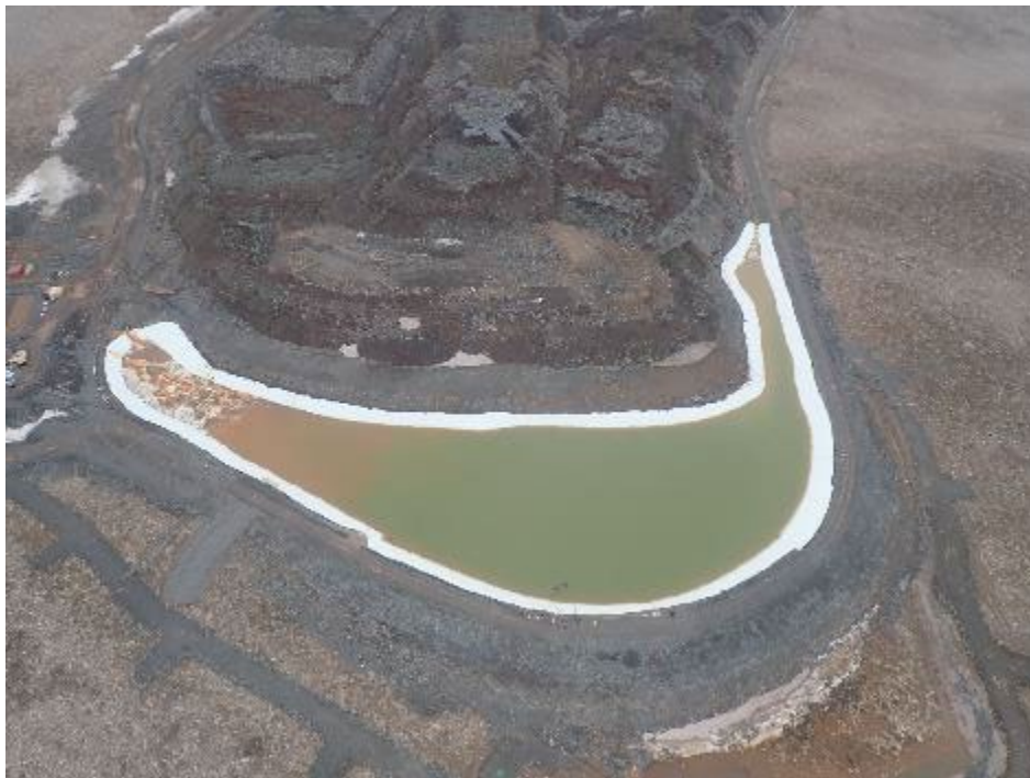
Photo 8 – Aerial View of Waste Rock Facility (WRF) Pond (MS-08) – July 2021