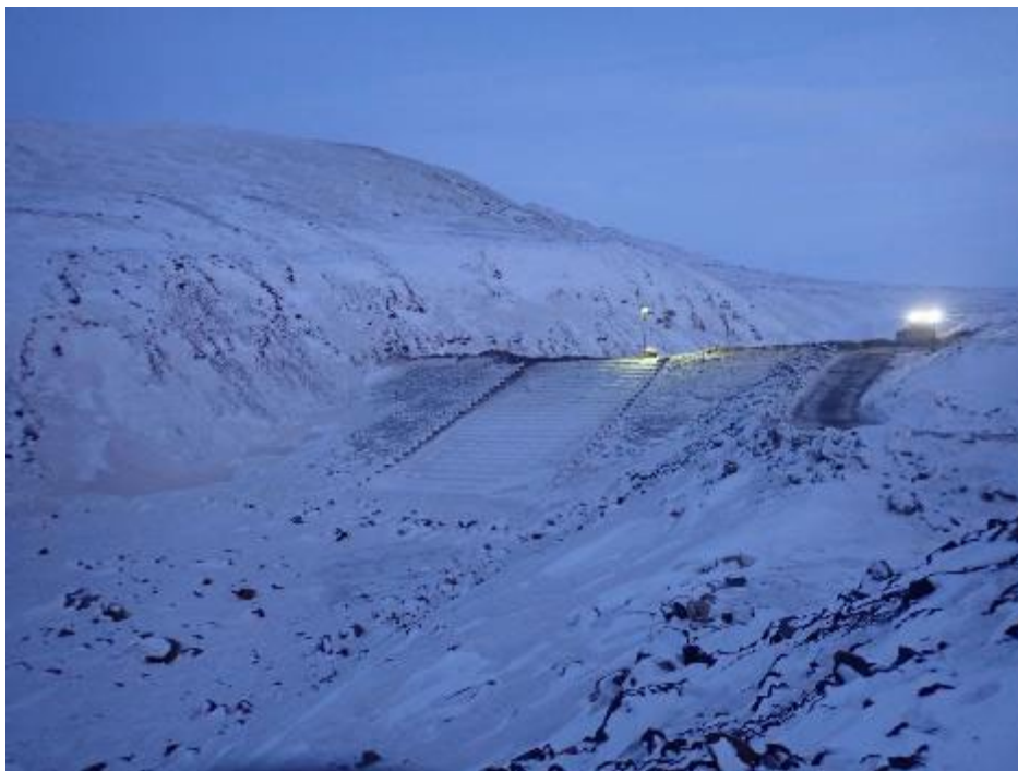
Photo 14 – Construction of New KM105 Surface Water Management Pond – December 2021