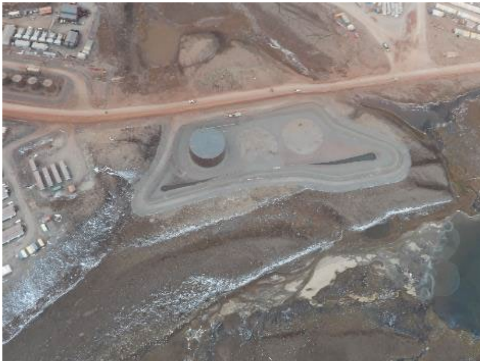
Photo 24 – Aerial View of Mine Site Tank Farm (MS-03B)– September 2021