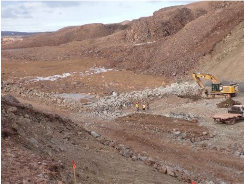
Photo 13 – Construction of New KM105 Surface Water Management Pond – September 2021