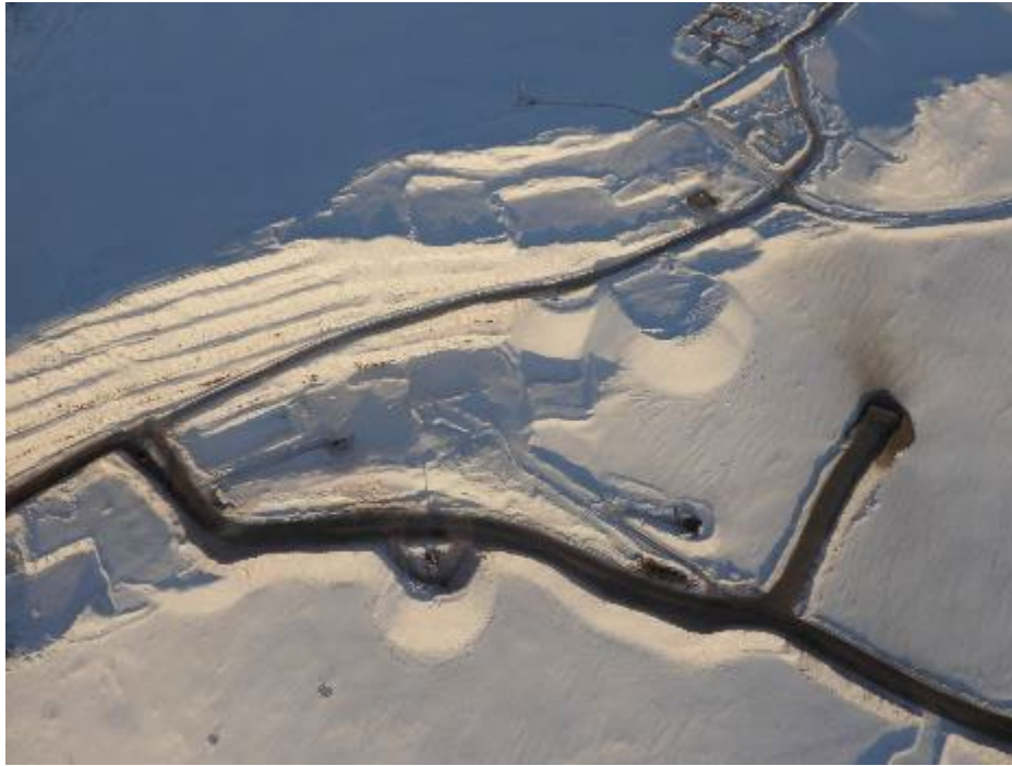
Photo 3 – Aerial View of Deposit No. 1 (Nuluujaak Pit) and Construction of By-Pass Road – October 2021