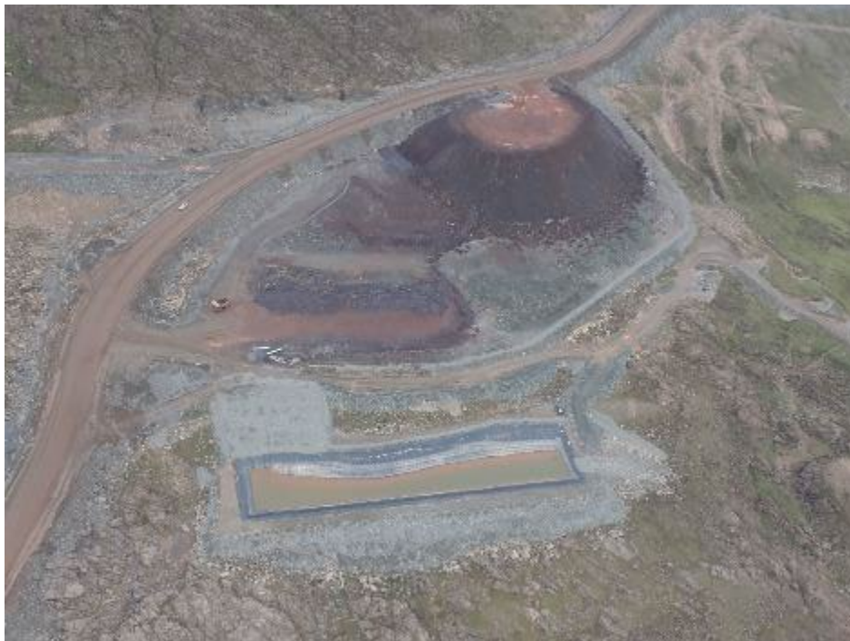
Photo 4 – Aerial View of ROM Stockpile Facility at KM106 – July 2021