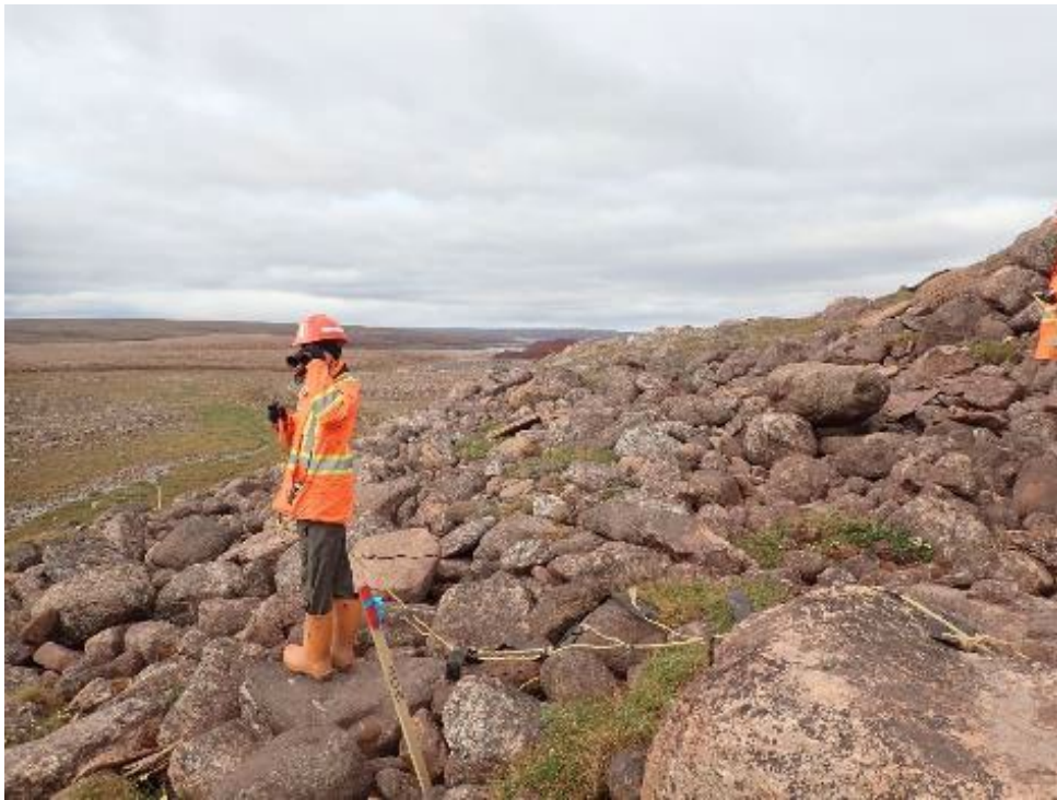
Photo 48 – Active Migratory Bird Nest Survey (AMBNS) at Mine Site – July 2021