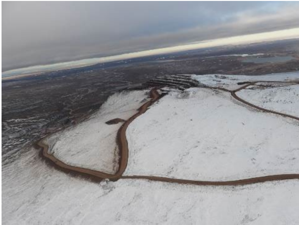
Photo 1 – Aerial View of Deposit No. 1 (Nuluujaak Pit) – September 2021