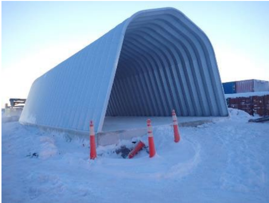
Photo 29 – Construction of New Mine Site Warehouse Kitting Building – November 2021