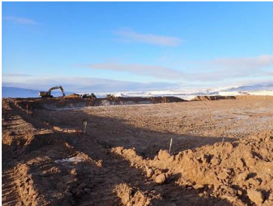
Photo 28 – Construction of New Mine Site Landfarm (MS-05) – October 2021