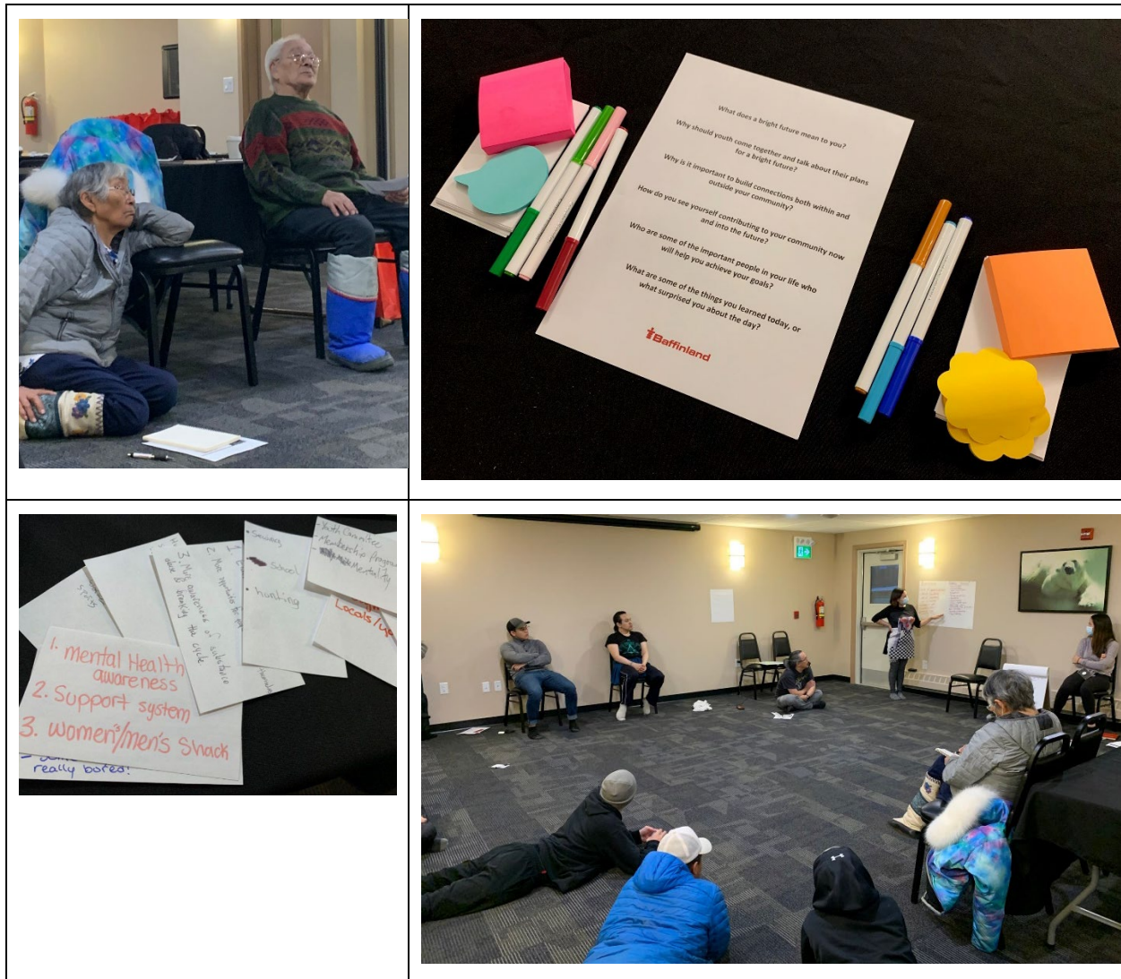
Photo 5: Baffinland held its first youth forum “Towards a Bright Future for Youth in North Baffin” in October 2021