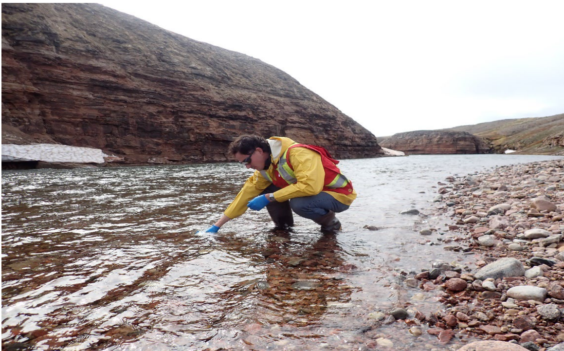
Photo 58. AEMP Water Sample Collection at Remote Site MRY-REF2 - June