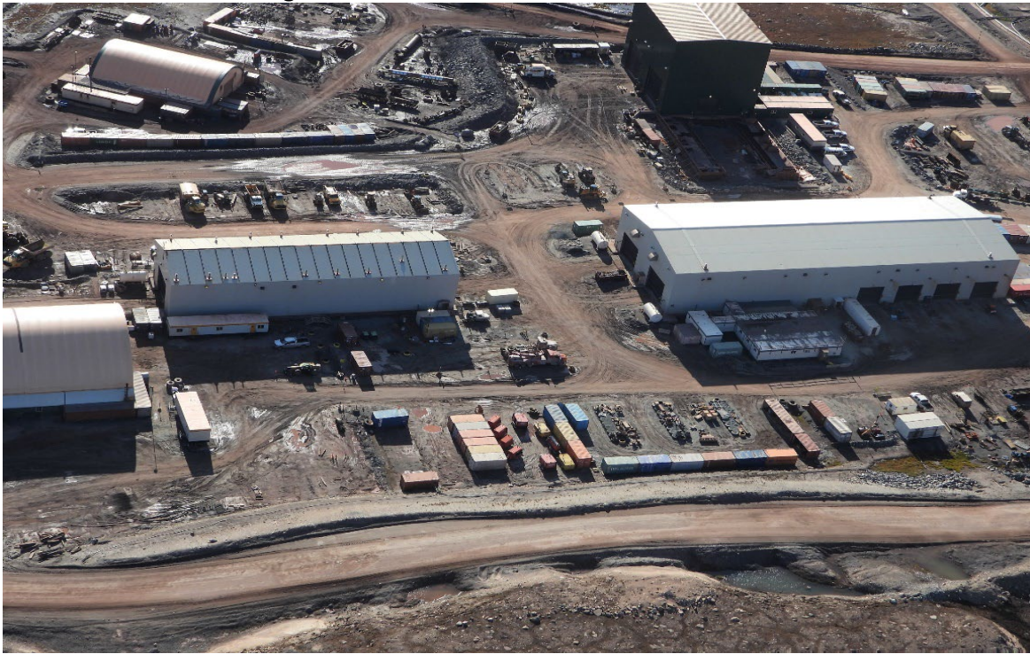
Photo 37. Mobile Maintenance Buildings - August