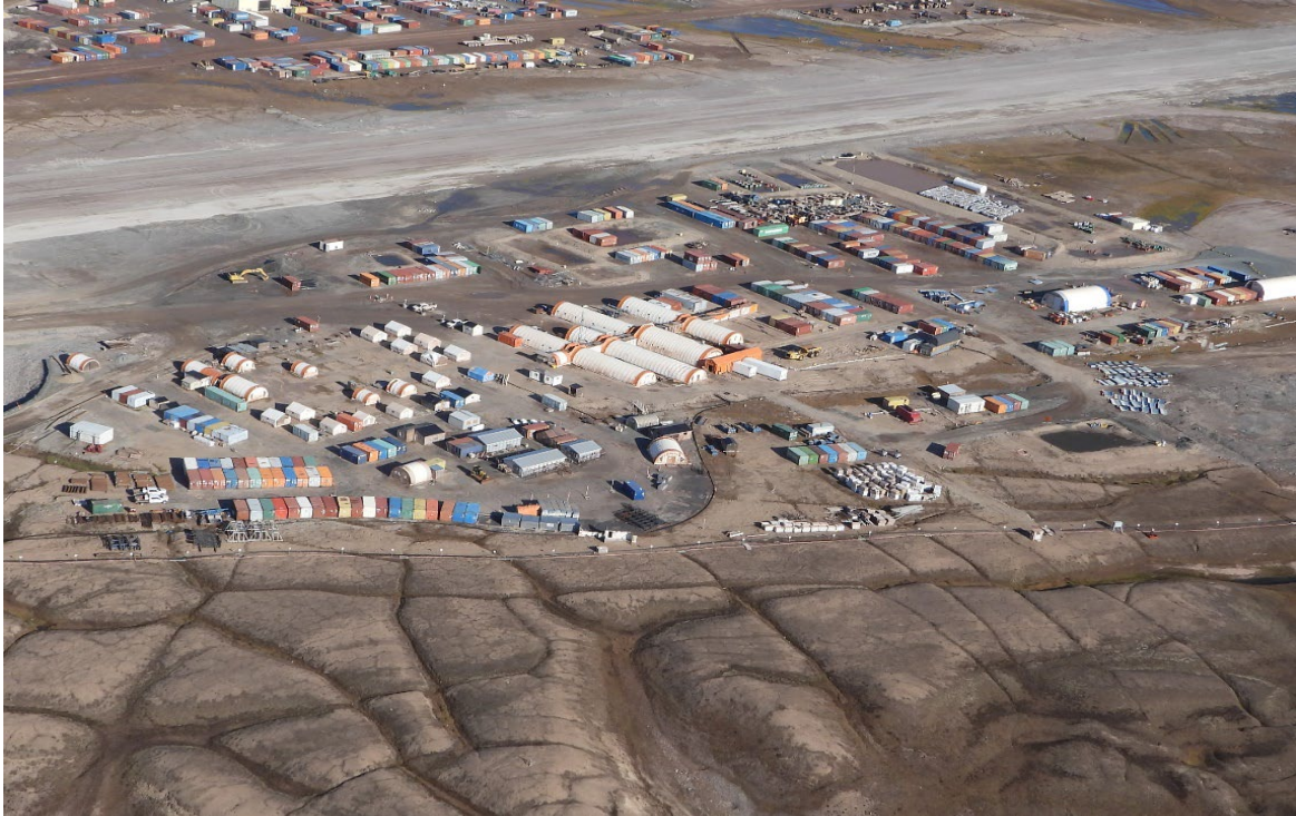
Photo 55. Weatherhaven Complex and Hazardous Waste Berms - August