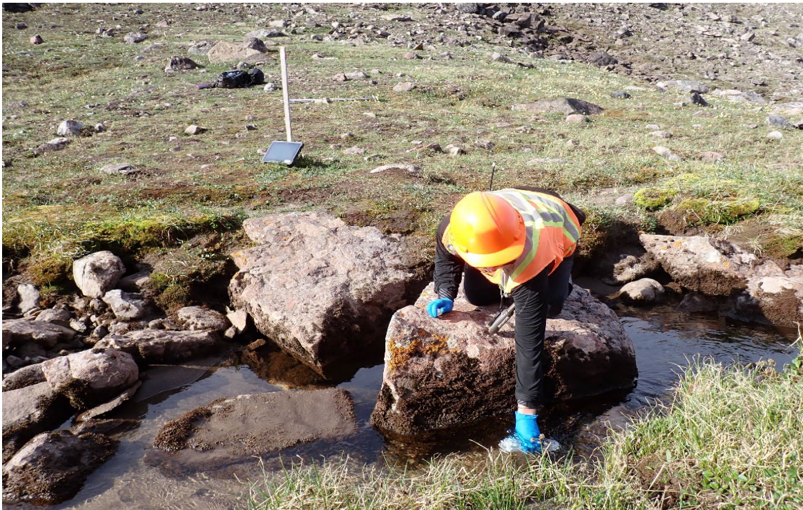
Photo 64. SNP Water Sample Collection - July