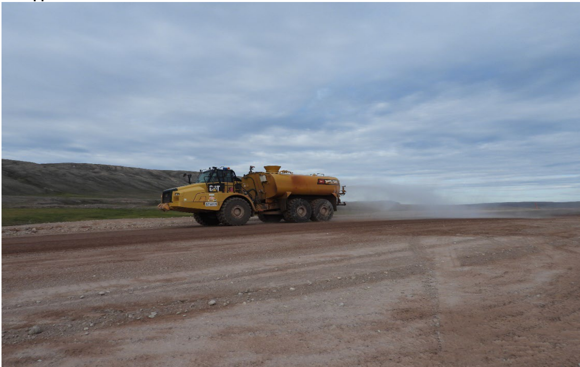
Photo 87. Applying Water to Site Roadways as Dust Suppression – June