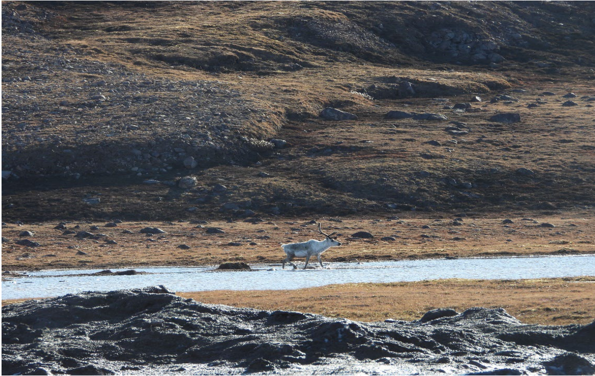
Photo 67. Lone Caribou Monitored While Walking in Stream near the Tote Road - June