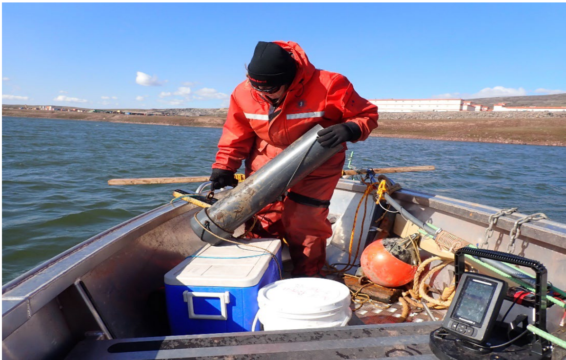
Photo 59. AEMP Retrieving Sediment Sample from Sheardown Lake - July