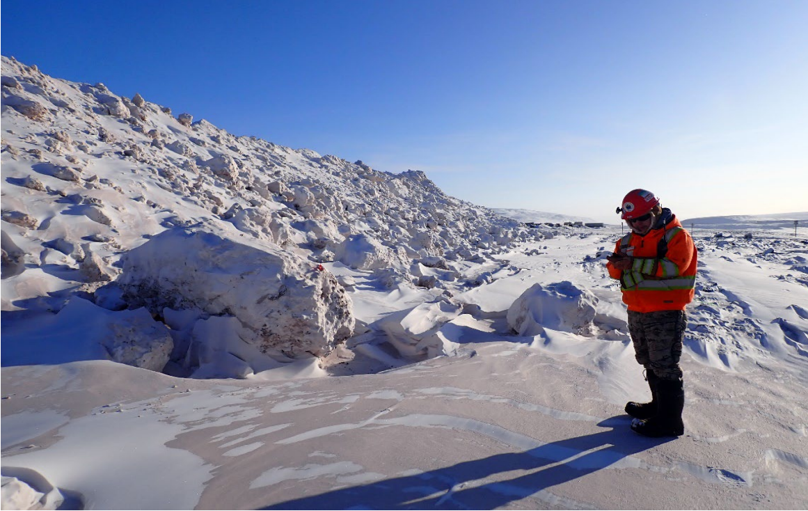
Photo 82. Snow Stockpile Inspection - March