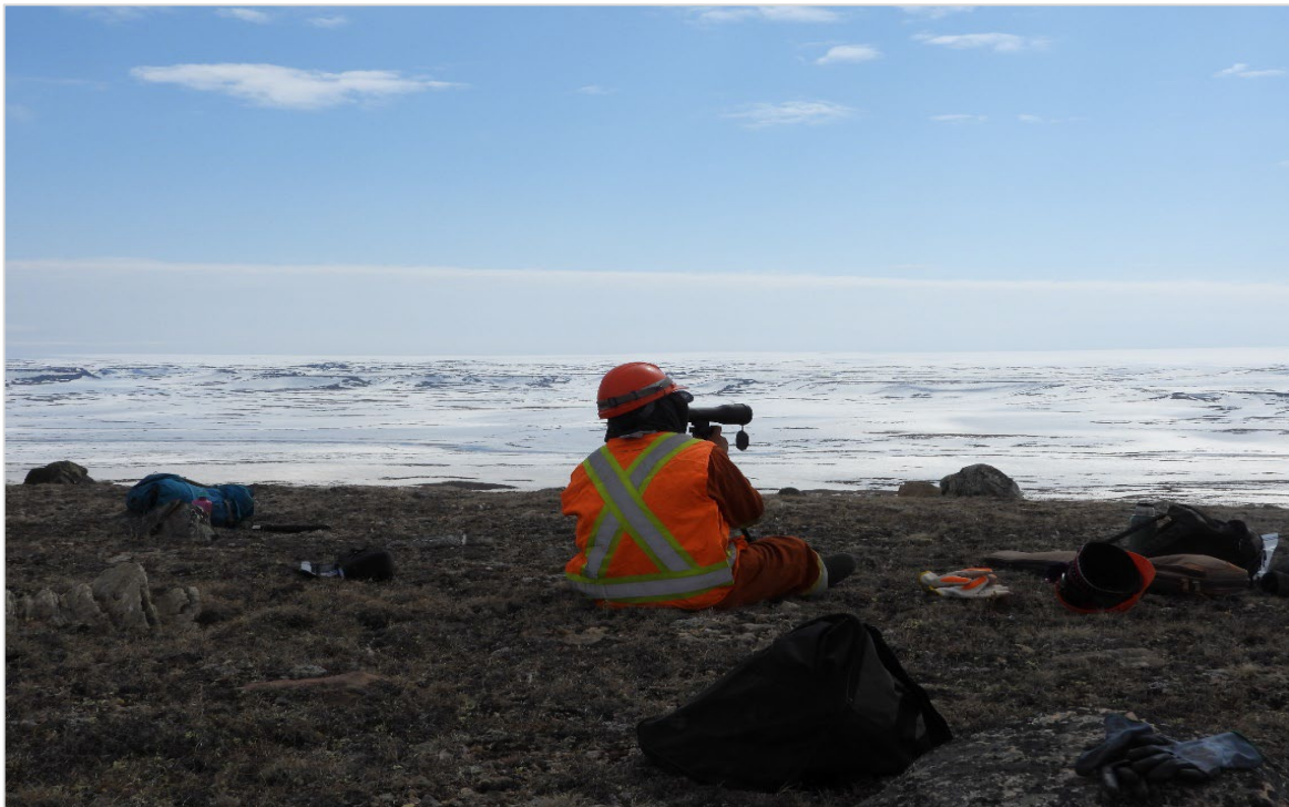
Photo 66. Height of Land Wildlife Survey - June