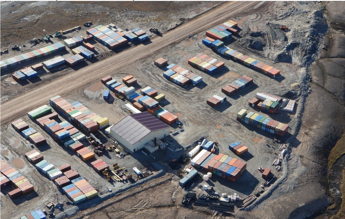
Photo 50. Incinerator Facility and Laydown - August