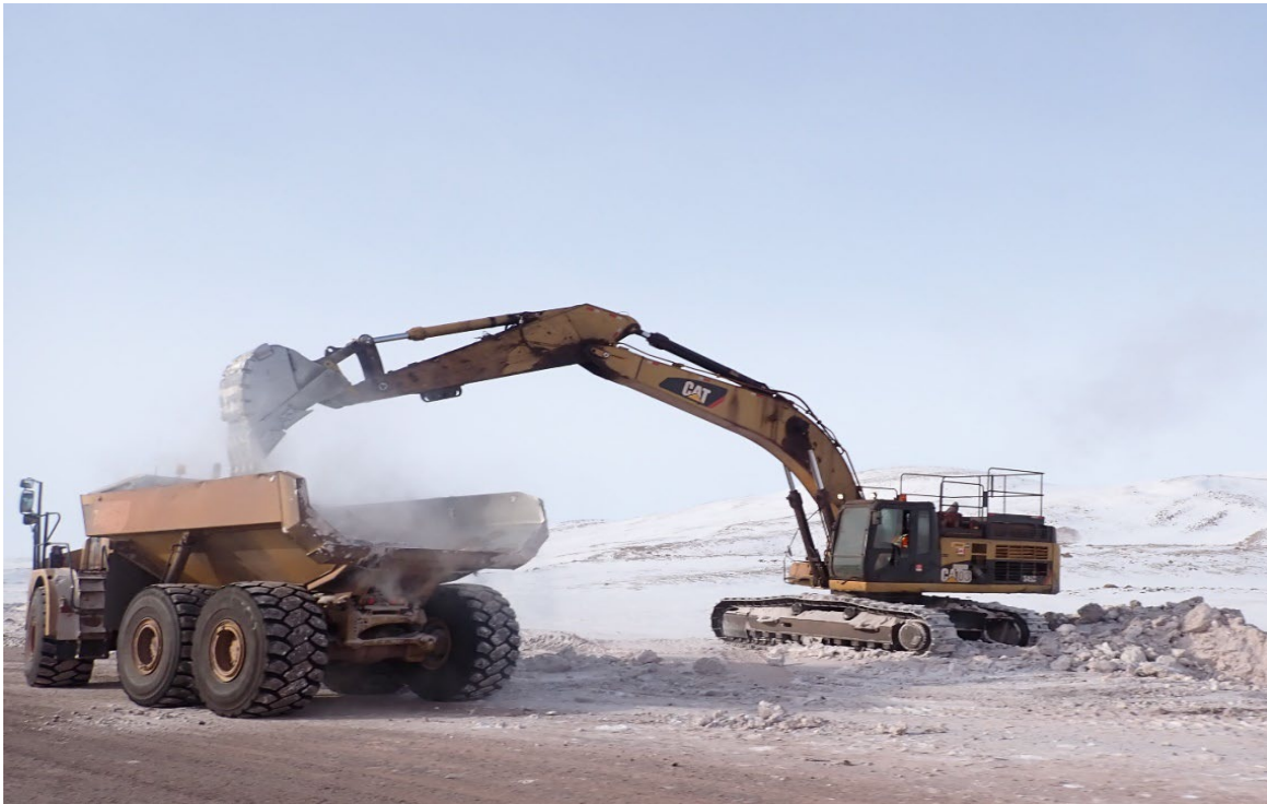
Photo 84. Loading Out Snow During exposure of Site Drainage Features Prior to Freshet - April