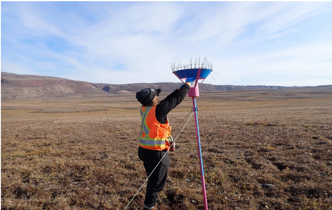
Photo 70. Remote Site Dustfall Monitoring - August