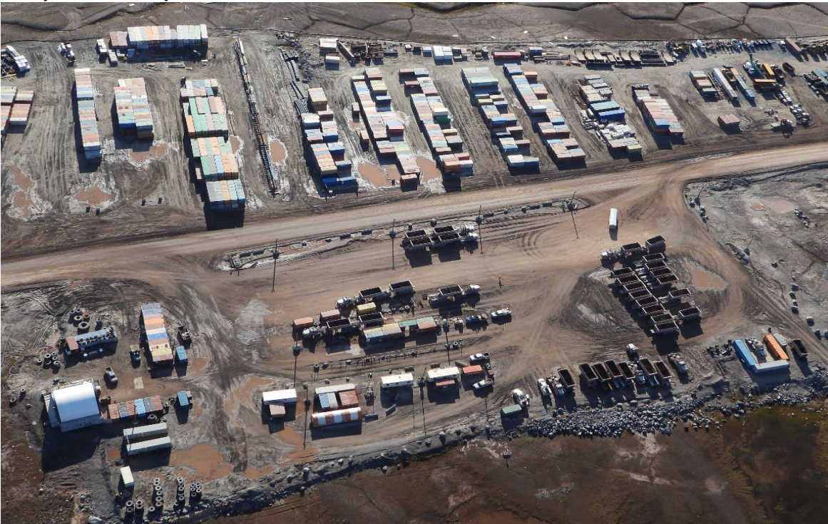
Photo 48. OHT Laydown and Laydown 2 - August