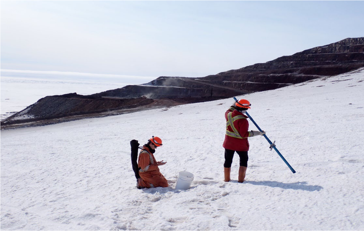
Photo 80. Snow Core Sample Collection East of Deposit 1 - May