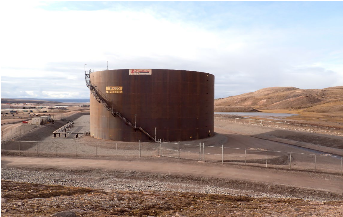
Photo 42. Mine Site Bulk Fuel Storage Facility (MS-03B) - September