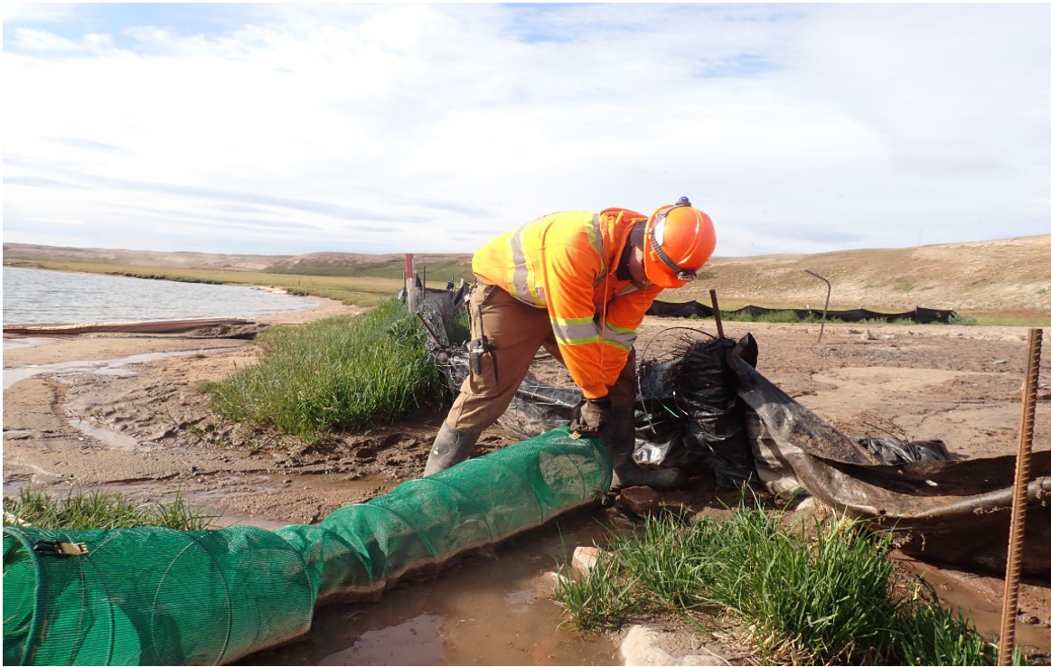
Photo 86. Installing ESC Spring Berm at the Camp Lake Settling Ponds – June