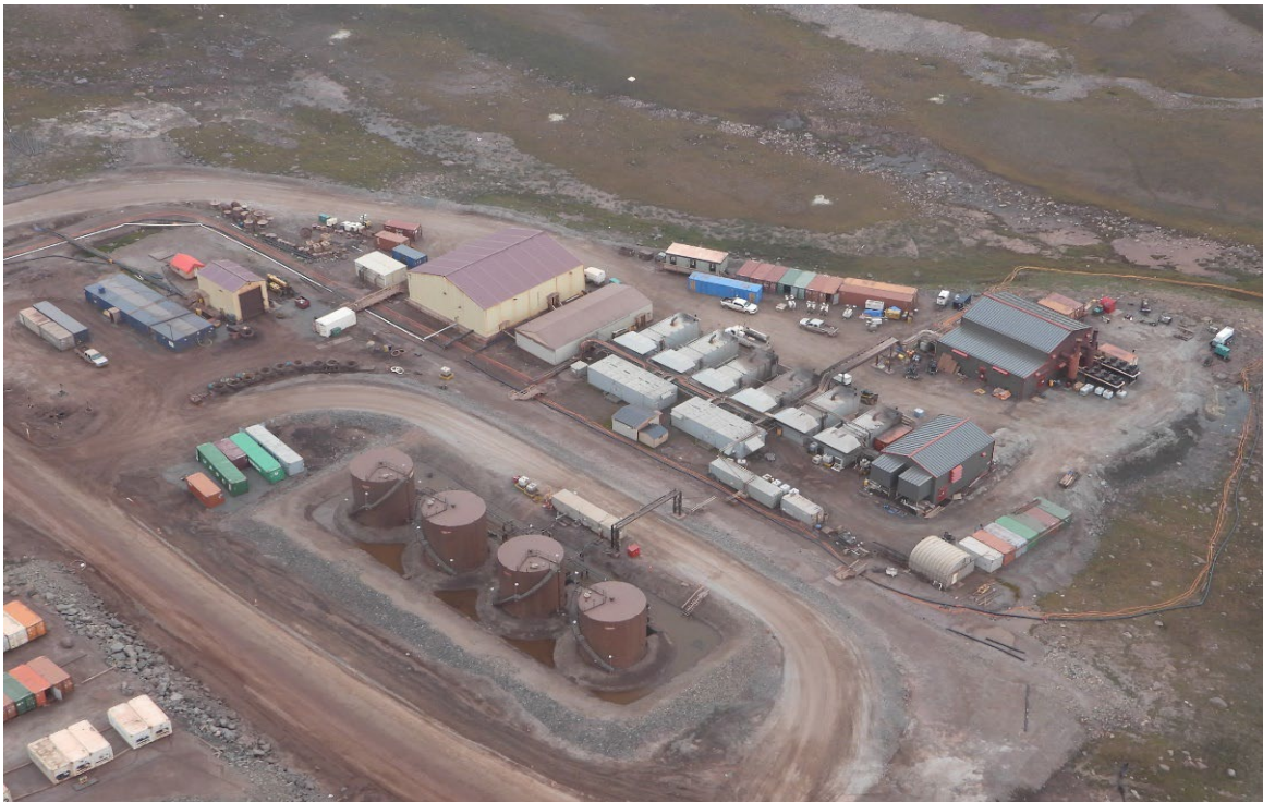
Photo 40. Bulk Fuel Storage Facility (MS-03) and Power Generation Facility - July