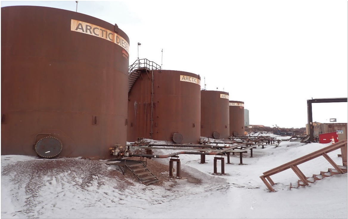
Photo 39. Mine Site Bulk Fuel Storage Facility (MS-03) for Vehicle and Equipment Re-fuelling- May