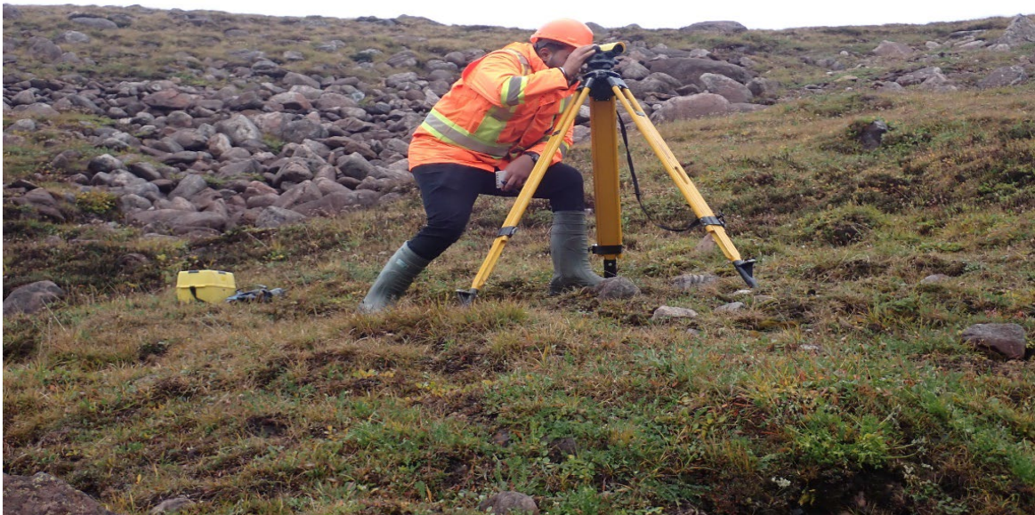
Photo 62. Hydrology Water Level Survey - August