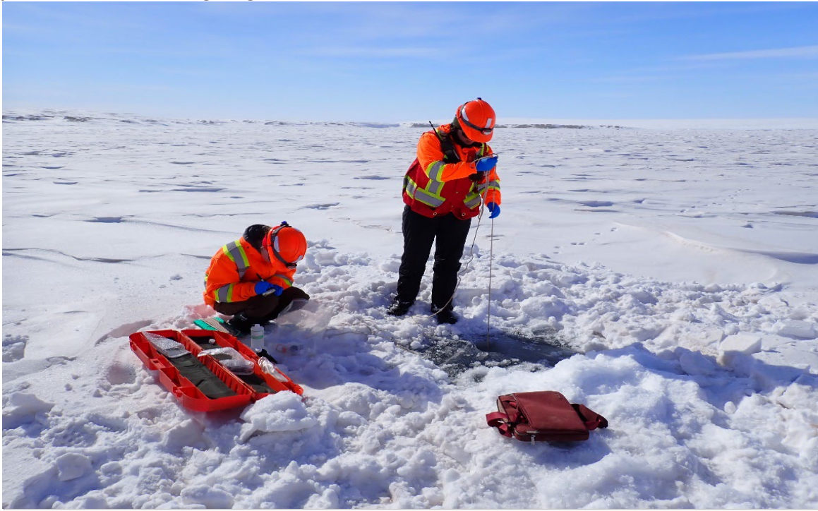
Photo 57. AEMP Water Sample Collection on Camp Lake - April