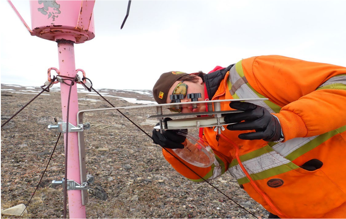
Photo 69. NRCan Passive Dust Monitoring Filter Installation at Remote Site - June