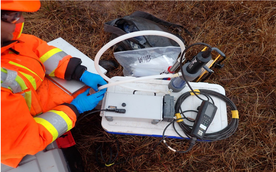
Photo 65. Ground Water Field Parameter Monitoring - September