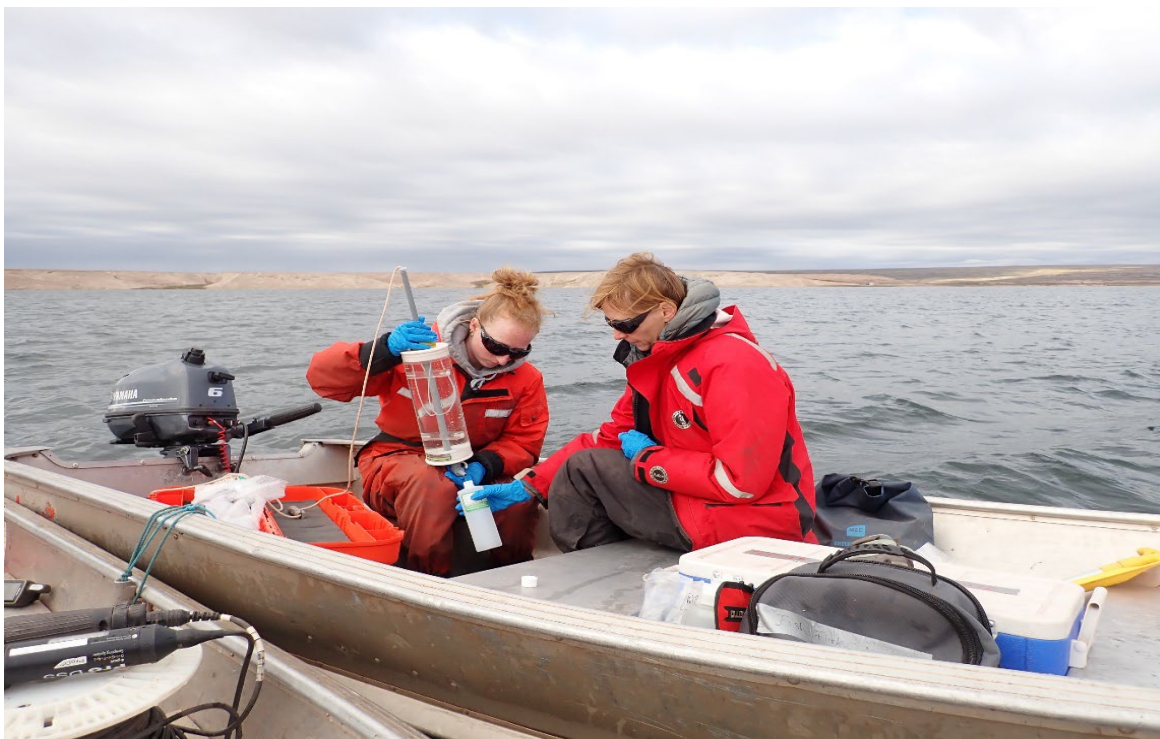
Photo 60. AEMP Water Sample Collection on Camp Lake - August