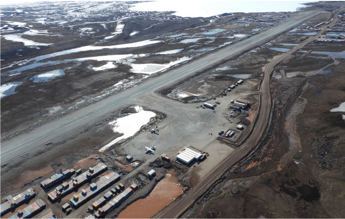
Photo 53. Airstrip and Flight Operations - August