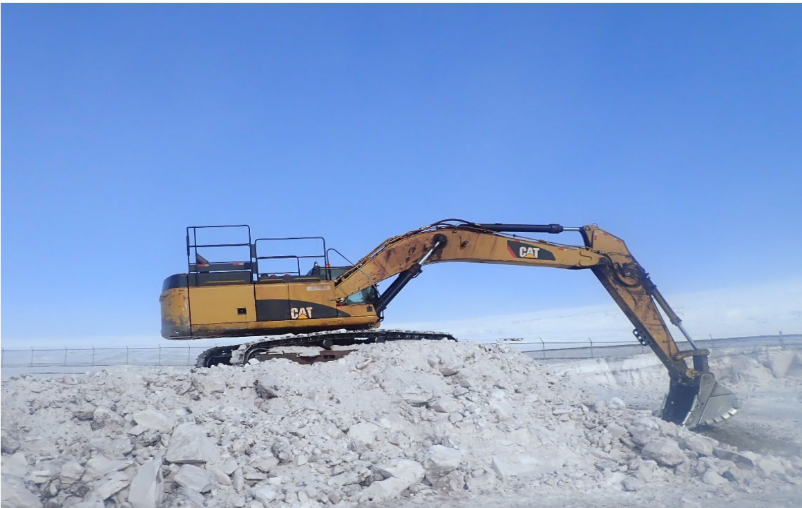
Photo 83. Snow Removal to Expose Site Drainage Features Prior to Freshet - April