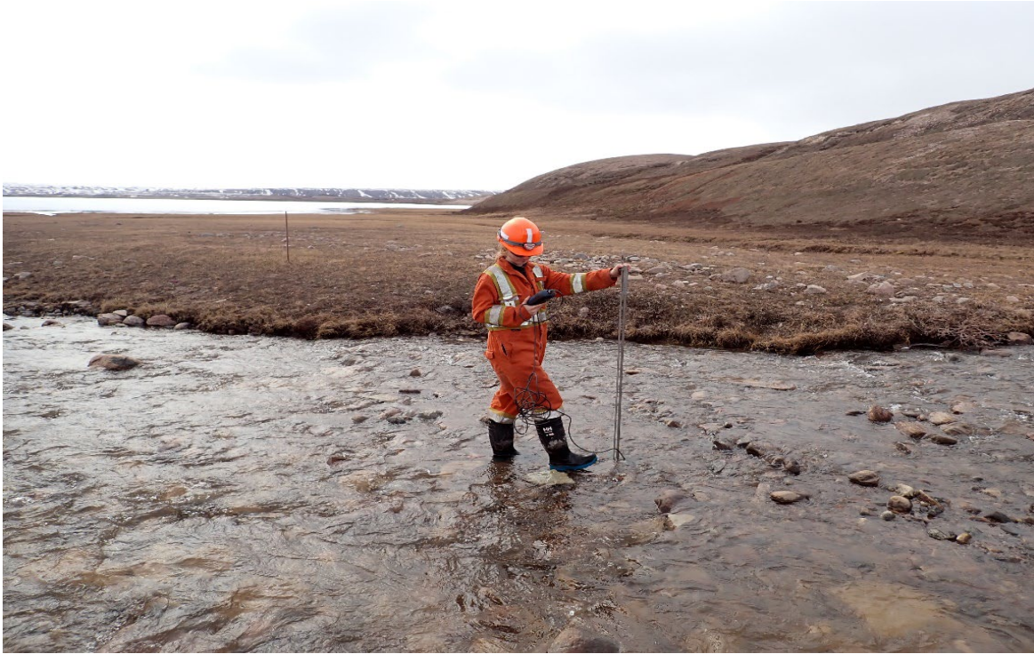
Photo 63. SNP Measuring Stream Depth and Velocity - May