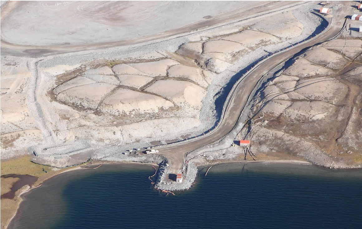
Photo 54. Camp Lake Jetty Domestic Water Intake and Rip Rap Settling Ponds - August