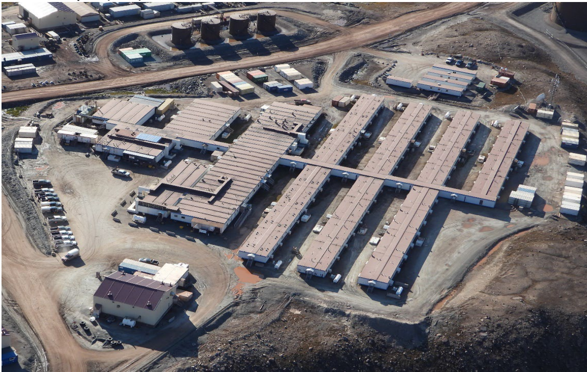
Photo 38. Mine Site Complex - August