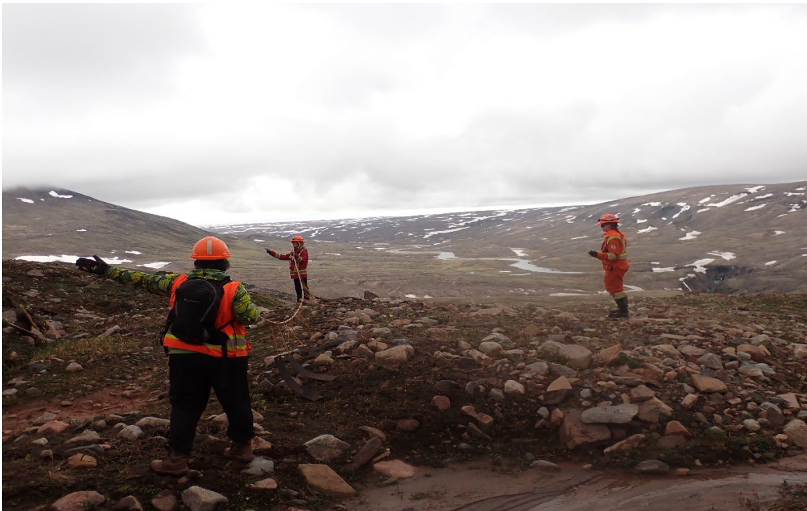
Photo 68. Active Migratory Bird Nest Survey - July