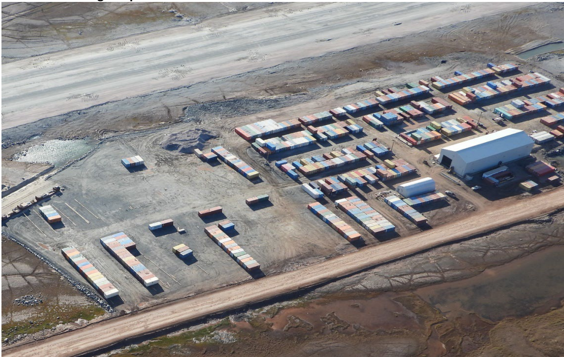
Photo 52. Warehouse Building and Laydown - August