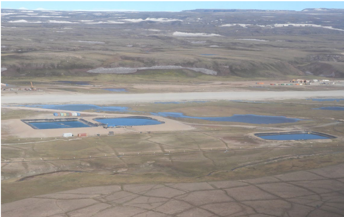
Photo 56. Polishing Waste Stabilization Ponds - June