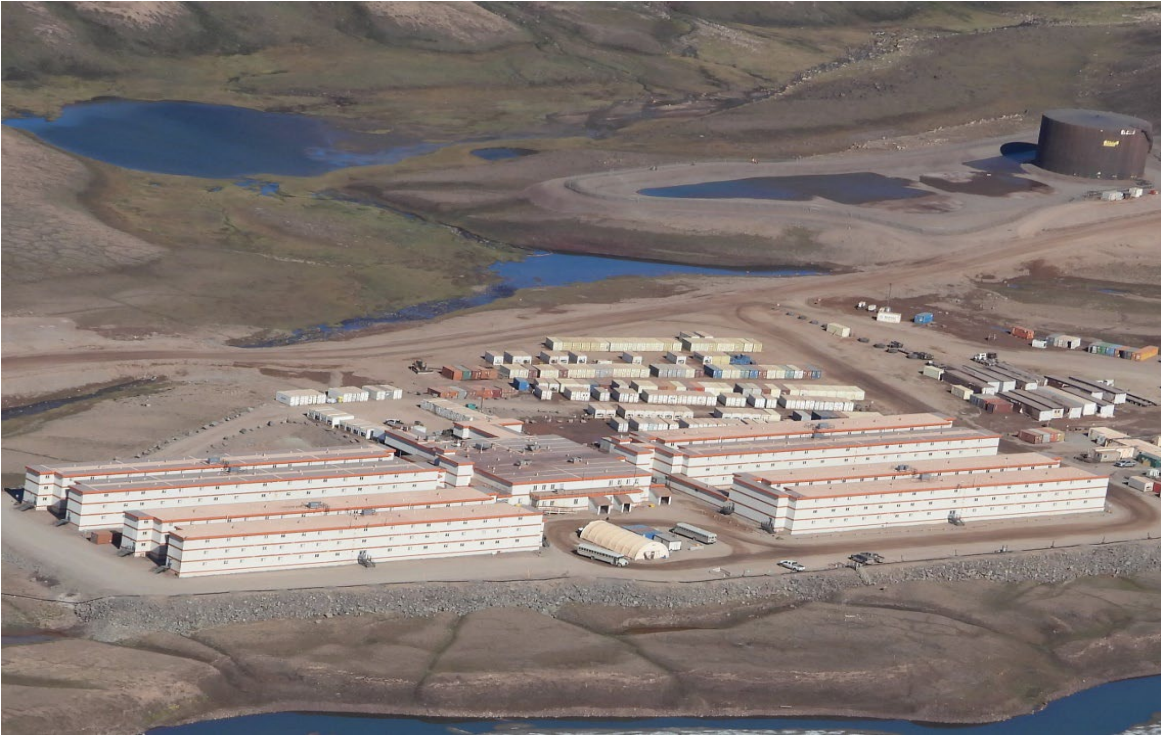
Photo 47. Sailliivik Camp Complex - June