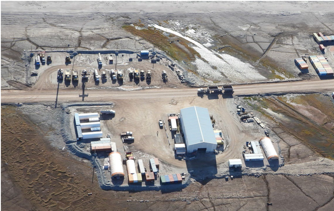
Photo 51. Site Services Building and Laydown - August