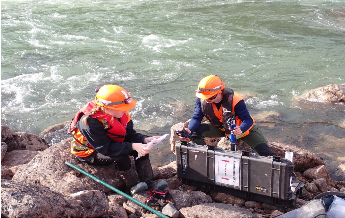
Photo 61. Hydrology Rhodamine Water Flow Survey - July