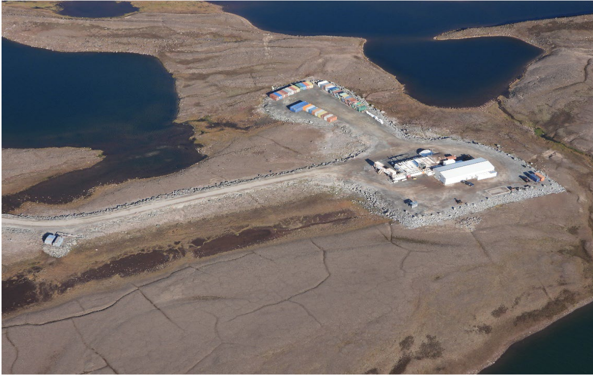
Photo 43. Emulsion Plant - August