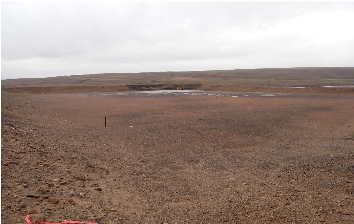
Photo 46. Landfarm Facility Cell 2 - July