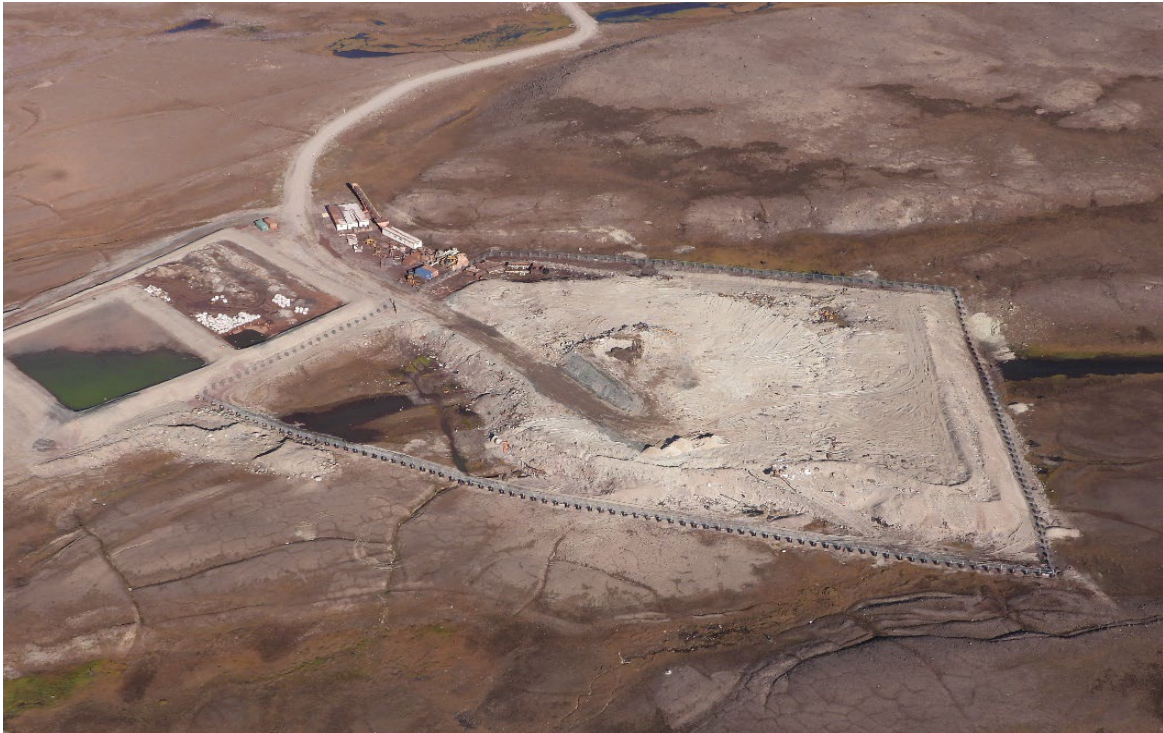
Photo 44. Non-Hazardous Waste Landfill and Landfarm Facility - August