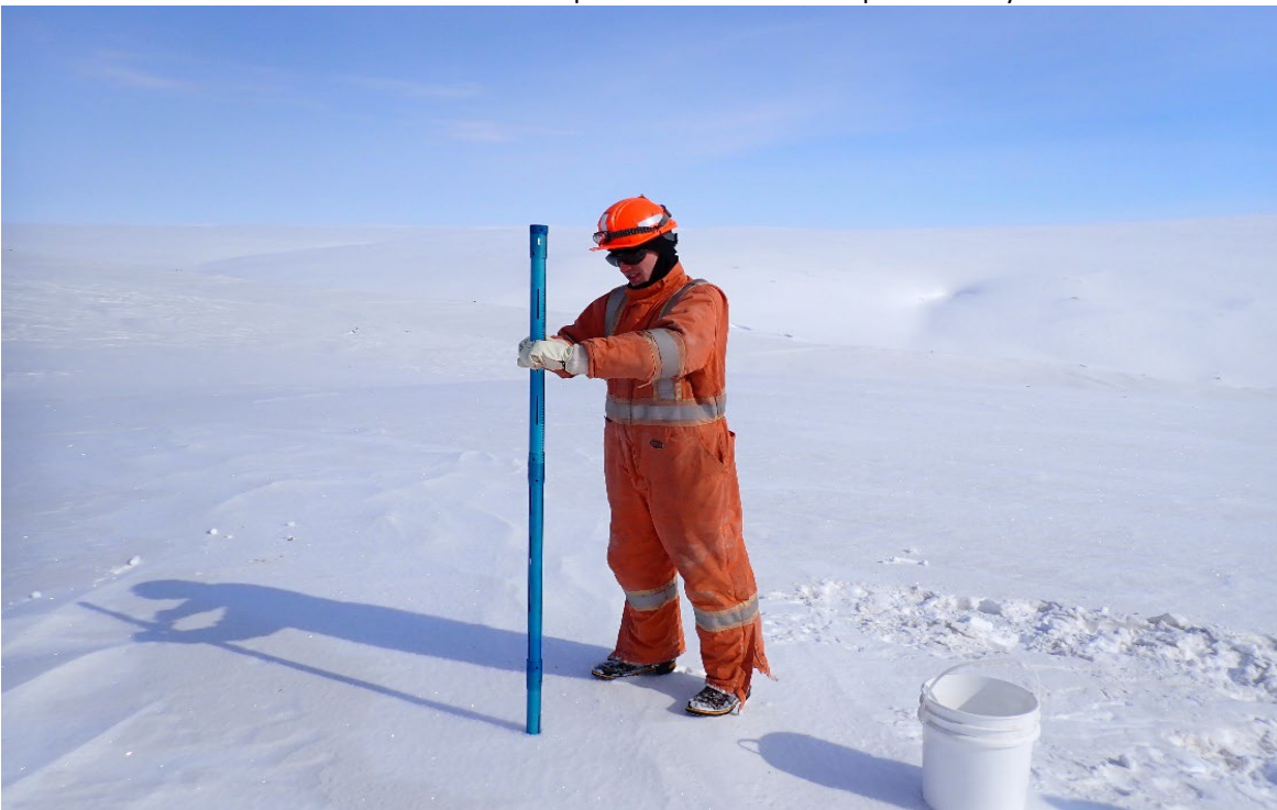
Photo 81. Snow Core Sample Collection - May