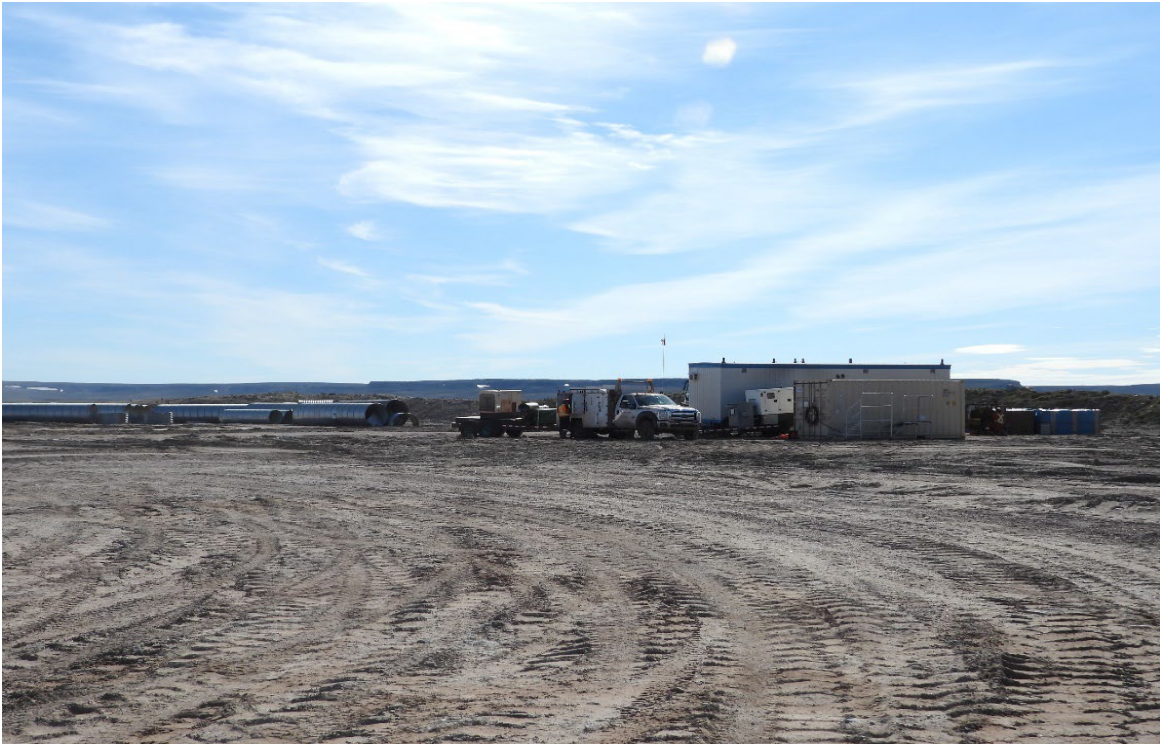
Photo 43. New Km 80 Laydown Wash-car Facility - August