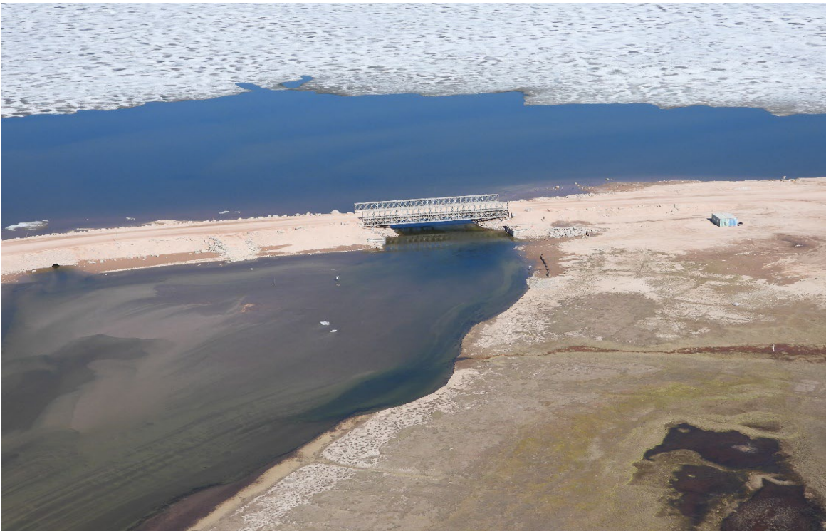
Photo 40. Km 80 Bridge - June