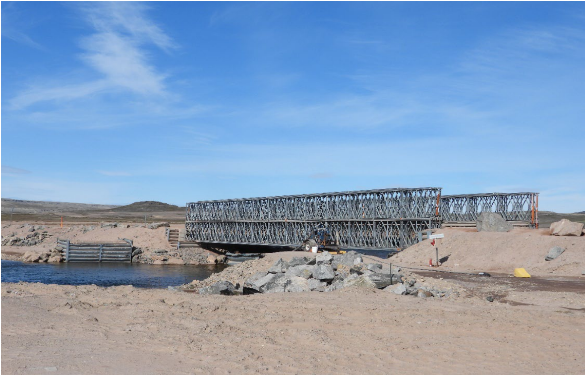
Photo 41. Km 80 Bridge and Muriel Lake Tributary Water Withdrawal Location - August