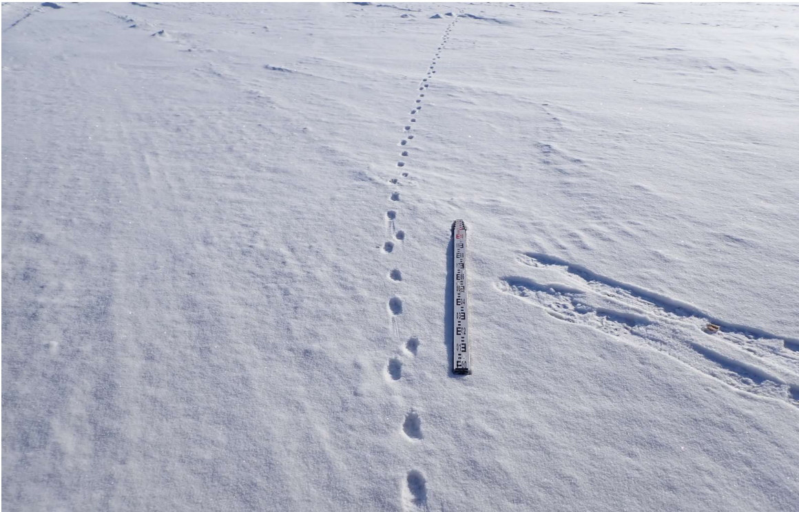
Photo 25. Fox Tracks Observed during Snow Track Survey at Km 21 - April