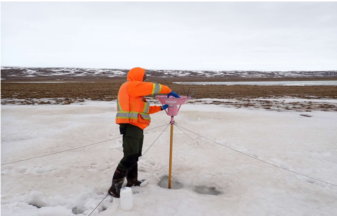
Photo 29. Retrieval and Re-deployment of Remote Dustfall Monitoring Equipment along Tote Road - June