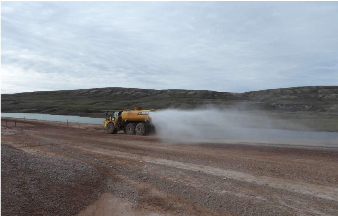
Photo 62. Water Buffalo Applying Water Dust Suppression at Km 27 - August