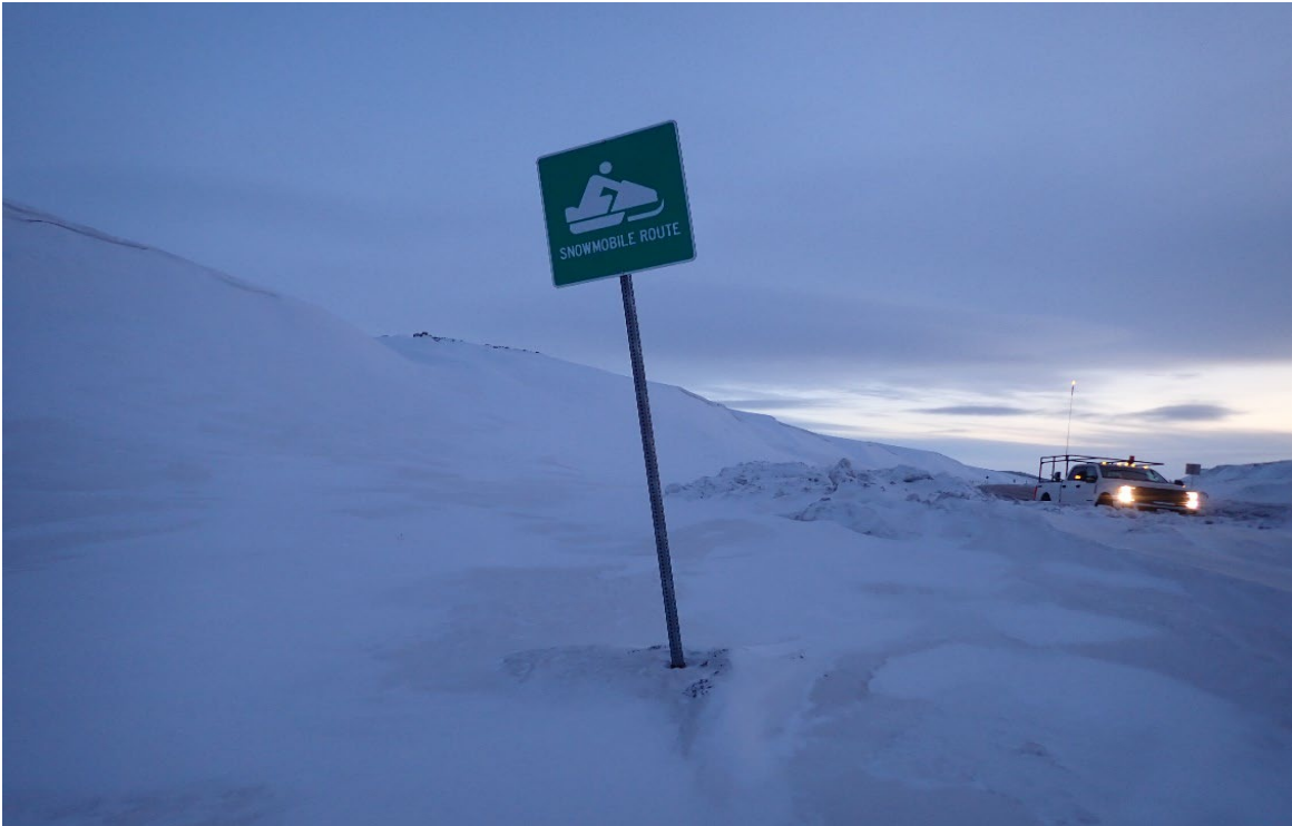
Photo 49. Km 90 Snowmobile Crossing - January