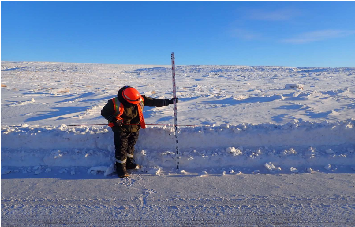
Photo 30. Snowbank Height Survey along Tote Road - February