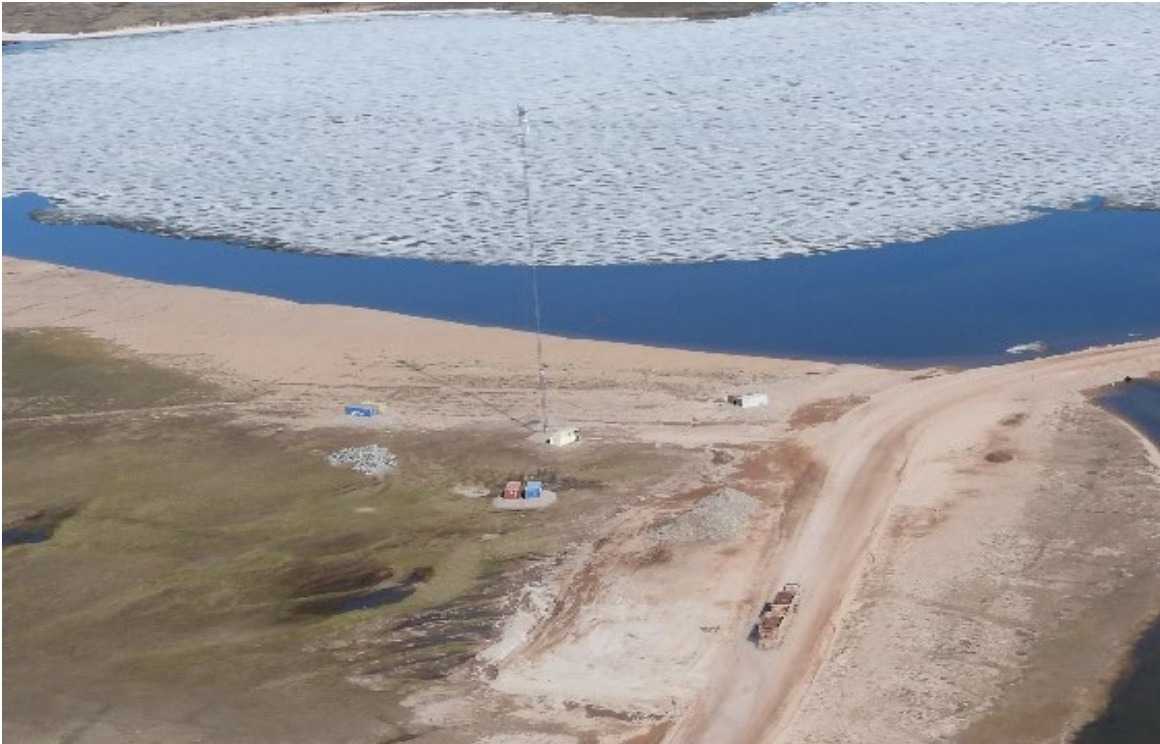
Photo 39. Km 80 Communication Tower - June