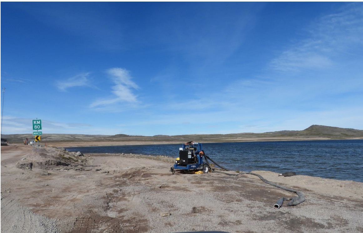
Photo 42. Km 80 Bridge and Muriel Lake Water Withdrawal Location - August