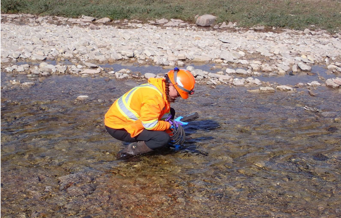
Photo 24. Water Quality Field Parameter Monitoring Using YSI Meter for Tote Road Monitoring Program - July