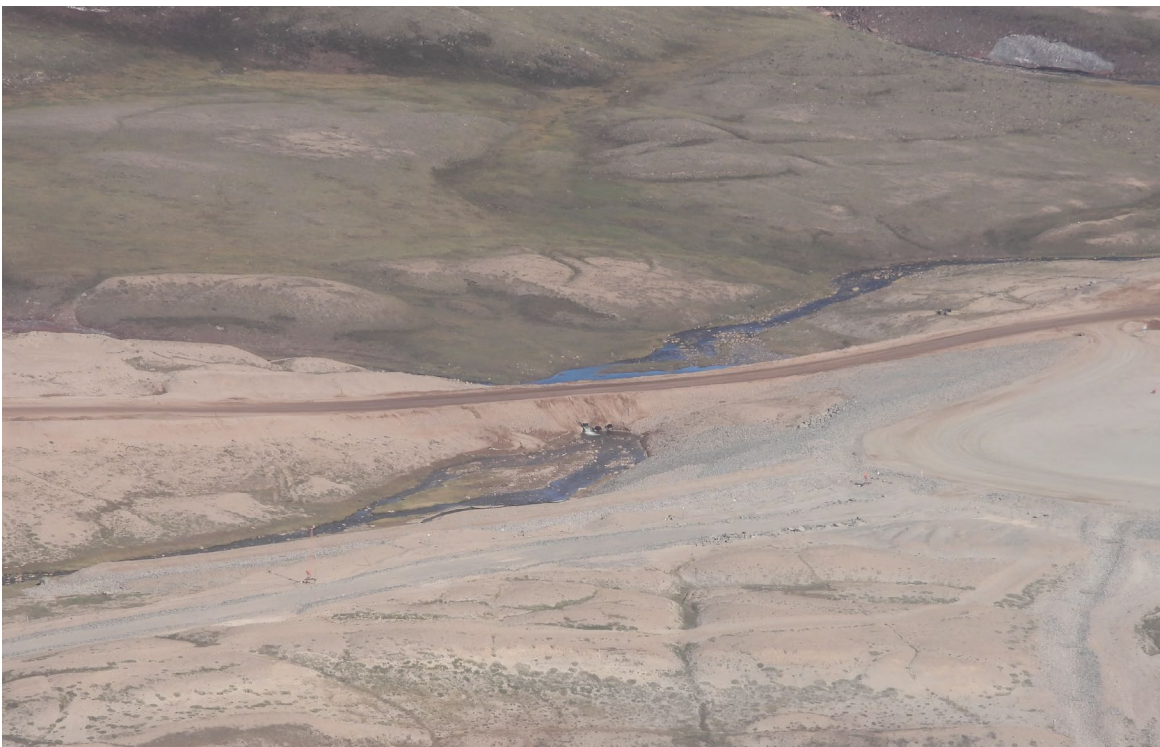
Photo 60. Km 100 Dip at BG-01 - June