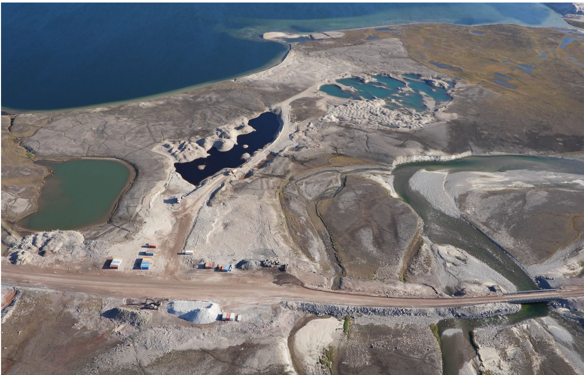
Photo 58. Km 97 Borrow Pits for Dust Suppression Mixing - August