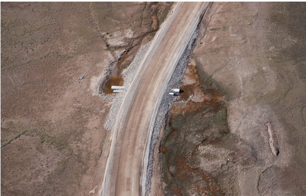
Photo 52. Km 95 Culvert CV-001 Remedial Construction Completed - June