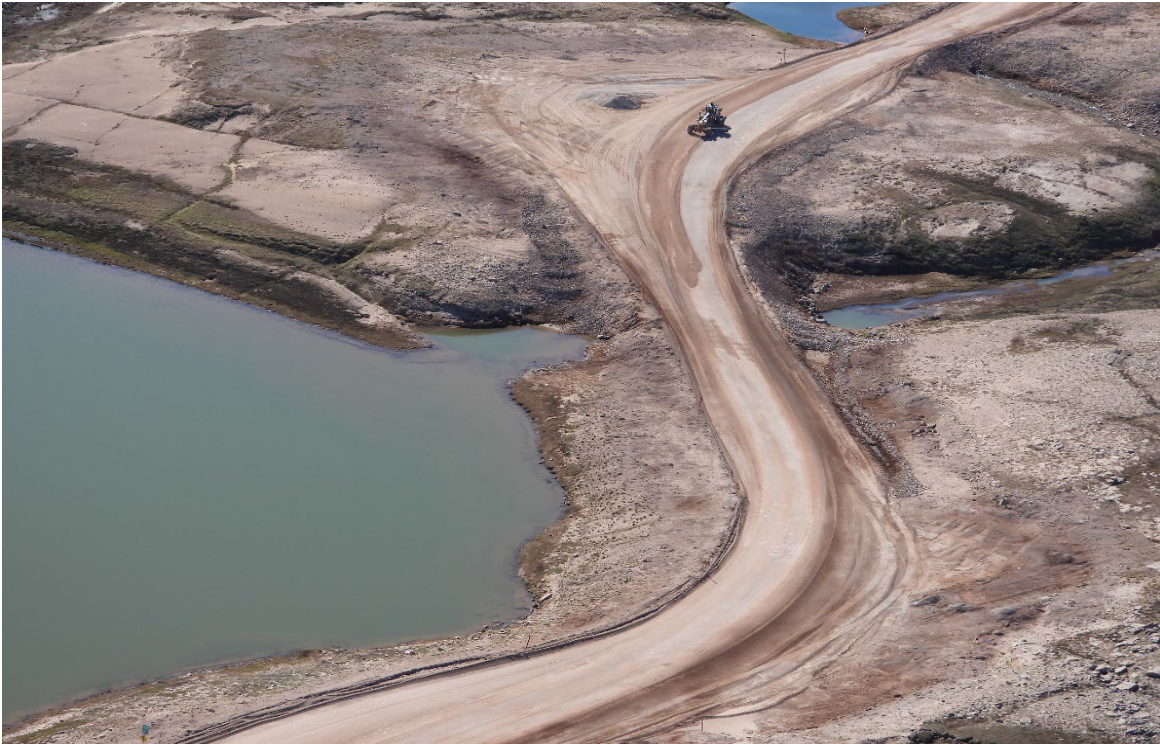
Photo 18. Grader Maintaining the Road at Km 85 Bend at BG-29 and BG-30 Culvert Crossings - June