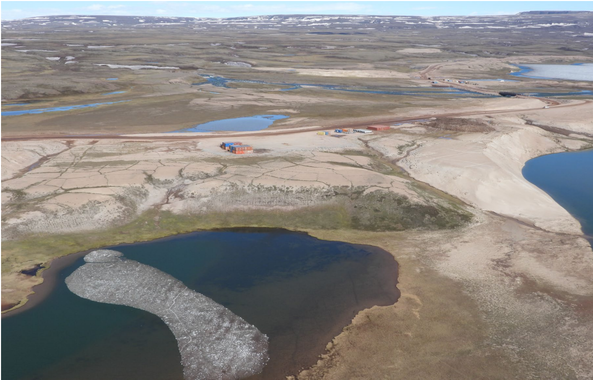
Photo 19. Km 96.5 Laydown and Snow Stockpile - June