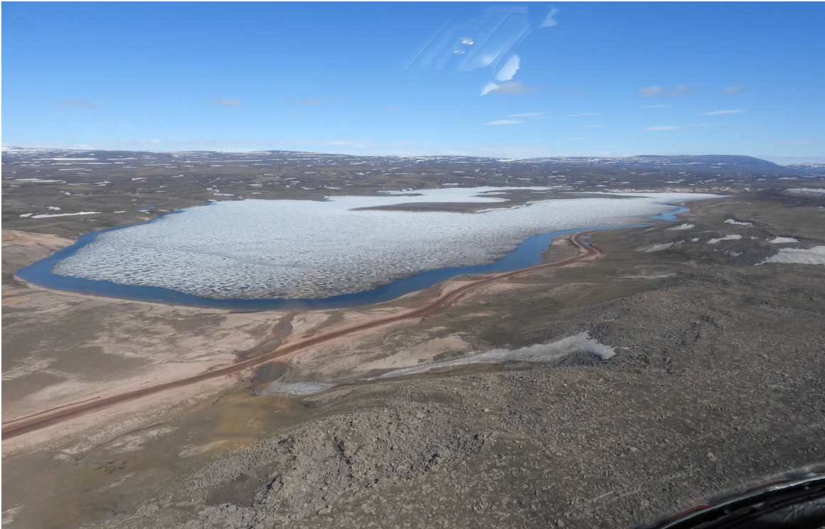
Photo 47. David Lake from Km 87 - June