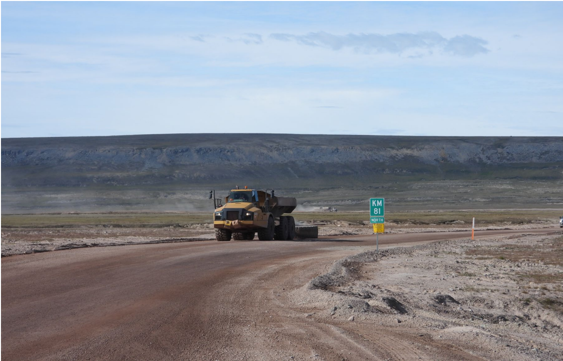
Photo 20. Articulated Rock Truck Tire Drag Maintaining Safe Driving Surface at KM 81 - August