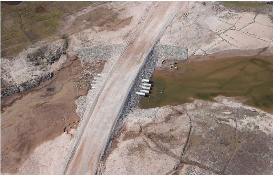
Photo 44. Km 81 Culvert CV-216 Remedial Construction Completed- June