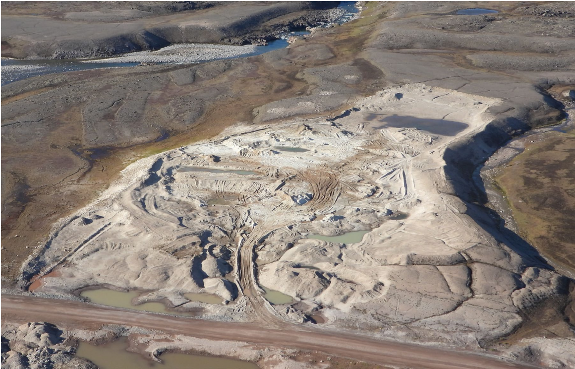
Photo 57. Km 97 Borrow Pit - August