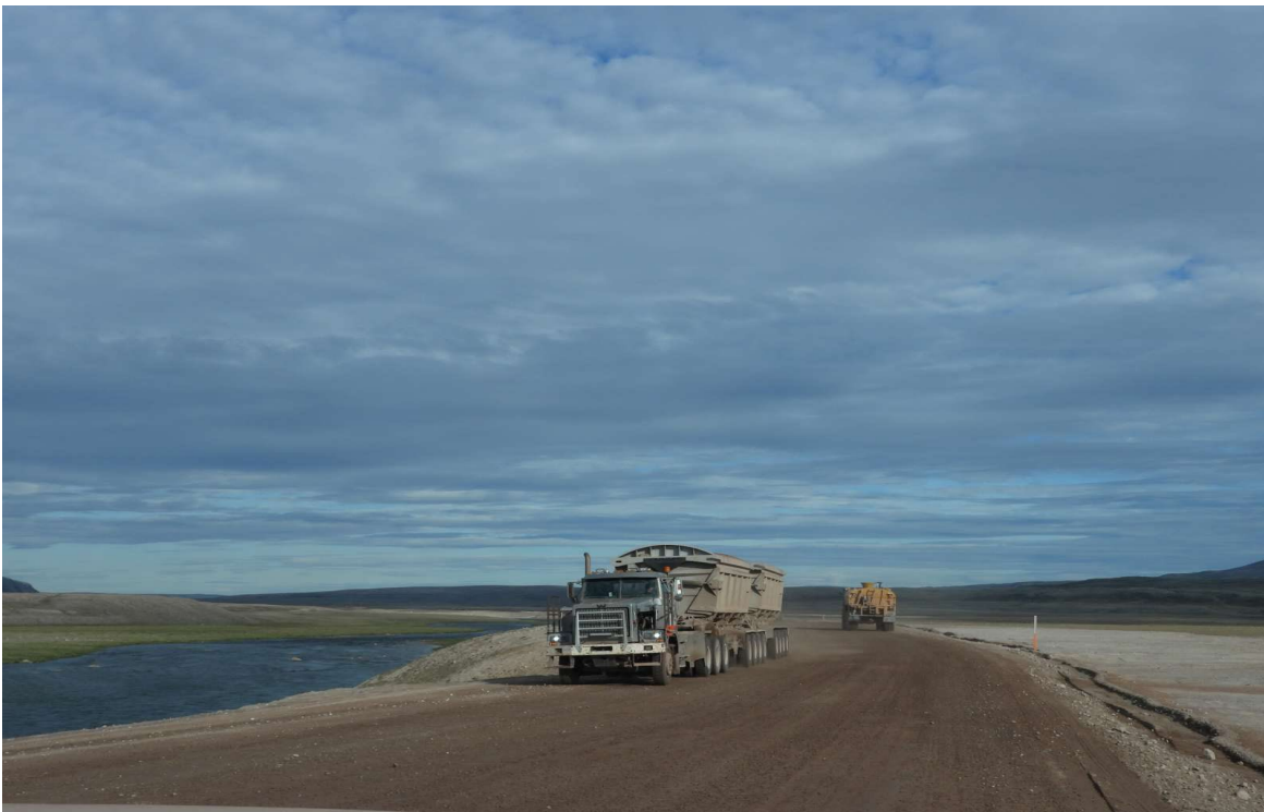
Figure 23. Ore Haul Truck and Water Buffalo Travelling along Tote Road– July