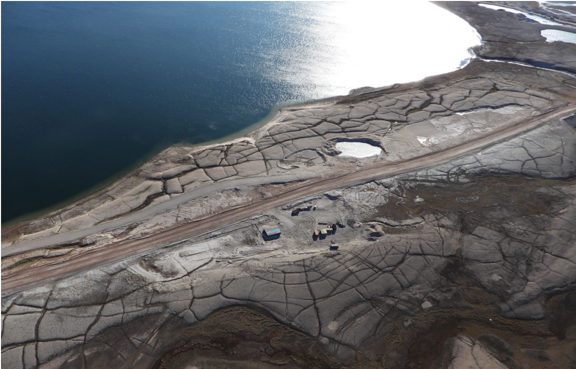
Photo 59. Km 98 Open Burn Site- August