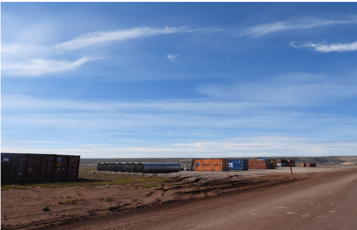
Photo 54. Km 96.5 Laydown - August