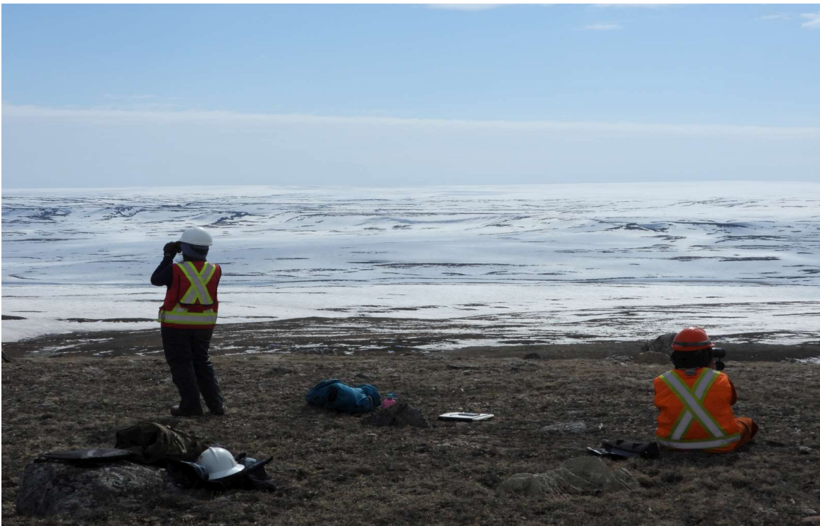
Photo 27. Height of Land Wildlife Survey Performed by EDI along Tote Road - June