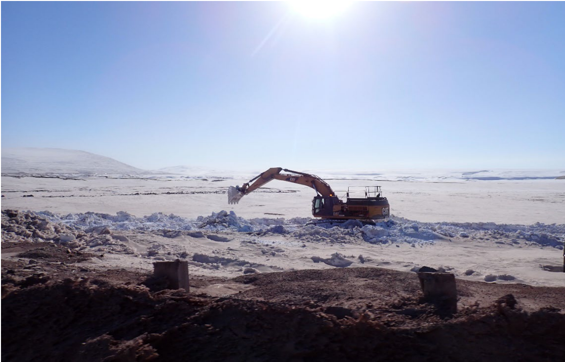
Photo 22. Km 80 Ice Road Decommissioning - May