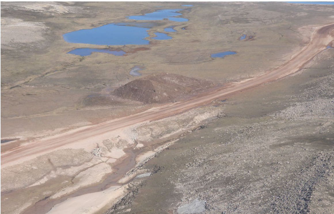
Photo 46. Km 86 Snow Stockpile - June