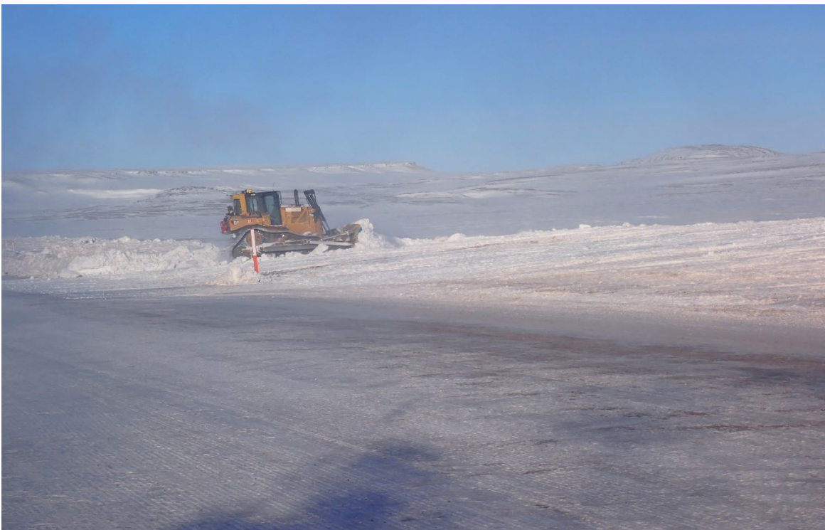
Photo 21. Dozer Feathering Snow Away from Road for Wildlife Passage at Km 38 - March