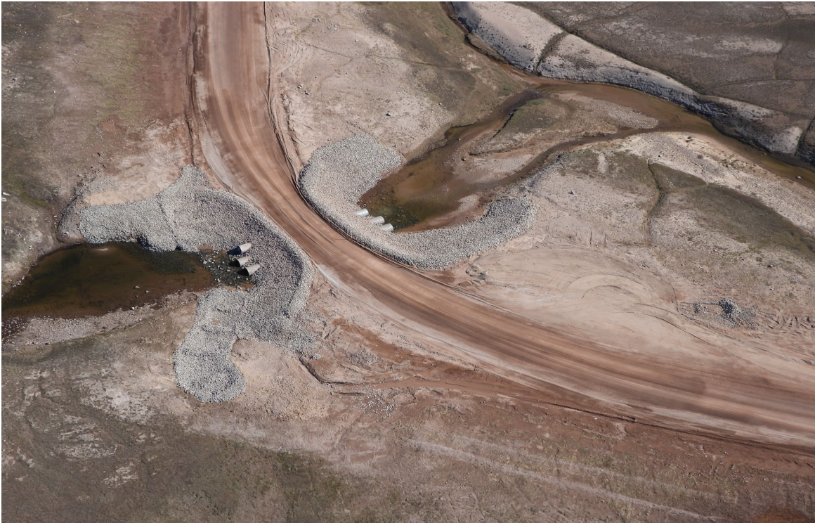
Photo 51. Km 94 Culvert BG-04 Remedial Construction Completed - June