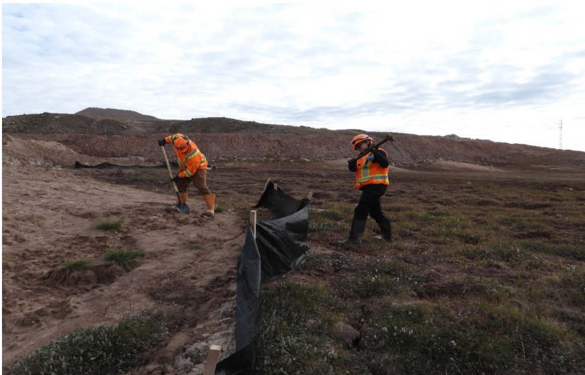
Photo 77. Silt Fence Installation along the Tote Road - August