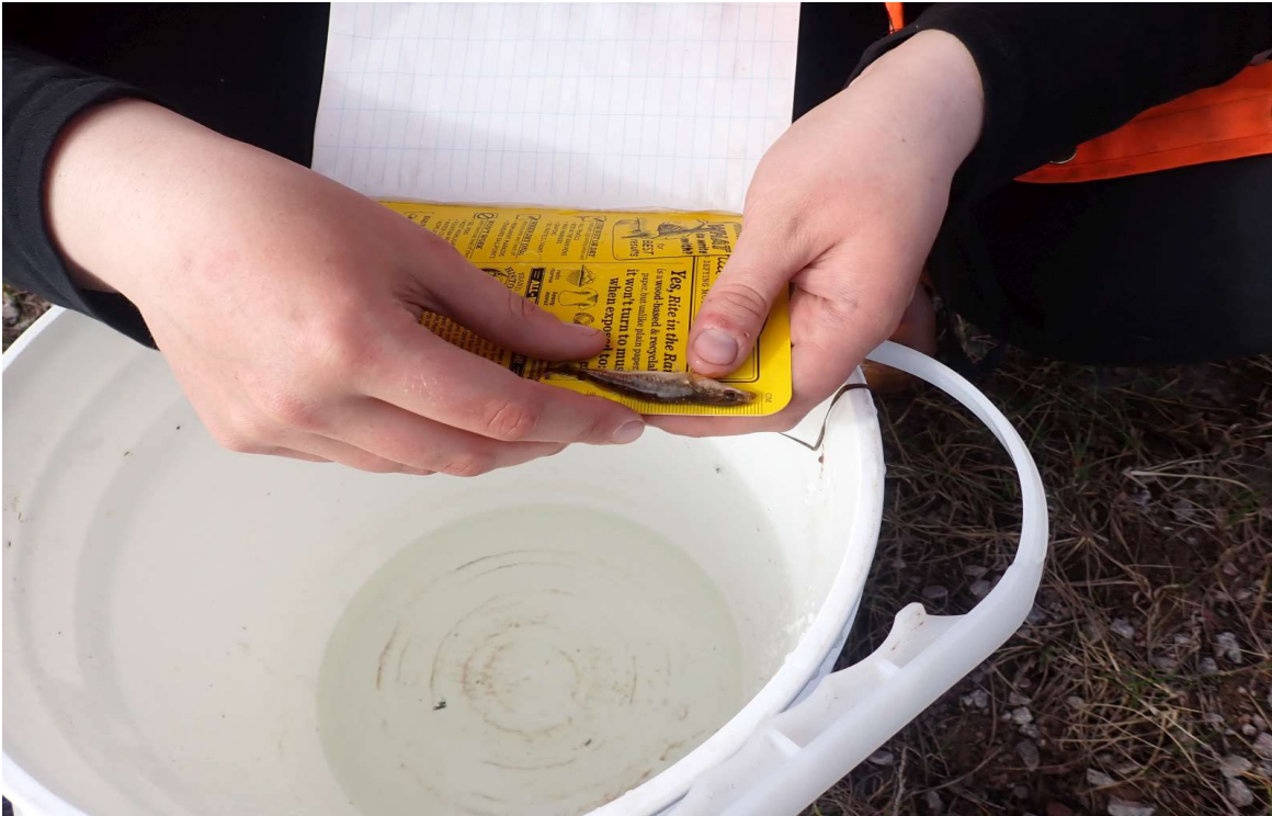
Photo 26. Measuring Fish during the Tote Road Stream Crossing Monitoring Program - July