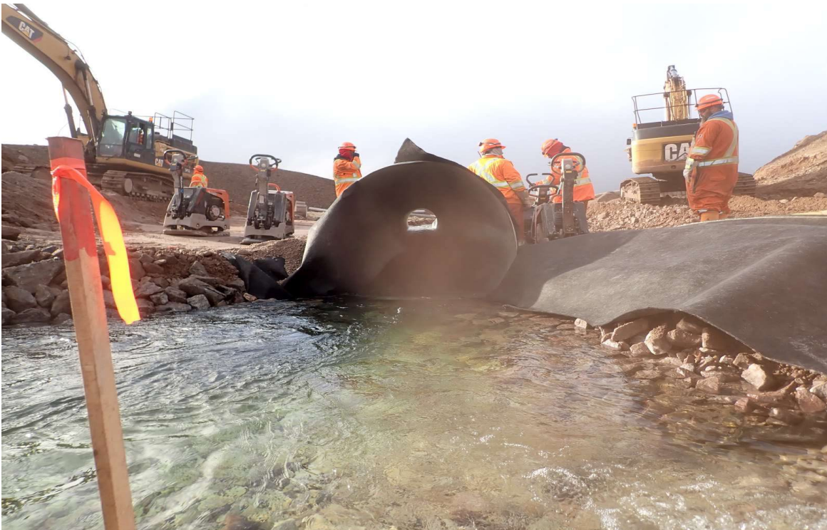
Photo 75. Remedial Construction of CV-048 (Km 63.5) after September Rain Event - September