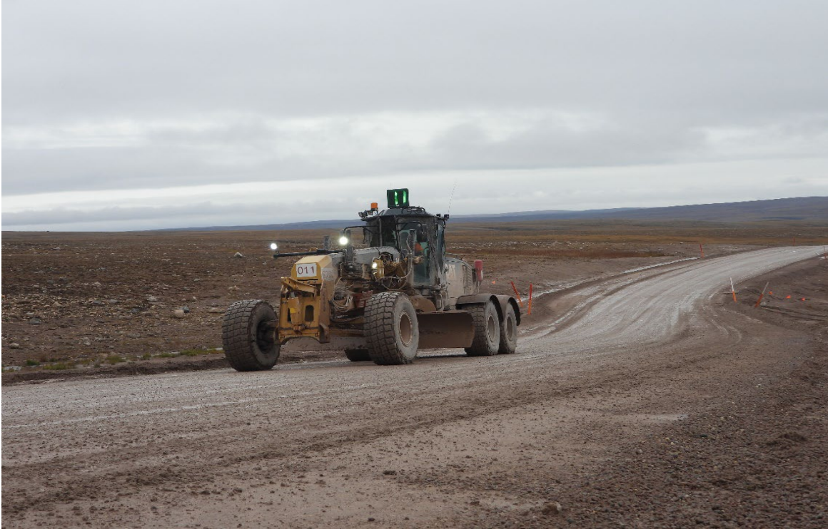
Photo 61. Grader at Km 68 - August