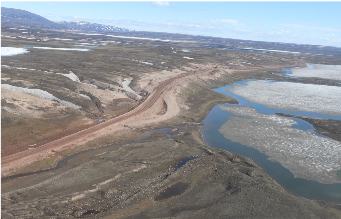
Photo 50. Km 91 Hill - June