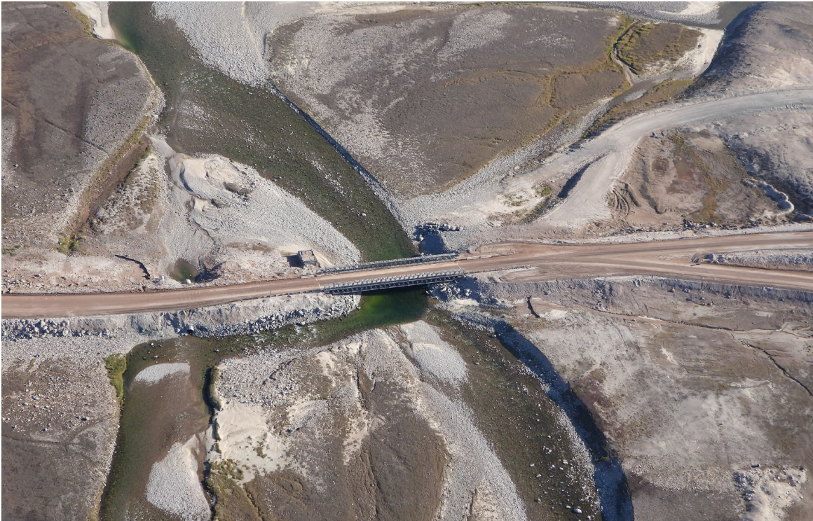
Photo 55. Km 97 Bridge - August