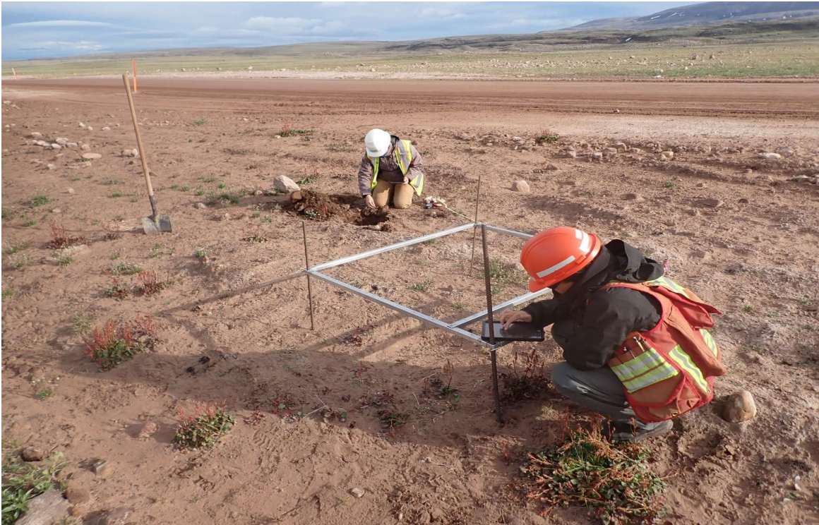
Photo 28. Vegetation Survey performed by EDI along Tote Road - July