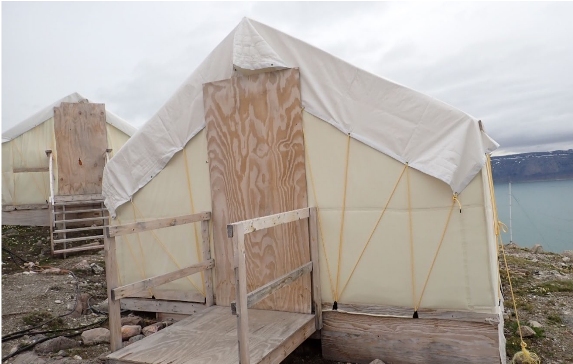
Photo 9. Plywood Secured Over Tent Doors During Camp Winterization – July