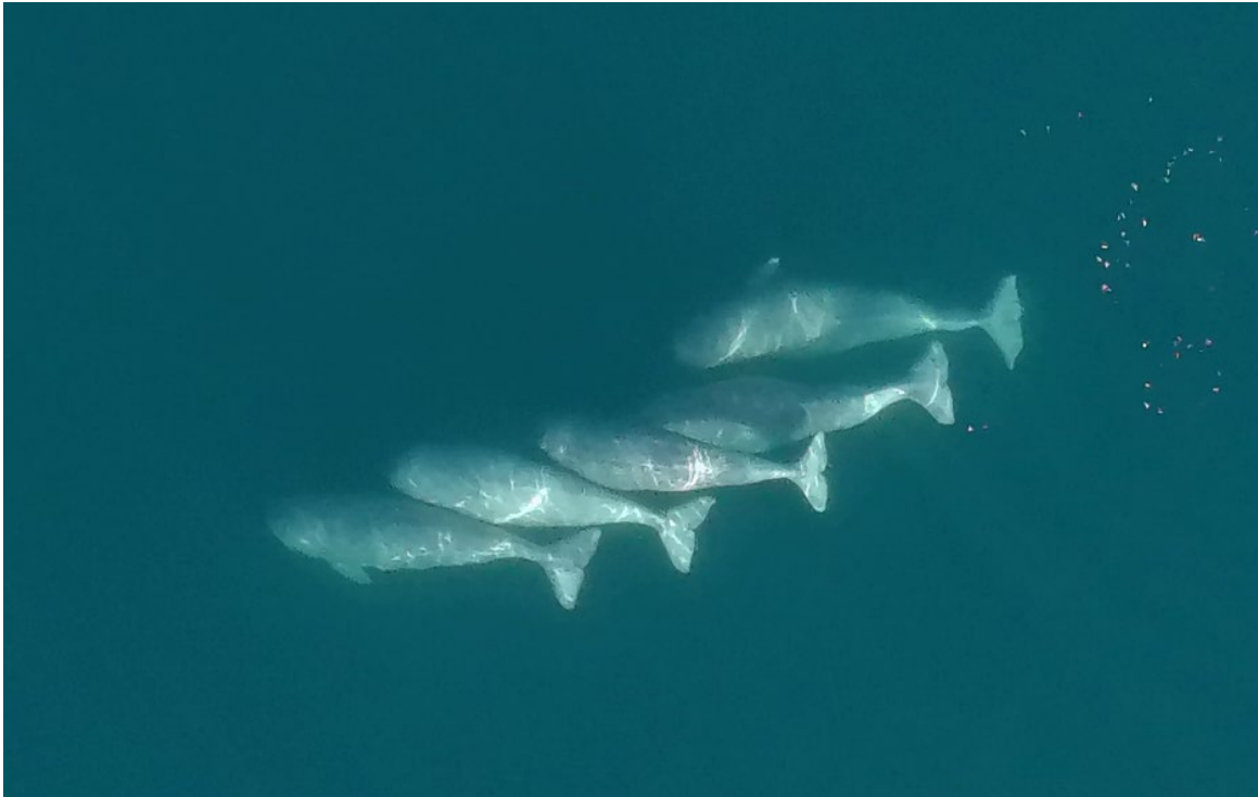
Photo 13. Pod of Beluga Whales Transiting Through the Bruce Head Survey Area – September