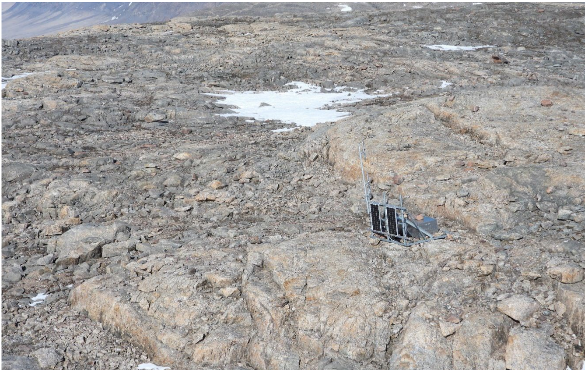
Photo 12. Relay Station 1 Near the Bruce Head Water Reservoir – July