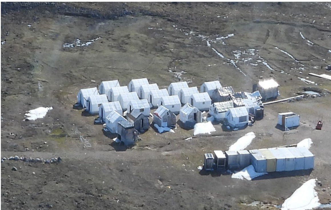
Photo 2. Steensby Camp Tent Accommodations - June