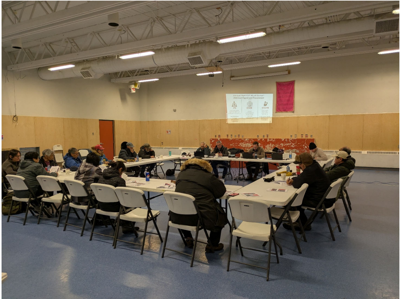
Photo 6 – Community engagement on the Steensby Component led by Baffinland’s Community and Strategic Development team in Sanirajak, November 2025