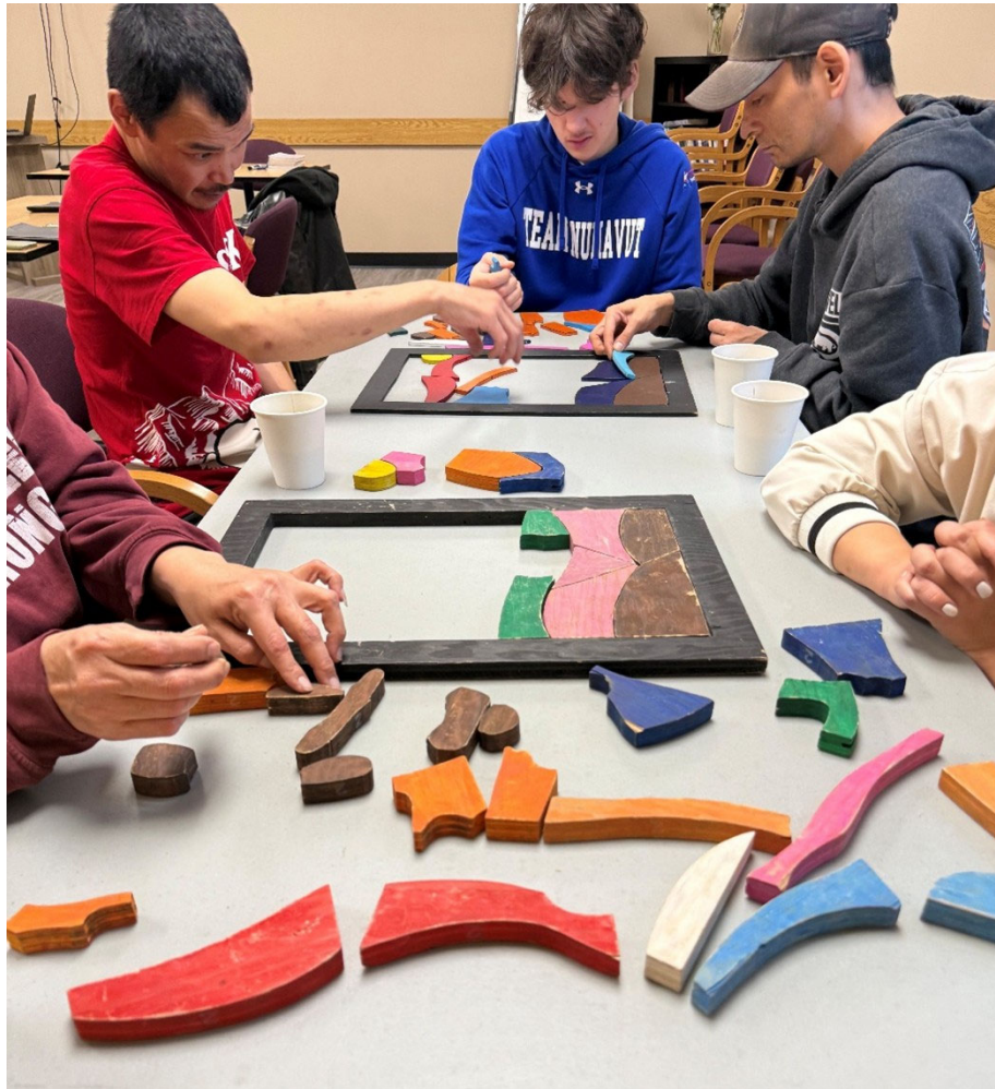
Photo 1 – Work Ready Program participants in Pond Inlet, October 2025