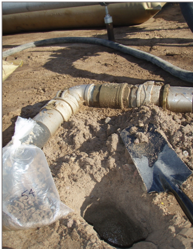
Photo 2: Hydrocarbon staining near cam and groove hose couplings (Bag 54)