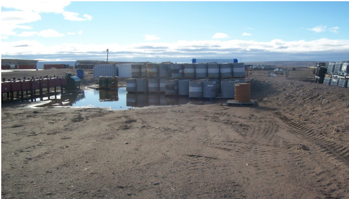
Barrel Fuel and dispensers.