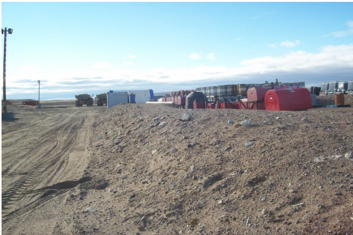
Exterior of dyke at Barrel Fuel Containment.