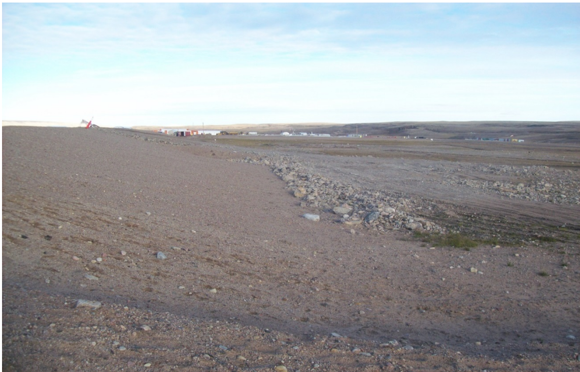
Exterior of dyke at PWSP #2 and #3.