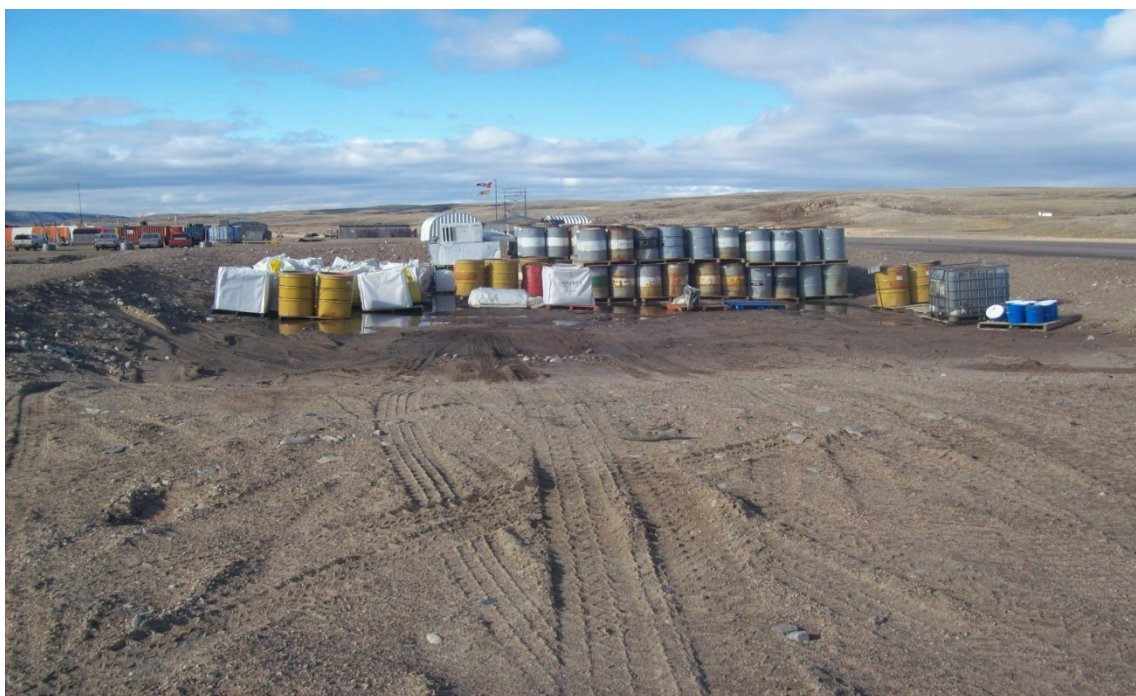
Containers at Hazardous Waste Containment.