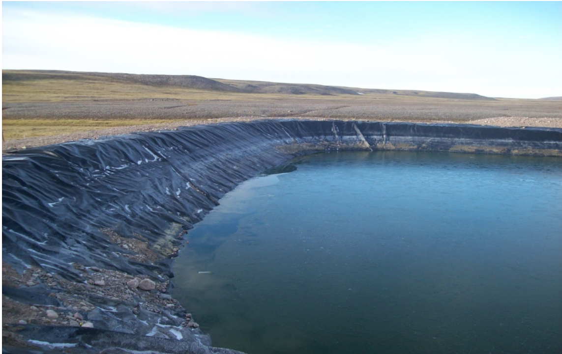
Interior of PWSP #1. Considerable capacity available at this time.