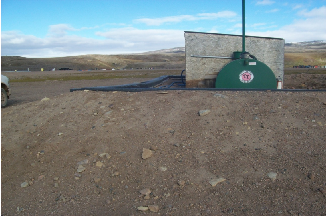
Exterior of dyke at Helicopter Fuel Cell Containment.