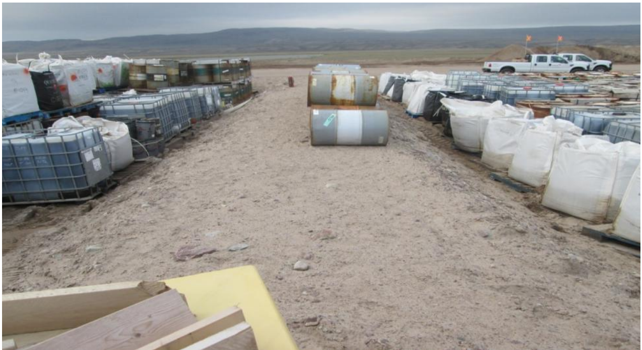
Photo taken of central dyke in barrel fuel storage looking west.