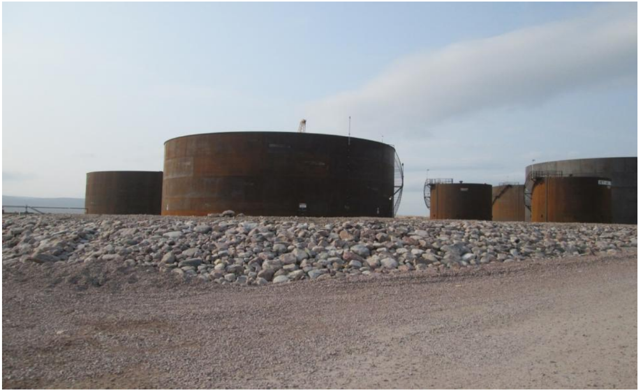
Photo taken from the south east corner of the steel storage tank containment outside the containment looking north west.