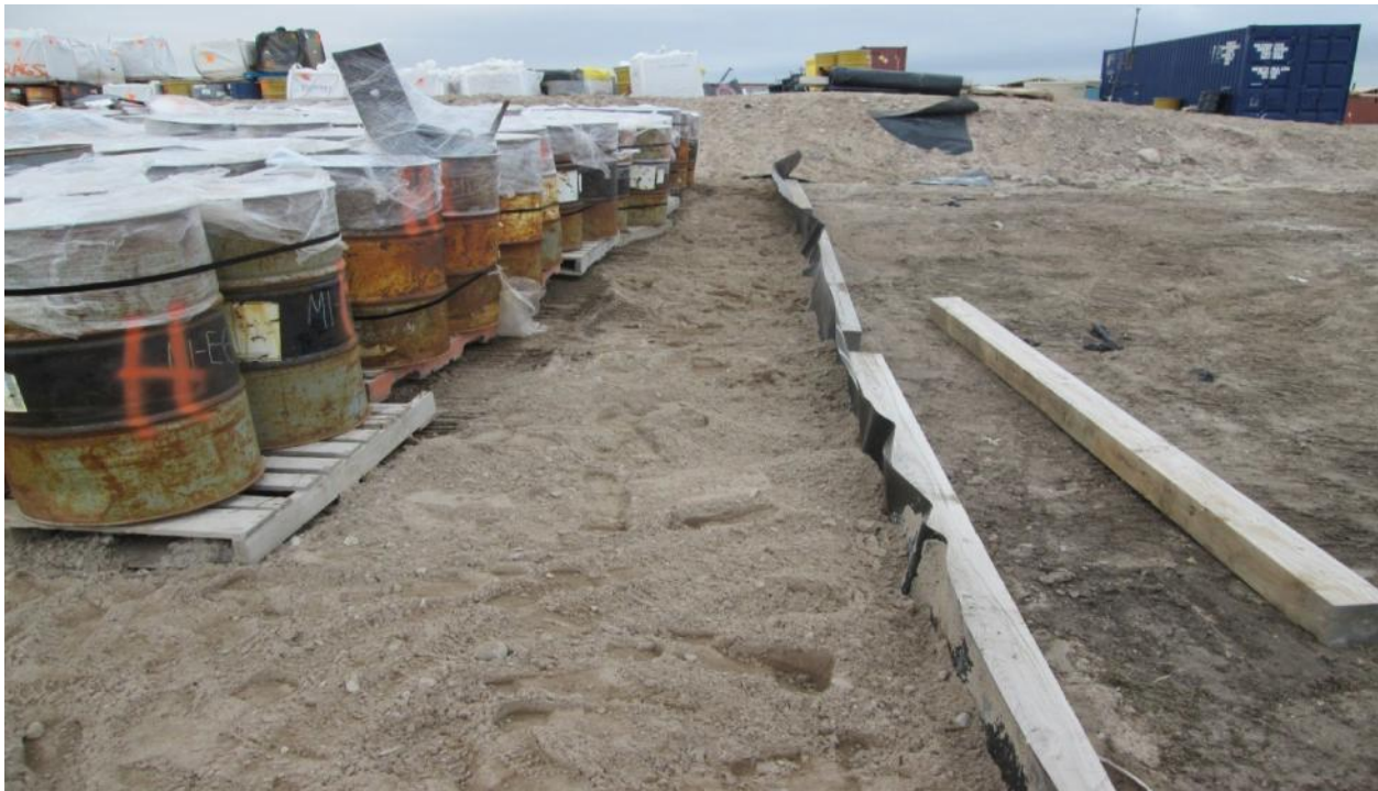
Photo shows temporary curbed area for hazardous waste awaiting immediate shipment.