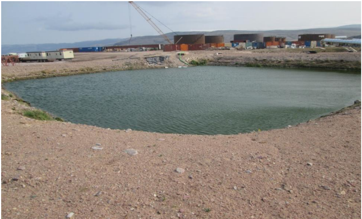
Photo taken from atop the soon to be decommissioned PWSP looking south.