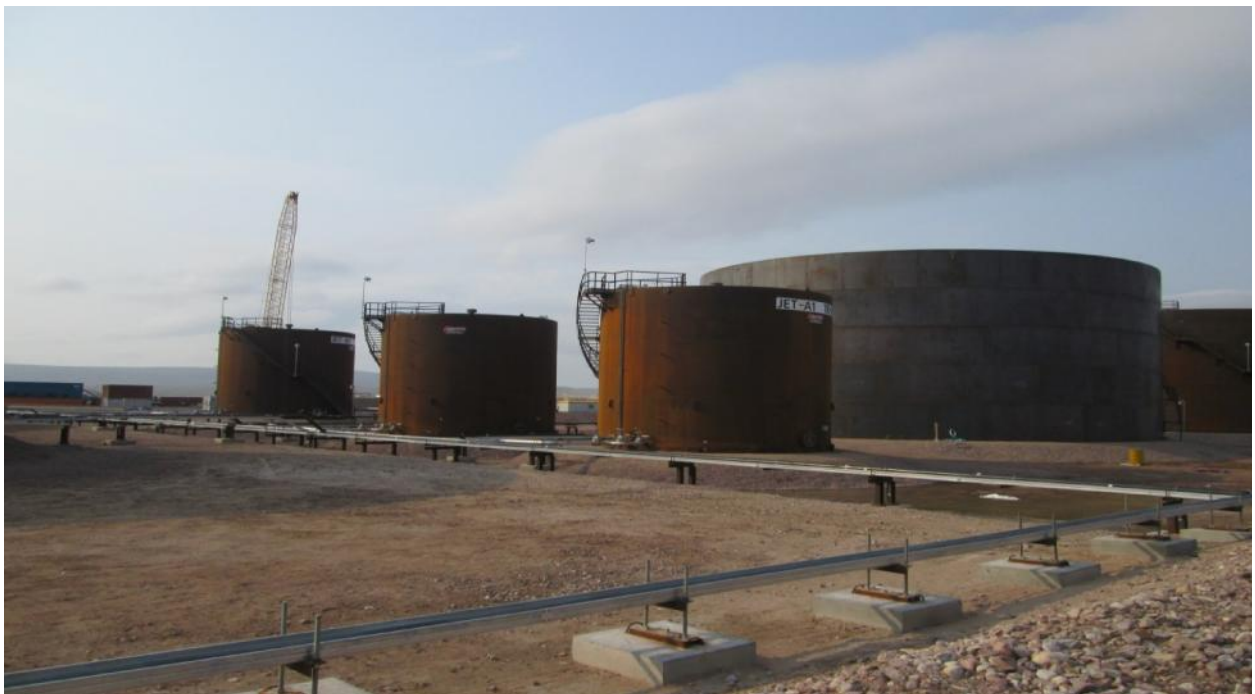
Photo taken from atop the containment dyke looking west into the containment.