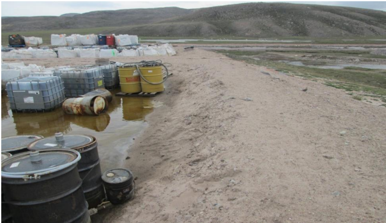
Photos taken along rear dyke at hazardous waste storage area. Note water contained within dyke.