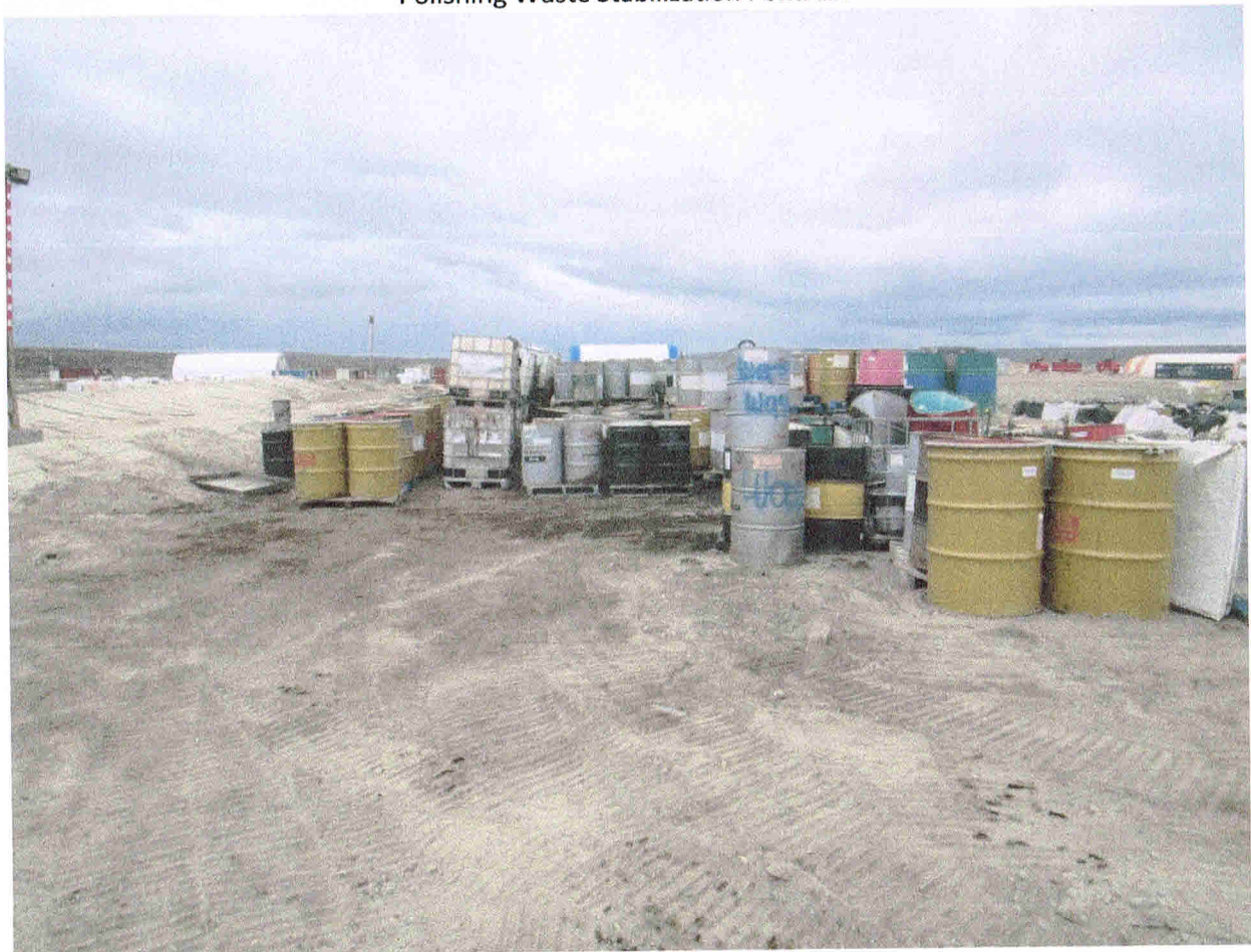
Barrel Fuel Containment MS-HWB-3