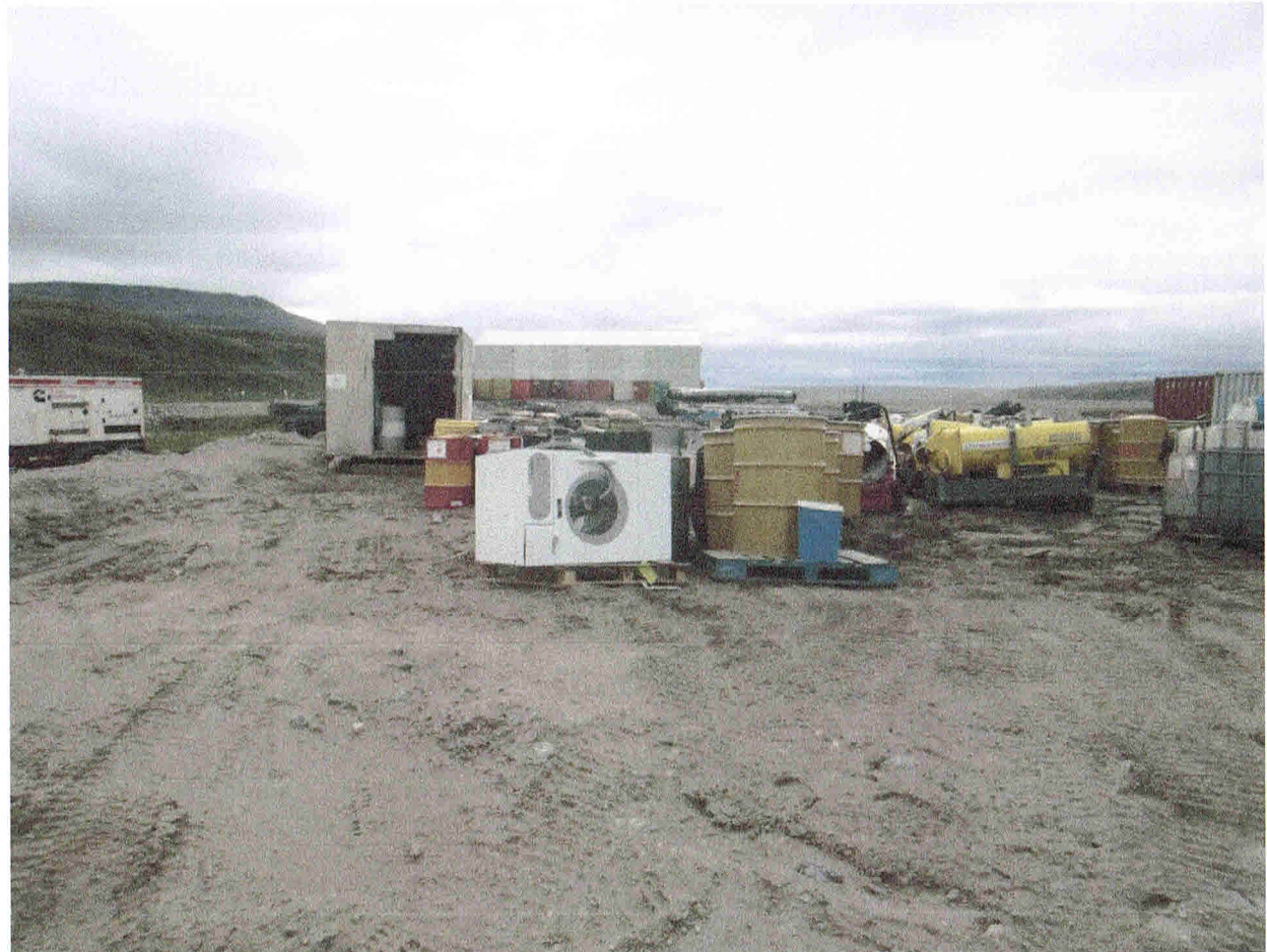
Hazardous Waste Containment MS-HWB-6