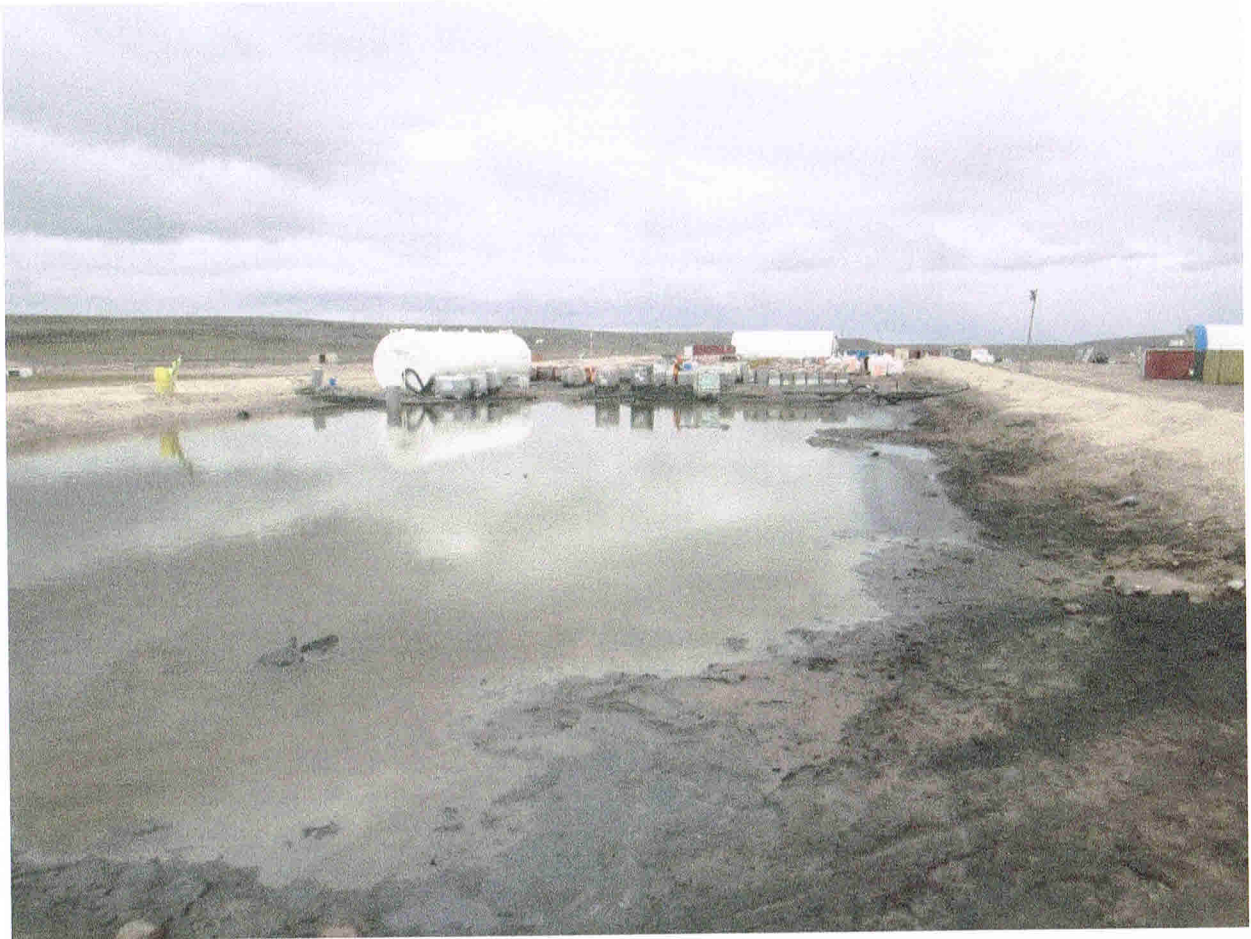
Bulk Fuel Storage Facility