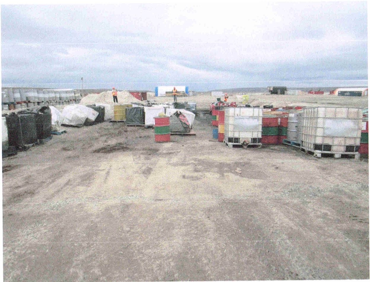
Barrel Fuel Containment MS-HWB-4