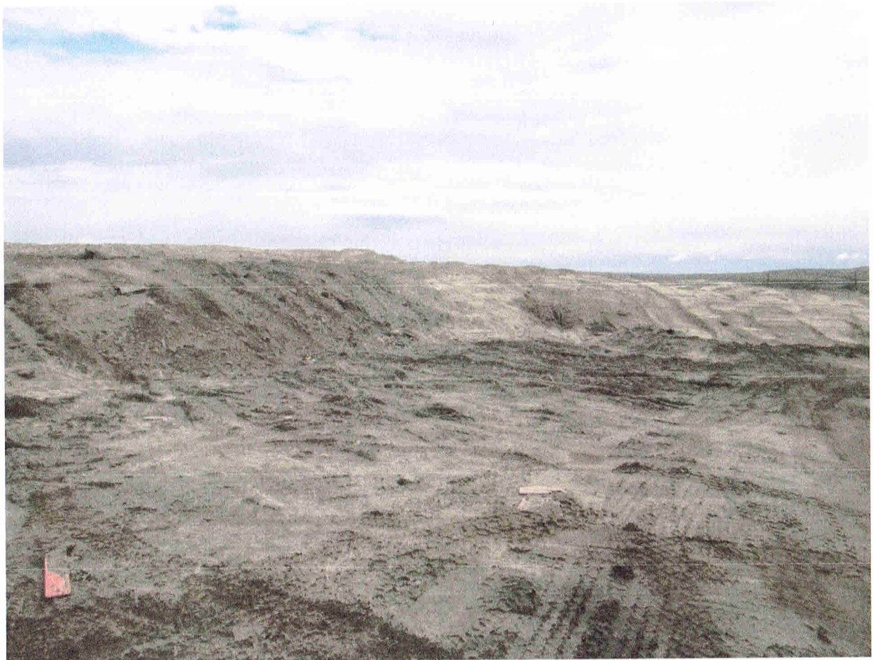
Solid Waste Disposal Site. Dyke to contain waste on edge of second lift.