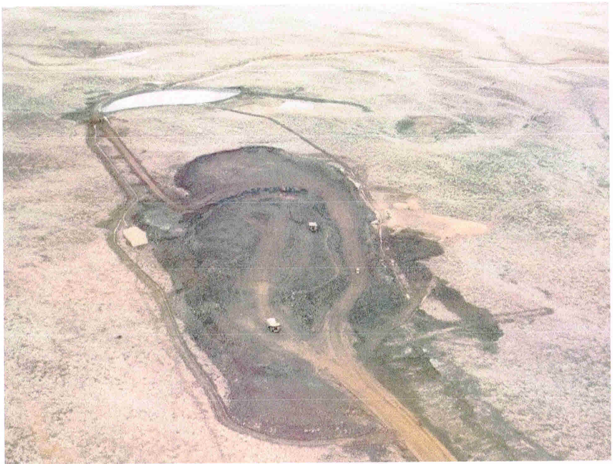
Aerial Photograph Waste Pile Drainage Containment