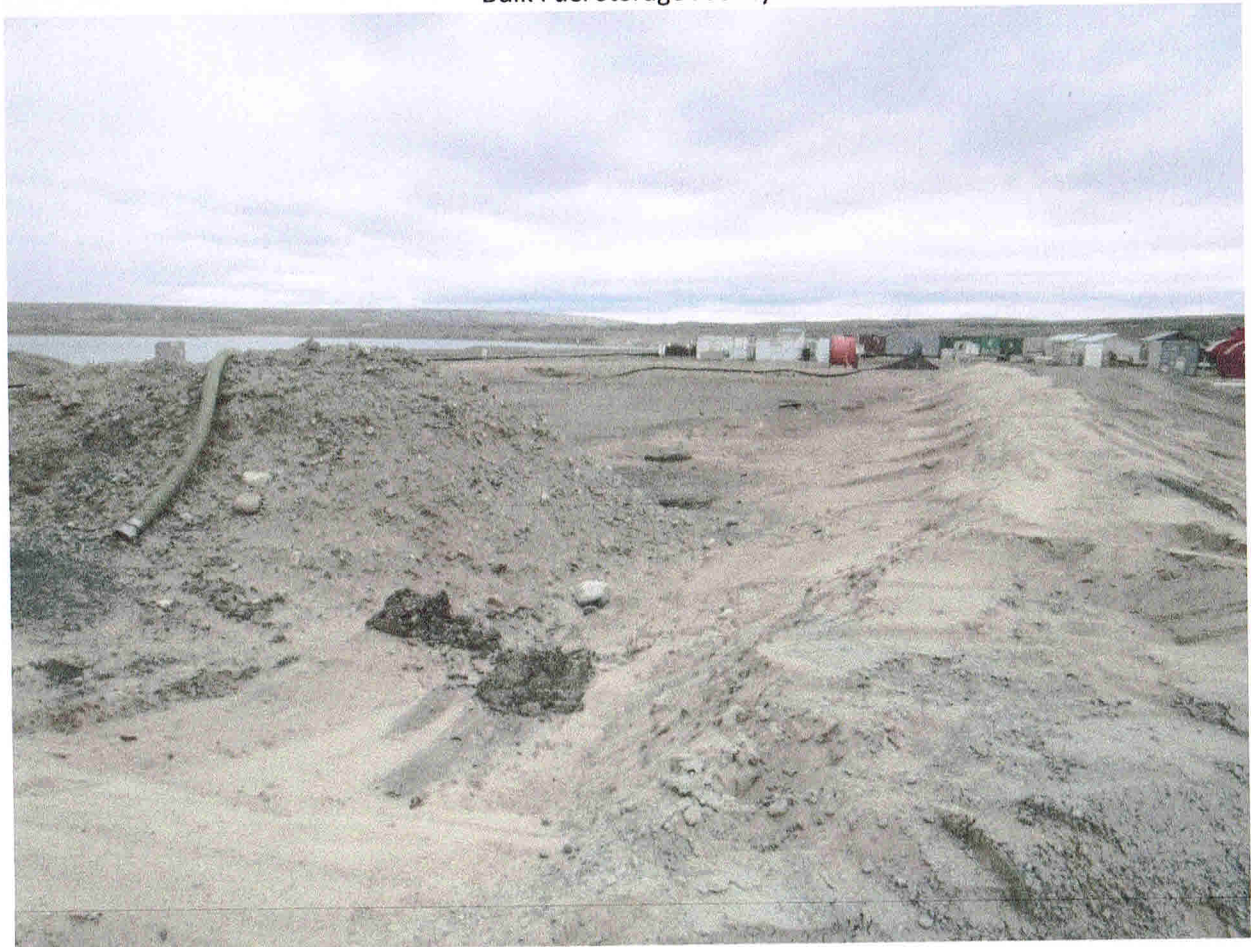
Generator Fuel Storage Facility. Containment now empty.