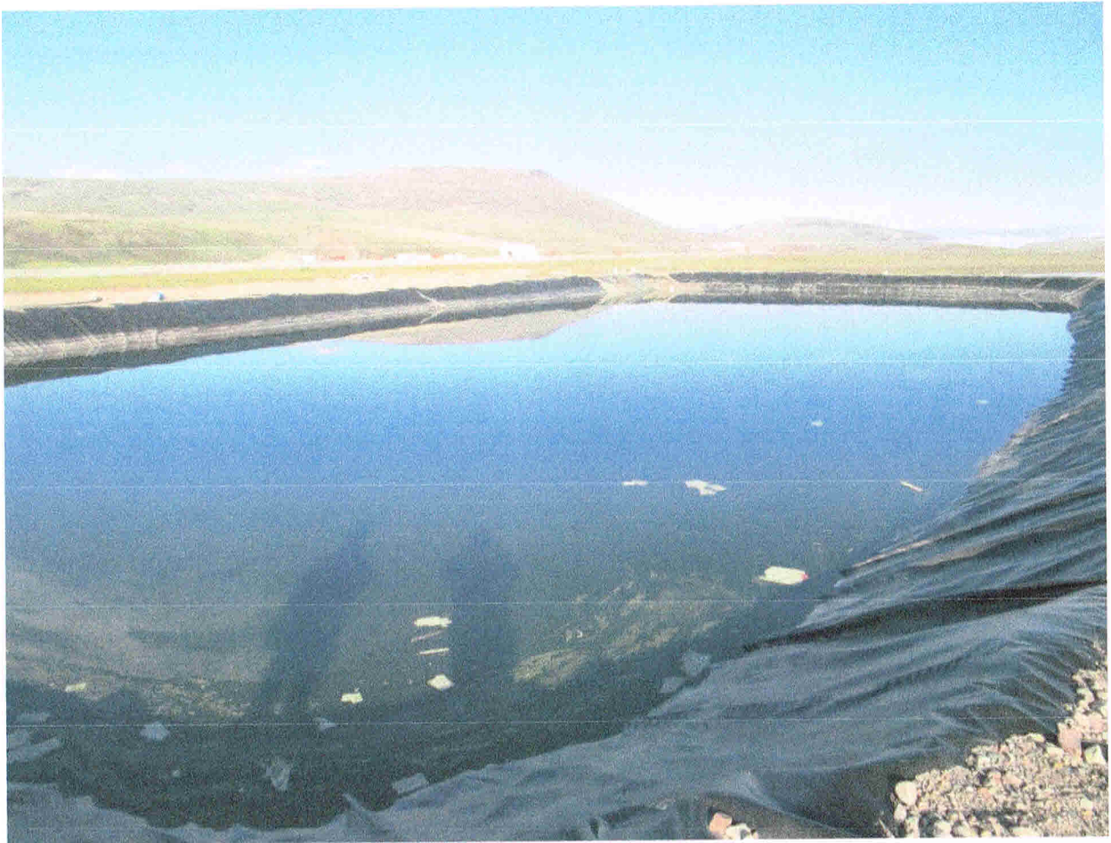
Polishing Waste Stabilization Pond #1