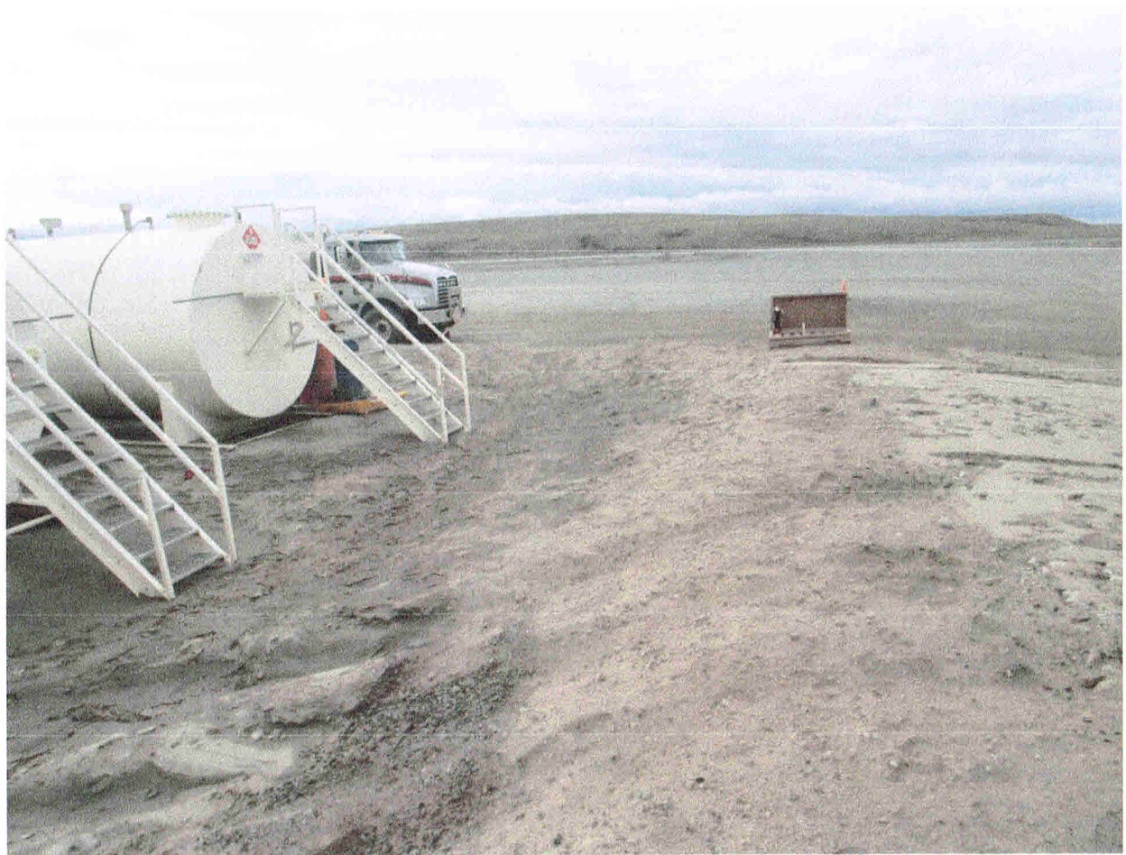
Jet "A" Fuel Containment