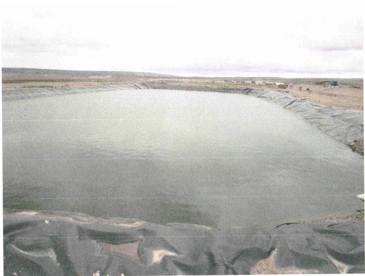
Polishing Waste Stabilization Pond #3.