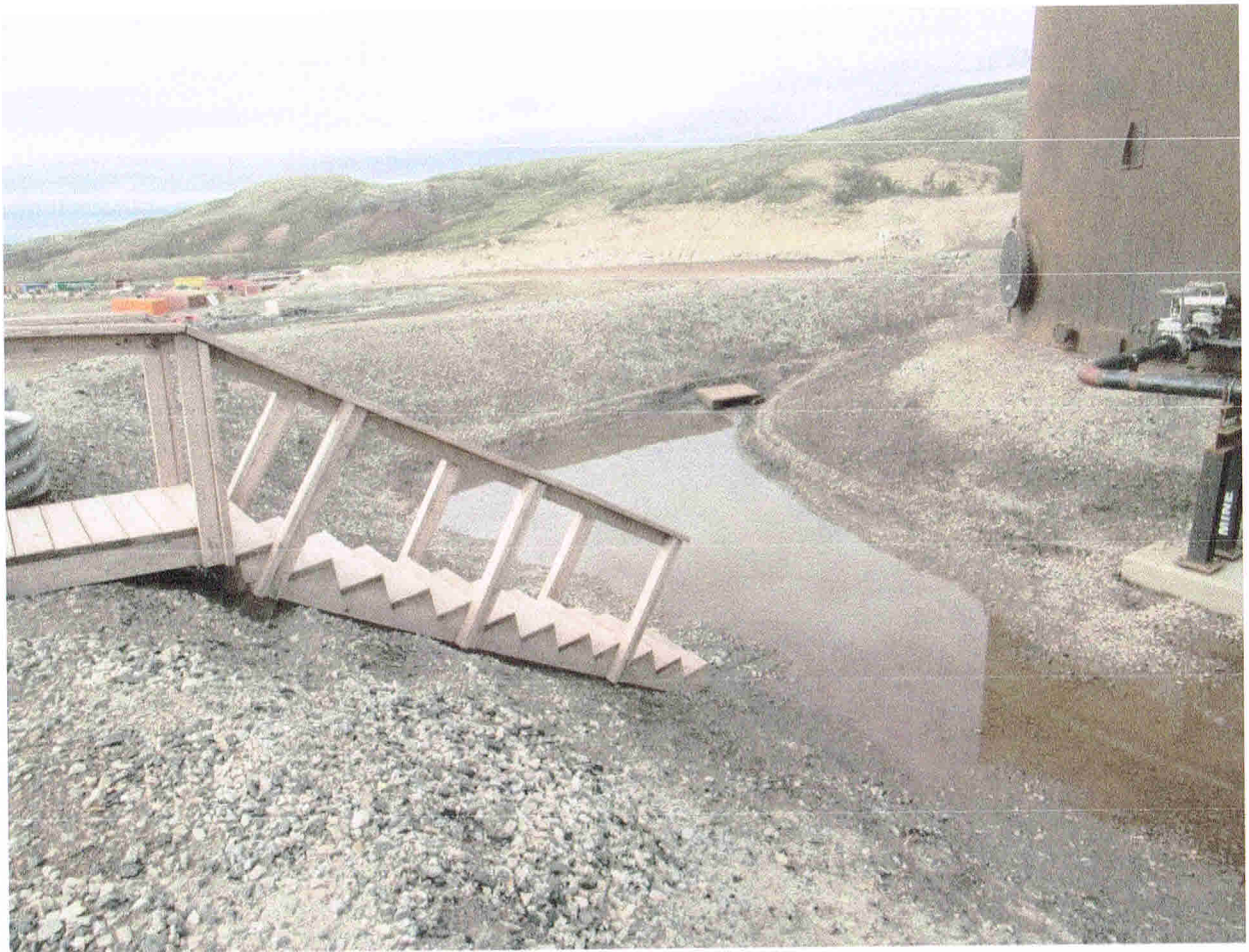
Minesite Steel Fuel Tank Containment