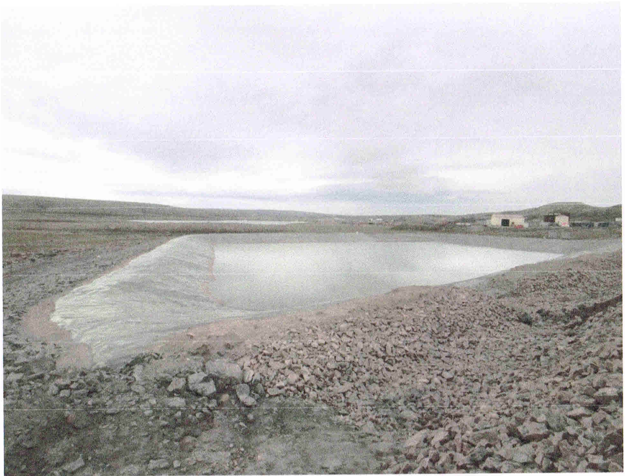
Crusher Pad Drainage Containment