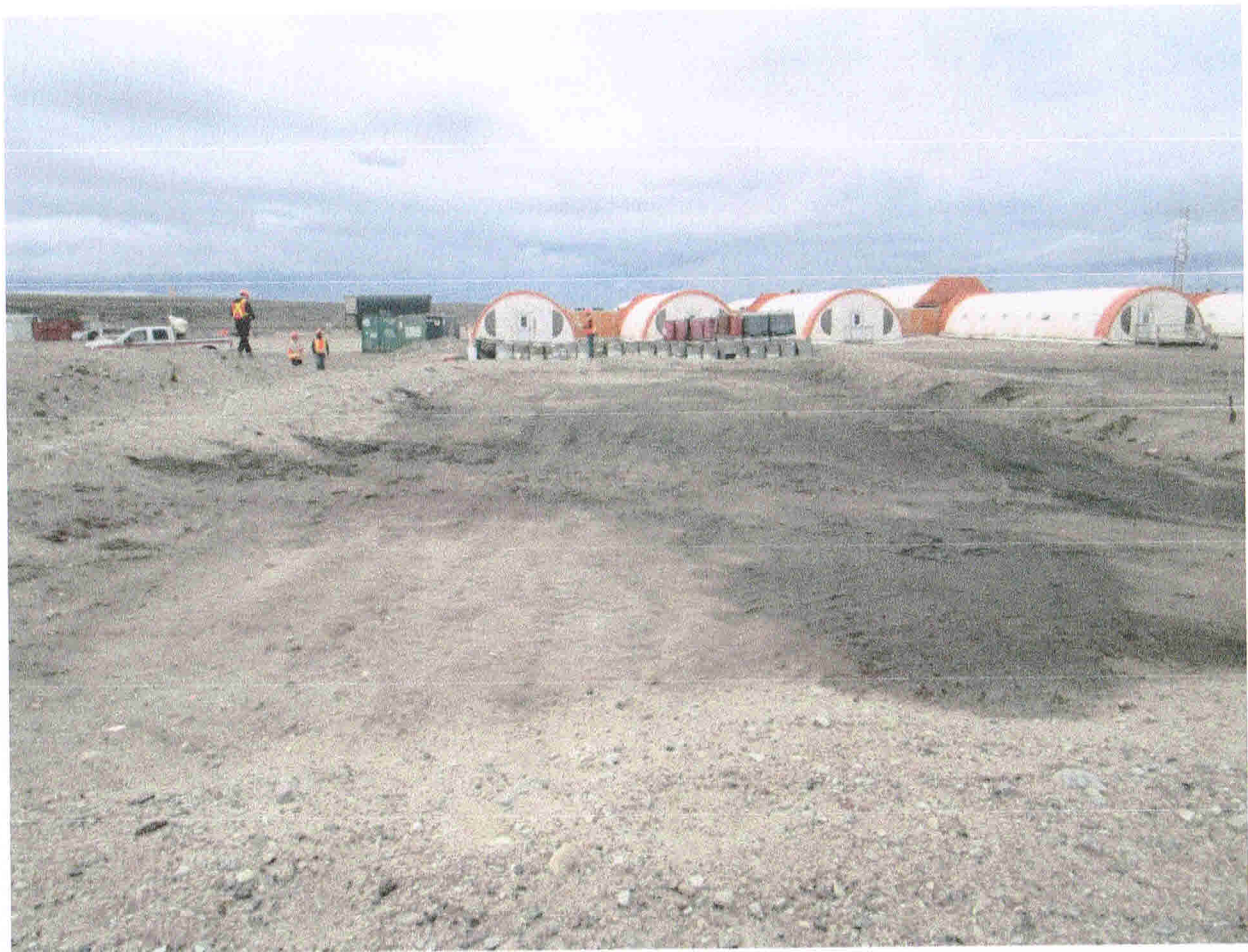
Enviro Tank Storage MS-HWB-5