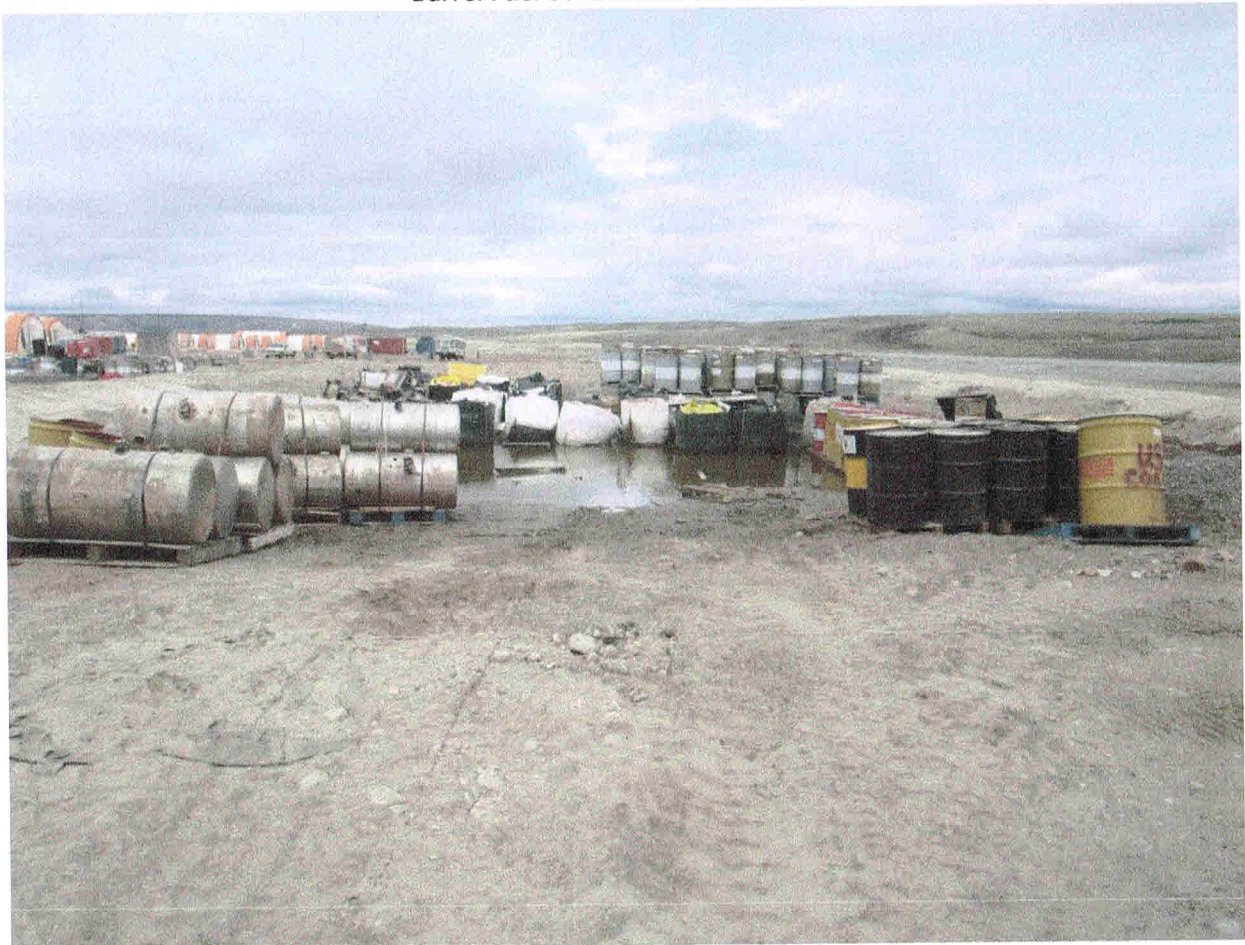
Hazardous Waste Storage MS-HWB-4