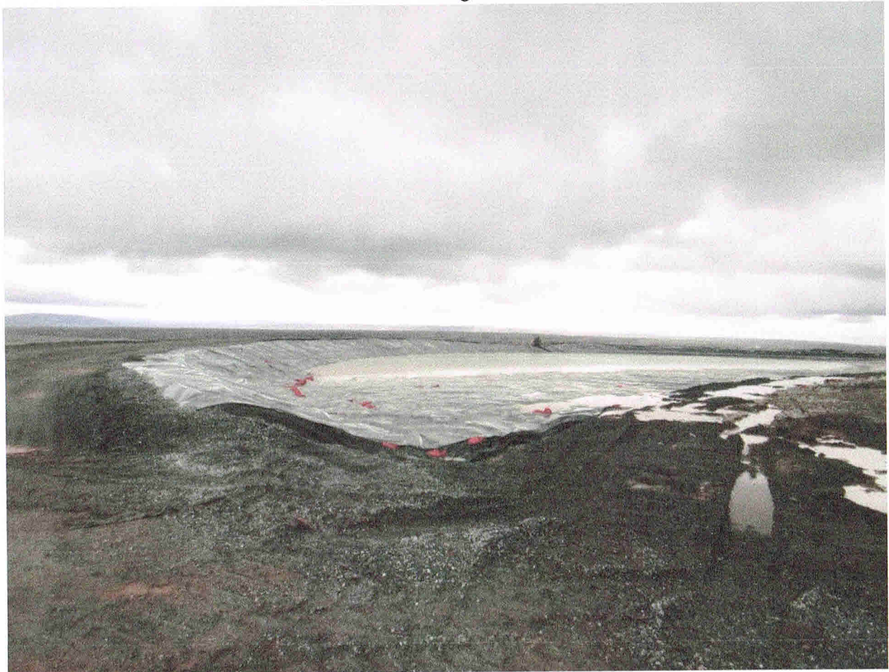
Waste Pile Drainage Containment