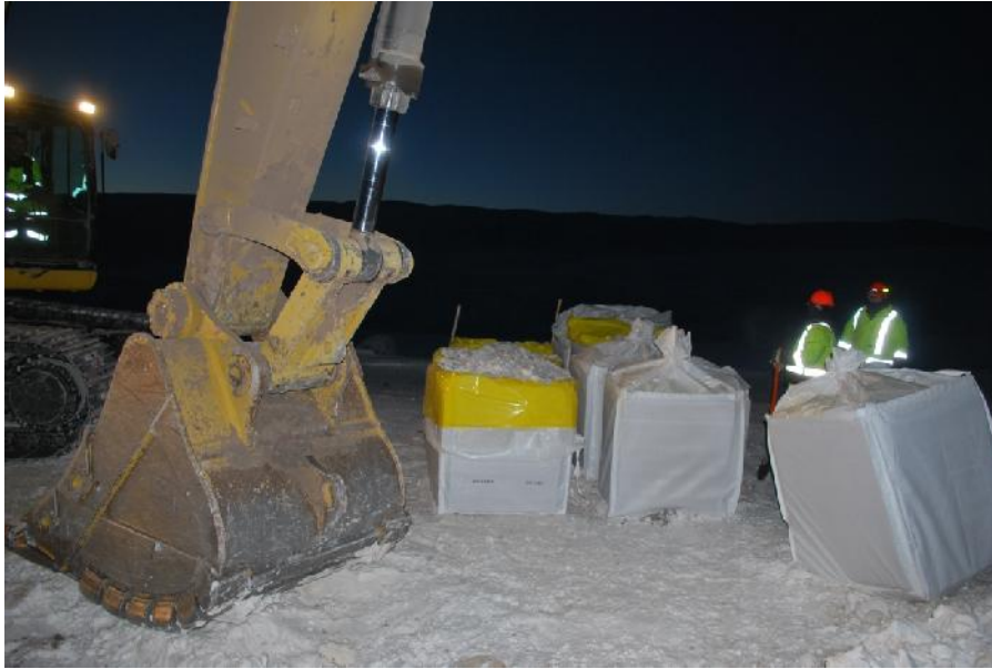
January 21, 2014, taken during spill cleanup