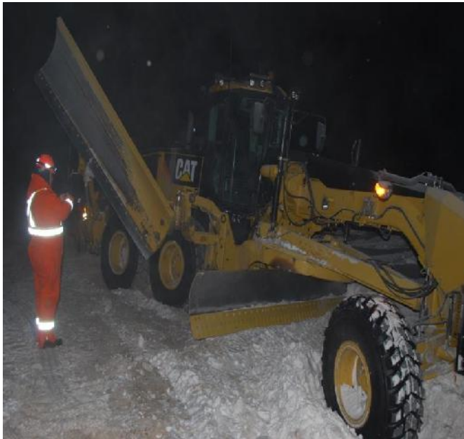
January 2, 2014, taken after spill cleanup