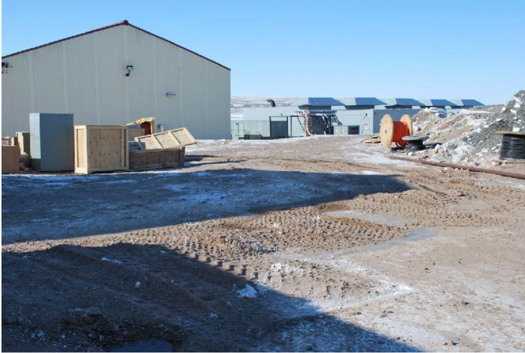
Figure 3 – Spill Cleanup