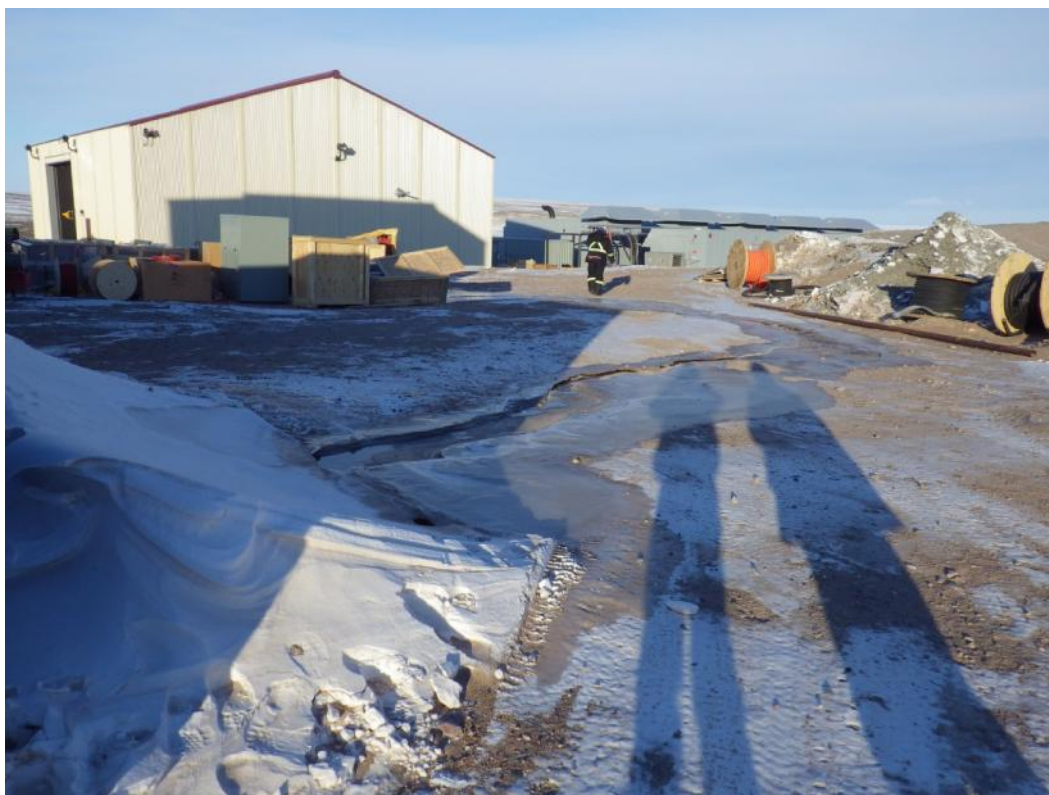
Figure 2 – Spill before Cleanup