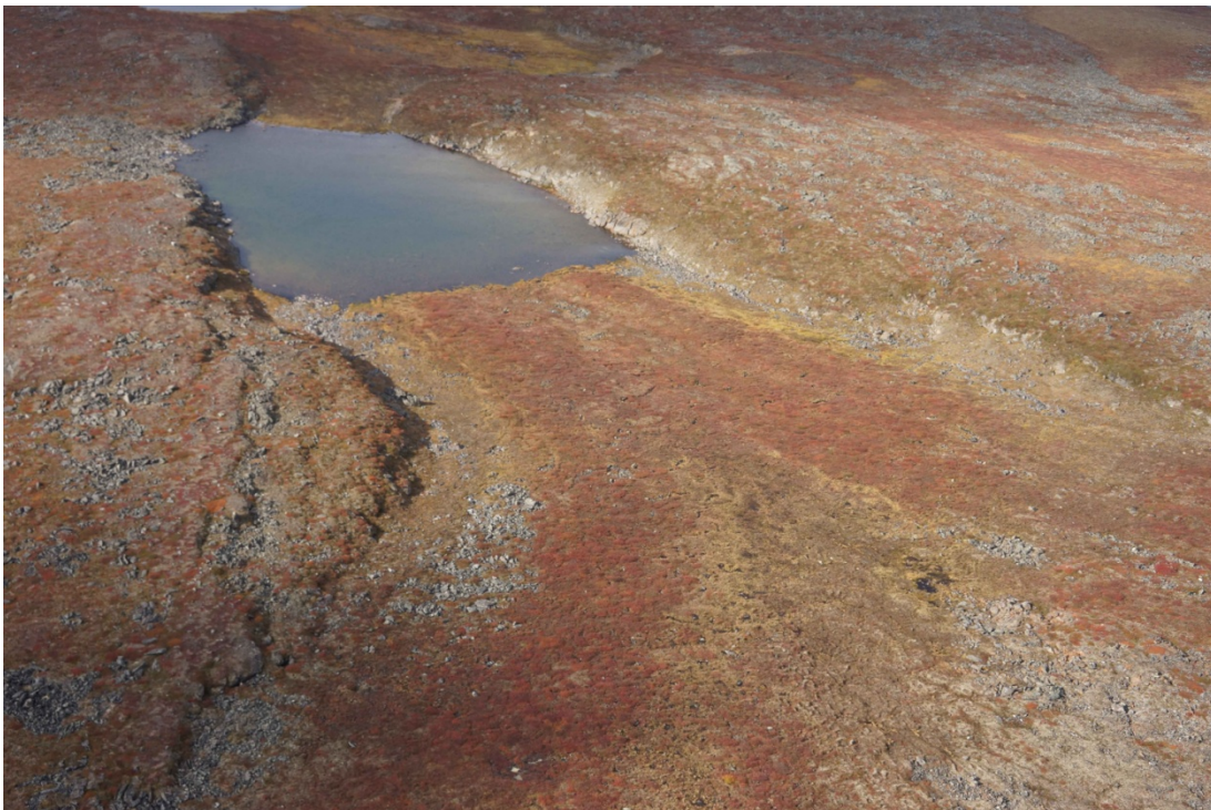
Location 12. Oblique aerial photograph 12-1.