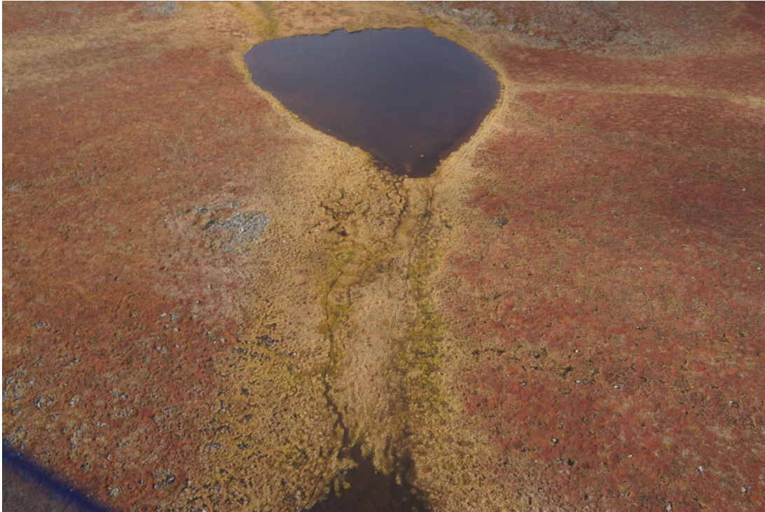
Location 11. Oblique aerial photograph 11-1.