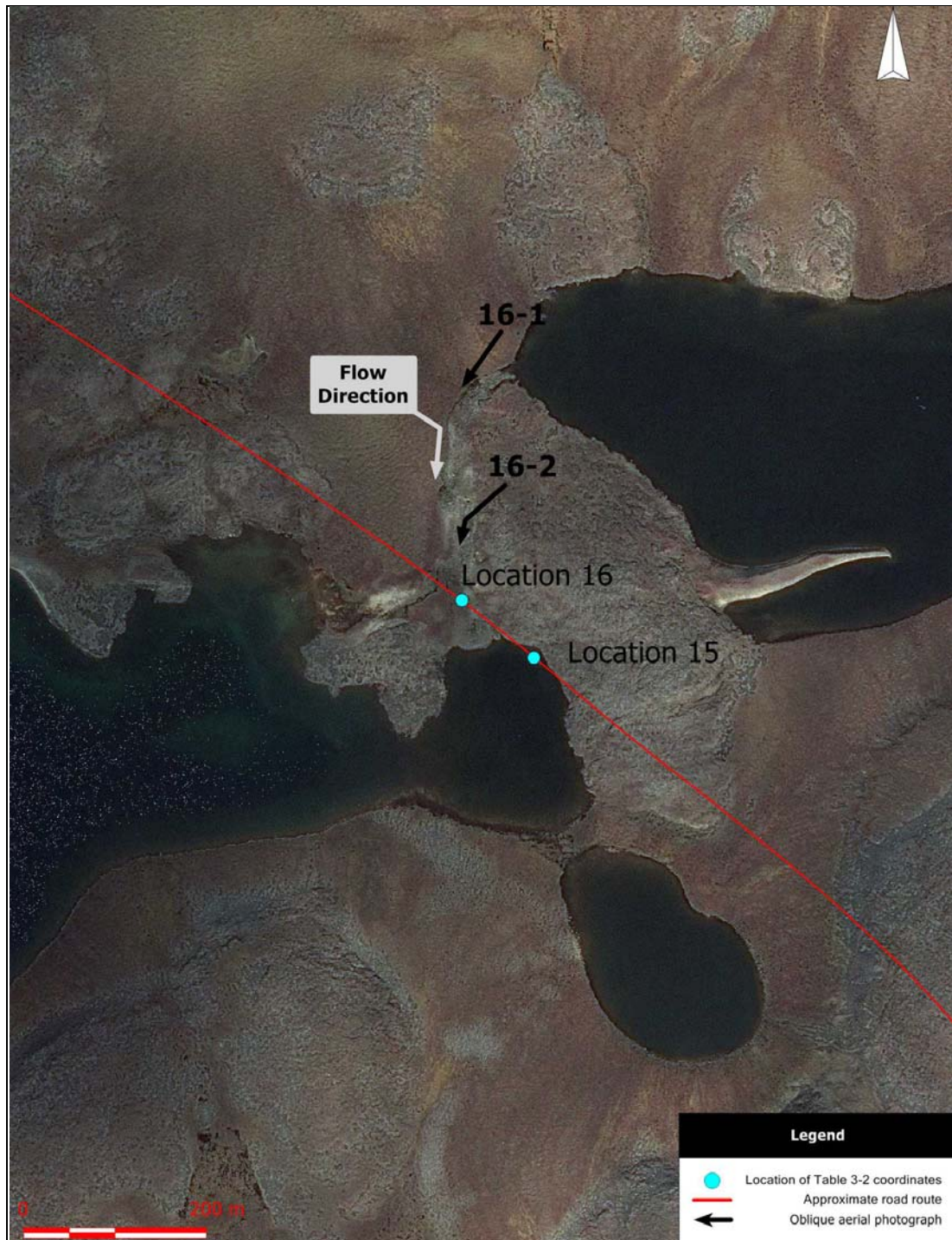
Locations 15 and 16. Aerial photograph (scale 1:5000) showing the approximate road route, the location of coordinates provided in Table 3-2, the flow direction, and the location of oblique aerial photographs. Lake at Location 15 will be avoided.