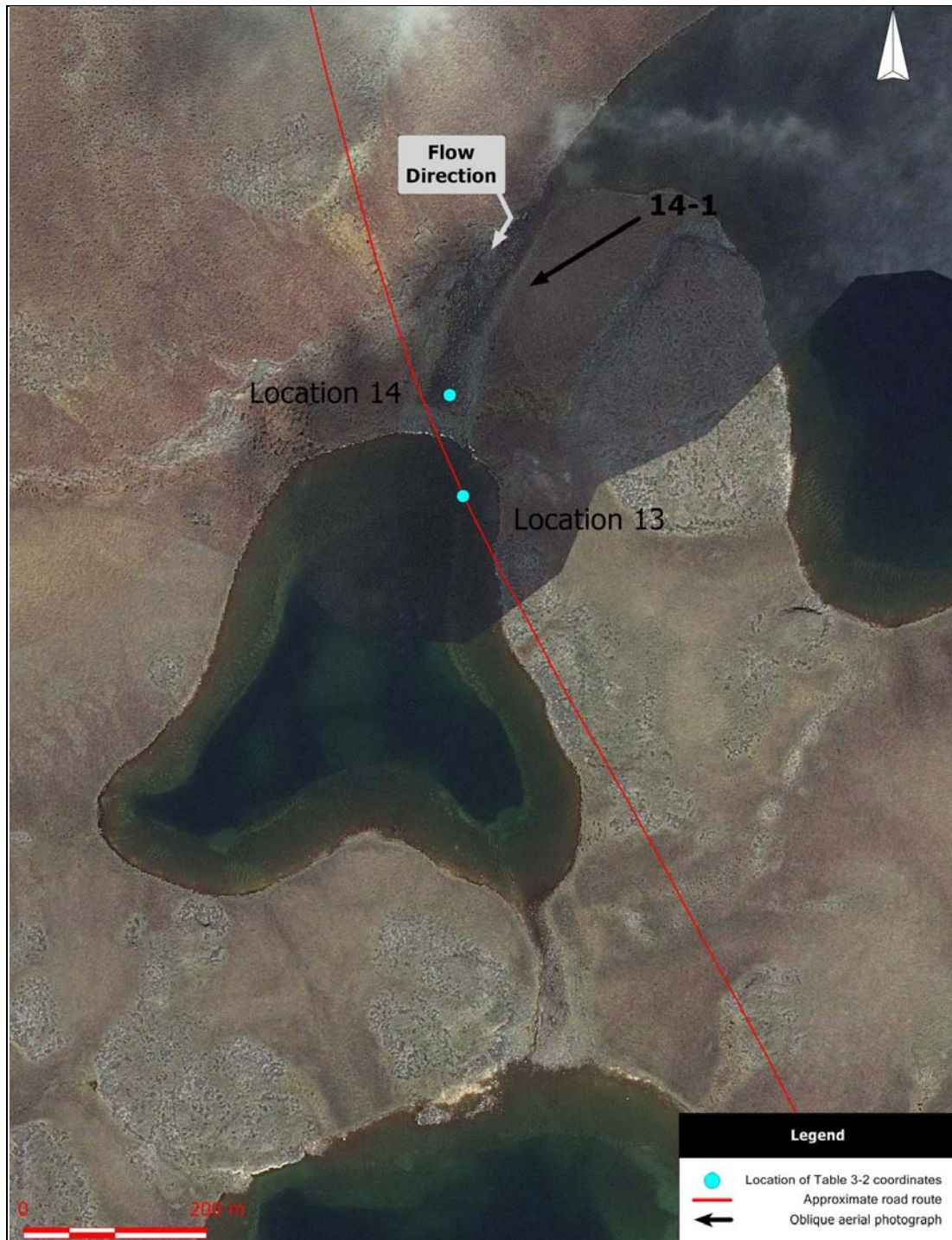
Locations 13 and 14. Aerial photograph (scale 1:5000) showing the approximate road route, the location of coordinates provided in Table 3-2, the flow direction, and the location of oblique aerial photographs. Lake at Location 13 will be avoided.