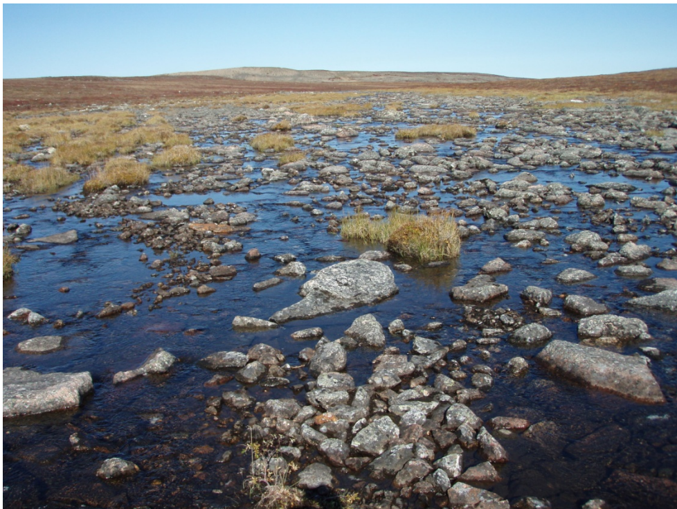
Location 14. Photograph from the ground. Approximately 100 m upstream from lake.