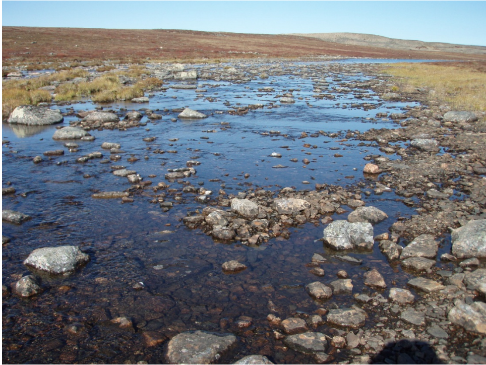
Location 14. Photograph from the ground. Approximately 150 m upstream from lake.