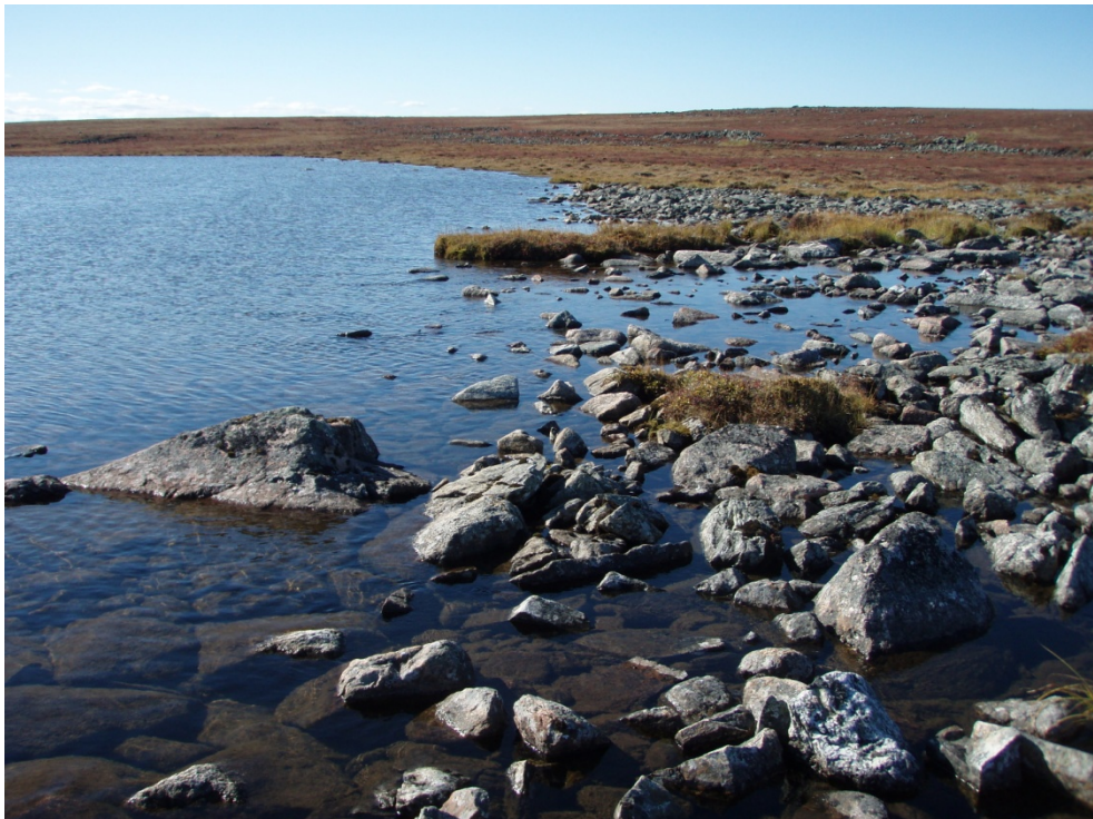
Location 13. Photograph from the ground. View north along lakeshore from watercourse.