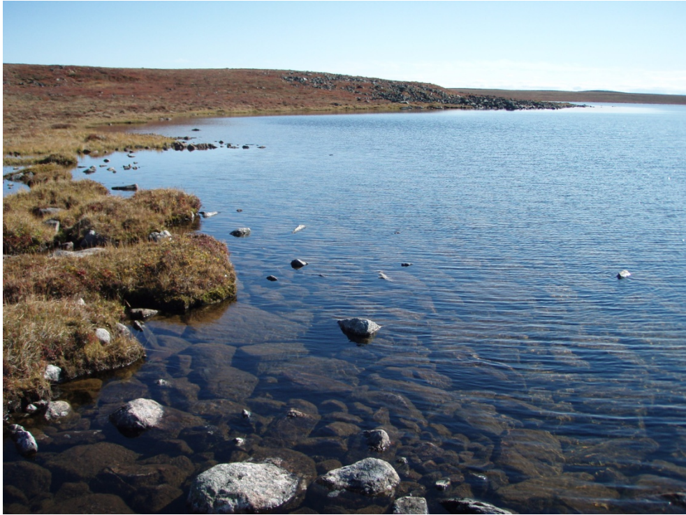
Location 13. Photograph from the ground. View south along lakeshore from watercourse.