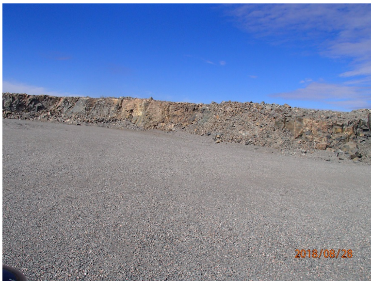
Photograph F1-4: Quarry 2 – km 13+250

Description: View of north and west walls.