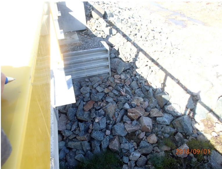
Photograph E2-30 Bridges 8 – km 43+500

Description: Looking at the north abutment.