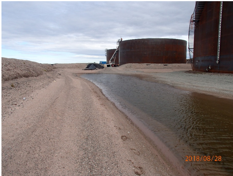
Photograph G1-9 Baker Lake Tank Farm