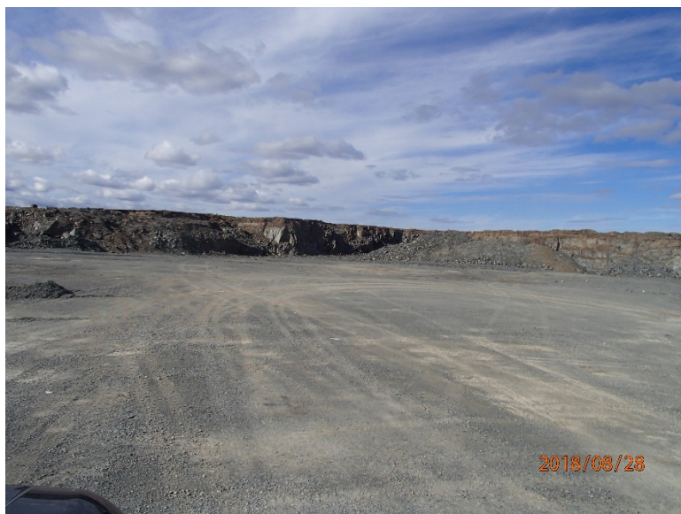
Photograph F1-17: Quarry 11 – km 53+500