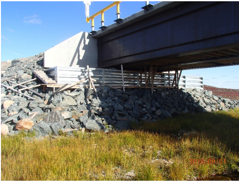
Photograph E2-31 Bridges 9 – km 44+800