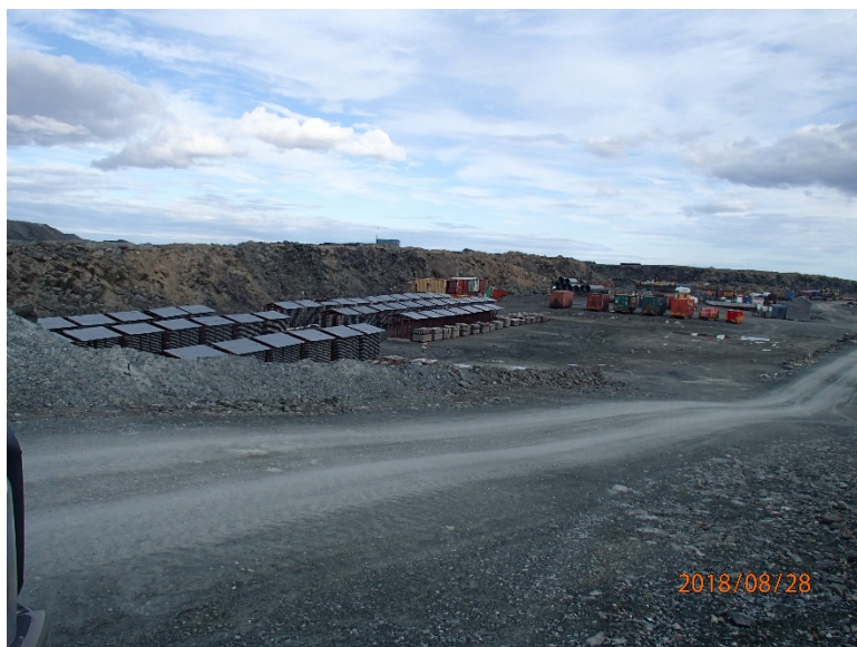
Photograph F1-37: Quarry 23 (Airstrip Quarry)