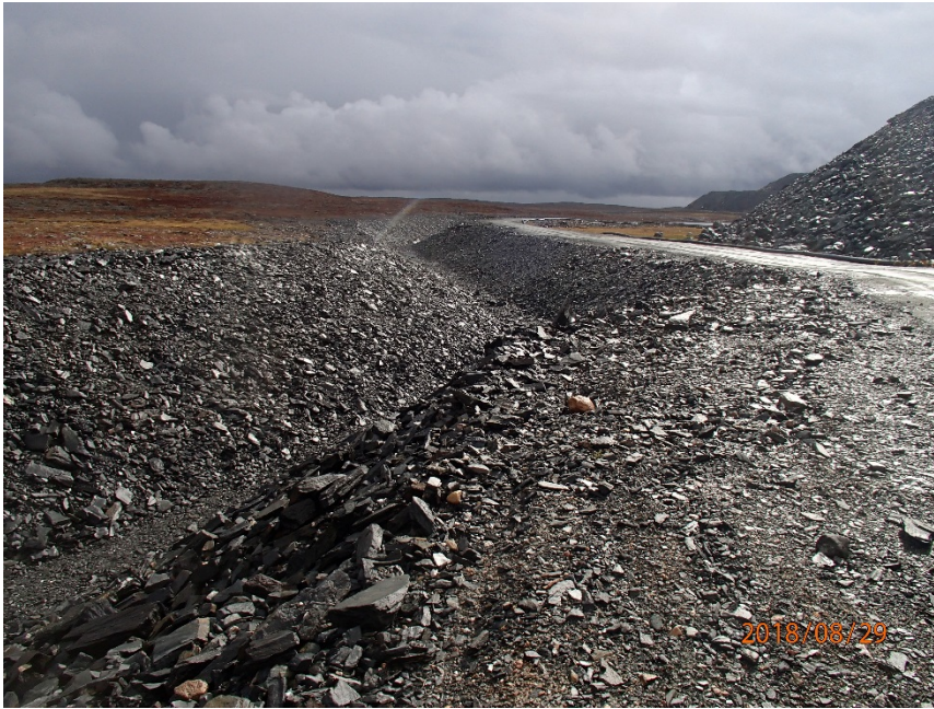
Photograph H2-5 Diversion Ditch and its Sediment and Erosion Protection Structure