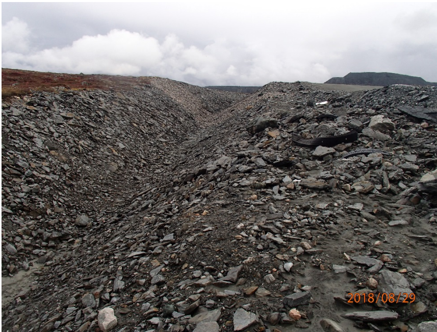
Photograph H2-17 Diversion Ditch and its Sediment and Erosion Protection Structure