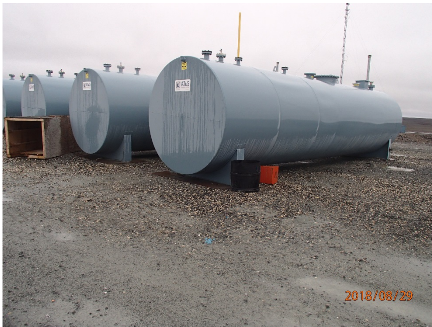
Photograph G3-2 Vault Tank Farm

Description: From the southeast corner of the Tanks looking northwest toward the Vault Tank Farm.