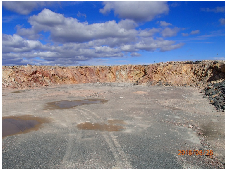
Photograph F1-7: Quarry 5 – km 34+650