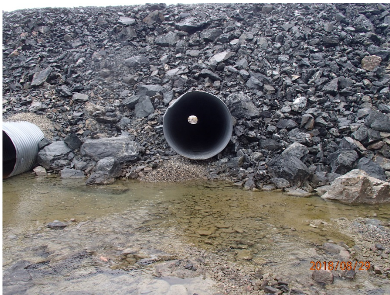
Photograph H1-4 Vault Road Culverts

Description: From the inlet side of the three culverts located on Vault Road at 640964E/7217466N. Looking inside the central culvert. The culvert is slightly deformed on top in the middle.