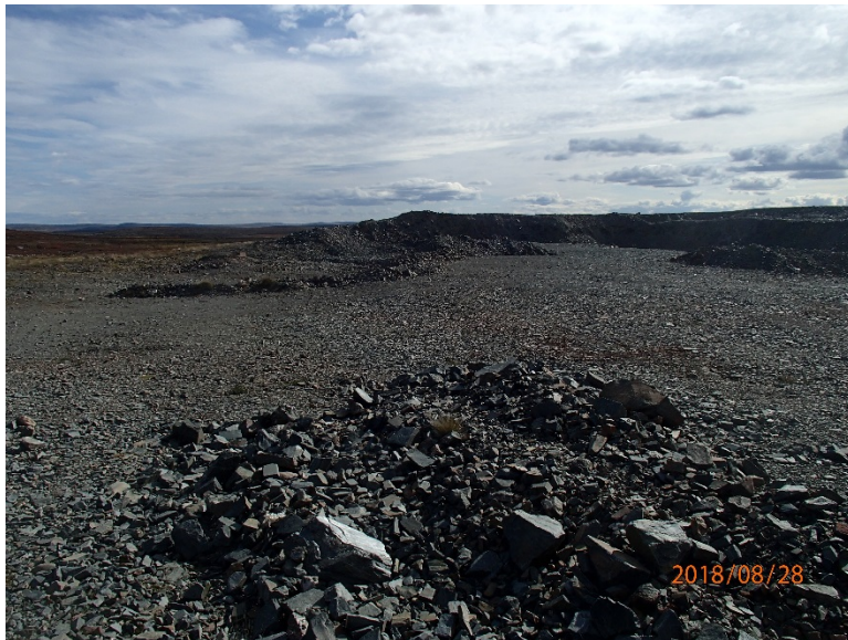
Photograph F1-19: Quarry 12 – km 58+300