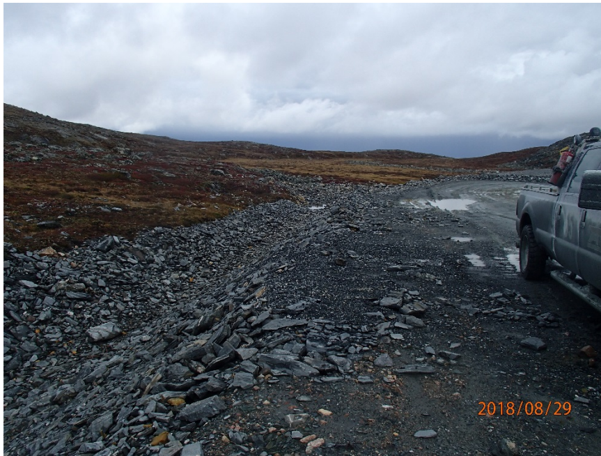
Photograph H2-13 Diversion Ditch and its Sediment and Erosion Protection Structure