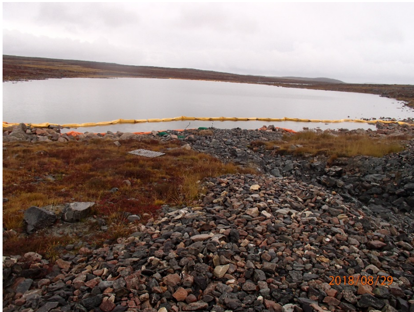
Photograph H2-1 Diversion Ditch and its Sediment and Erosion Protection Structure