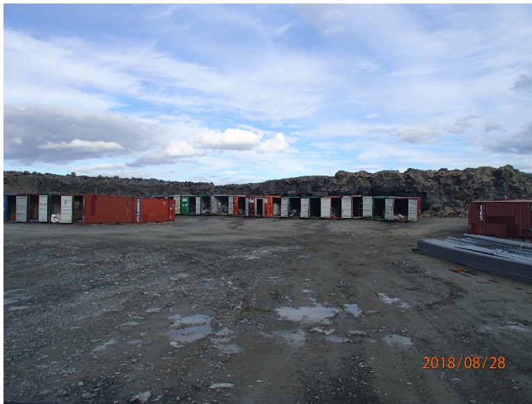
Photograph F1-40: Quarry 23 (Airstrip Quarry)

Description: Looking at the north wall. Presence of loose rocks along steep wall.