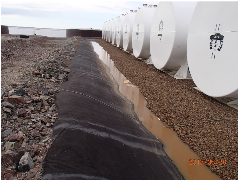
Photograph G1-22 Baker Lake Tank Farm

Description: Looking west at the northeastern side of Tank 5.