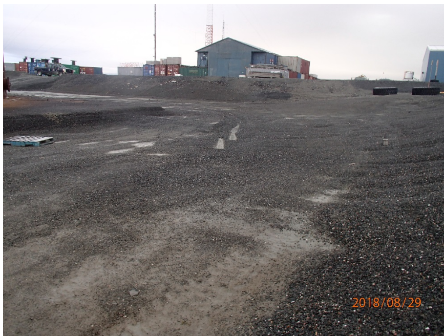
Photograph G2-3 Meadowbank Tank Farm