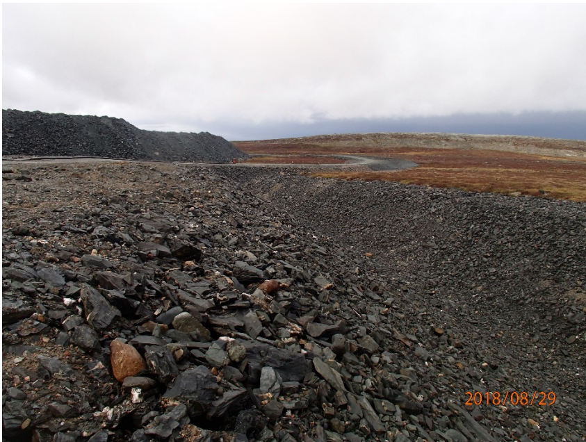
Photograph H2-6 Diversion Ditch and its Sediment and Erosion Protection Structure

Description: From the eastern diversion ditch, looking east.