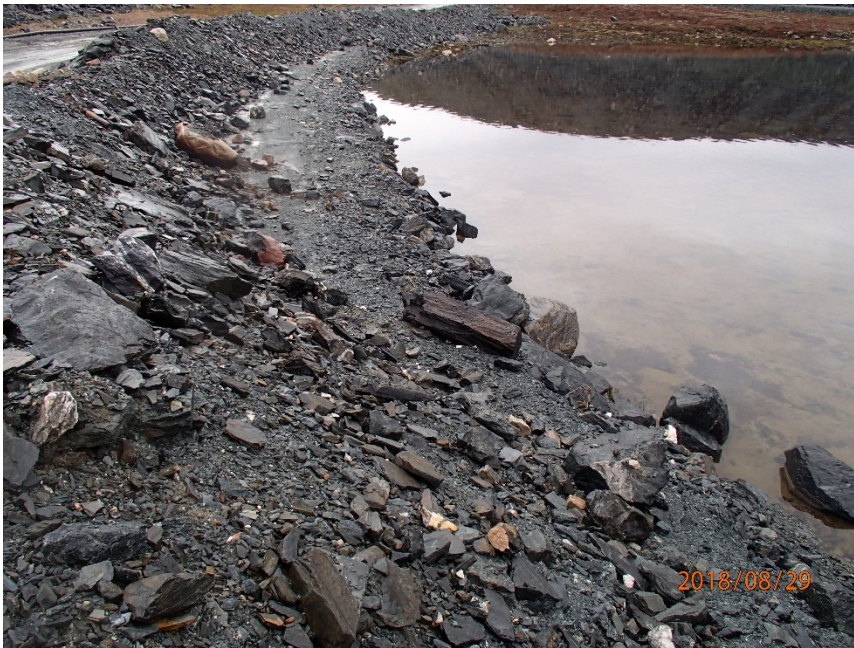
Photograph H3-1 RSF Till Plug