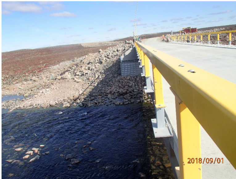
Photograph E2-27 Bridges 7 – km 32+300