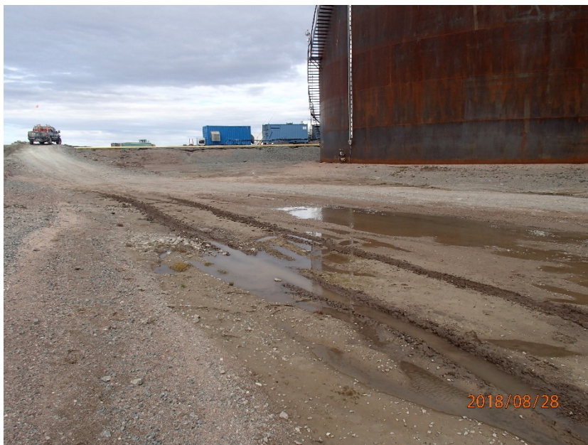
Photograph G1-4 Baker Lake Tank Farm

Description: From the north side of Tank 1, looking southeast at Tanks 1, 2, 3, and 4.