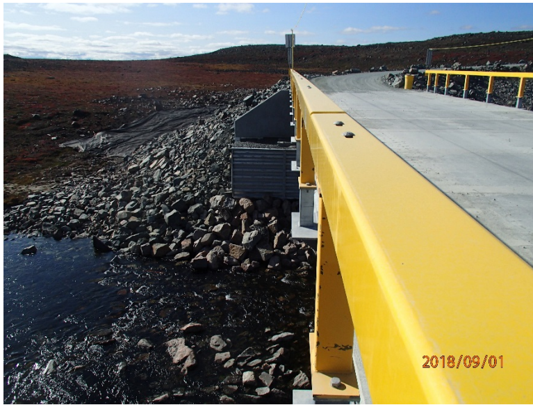
Photograph E2-25 Bridges 7 – km 32+300