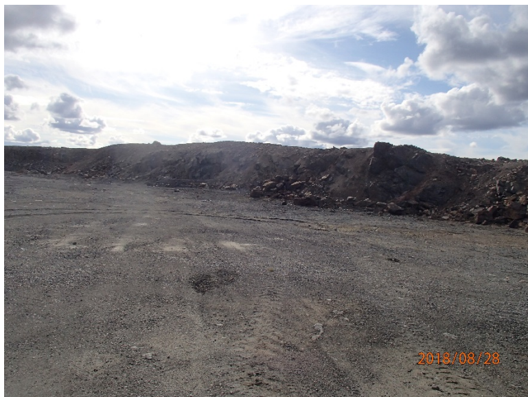
Photograph F1-28: Quarry 16 – km 70+400

Description: View of the south and west walls. Presence of loose rocks on steep wall.