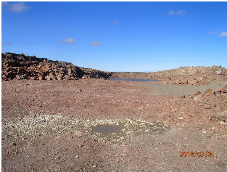
Photograph F2-8 Eskers and Quarries 5 – km 52+000

Description: View of the rock quarry at km 52. In good conditions with loose blocks and cobbles on the north wall.