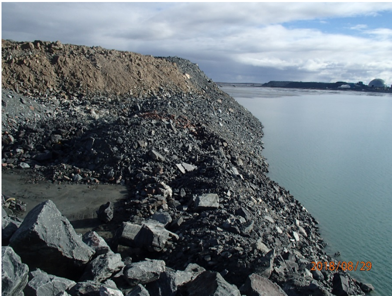
Photograph H6-6 Contaminated Soil Storage and Bioremedial Landfarm Facility

Description: From the northeast extremity of the South Cell, looking northwest at the Contaminated Soil Storage and Bioremedial Landfarm Facility. Sign of superficial slope failure.