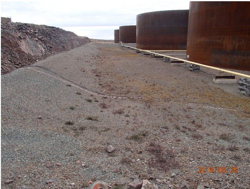
Photograph G1-3 Baker Lake Tank Farm