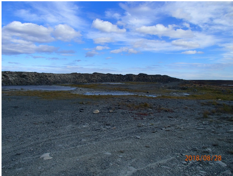
Photograph F1-21: Quarry 13 – km 62+350