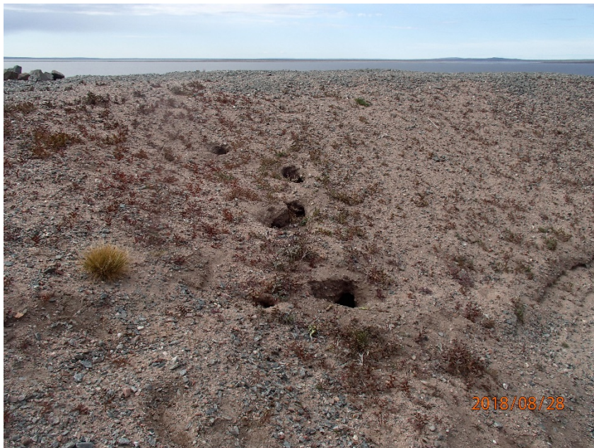
Photograph G1-6 Baker Lake Tank Farm

Description: Looking northeast toward the south side of Tanks 2 and 3.