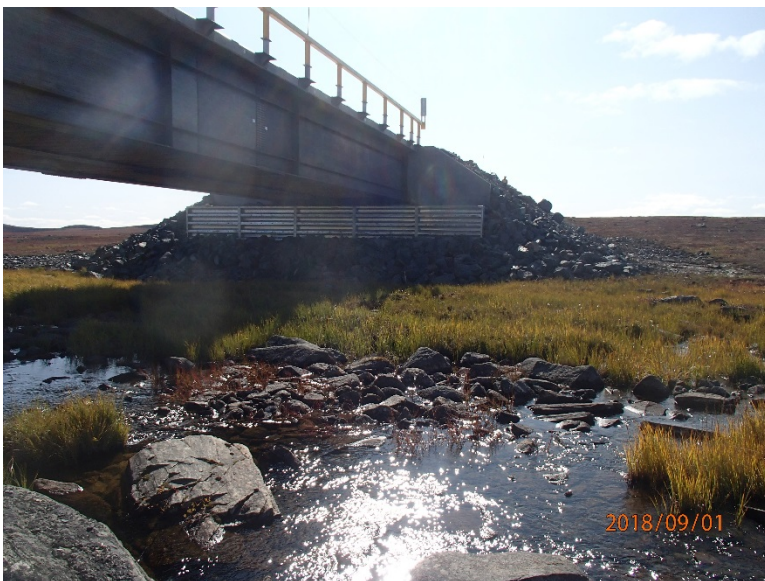
Photograph E2-32 Bridges 9 – km 44+800

Description: Looking at the north abutment.