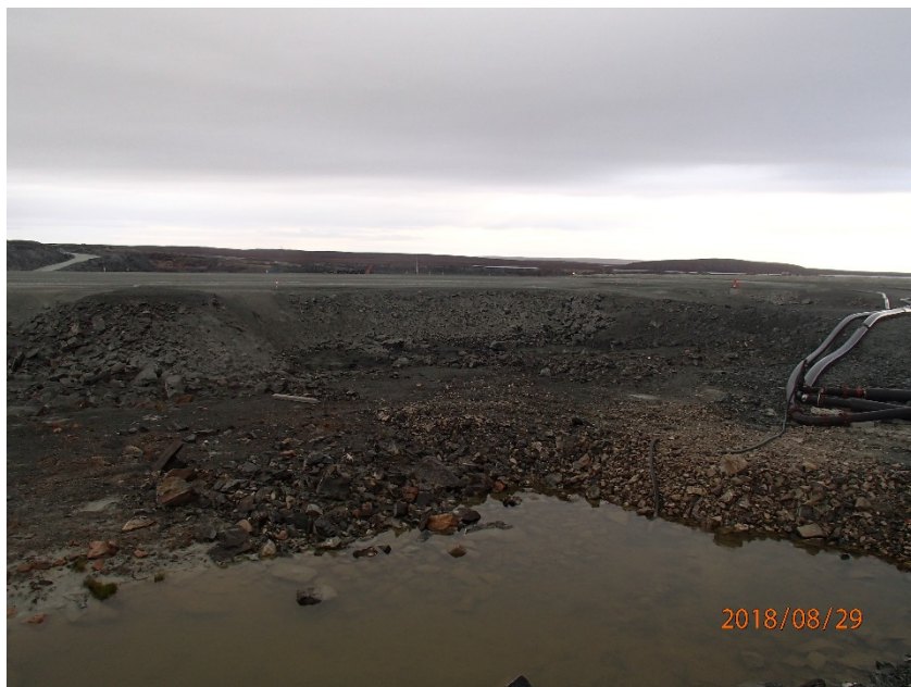
Photograph H8-6 Airstrip

Description: From the southeast side of the airstrip looking northwest.