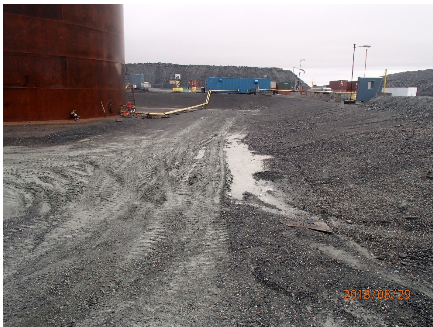
Photograph G2-1 Meadowbank Tank Farm