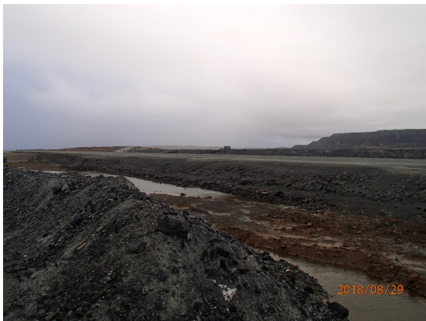
Photograph H8-5 Airstrip