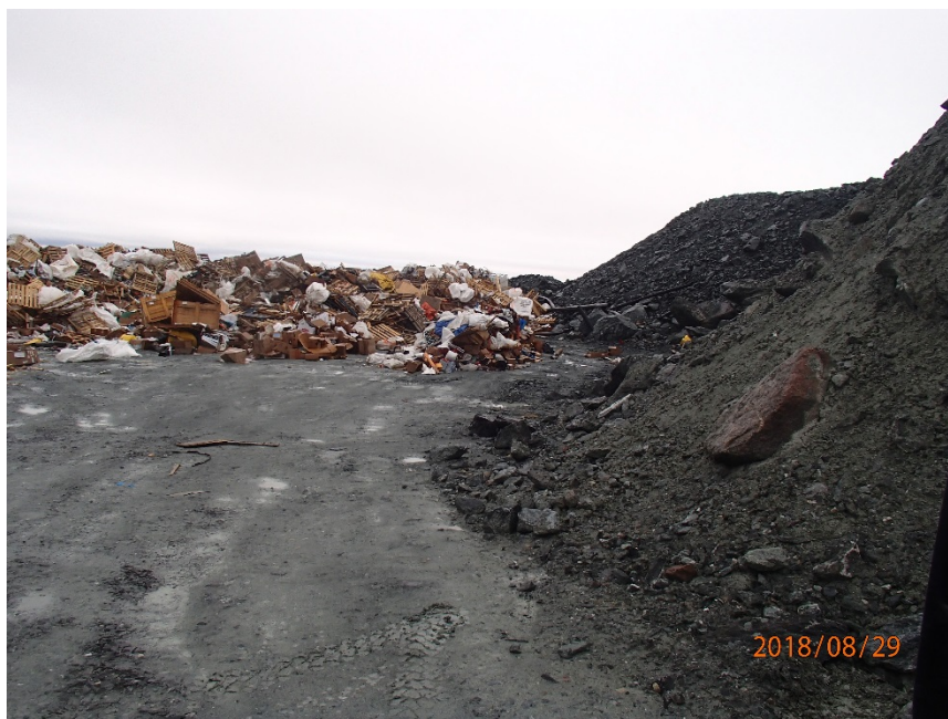
Photograph H5-1 Landfill