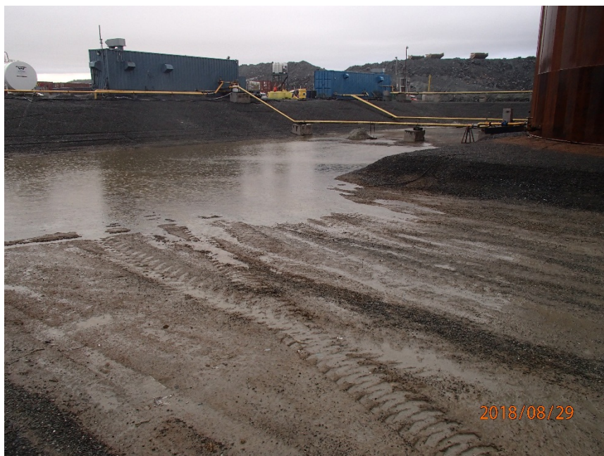
Photograph G2-4 Meadowbank Tank Farm

Description: From the eastern side, looking northwest.