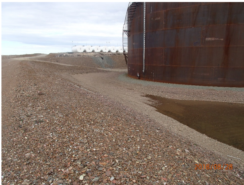
Photograph G1-16 Baker Lake Tank Farm

Description: From the northwestern corner of Tank 3 looking southeast towards the northeastern side of Tanks 3 and 4.