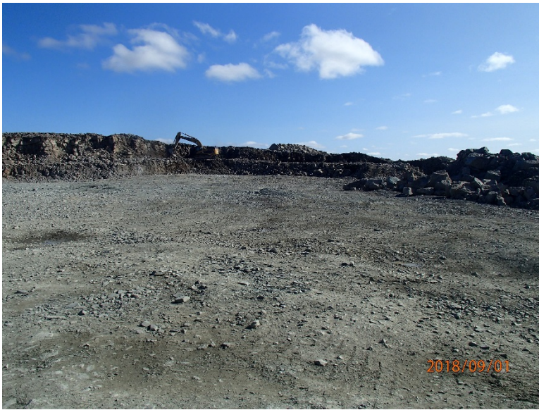
Photograph F2-5 Eskers and Quarries 3 – km 30+180