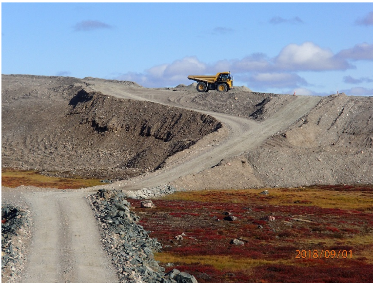
Photograph F2-6 Eskers and Quarries 4 – km 46+000

Description: View of Quarry 30.5. Most walls are in unstable condition.