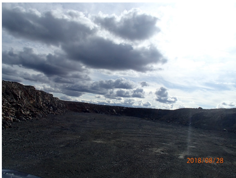
Photograph F1-27: Quarry 16 – km 70+400