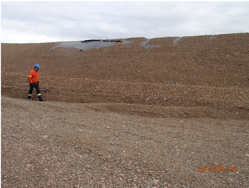
Photograph G1-21 Baker Lake Tank Farm