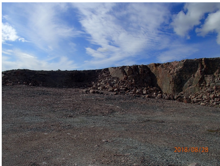
Photograph F1-31: Quarry 19 – km 84+300