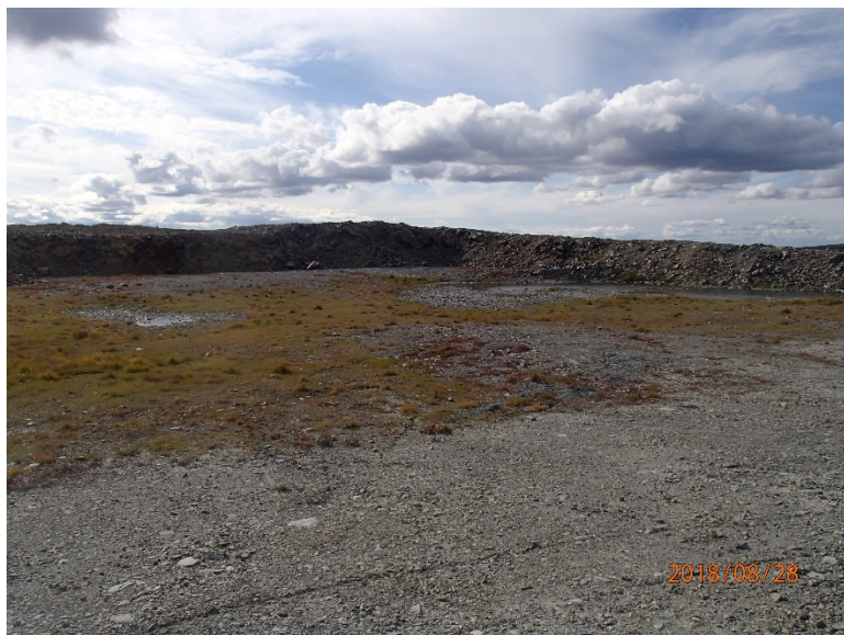
Photograph F1-26: Quarry 15 – km 67+600

Description: View of the south and west walls.