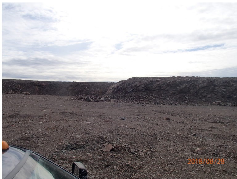
Photograph F1-1: Quarry 1 – km 5+200