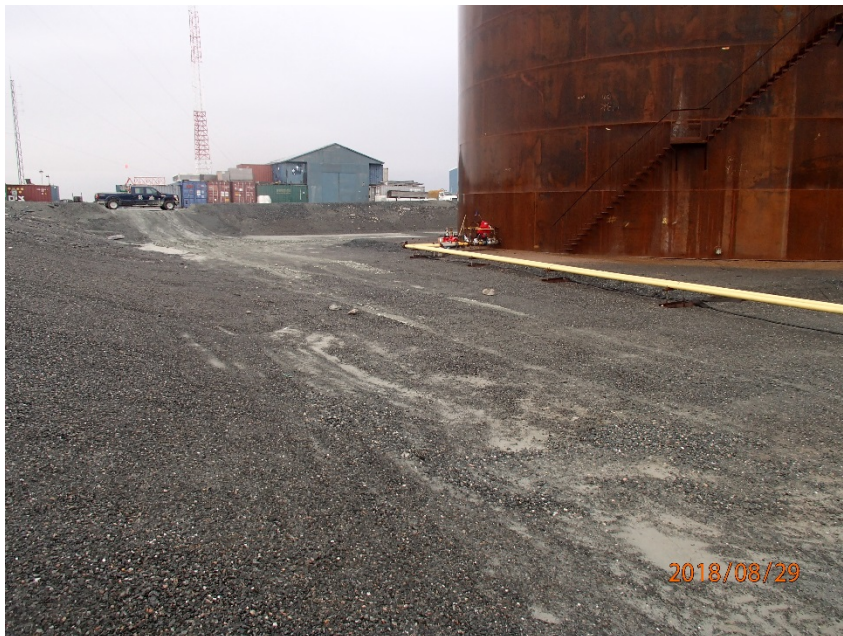
Photograph G2-6 Meadowbank Tank Farm

Description: Looking northeast from the southern corner. Accumulation of water in the eastern corner.