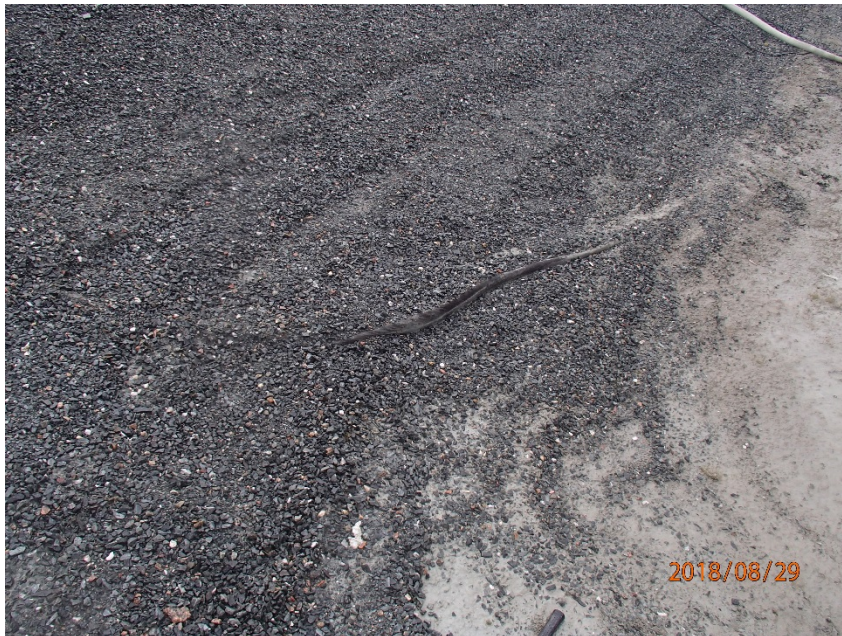
Photograph G2-7 Meadowbank Tank Farm