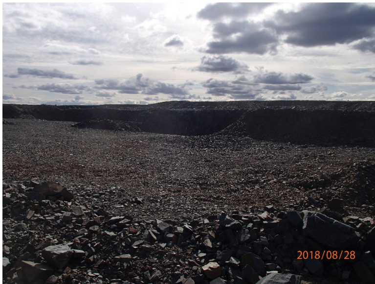
Photograph F1-20: Quarry 12 – km 58+300

Description: View of the south and east walls.