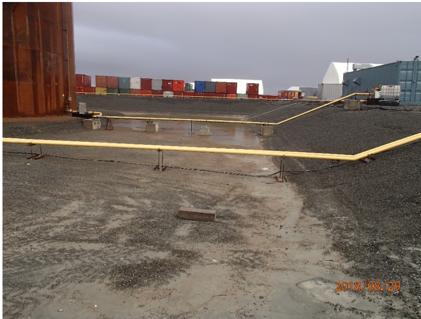
Photograph G2-5 Meadowbank Tank Farm