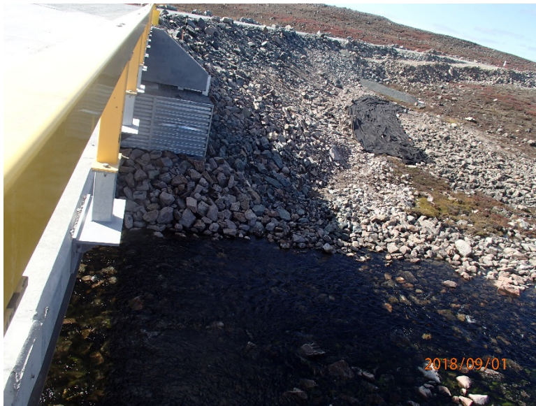
Photograph E2-26 Bridges 7 – km 32+300

Description: Looking at the north abutment from upstream.