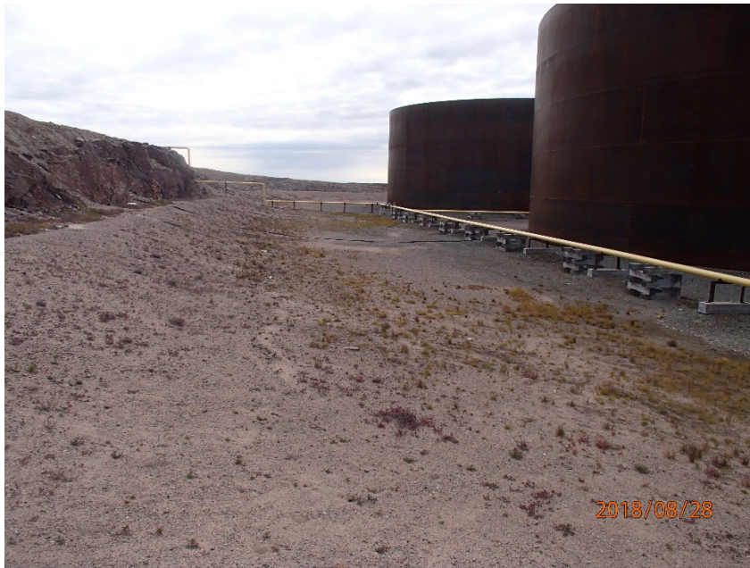
Photograph G1-15 Baker Lake Tank Farm