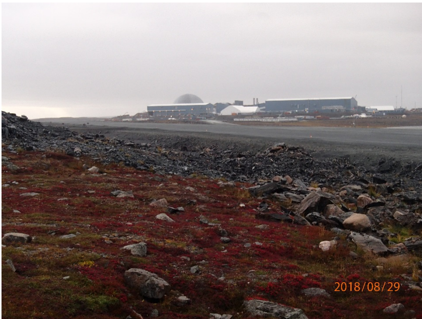
Photograph H8-2 Airstrip

Description: Looking west at the extremity of the airstrip located within Third Portage Lake.