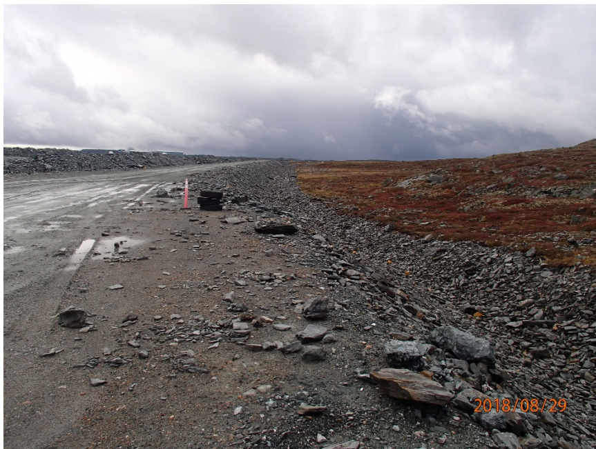
Photograph H2-14 Diversion Ditch and its Sediment and Erosion Protection Structure

Description: From 637281E/7216790N, looking north. View of the western diversion ditch.