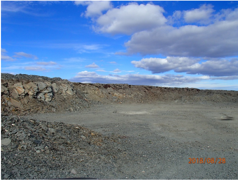
Photograph F1-15: Quarry 10 – km 48+900