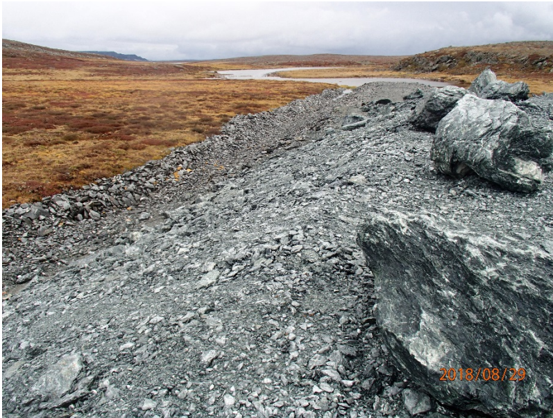
Photograph H2-9 Diversion Ditch and its Sediment and Erosion Protection Structure