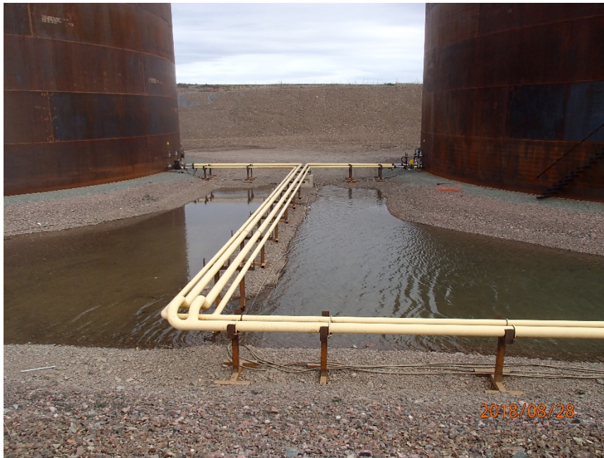
Photograph G1-17 Baker Lake Tank Farm