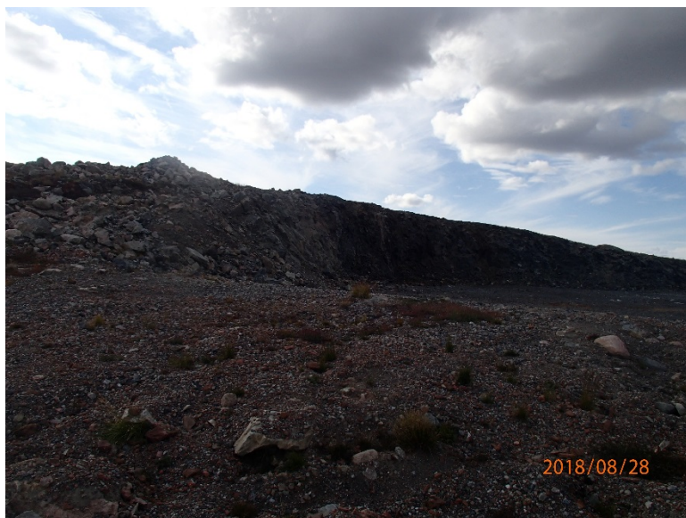
Photograph F1-29: Quarry 18 – km 80+200