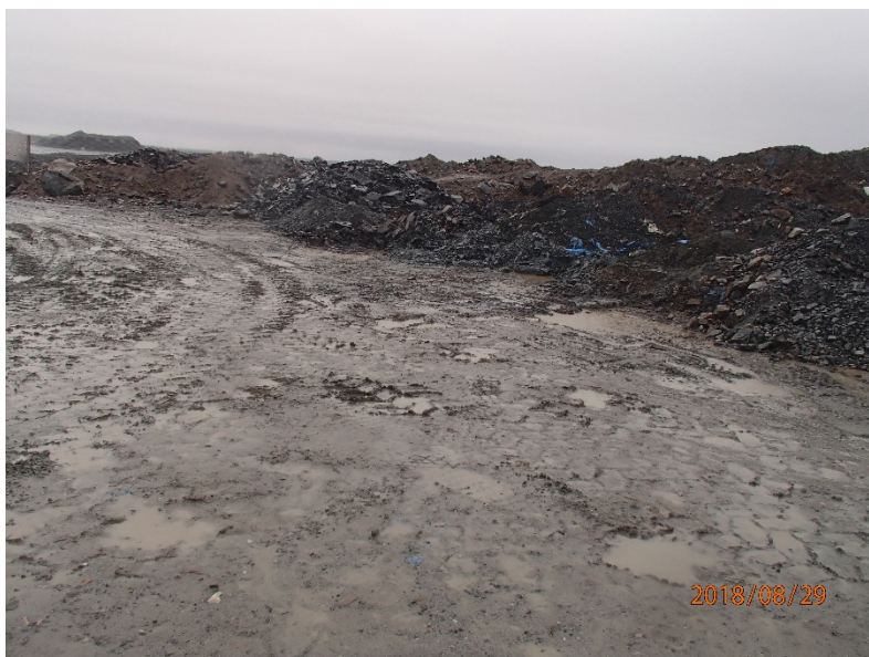
Photograph H6-2 Contaminated Soil Storage and Bioremedial Landfarm Facility

Description: From the northeast extremity of the South Cell, looking northwest at the Contaminated Soil Storage and Bioremedial Landfarm Facility located within the South Cell of the TSF, north of Central Dike.