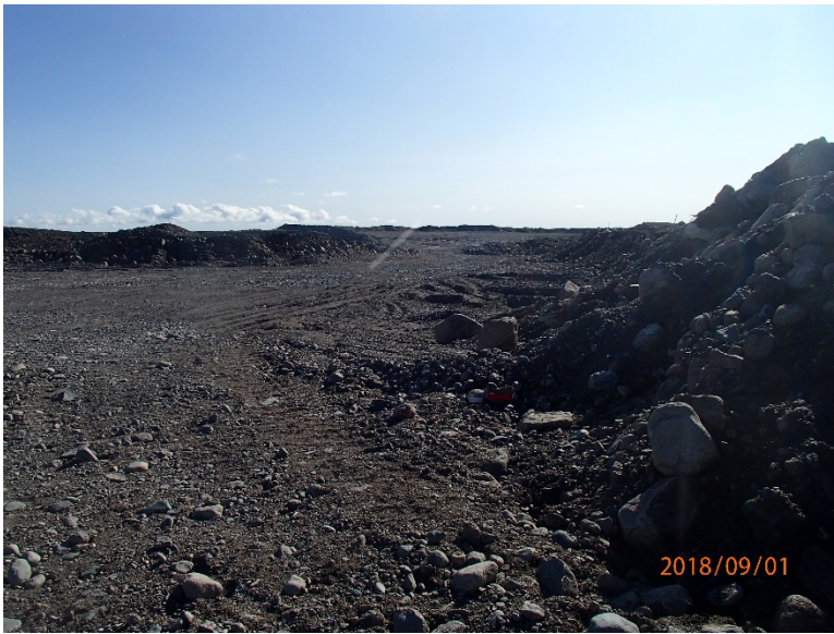
Photograph F2-9 Eskers and Quarries 6 – km 62+500