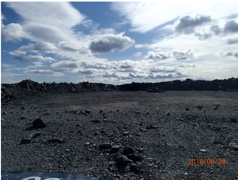
Photograph F1-10: Quarry 6 – km 36+470

Description: View of south and west walls.