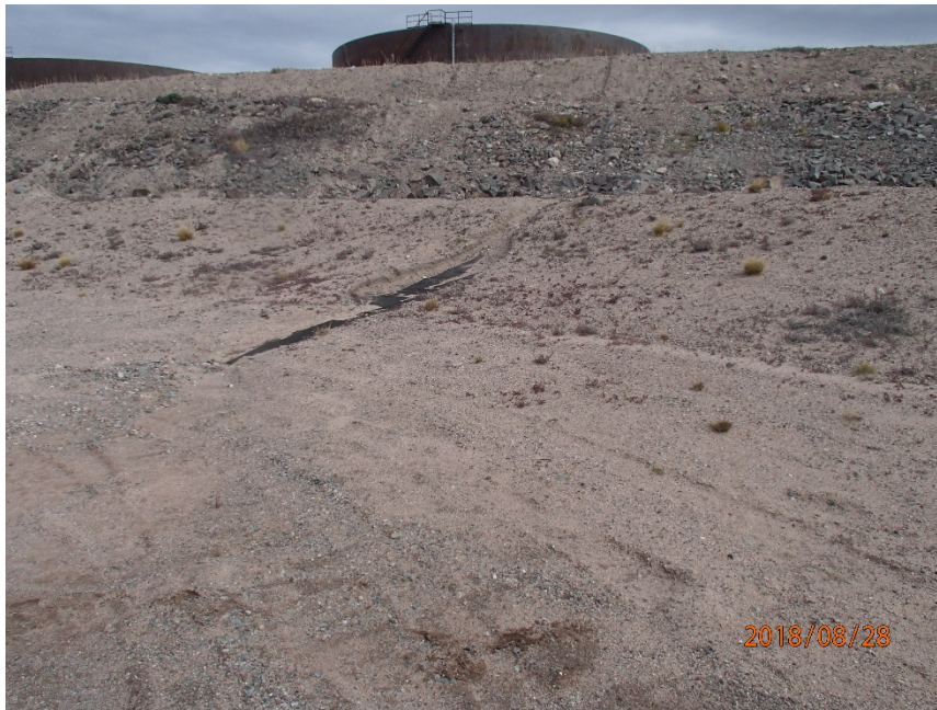
Photograph G1-13 Baker Lake Tank Farm