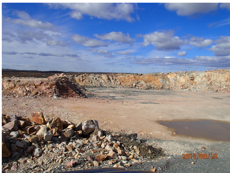
Photograph F1-8: Quarry 5 – km 34+650

Description: View of north and east walls.