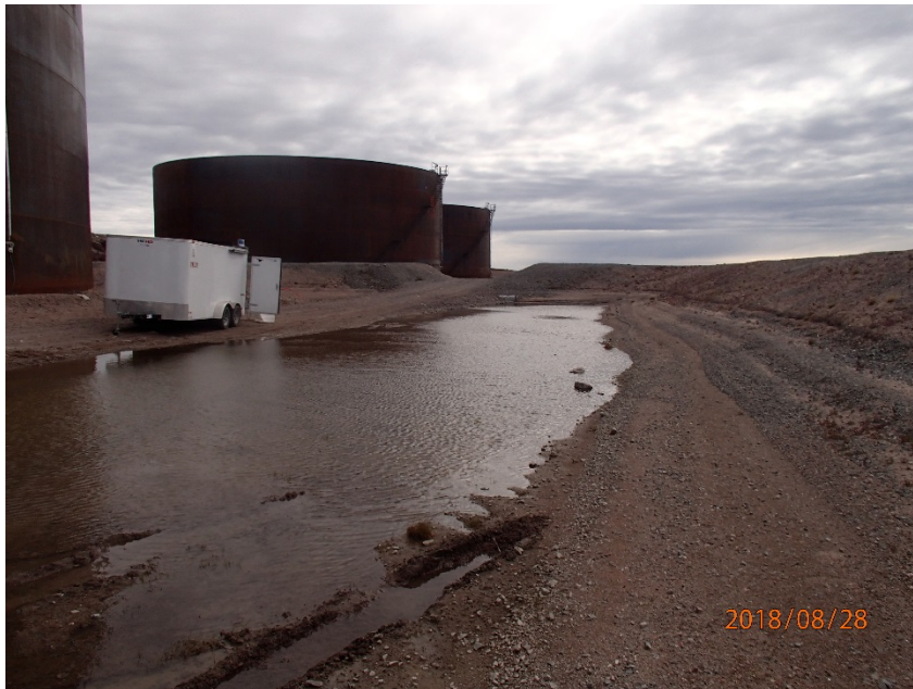
Photograph G1-5 Baker Lake Tank Farm