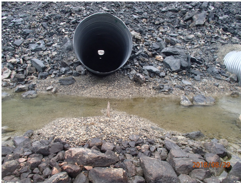
Photograph H1-2 Vault Road Culverts

Description: Looking at the outlet of the three culverts located on Vault Road at 640964E/7217466N. All of them are deformed in the middle.