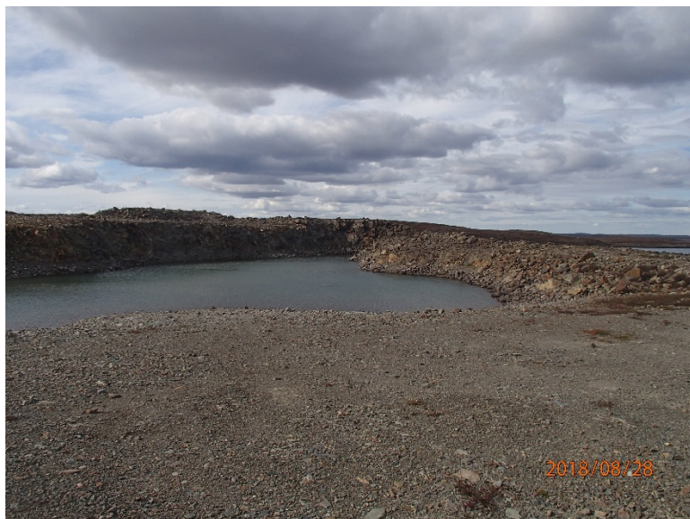
Photograph F1-24: Quarry 14 – km 65+700

Description: View of west and south walls. Quarry flooded.