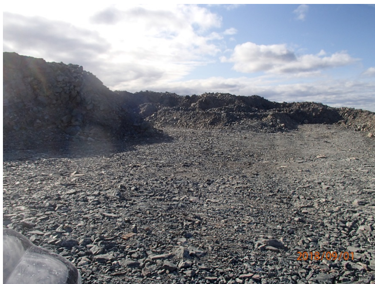
Photograph F2-1 Eskers and Quarries 1 – km 10+500