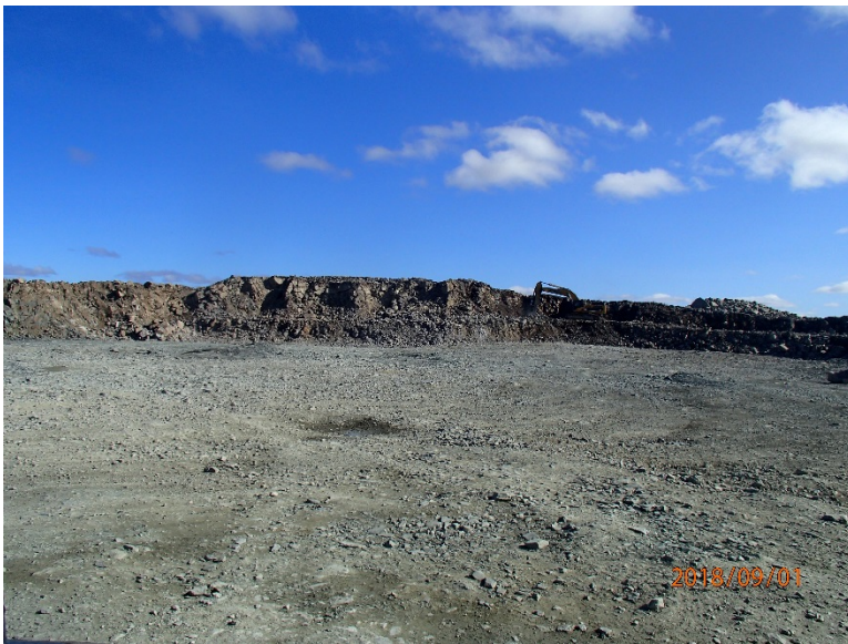
Photograph F2-4 Eskers and Quarries 3 – km 30+180

Description: View of esker #2. General good condition but some steep walls and loose rocks.