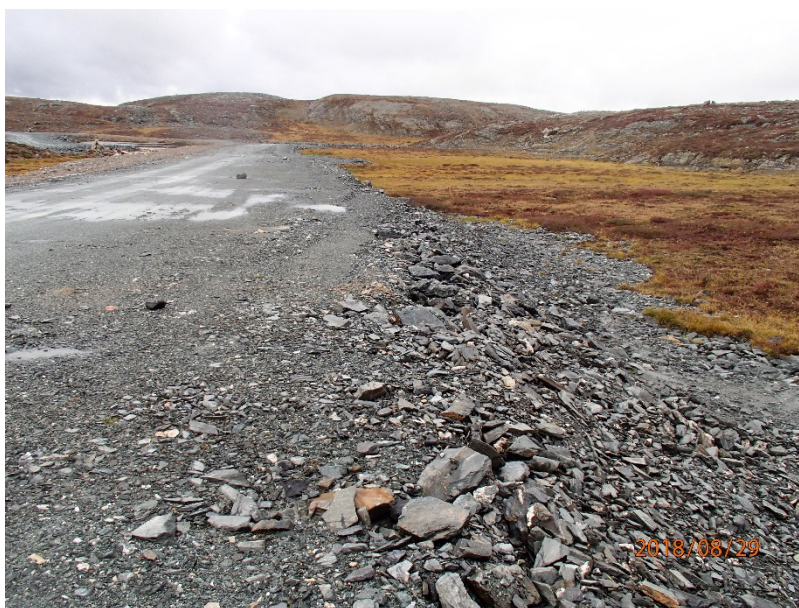
Photograph H2-12 Diversion Ditch and its Sediment and Erosion Protection Structure

Description: From the northern diversion ditch looking east.