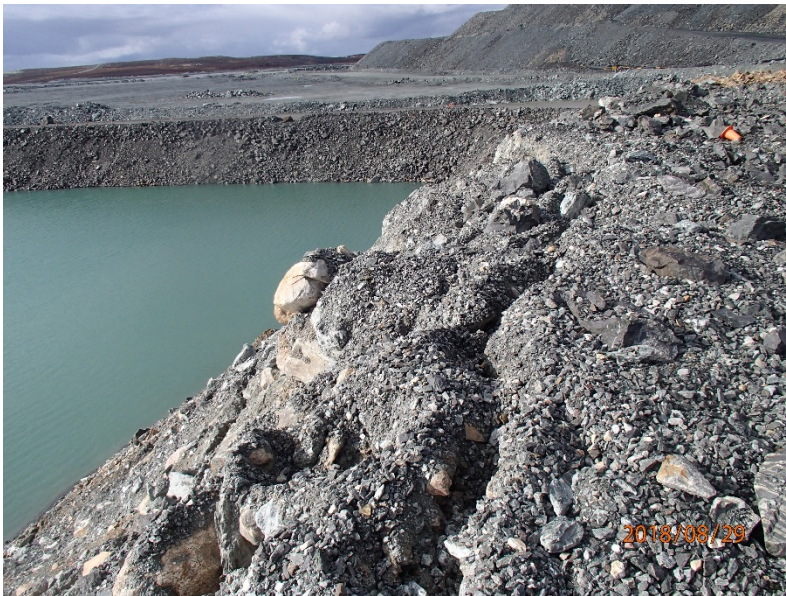
Photograph H6-5 Contaminated Soil Storage and Bioremedial Landfarm Facility