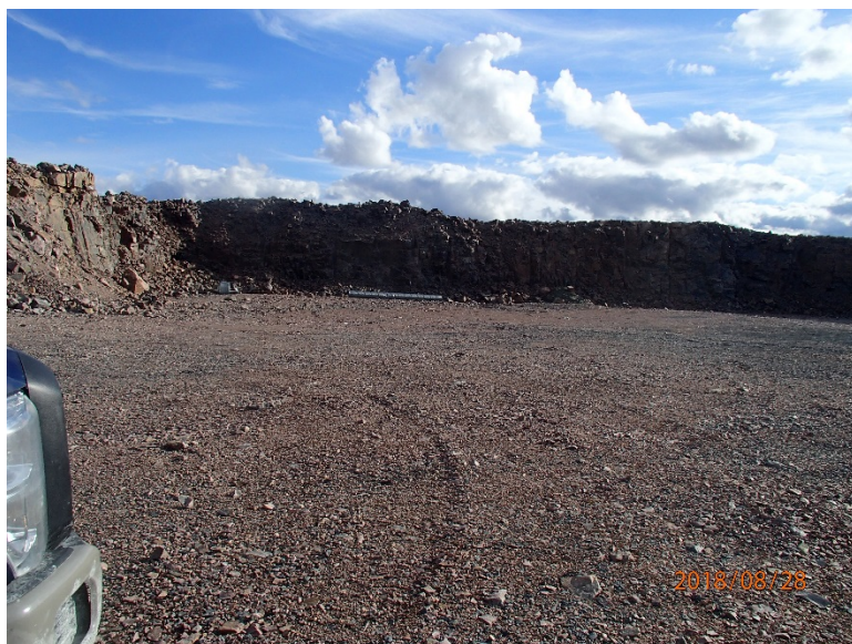
Photograph F1-33: Quarry 21 – km 93+400