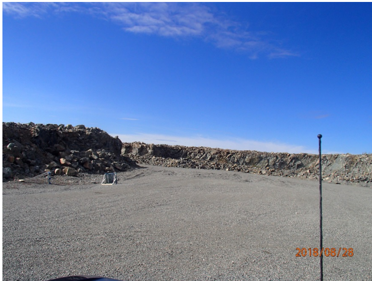
Photograph F1-3: Quarry 2 – km 13+250