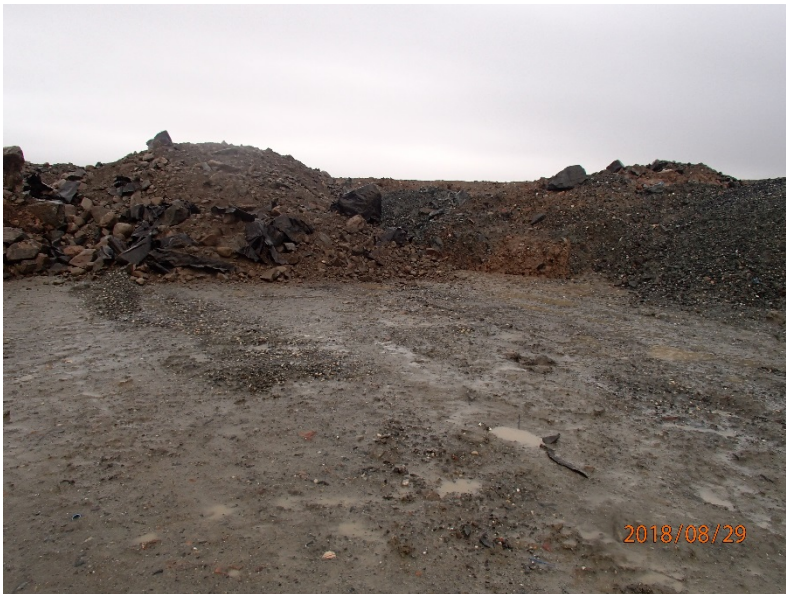
Photograph H6-3 Contaminated Soil Storage and Bioremedial Landfarm Facility