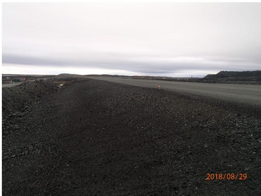
Photograph H8-4 Airstrip

Description: From the northeast side of the airstrip looking northwest.