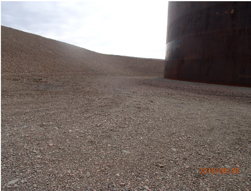
Photograph G1-19 Baker Lake Tank Farm