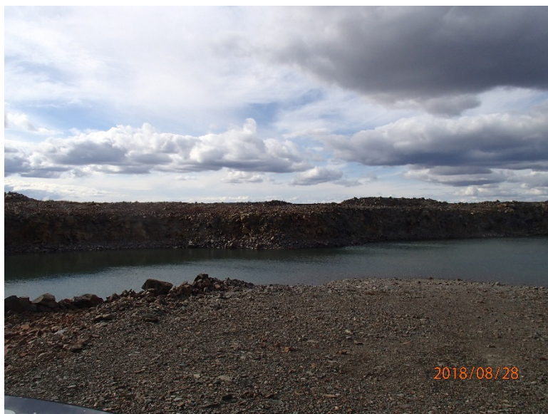
Photograph F1-23: Quarry 14 – km 65+700