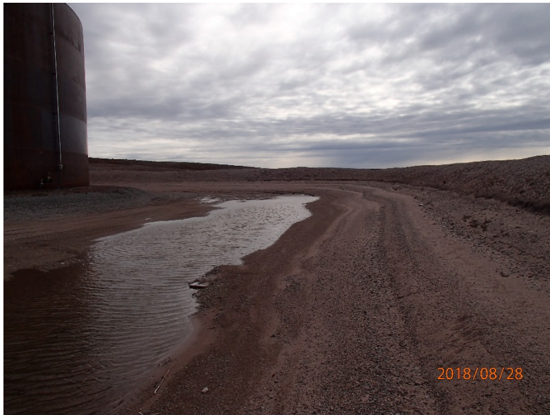
Photograph G1-11 Baker Lake Tank Farm