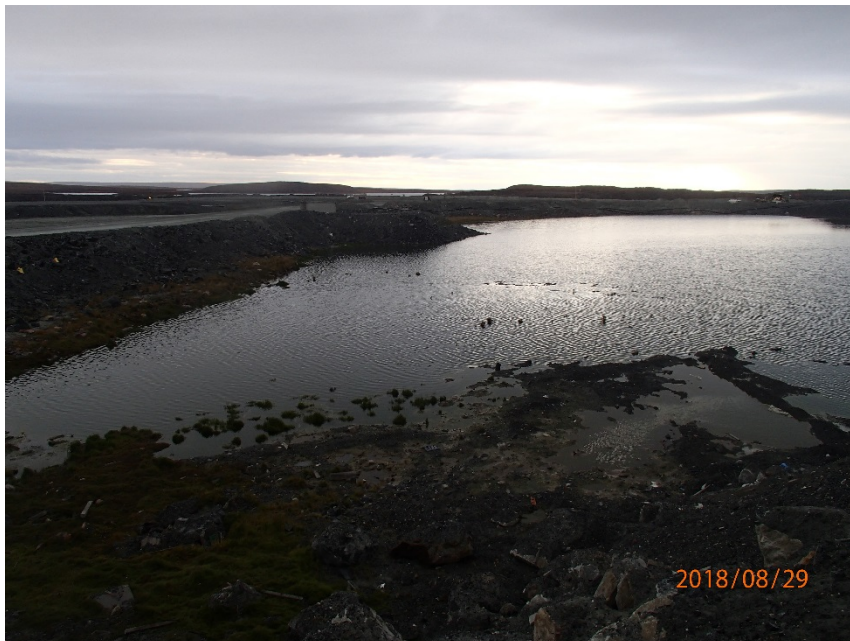
Photograph H7-2 Stormwater Pond

Description: From the northwestern side of the pond, looking southeast at Stormwater Pond.