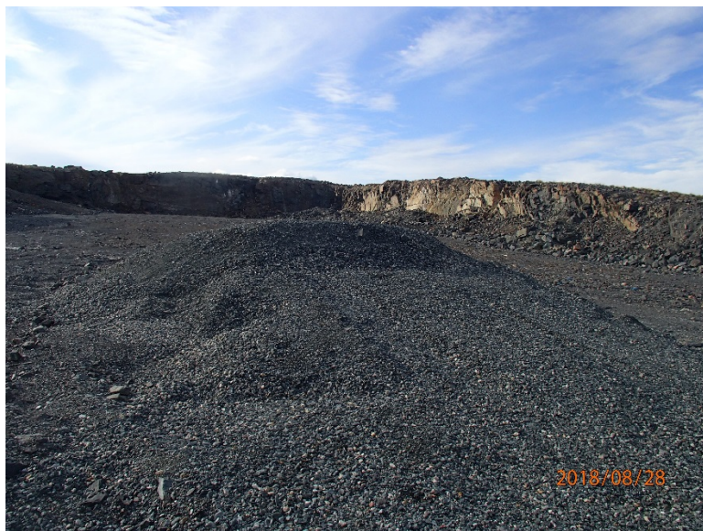
Photograph F1-36: Quarry 22 – km 99+200

Description: View of the south and west walls.