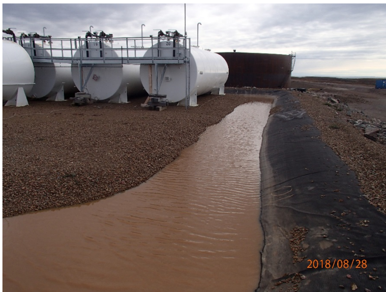
Photograph G1-24 Baker Lake Tank Farm

Description: From the northeastern corner of the Jet A fuel tanks looking west. Presence of exposed geomembrane.