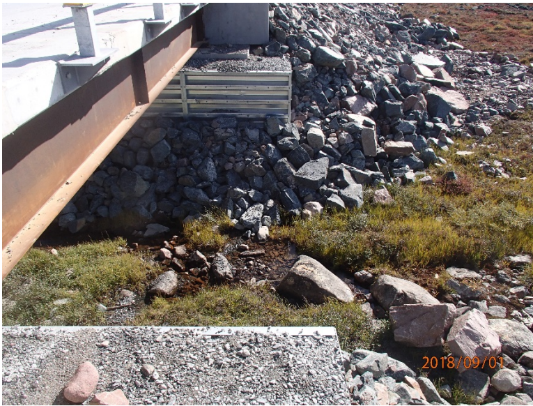
Photograph E2-29 Bridges 8 – km 43+500