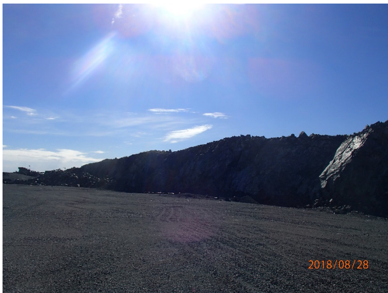
Photograph F1-6: Quarry 3 – km 23+700