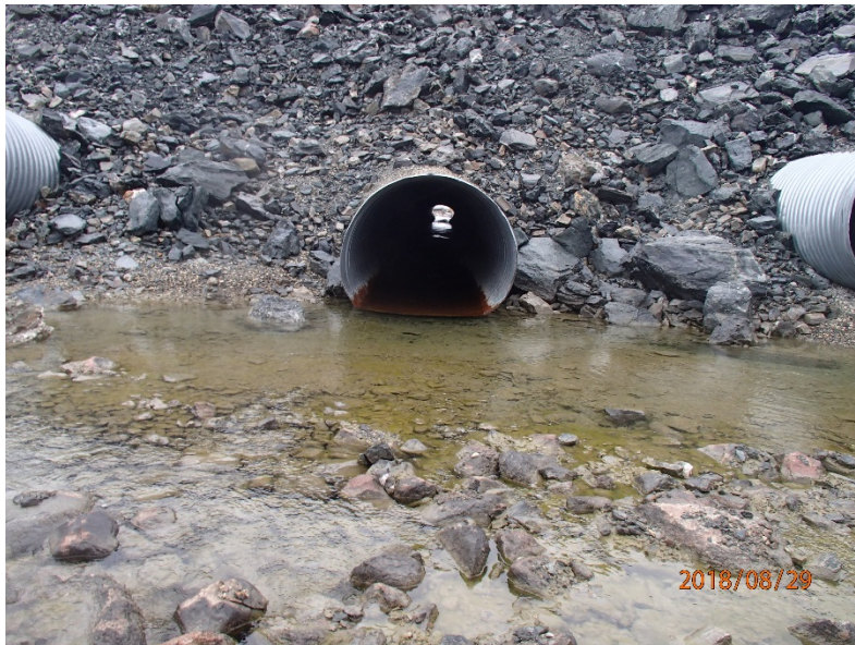
Photograph H1-3 Vault Road Culverts