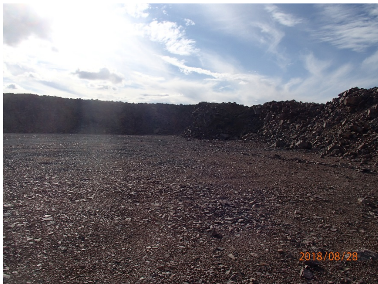
Photograph F1-34: Quarry 21 – km 93+400

Description: Looking at the south and east walls.