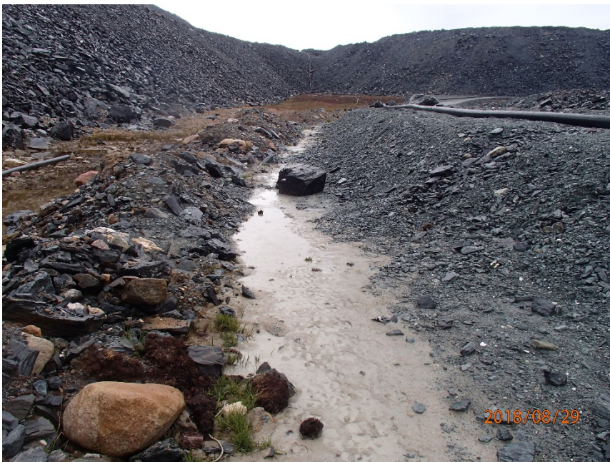
Photograph H3-4 RSF Till Plug

Description: From the south side of NP2 Lake (south of the diversion ditch) looking southeast at the RSF till plug.