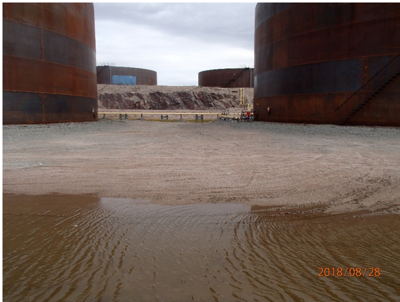
Photograph G1-10 Baker Lake Tank Farm

Description: From the southeastern corner of Tank 3, looking northwest at the south side of Tank 3, 2 and 1. View of exposed LLDPE.