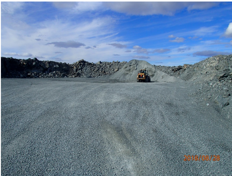
Photograph F1-14: Quarry 9 – km 44+600

Description: View of west and south walls. Presence of loose blocks at the base of the wall.