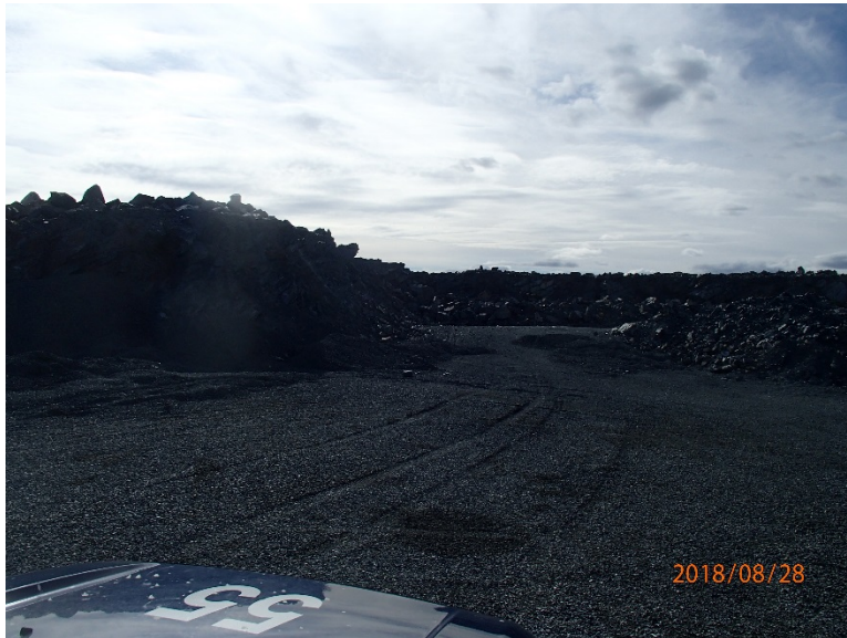
Photograph F1-11: Quarry 8 – km 42+950