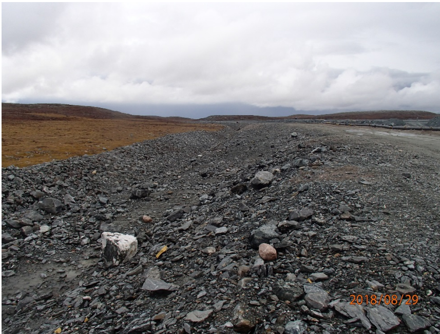
Photograph H2-15 Diversion Ditch and its Sediment and Erosion Protection Structure