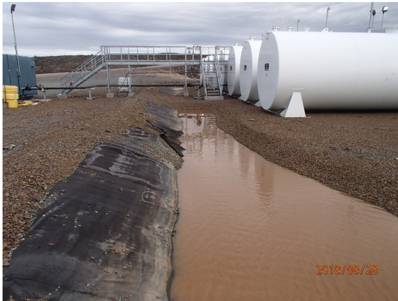
Photograph G1-25 Baker Lake Tank Farm