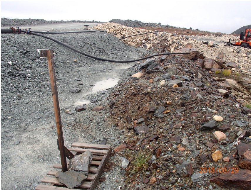
Photograph H3-3 RSF Till Plug