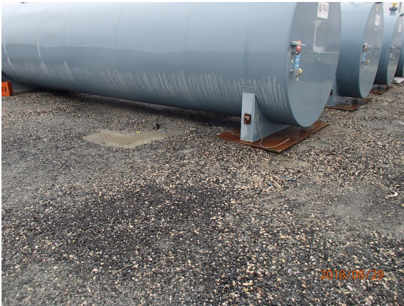
Photograph G3-3 Vault Tank Farm