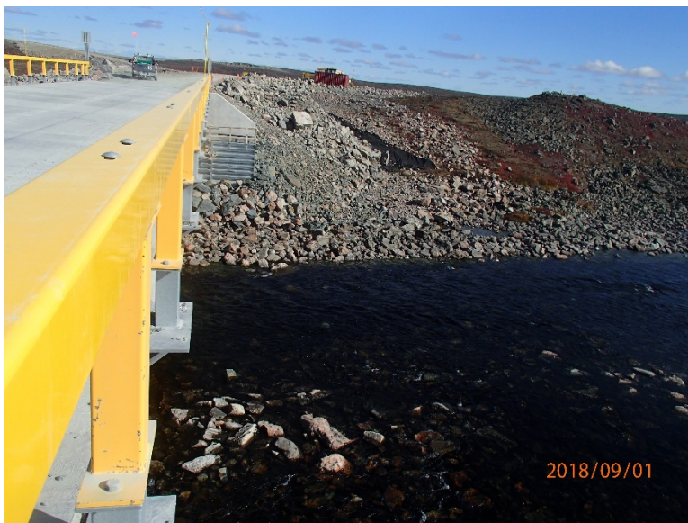
Photograph E2-28 Bridges 7 – km 32+300

Description: Looking at the south abutment from upstream.