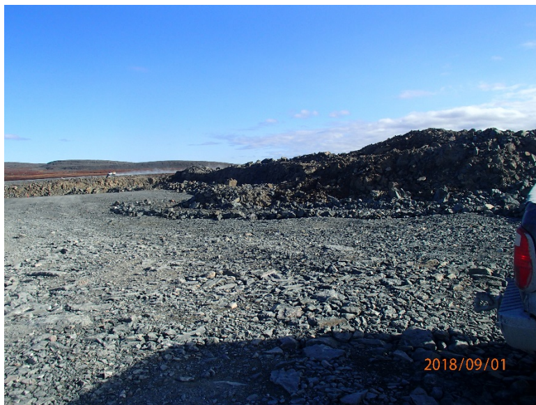
Photograph F2-2 Eskers and Quarries 1 – km 10+500

Description: View of Quarry 10.5. Loose rock is present on the steep wall.