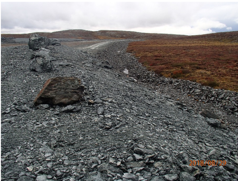
Photograph H2-10 Diversion Ditch and its Sediment and Erosion Protection Structure

From the northern diversion ditch looking east.