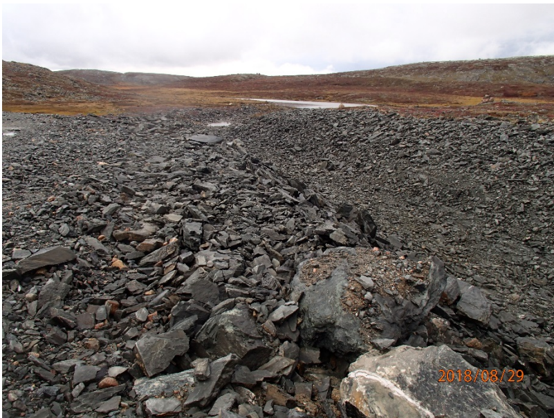
Photograph H2-8 Diversion Ditch and its Sediment and Erosion Protection Structure

Description: From the northern diversion ditch looking southeast.