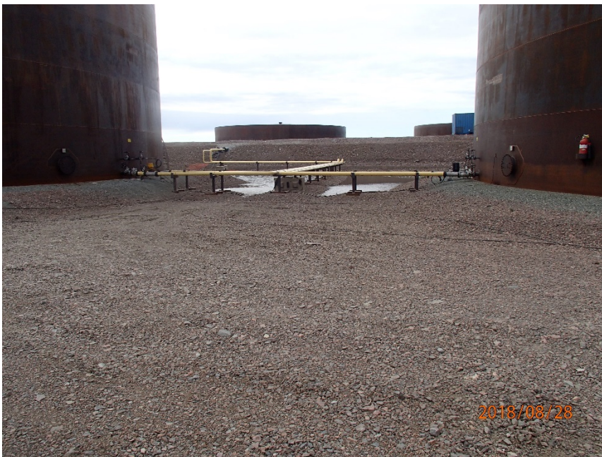
Photograph G1-20 Baker Lake Tank Farm

Description: Looking southeast at the northeastern side of Tank 6. Presence of water ponding.