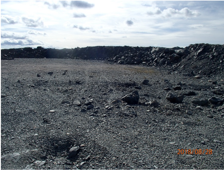
Photograph F1-9: Quarry 6 – km 36+470