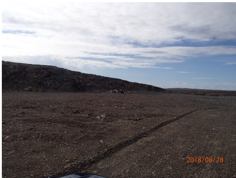
Photograph F1-2: Quarry 1 – km 5+200

Description: View of south and east walls.