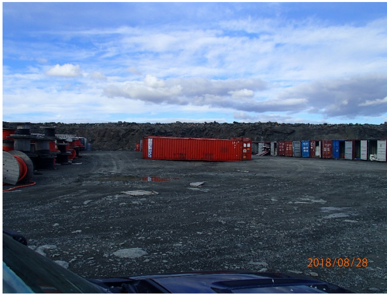
Photograph F1-39: Quarry 23 (Airstrip Quarry)