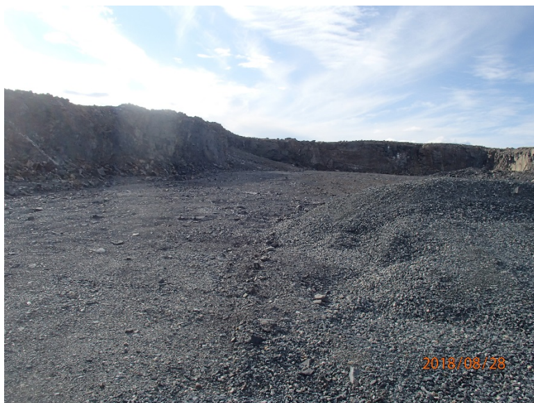
Photograph F1-35: Quarry 22 – km 99+200