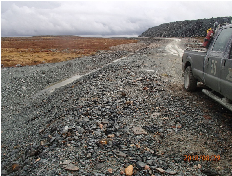
Photograph H2-7 Diversion Ditch and its Sediment and Erosion Protection Structure