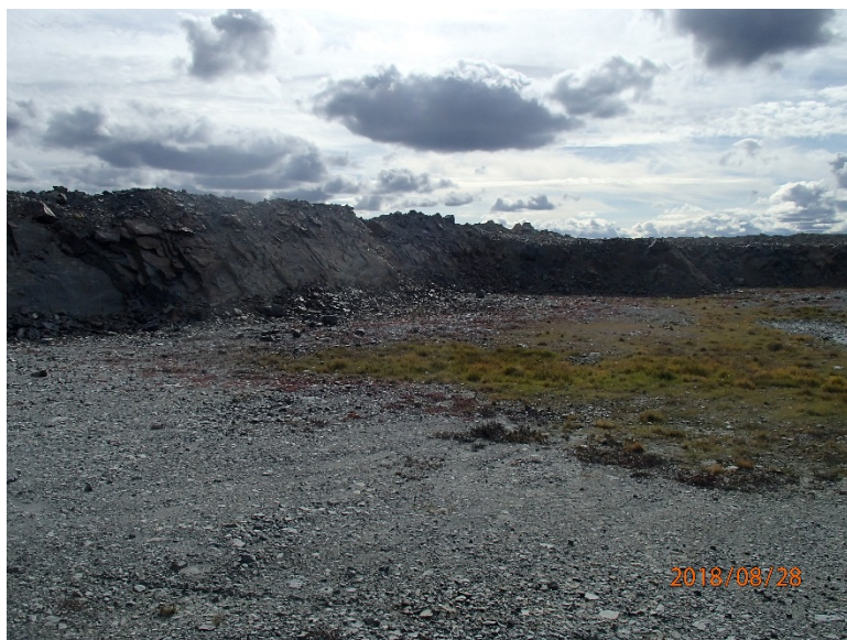
Photograph F1-25: Quarry 15 – km 67+600