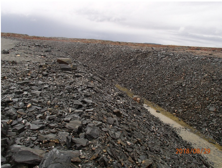
Photograph H2-4 Diversion Ditch and its Sediment and Erosion Protection Structure

Description: From the eastern diversion ditch looking south toward Lake NP2.