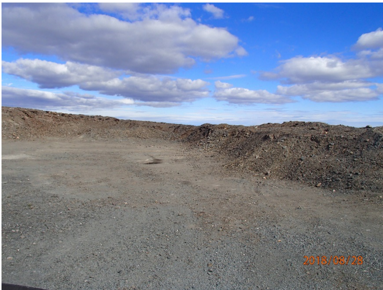
Photograph F1-16: Quarry 10 – km 48+900

Description: View of the west wall. Presence of unstable blocks.