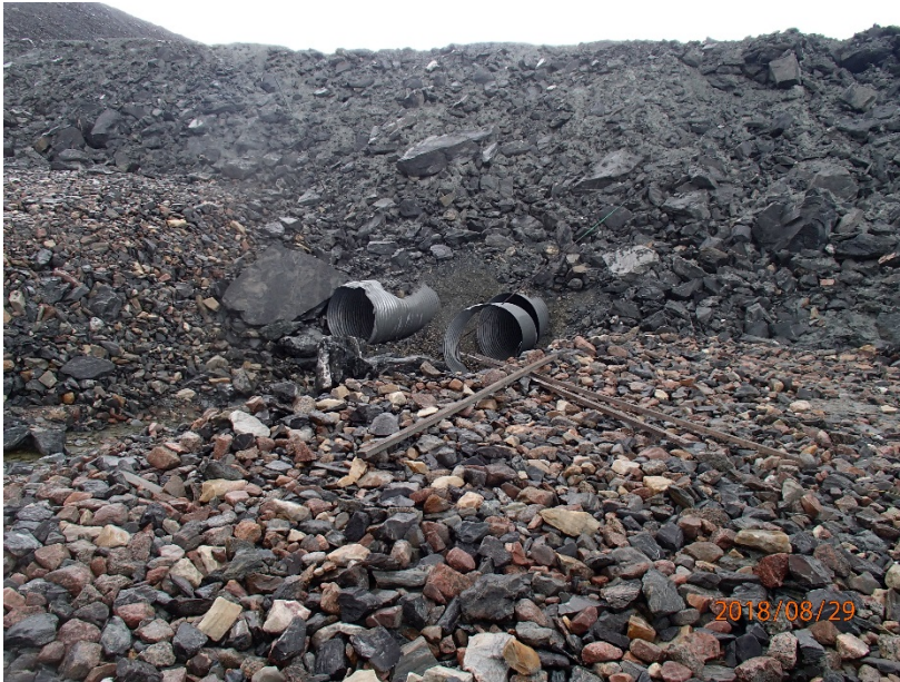
Photograph H1-5 Vault Road Culverts