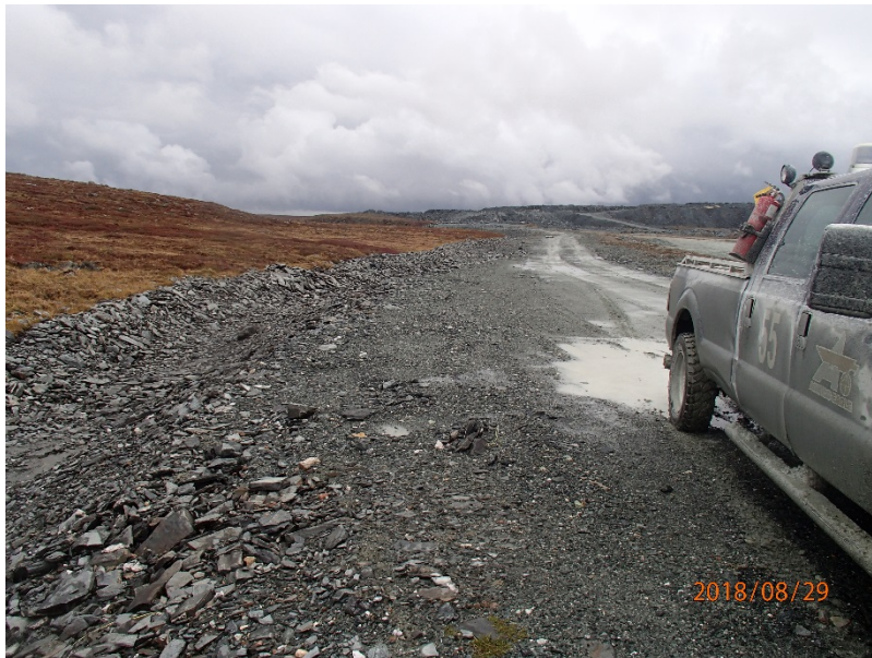
Photograph H2-11 Diversion Ditch and its Sediment and Erosion Protection Structure