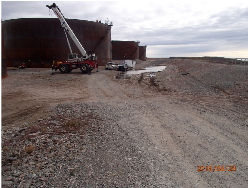
Photograph G1-1 Baker Lake Tank Farm