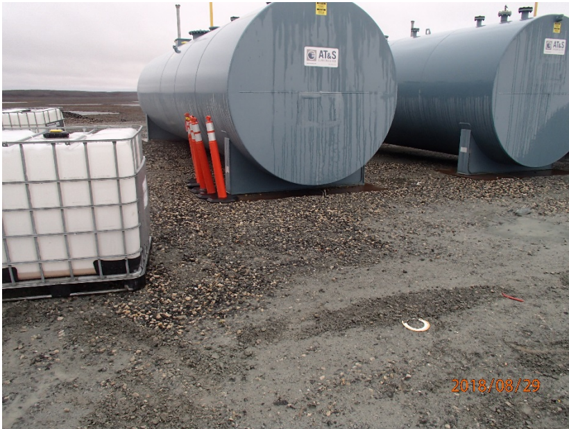
Photograph G3-4 Vault Tank Farm

Description: From the southwest corner of the Tanks Looking northeast toward the Vault Tank Farm.