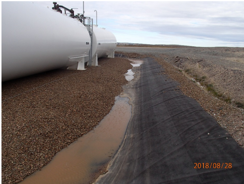
Photograph G1-23 Baker Lake Tank Farm