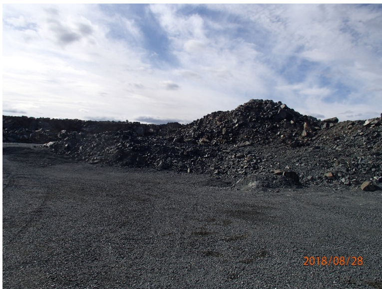
Photograph F1-12: Quarry 8 – km 42+950

Description: View of south wall. Presence of loose blocks.