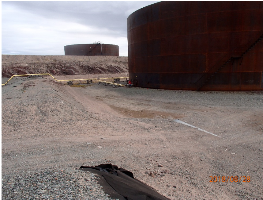
Photograph G1-7 Baker Lake Tank Farm