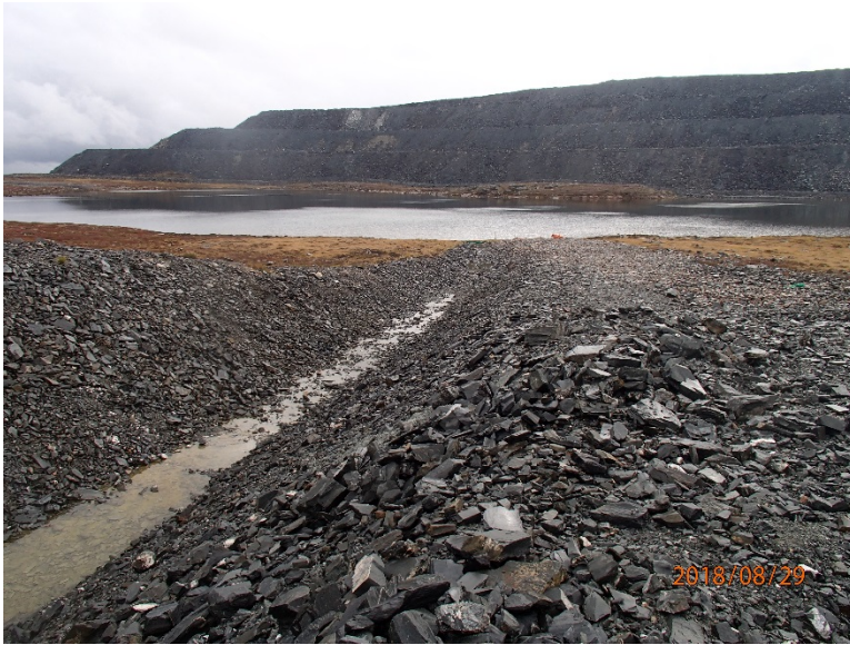
Photograph H2-3 Diversion Ditch and its Sediment and Erosion Protection Structure