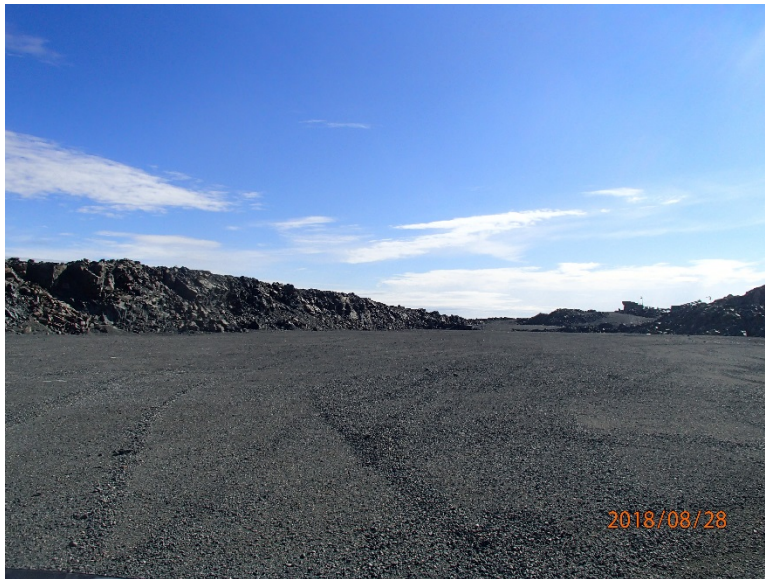
Photograph F1-5: Quarry 3 – km 23+700