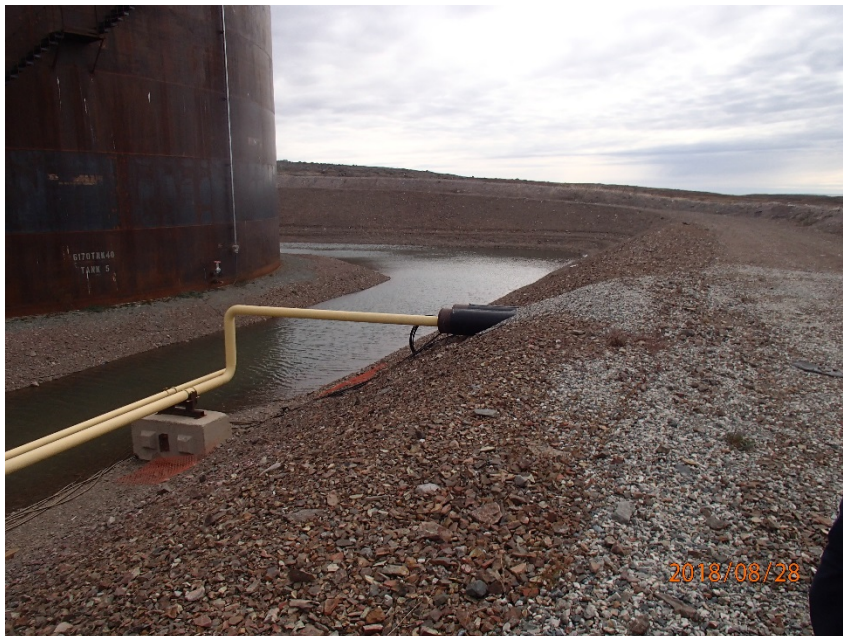
Photograph G1-18 Baker Lake Tank Farm

Description: Looking north between Tanks 5 and 6. Presence of water ponding.