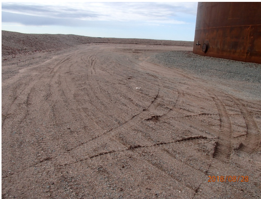
Photograph G1-12 Baker Lake Tank Farm

Description: From the south portion of the site looking southeast.