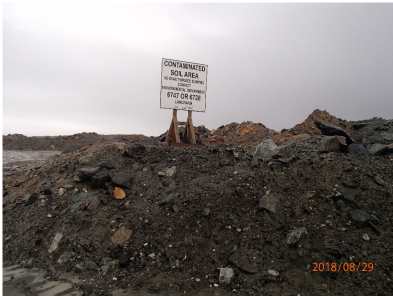
Photograph H6-1 Contaminated Soil Storage and Bioremedial Landfarm Facility