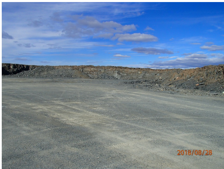
Photograph F1-18: Quarry 11 – km 53+500

Description: Overview of Quarry 11 looking at the west and north walls.