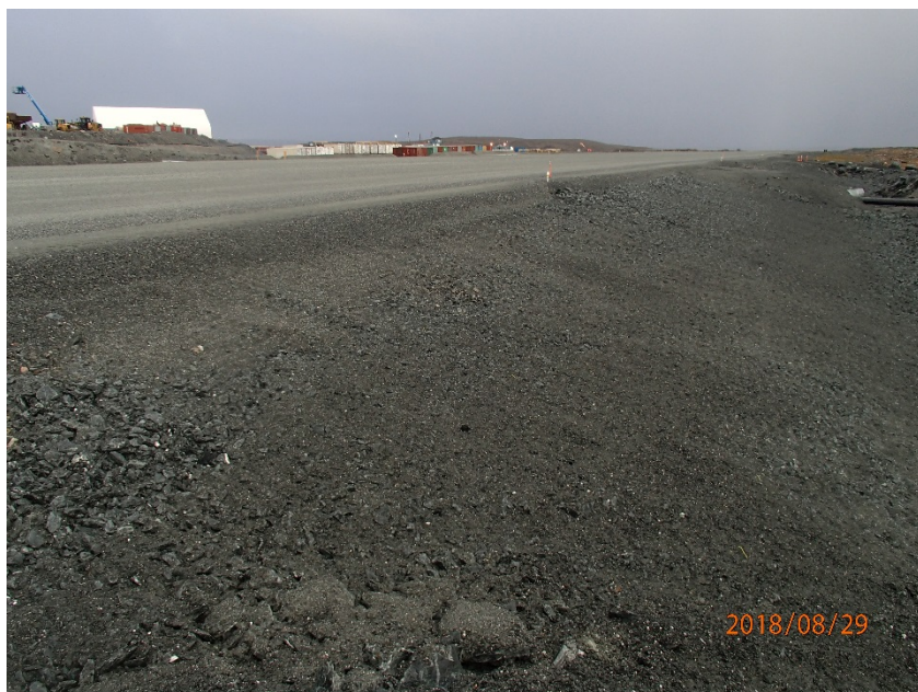
Photograph H8-3 Airstrip