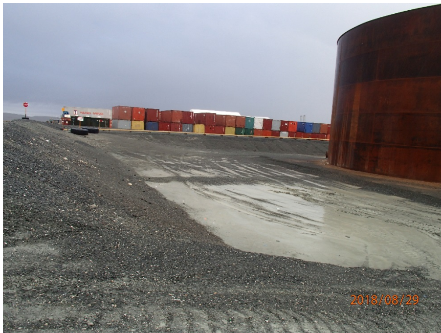
Photograph G2-2 Meadowbank Tank Farm

Description: From the western corner, looking east at the tank.