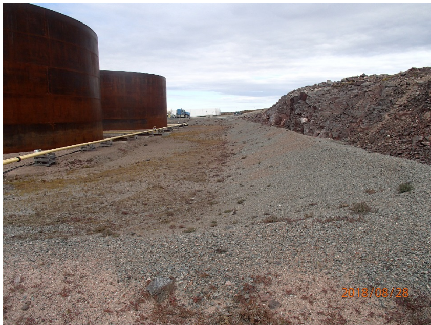
Photograph G1-14 Baker Lake Tank Farm

Description: From the northern side of Tank 4, looking northeast toward Tanks 4, 3, 2, and 1. Presence of exposed liner.