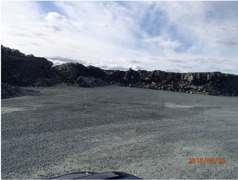
Photograph F1-13: Quarry 9 – km 44+600