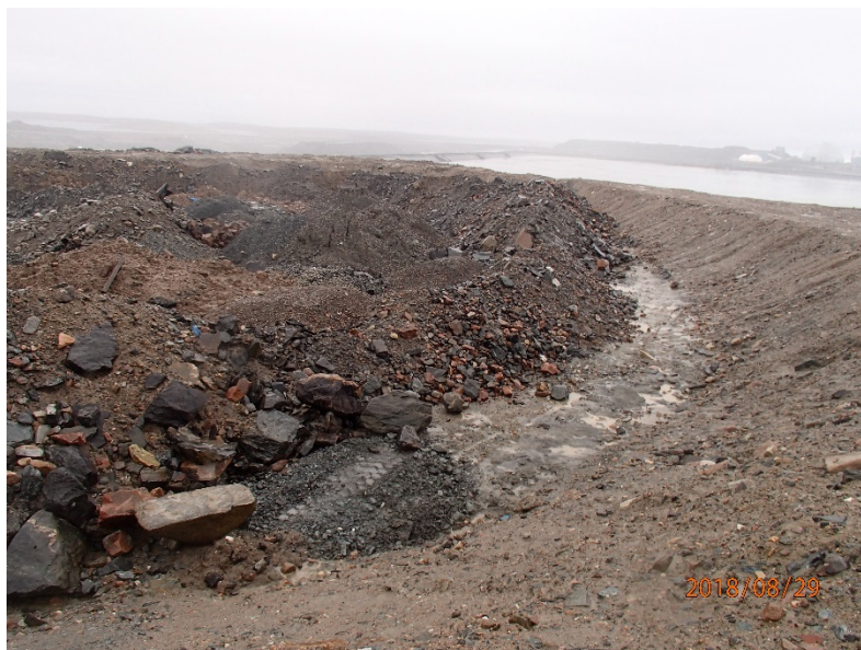
Photograph H6-4 Contaminated Soil Storage and Bioremedial Landfarm Facility

Description: From the northeast extremity of the South Cell, looking northwest at the Contaminated Soil Storage and Bioremedial Landfarm Facility.