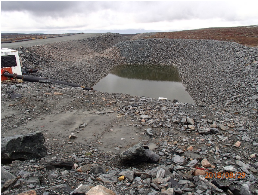
Photograph H2-16 Diversion Ditch and its Sediment and Erosion Protection Structure

Description: From 637251E/7216171N, looking north at the western diversion ditch.