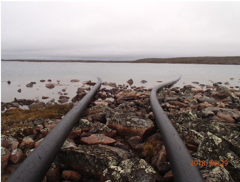
Photograph H4-1 Diffusers – Vault Diffuser