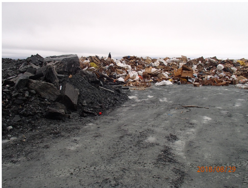
Photograph H5-2 Landfill

Description: From 638857E/7215767N, looking north at the landfill.