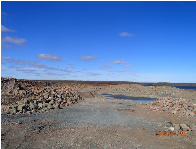
Photograph F2-3 Eskers and Quarries 2 – km 25+000