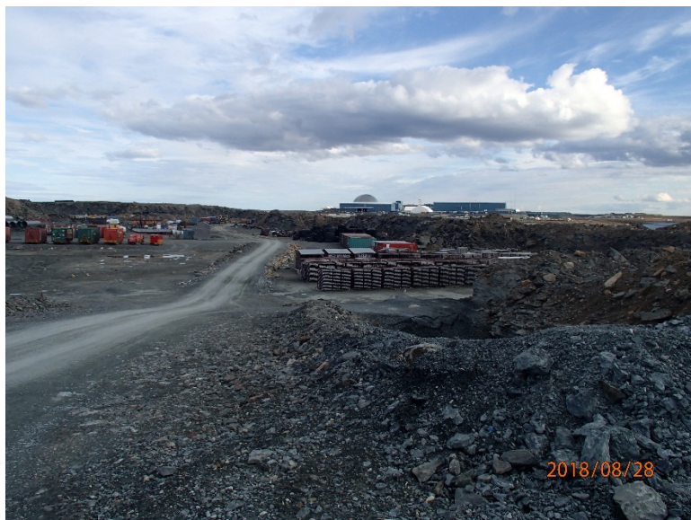
Photograph F1-38: Quarry 23 (Airstrip Quarry)