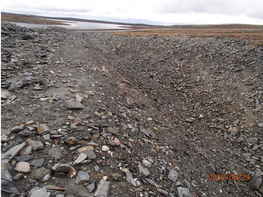
Photograph H2-18 Diversion Ditch and its Sediment and Erosion Protection Structure

Description: From 637074E/7216157N, looking east at the western diversion ditch.