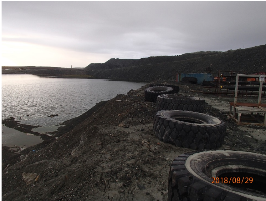
Photograph H7-1 Stormwater Pond