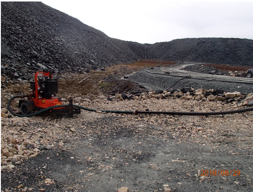
Photograph H3-2 RSF Till Plug

Description: From the south side of NP2 Lake (north of the diversion ditch) looking west at the RSF till plug.