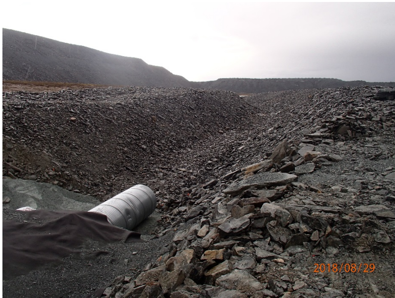
Photograph H2-2 Diversion Ditch and its Sediment and Erosion Protection Structure

Description: Looking south toward Lake NP1 at the sediment and erosion protection structure. Presence of 2 silt curtains and 3 wooden barrier.