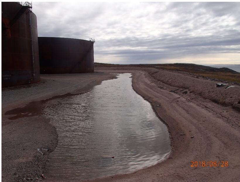
Photograph G1-8 Baker Lake Tank Farm

Description: Looking northeast. The geomembrane between the south side of tank 2 and 3 is damaged.