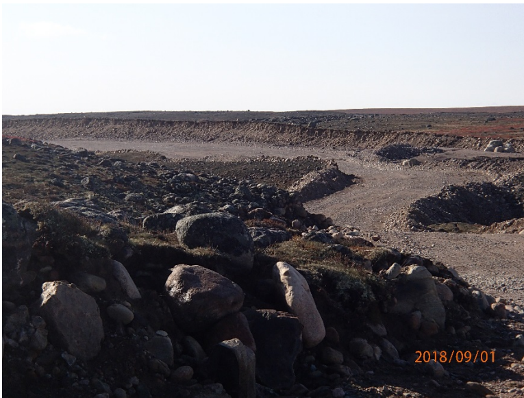
Photograph F2-10 Eskers and Quarries 6 – km 62+500

Description: View of esker #6. The 2-m high steep soil slopes are unstable.