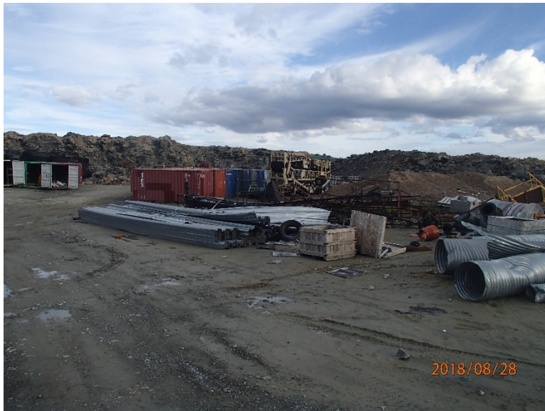
Photograph F1-41: Quarry 23 (Airstrip Quarry)