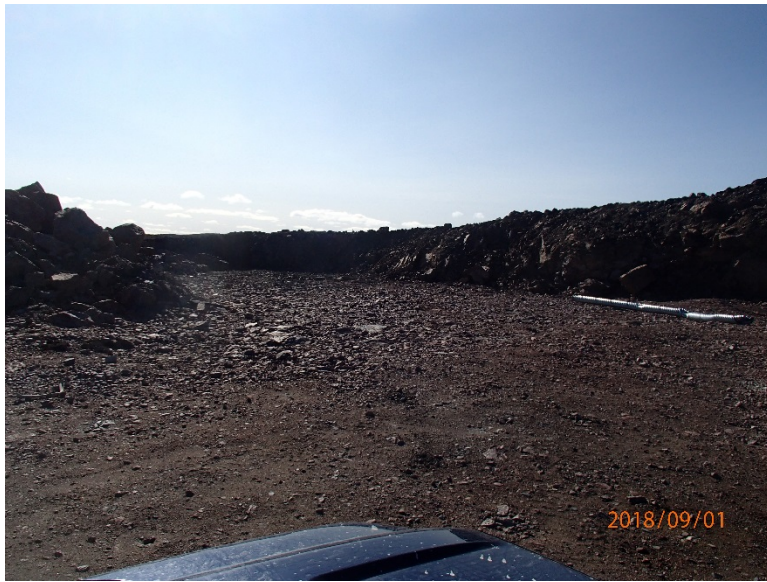
Photograph F2-7 Eskers and Quarries 5 – km 52+000