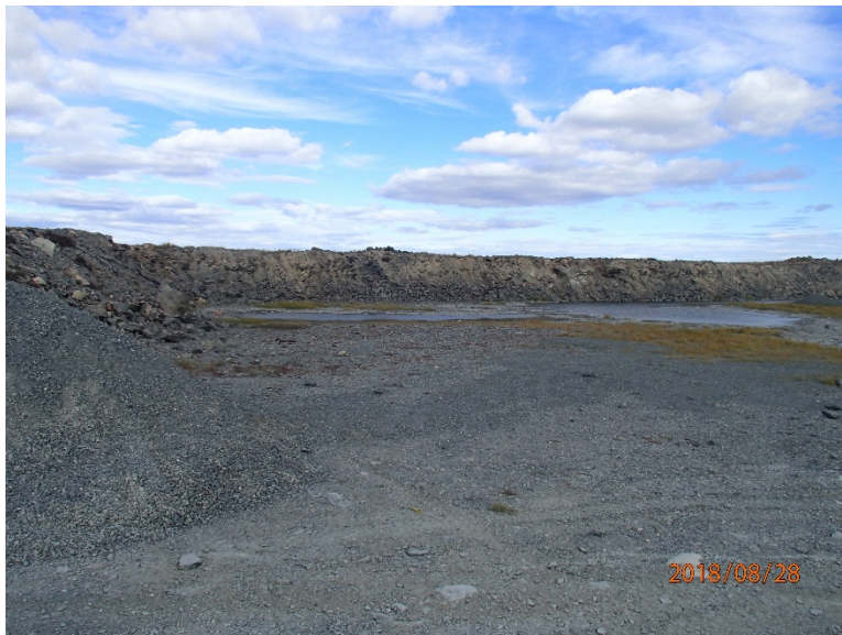
Photograph F1-22: Quarry 13 – km 62+350

Description: View of the west and north walls.