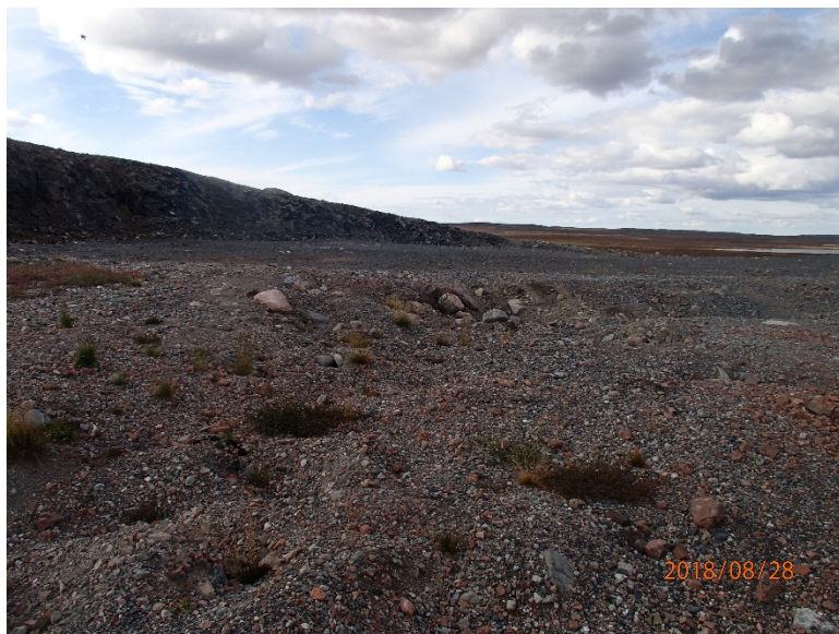
Photograph F1-30: Quarry 18 – km 80+200