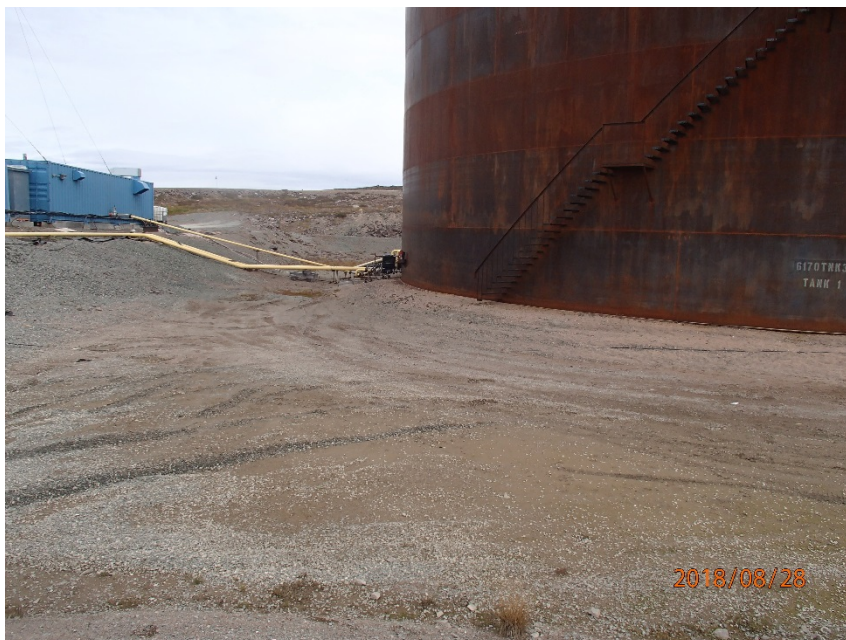
Photograph G1-2 Baker Lake Tank Farm

Description: From the south side of Tank 1, looking southeast at Tanks 1, 2, 3, and 4. Presence of water ponding.