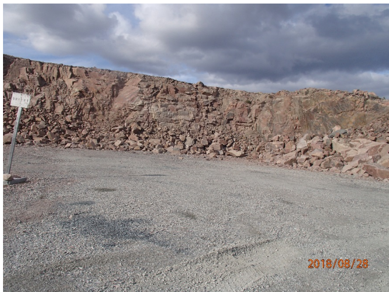
Photograph F1-32: Quarry 19 – km 84+300

Description: Looking at the north and west walls.