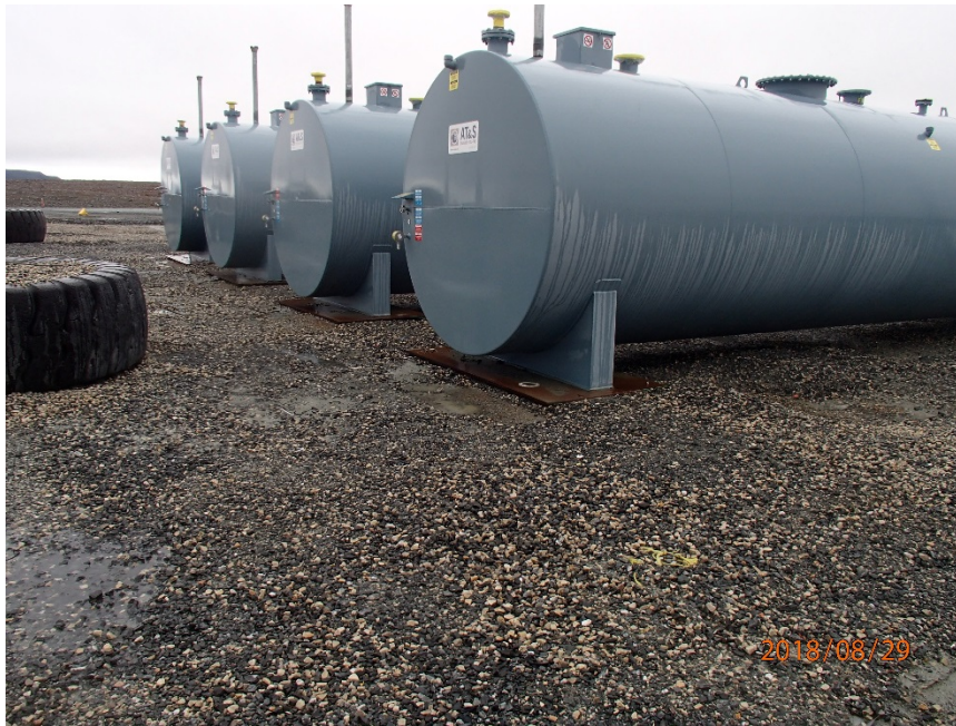
Photograph G3-1 Vault Tank Farm