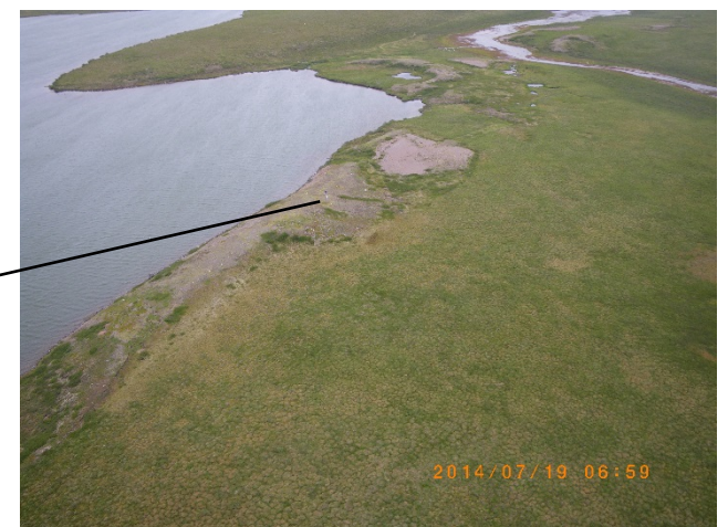
Only a radio tower remains at the old core box storage area southeast of the Airstrip