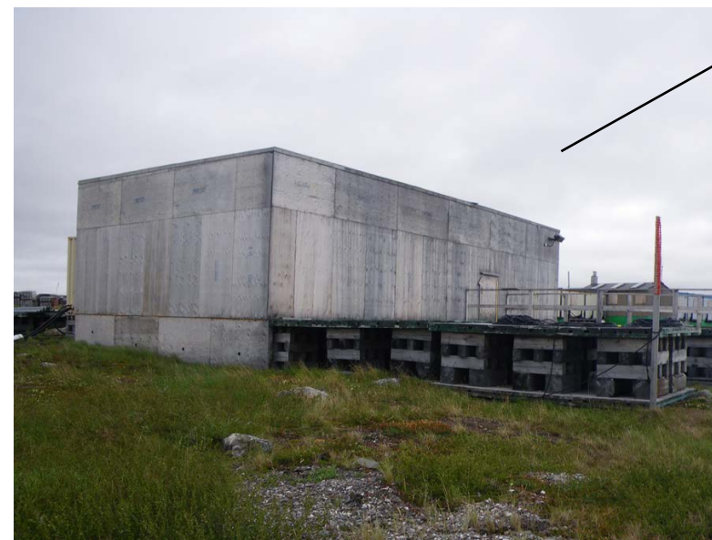
The west side of the New STP with the foundations for an additional four (4) SaniBrane units – looking south