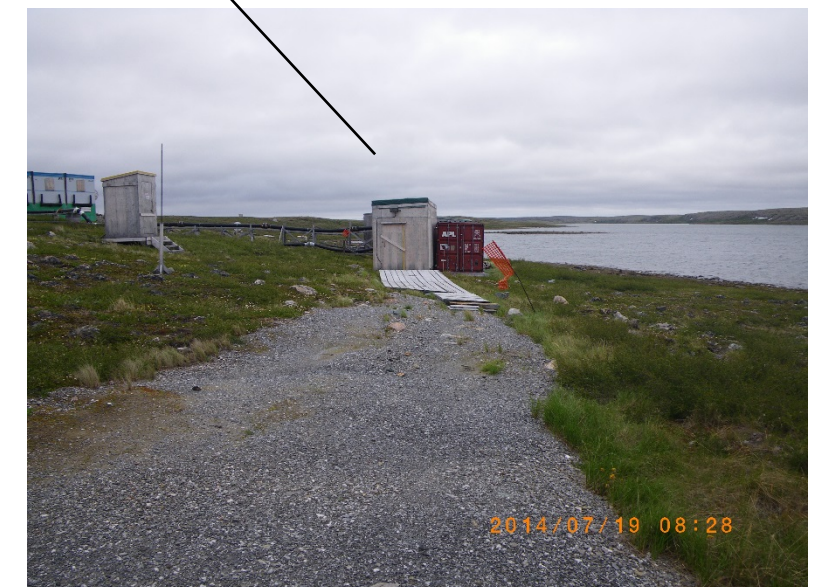
The north end of the Old STP – looking south from the Road to Dock