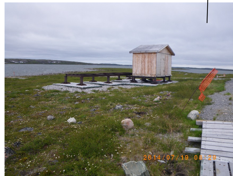
The original location and rockfill foundation for the new STP – looking northwest from the old STP