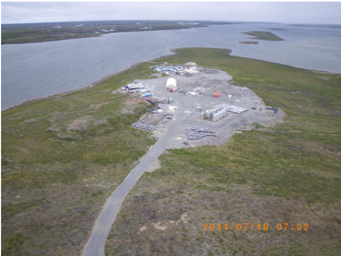
The Road to Airstrip – looking north over Boston Camp