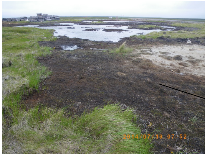
Vegetation die-back along the western edge of the airstrip south of the Drill Road