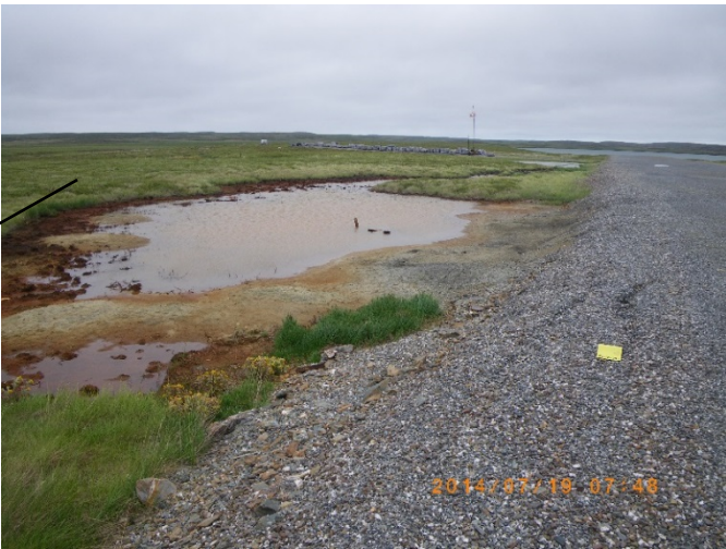
Ponded water along the western edge of the Airstrip from historic drilling