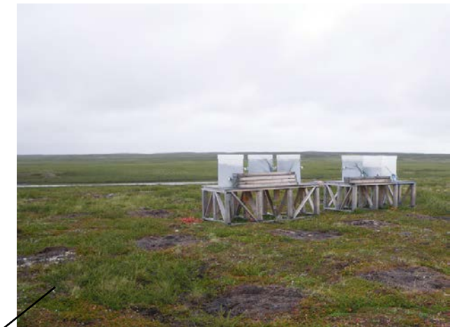
Only the barrel tests remain at the core storage area by the Core Storage Road