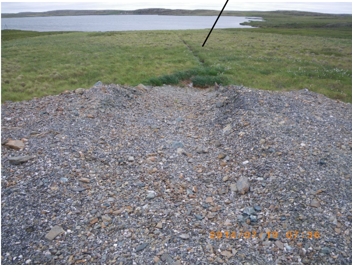
The Boardwalk was removed in 2012 – looking south from the south end of the Airstrip