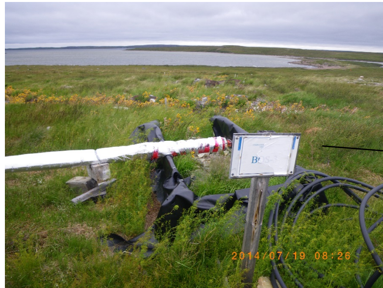
Grey Water Discharge Location – looking northwest