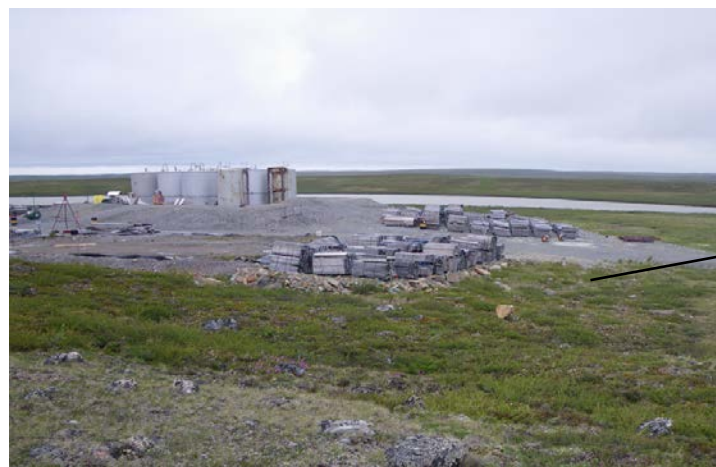
Core boxes stored at the south end of the Camp Complex Foundation Pad