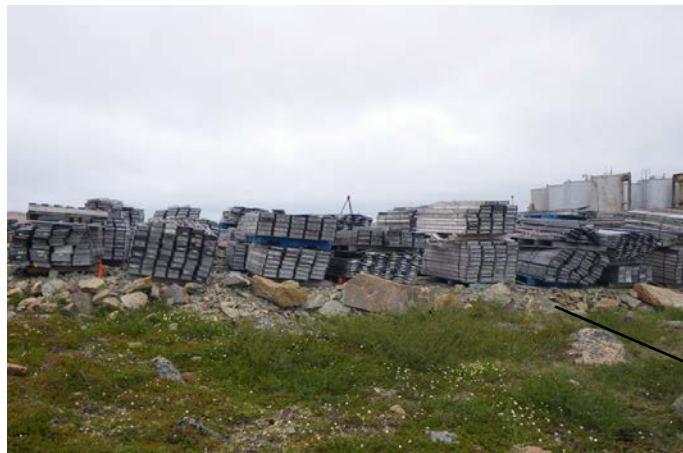
Core boxes north of the Primary Tank Farm