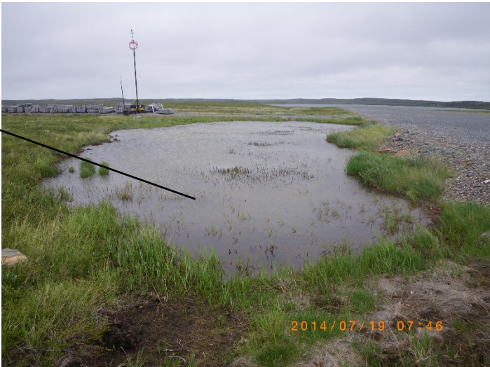
Impounded water along the edge of the airstrip and the Core Storage Road – looking south