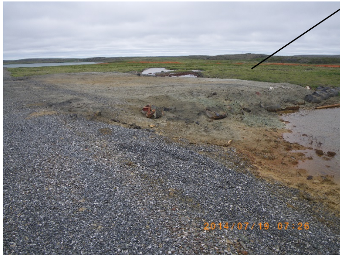
Drill Cuttings Settling Pond – looking southwest from the Airstrip