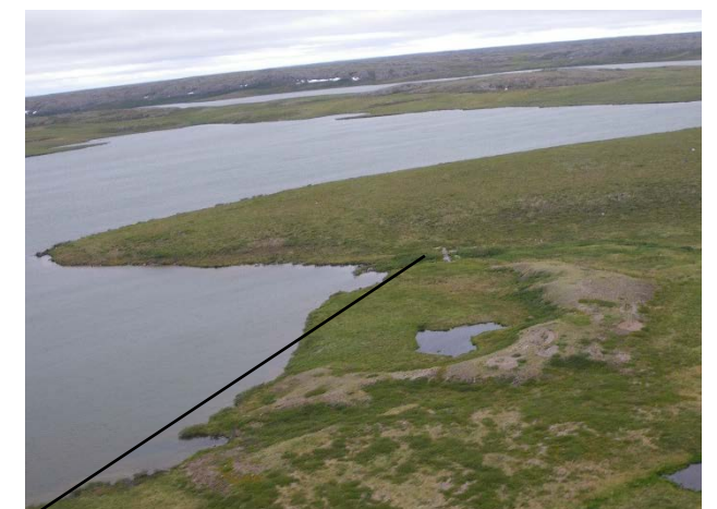
Only minor vegetation damage remains where the V-notch Weir was installed