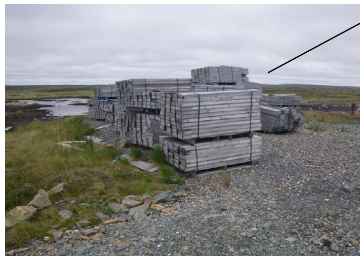
Core boxes in the staging area at the end of the Drill Road.