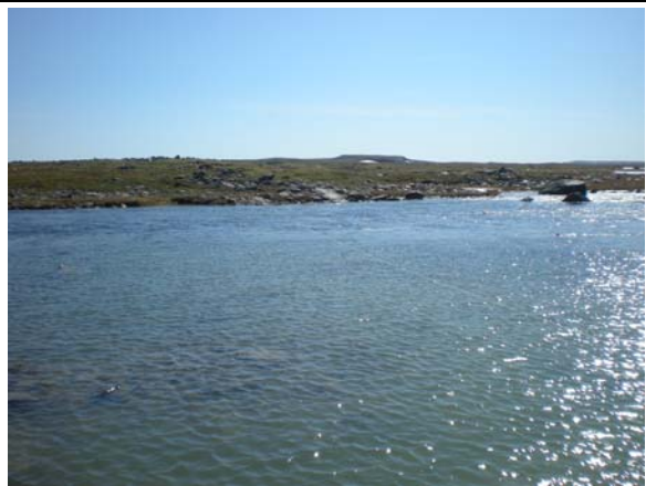
10 July 2008. Downstream view of watercourse crossing looking at left downstream bank.