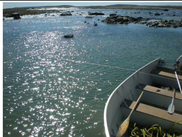
10 July 2008. Downstream view of watercourse crossing.